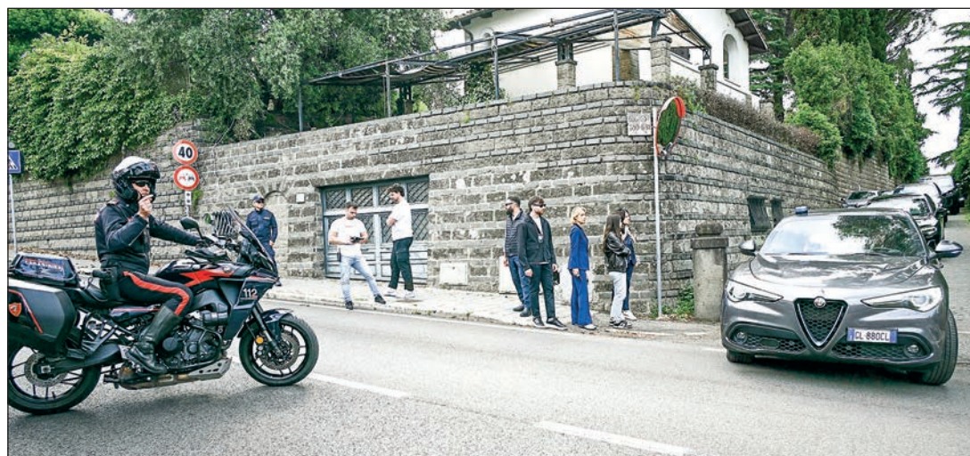
Vehicles of delegations leave the Omani embassy after a fifth round of nuclear talks between Iran and the United States in Rome on 23 May 2025.

He also warned of a “harsh” response if France, Germany, and Britain, collectively known as the E3, trigger the snapback