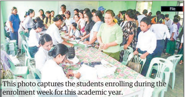
This photo captures the students enrolling during the enrolment week for this academic year.

THE Ministry of Labour's Social Security Board (SSB) announced that full-time stipends will be supported for the children of workers who are insured with SSB. It was stated that applications for family support benefits for the stipends of insured workers' children must be submitted to the Social Security Board within three months of the notification's issuance, as late submissions will not be processed. The maximum wage income for social security-covered staff has been set at K300,000 to ensure their children have equal access to benefits. "We will provide K30,000 for each insured worker's child in primary school, K45,000 for each in secondary school, K60,000 for each in high school, and K75,000 for each in university," said an official from the SSB. The benefit is available only to insured workers who have registered, obtained a Social Security Number (SSN), are currently employed, and have been registered for 48 months with at least 36 months of contributions. Employers must submit the necessary documents for eligible insured workers to the relevant social security offices. The Social Security Board will then verify the list of eligible workers and the approved amount before permitting the withdrawal of education subsidy funds. — ASH/TH