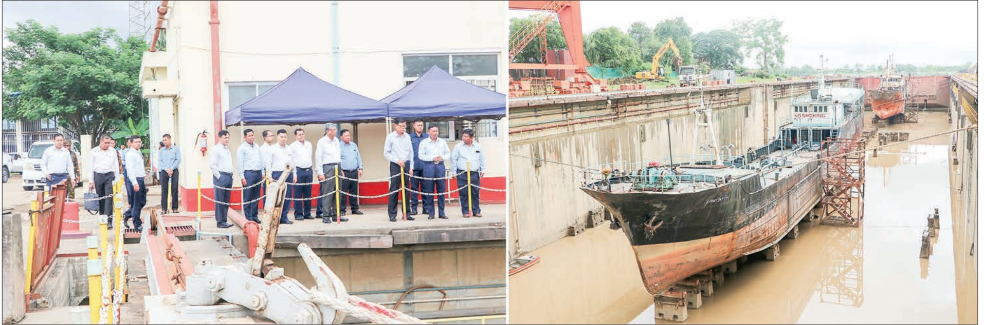
State Administration Council Member Deputy Prime Minister MoTC Union Minister General Mya Tun Oo inspects the Myanmar Shipyard in Yangon yesterday.

STATE Administration Council Member Deputy Prime Minister and Union Minister for Transport and Communications General Mya Tun Oo inspected the telecommunication infrastructure, communication services and work processes of Myanmar Shipyards in Yangon and Bago regions.