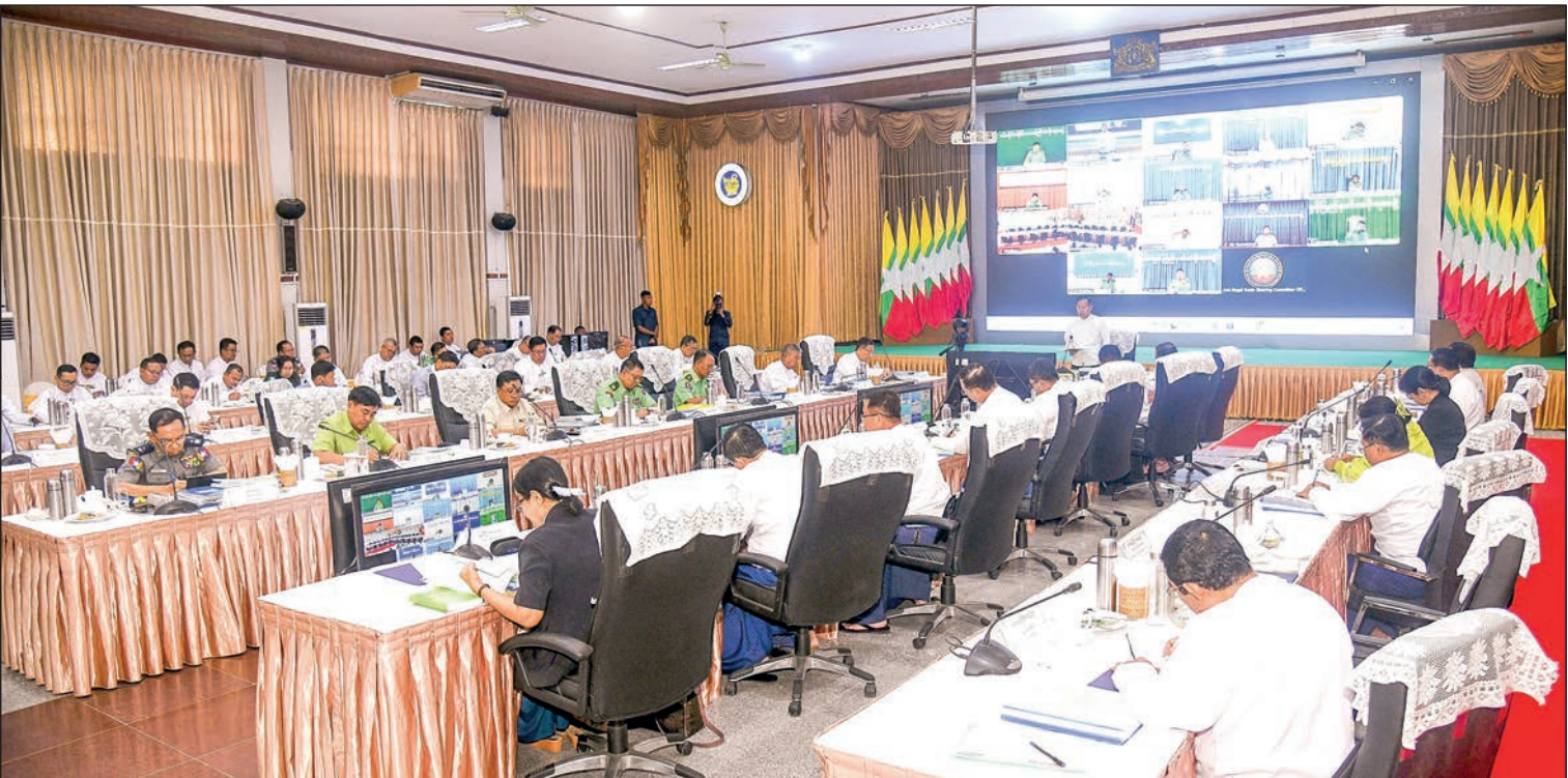
SAC Vice-Chair Deputy PM Vice-Senior General Soe Win chairs the 2/2025 meeting of the Illegal Trade Eradication Steering Committee yesterday.

VICE-SENIOR General Soe Win noted that if the security and inspection teams conduct thorough and systematic inspections, the efforts to combat illegal trade will be more effective and successful. The Illegal Trade Eradication Steering Committee held the 2/2025 meeting at the Ministry of Commerce in Nay Pyi Taw yesterday afternoon, with an address by Chairman of the Steering Committee Vice-Chairman of the State Administration Council Deputy Prime Minister Vice-Senior General Soe Win. In his address, the Vice-Senior General pointed out that ministries and government bodies must cooperate with one another by sharing information and taking joint action in combatting illegal trade with neighbouring trading partner countries. He continued that, in eco-