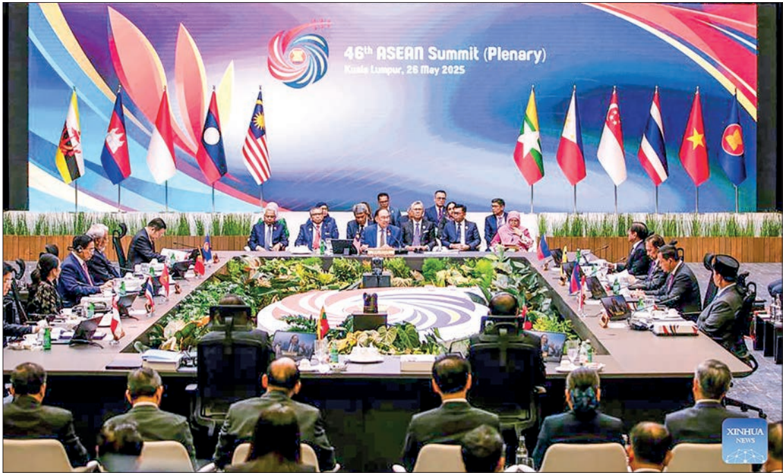
This photo taken on 26 May 2025 shows the opening ceremony of the plenary session of the 46 th Association of Southeast Asian Nations (ASEAN) Summit in Kuala Lumpur, Malaysia.

"The future we seek must rest on foundations of sustainability and inclusion. ASEAN's integration must be genuinely people-centred. That means closing development gaps, raising standards of living and in-