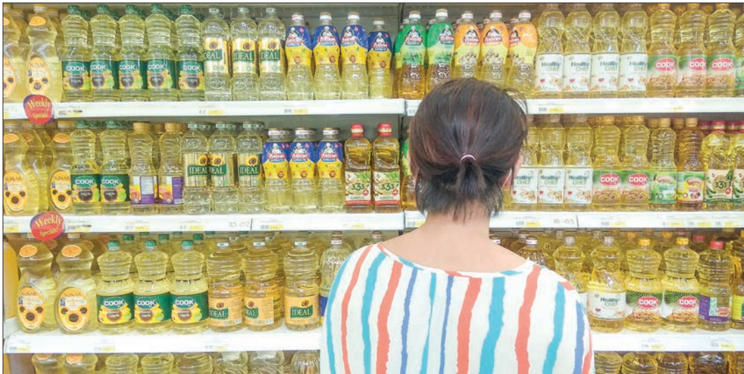
A thoughtful moment in the aisle – carefully selecting the perfect cooking oil among premium brands.

THE wholesale reference rate of palm oil set for the Yangon market was set lower at K6,390 per viss for the week ending 1 June, which decreased from K6,525 per viss in the previous week ending 25 May, according to the Supervisory Committee on Edible Oil Import and Distribution.