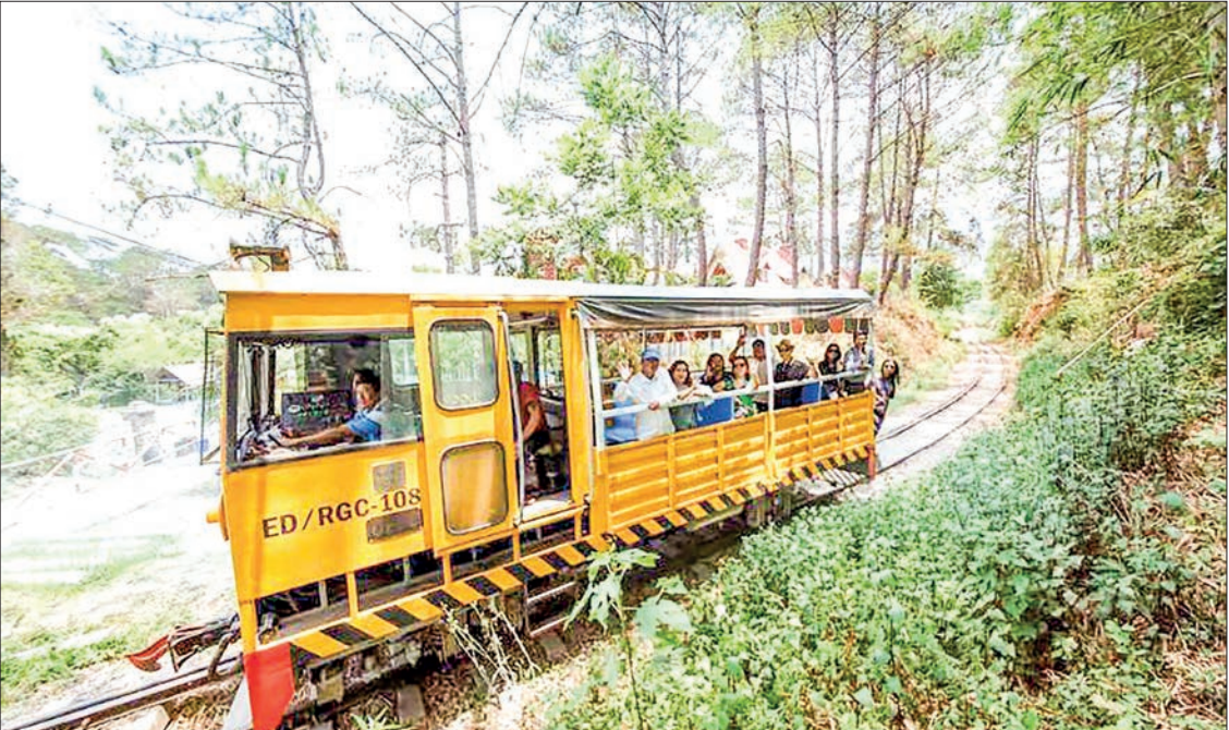
The Kalaw-Aungban railway carriage carrying some passengers.

Station. Locals from Taunggyi, Aungban, Kalaw and other regions enjoy this railway car, costing K8,000 per ticket. The train stops for 15 minutes for the visitors to take photos near tourist spots (Byaik Hill, Myindaik). Furthermore, Kalaw-Aungban steam-powered locomotives and carriages have arrived at Aungban station to provide Kalaw-Aungban steam train route services. — ASH/KK