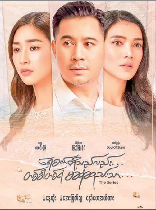
This photo showcases three main characters from the series ‘Yeset Toh Thele Takhatayan Masonseetha’.