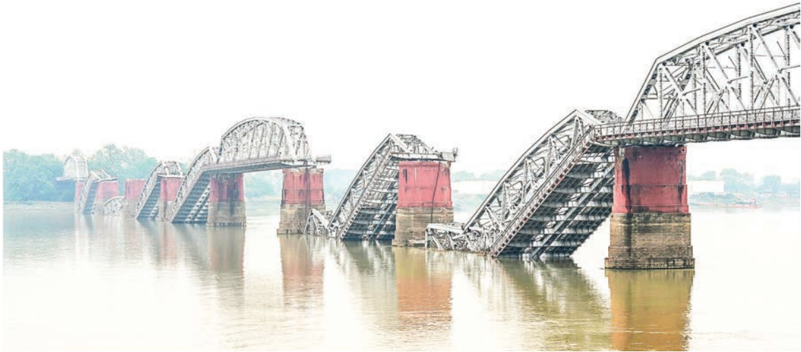
A file photo shows the damaged Sagaing Bridge (Inwa) following the Mandalay Earthquake, as reported in the Kyemon Daily (The Mirror) on 7 April 2025.

THE day on 28 March 2025 was an unforgettable day for all citizens of Myanmar. Ten minutes to 1 pm on that day, a devastating earthquake jolted Mandalay Region, Sagaing Region, Shan State, Nay Pyi Taw Council Area and Bago Region, resulting in several casualties.