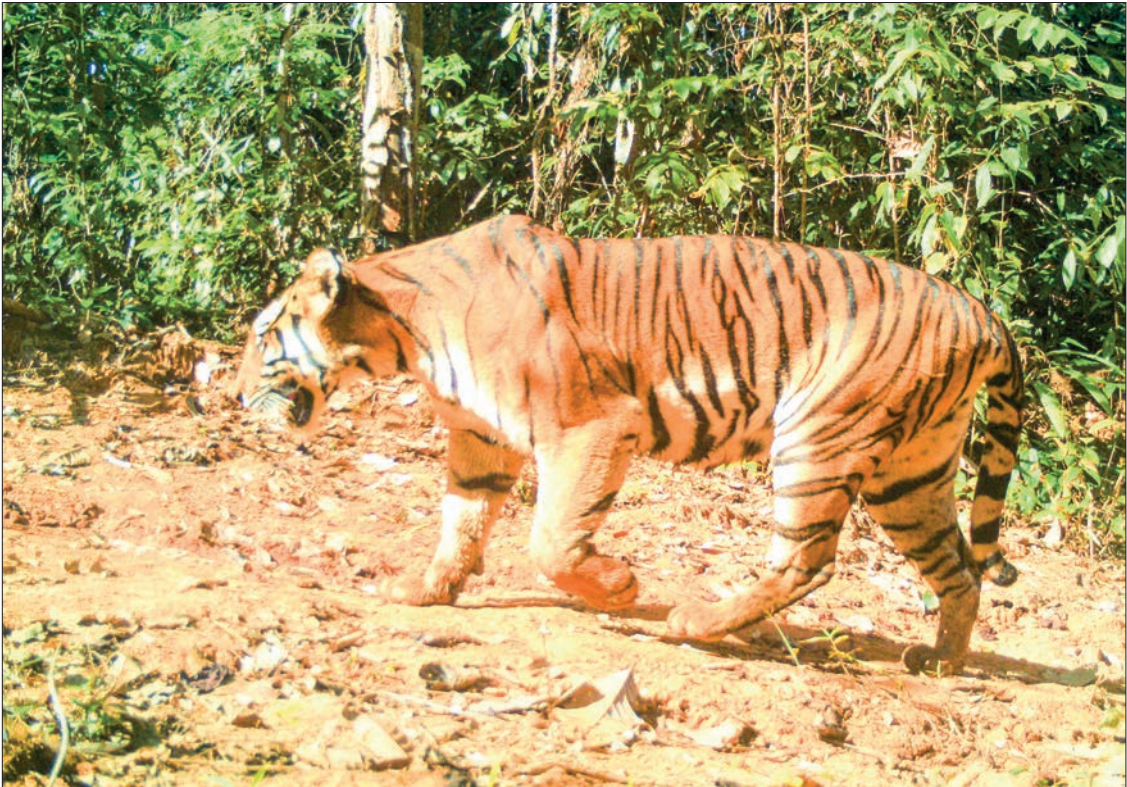
A hidden camera captures a rare glimpse of one of the world’s most endangered tiger species in the wild.

NINE species of tigers live in 13 countries around the world, including the critically endangered Bengal tiger in Htamanthi Wildlife Sanctuary in northern Myanmar and the Indonesian tiger in Taninthayi Reserved Forest in southern Myanmar. “It is a source of pride for the country that two tiger species, which are endangered worldwide, are alive and well in the southern and northern parts of Myanmar. These rare species are invaluable wildlife for the country. While other countries have bred these species in captivity, the fact that they are naturally found in Myanmar’s protected forests and mountains demonstrates the richness of our biodiversity and ecosystems. Therefore, we must continue to work together to conserve and educate about these tiger species to prevent their extinction. We estimate that there are about 22 Bengal tigers roaming in the Htamanthi Wildlife Sanctuary,” said sanctuary warden U Win Hlaing. Taninthayi Reserved For-