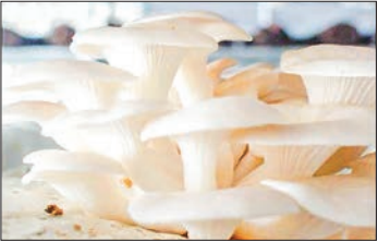
This image depicts oyster mushrooms.

states,” he said. Further, growers and sellers have now expanded their farms.