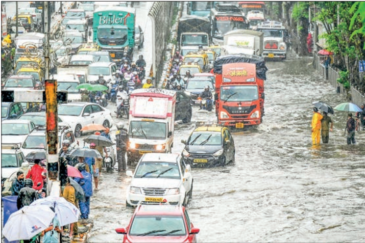
Commuters lie stuck in traffic as they wade through a flooded street after heavy rain showers in Mumbai on 26 May 2025. Lashing rains swamped India's financial capital Mumbai on 26 May as the annual monsoon arrived some two weeks earlier than usual, according to weather forecasters.

ment that the rains had advanced to Mumbai on Monday, "16 days earlier than usual", with rains usually expected around 11 June, the earliest for nearly a quarter century.