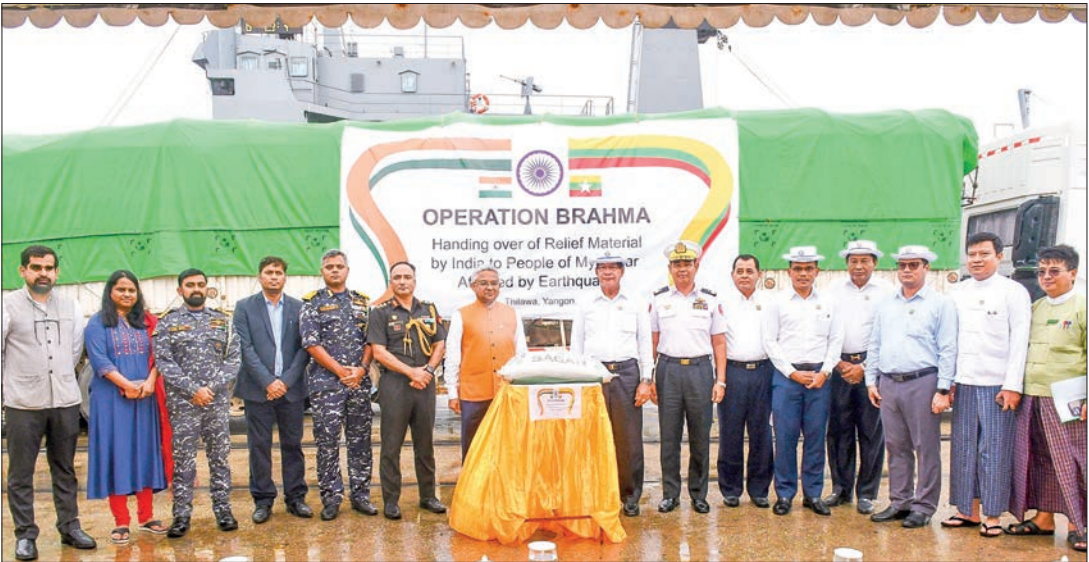
The handover ceremony of the India-donated cement in progress at Thilawa Port on 23 May.

THE UMS Myitkyina vessel of the Tatmadaw (Navy) arrived at the Thilawa (MITT) Port at 10 am on 23 May, carrying 225 tonnes of cement (4,500 50-kilogramme bags) donated by the Government of India to assist with the reconstruction efforts following the recent earthquake in Myanmar.