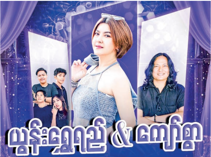
A glimpse of the promotional poster for the upcoming live music performance by actress Yoon Shwe Yee and singer Kyaw Swa.

formances by the artists, accompanied by live music from the Vowel Band. — ASH/MKKS