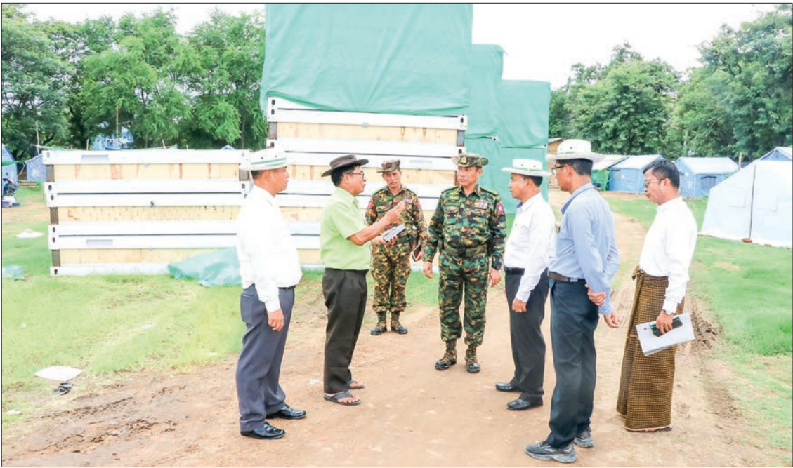
Sagaing Region Chief Minister U Myat Kyaw, Lt-Gen Thet Pon from the office of Commander-in-Chief (Army), and officials oversee the AHA-donated prefabricated schools.

The donation included five prefabricated schools — two 120 feet by 30 feet container classrooms, one 90 feet by 30