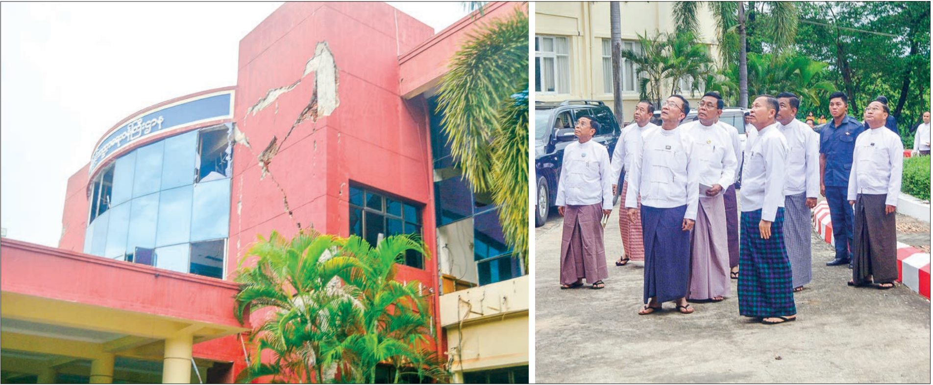
State Administration Council Vice-Chairman Deputy Prime Minister Vice-Senior General Soe Win reviews the repairing tasks at ministries in Nay Pyi Taw yesterday.

C HAIRMAN of the National Disaster Management Committee Vice-Chairman of the State Administration Council Deputy Prime Minister Vice-Senior General Soe Win, accompanied by Union ministers, the Chairman of Nay Pyi Taw Council and the commander of Nay Pyi Taw Command, yesterday afternoon inspected the repair and renovation of ministerial buildings, staff housing and dormitories. At the meeting hall of the Ministry of Energy, the Vice-Senior General heard reports by officials on damage to office buildings in the earthquake, the functionality of office work at the