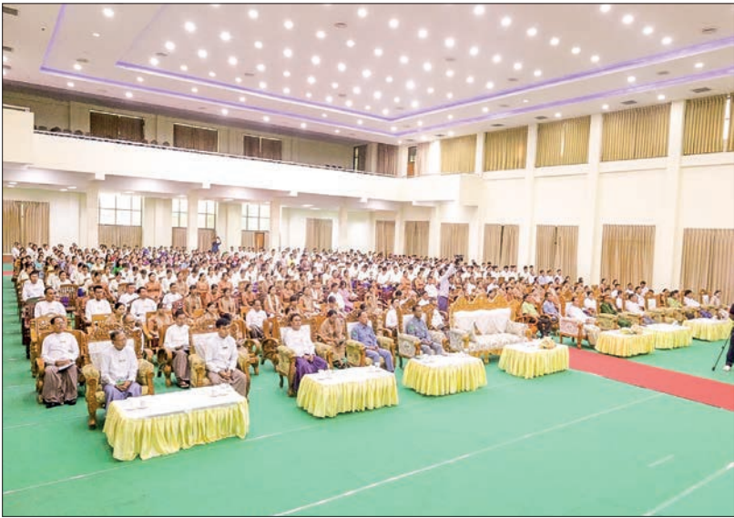
The graduation of the AGTI Diploma Course 18 and employment letter presentation ceremony of the Nationalities Youth Resource Development Degree College (Sagaing) in progress yesterday, addressed by Union Minister Lt-Gen Yar Pyae.

THE graduation of the AGTI Diploma Course 18 and job appointment letter handover ceremony of the Nationalities Youth Resource Development Degree College (Sagaing) in Ohntaw village of Sagaing, Sagaing Region, took place yesterday at the convocation hall of the Degree College. Speaking at the event, State Administration Council Member Union Minister for Border Affairs Lt-Gen Yar Pyae said the degree college in Sagaing has produced 2,538 degree holders to date: 560 arts degrees, 981 science degrees, 139 BTech and 858 AGTI diplomas. Moreover, there are also 111 MA, 216