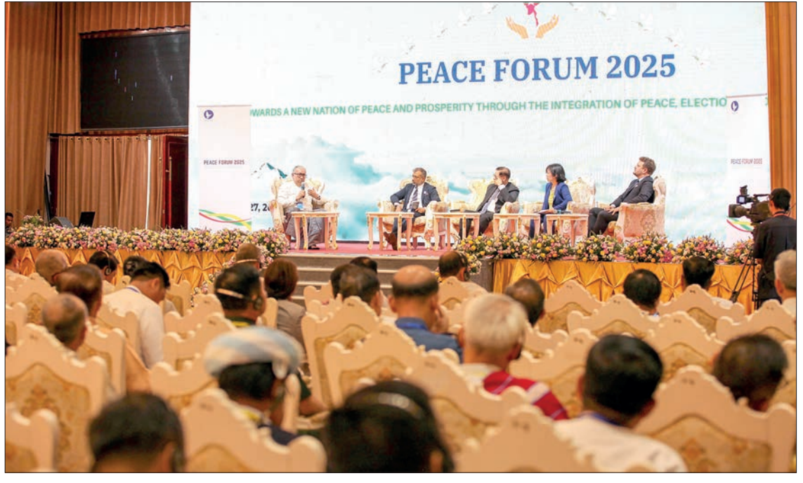
The Peace Forum 2025 underway in Nay Pyi Taw yesterday.