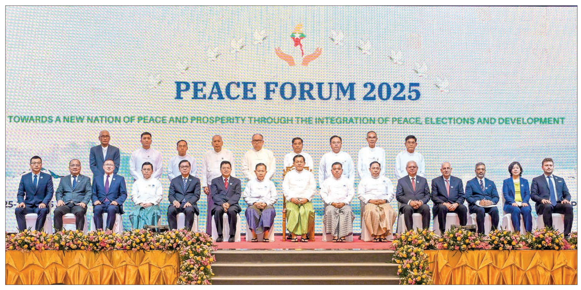
State Administration Council Chairman Prime Minister Senior General Min Aung Hlaing poses for the documentary group photo alongside SAC Vice-Chair Deputy PM Vice-Senior General Soe Win, internal and international dignitaries at yesterday's Peace Forum 2025 in Nay Pyi Taw.

Ethnic rights and political demands requiring constitutional amendments will be addressed through the framework of the existing Constitution.