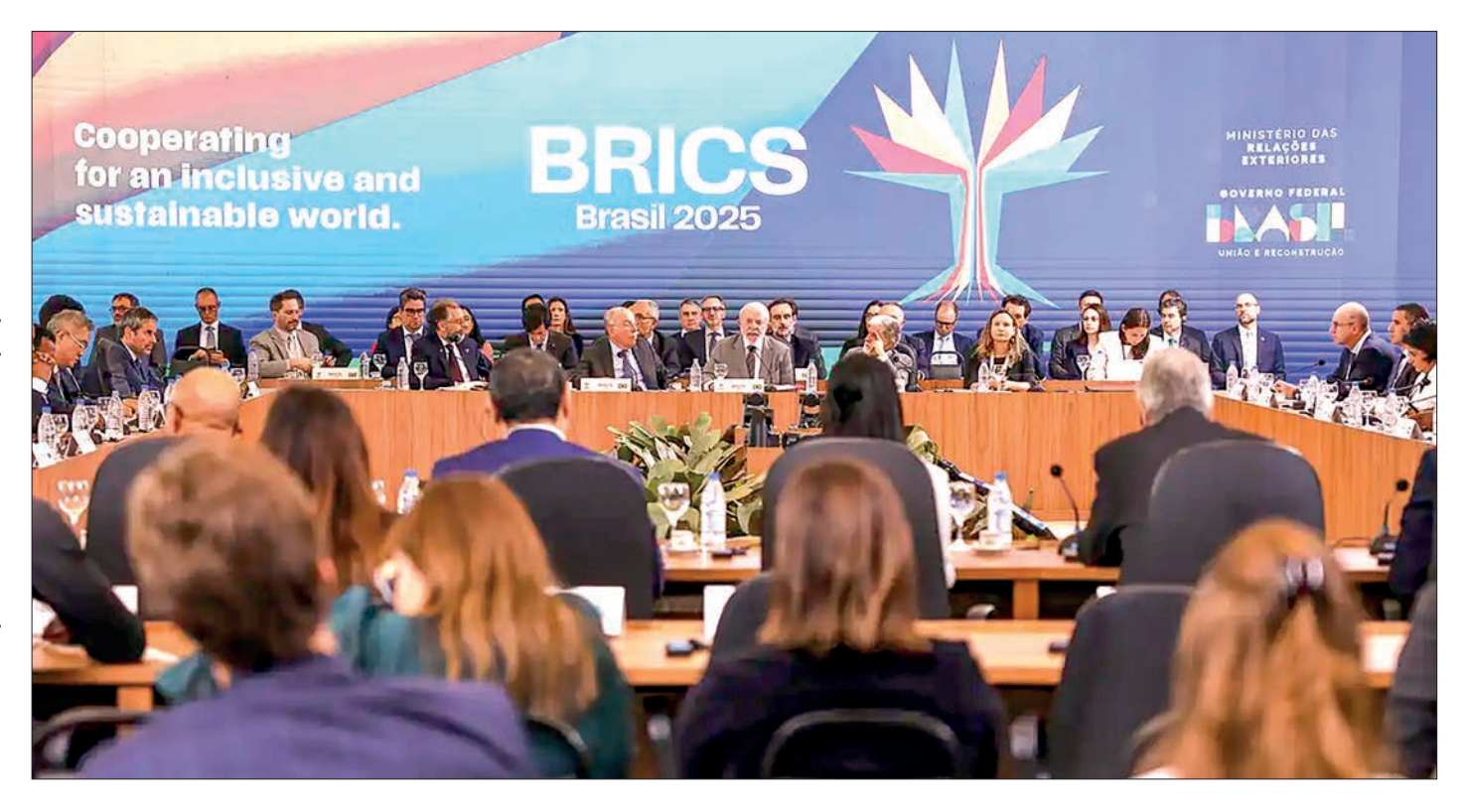
The statement reflects the BRICS nations' focus on fostering stability in the Middle East through disarmament and adherence to international law.

The call for a weapons-free zone aligns with relevant international resolutions aimed at enhancing regional security.