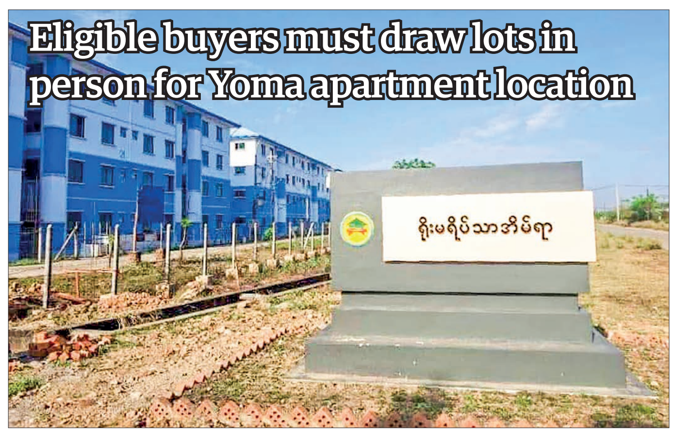
This picture captures apartment units of Yoma low-cost housing to be sold.

CBM aims to curb the instability in the foreign exchange market and currency devaluation. According to CBM's notification on 15 March, it has been collaborating with law enforcement agencies to combat and prosecute those who attempt to manipulate the currency market under the existing laws. CBM allowed authorized dealers (private banks) to operate online foreign exchange trading freely as per the market rate, depending on supply and demand, starting from 5 December 2023. -NN/KK