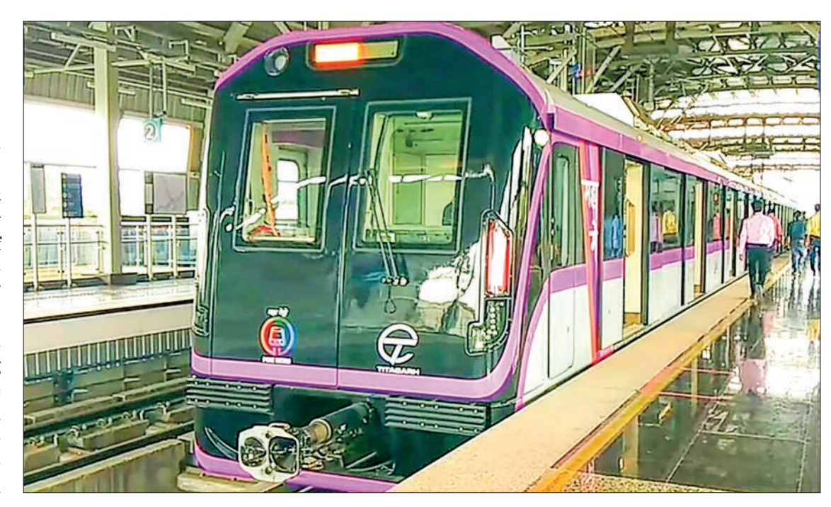
The project is scheduled for completion within four years.

This strategic proposal is a logical extension of the existing Corridor-2 and aligns with the Comprehensive Mobility Plan (CMP), which envisions a continuous Chandani Chowk to Wagholi Metro corridor to strengthen East-West mass transit in Pune.