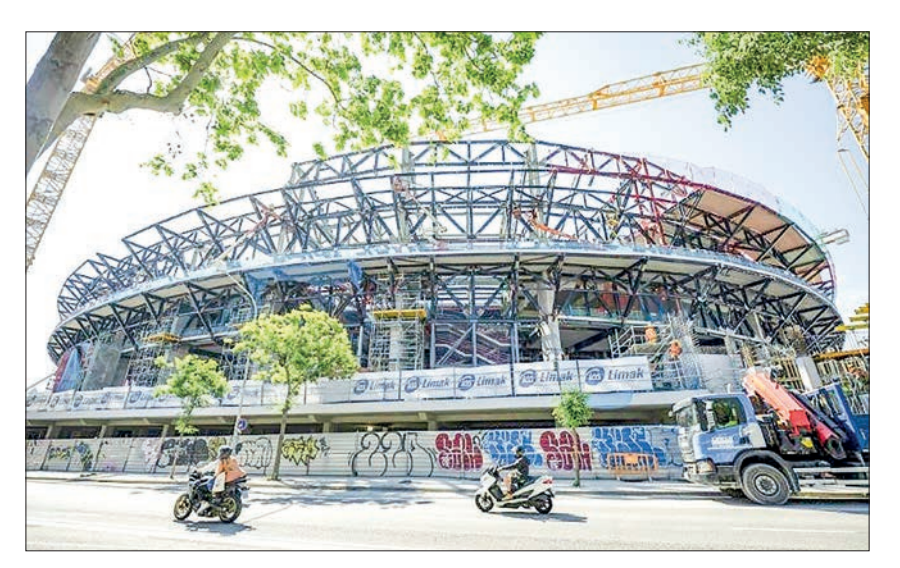
A general view shows the construction site of the Camp Nou Stadium in Barcelona on 23 May 2025.

While cooling breaks midway through each half have become standard during the tournament, Dortmund, like other teams, are taking extra steps to mitigate the brutal heat and humidity. — AFP