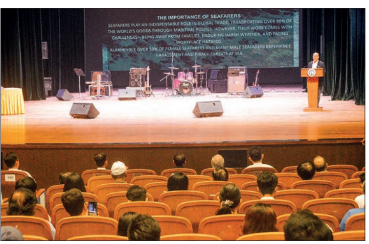
International Seafarers' Day ceremony in progress at the National Museum in Dagon Township, Yangon, on 25 June 2025.

NEARLY 40,000 seafarers from Myanmar leave the country each year to serve on international vessels, and around 20,000 are officially certified to work abroad, according to Captain Soe Min Aung, Pres-