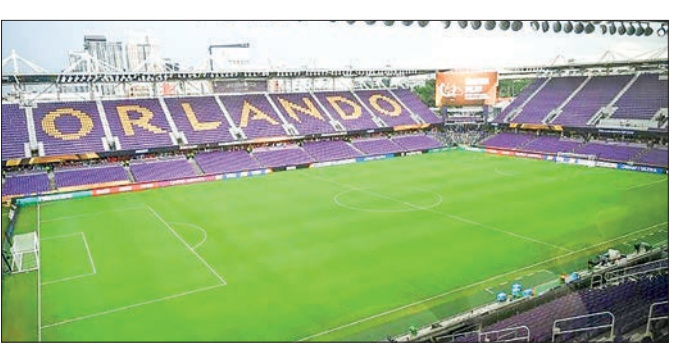
Benfica and Auckland City's Club World Cup game is one of five matches at the tournament halted due to bad weather.

FURNACE-LIKE heat and the threat of thunder and lightning are wreaking havoc at the Club World Cup — and more of the same is likely at the 2026 World Cup.