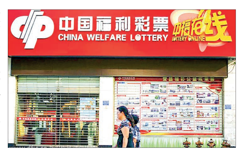
A sales office of China Welfare Lottery in Yichang city, Central China's Hubei province.

Sales of lottery tickets that support the country's welfare system reached about 18.53 billion yuan last month, marking an increase of 8.6 per cent from a year earlier.