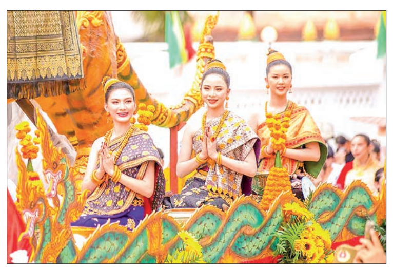
Luang Prabang province, some 220 kilometres north of the capital Vientiane, is a top tourist draw because of its old temples, scenic attractions and rural landscapes. Miss Songkran parade is held during the Songkran Festival in Luang Prabang, Laos, 16 April 2025.

from Tuesday to Friday, aims to promote Lao tourism to target visitors from the GMS countries, which are key markets for Laos.