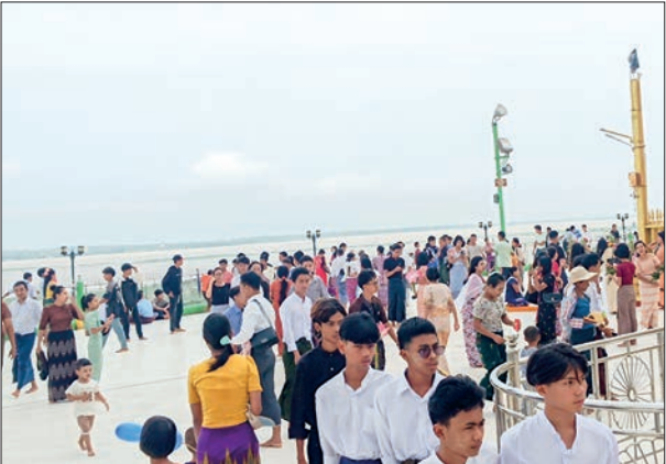
Pilgrims visit Myathalun Pagoda in Magway.