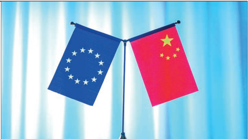
Flags of China and the European Union are seen in this photo.

A Chinese spokesperson urged the EU to adopt a more objective view of China and pursue positive policies, emphasizing the importance of their 50-year diplomatic relationship.