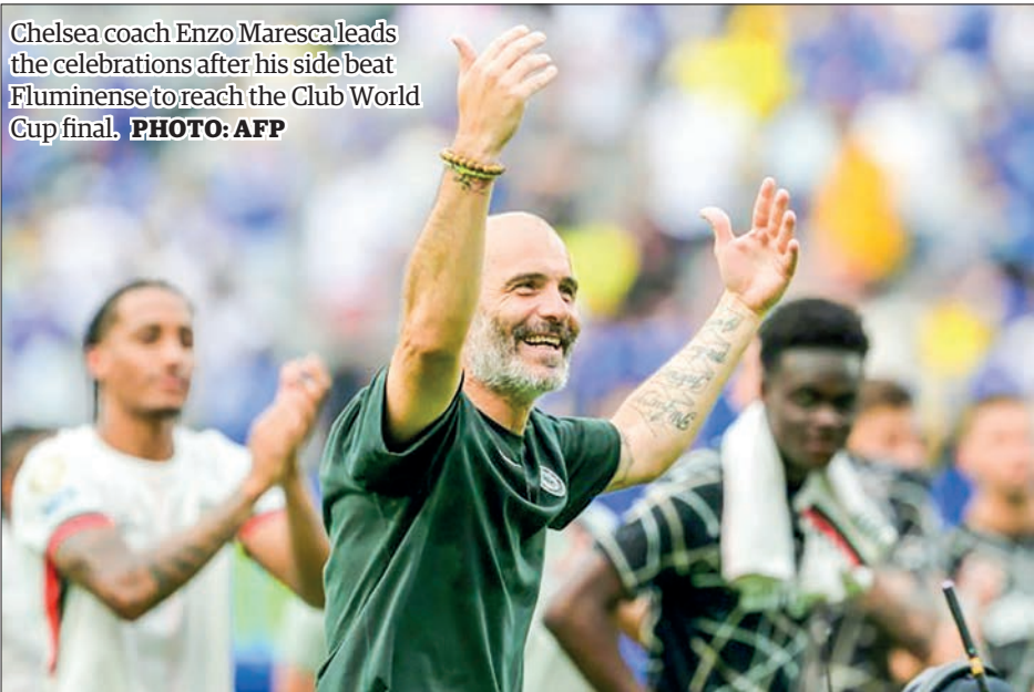
Chelsea coach Enzo Maresca leads the celebrations after his side beat Fluminense to reach the Club World Cup final.

team events, Myanmar youth players are scheduled to take part in the individual contests from 10 to 12 July. These events include men’s singles, women’s singles, men’s doubles, women’s doubles, and mixed doubles. — Arkar Linn/KZL