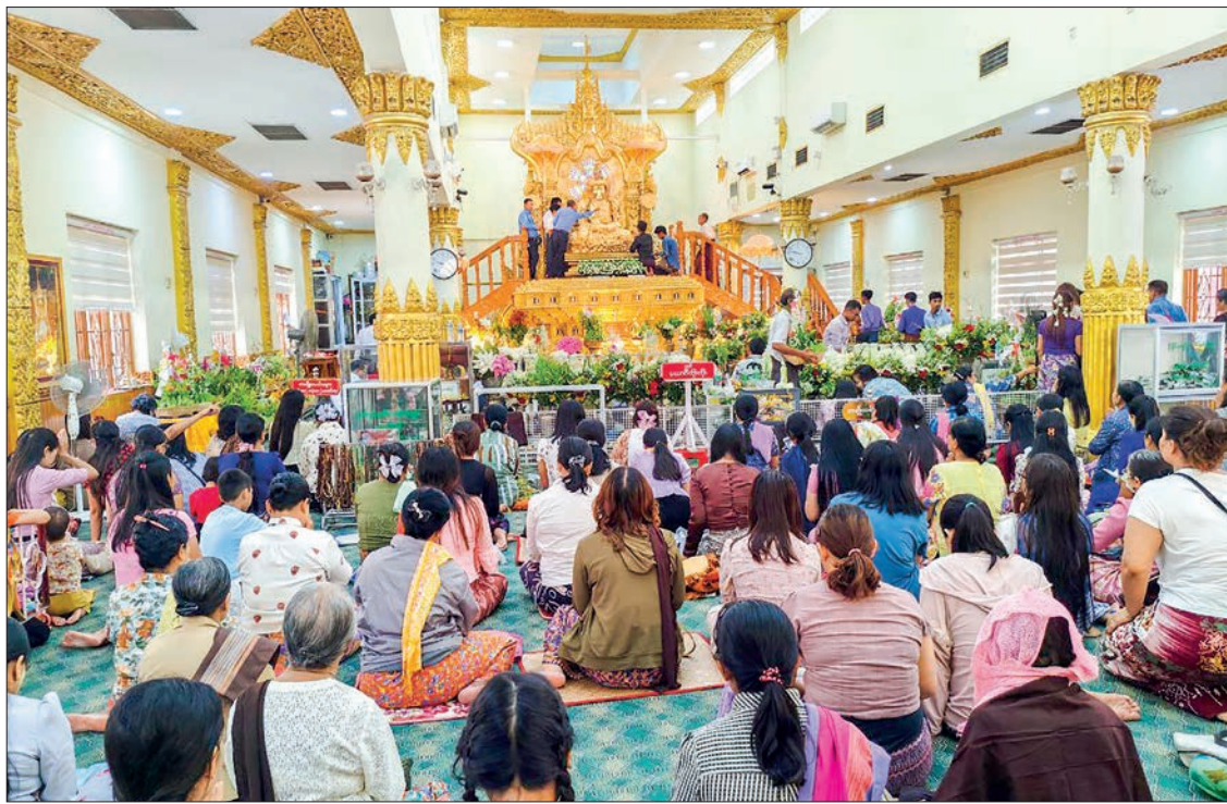
This picture depicts the Buddha image being thronged with pilgrims in Mandalay on the Full Moon of Waso.

Moreover, in towns, villages, and neighbourhood religious halls, people were captivated by the sounds of religious chants and engaged in offering