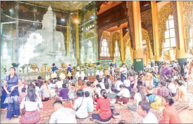
Kyauktawgyi Buddha Image.