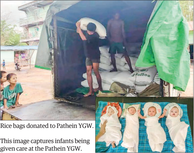
Rice bags donated to Pathein YGW. This image captures infants being given care at the Pathein YGW.

also provides learning, and takes charge of their living. Losing a warm arm is the deepest sorrow in the world. So, I would like to urge you to share our warm arms with these children,” he said on his Facebook page. Of children, 32 infants need to be fed about two cans of formula milk a day, and nearly a rice bag needs to be cooked for other children a day. He said he wishes to do such a donation once in three months and invited the public to give as much as they can. — MT/ZS