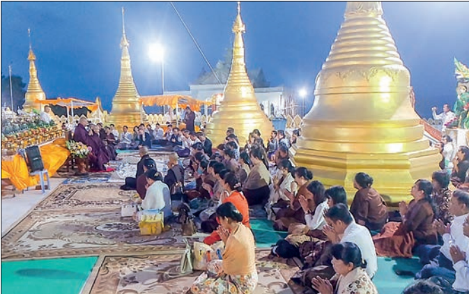
Myat Mawtinsun Pagoda in Ngaputaw, Ayeyawady Region.