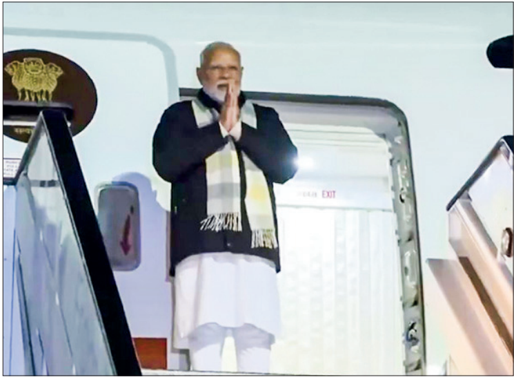
Indian Prime Minister Narendra Modi arrived in Windhoek, Namibia, marking his first visit and only the third by an Indian Prime Minister.

During his visit, PM Modi will hold bilateral talks with President Netumbo Nandi-Ndaitwah and pay homage to Namibia's founding father, Dr Sam Nujoma.