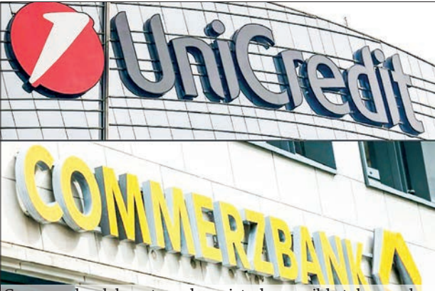
Commerzbank has strongly resisted a possible takeover by UniCredit since the Italian bank announced in September it had quietly built up a stake in the German group.

The Italian group said it intended to convert a further tranche equiv-