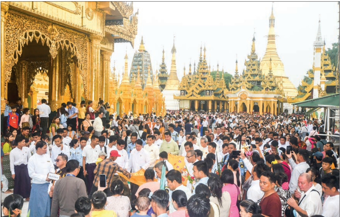
Devotees and well-wishers throng on the platform of Shwedagon on the Waso Full Moon Day.

officials, members of religious organizations and the devotees offered golden lotus robes to the Buddha statues of the pagoda before observing the Five Precepts and donating Waso robes and offerings to Sayadaws. Similarly, the Waso robe offering and religious ceremonies were also organized at Thiri Mingala Kaba Aye Pagoda, Botahtaung Pagoda, Lawka Chantha Abaya Labamuni Buddha Image, Sacred Tooth Relic Pagoda (Yangon), the ancient historic Aparajita Hair Relic Kyaikwyne Pagoda, Maelamu Pagoda, Ngahtetgyi, Chaukhtet-