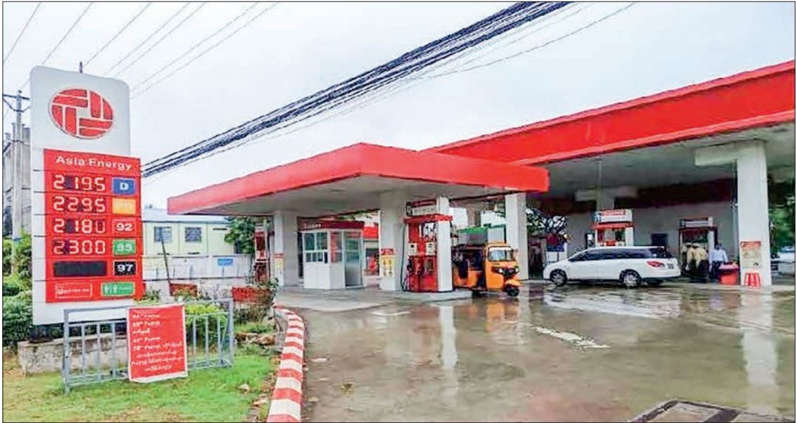
Vehicles are seen refuelling at the petrol station in Mandalay.

CBM sold $678,000, 1.24 million yuan and 2.94 million baht on 3 July. CBM sold $3.346 million to