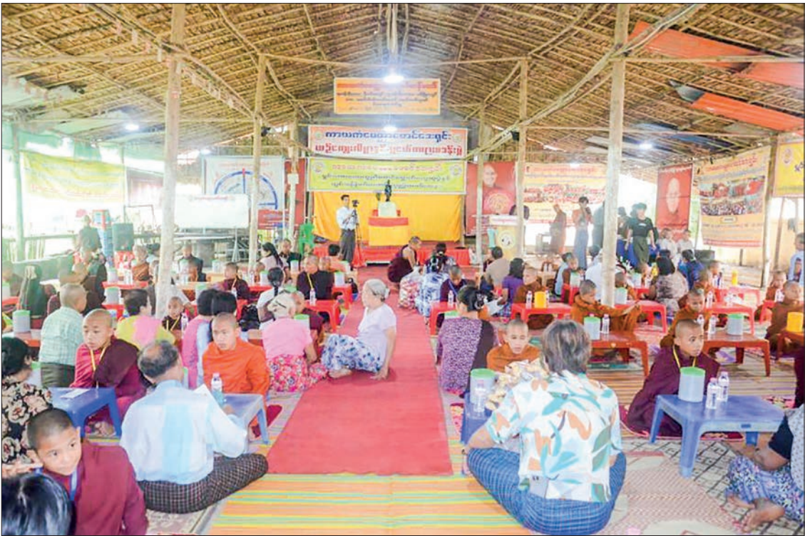
This photo showcases the ceremony of offering dried alms to monks at the Kayakam Metta Foundation Monastery in Dagon Myothit (South).

A ceremony for donating dried alms to monks was held at the Kayakam Metta Foundation Monastery in Dagon Myothit (South) Township, Yangon Region, on 8 July. The ceremony was held with the aim of supporting the monks — who are instrumental in the flourishing of the religion — in spreading the faith, ensuring its longevity, and carrying out religious activities with peace of mind. “The Kayakam Metta Foundation aims to ensure that monks, who are instrumental in the flourishing of the religion, can live peacefully within the religious community without difficulties. This ceremony also serves to find foster fathers and mothers to support the monks in their religious activities. It is a bi-