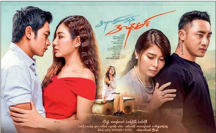
The main characters of the movie ‘Cruellest Kiss’ are seen on the poster.