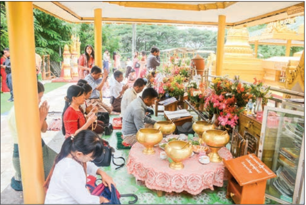
Devotees at Shwenanthwin Pagoda.