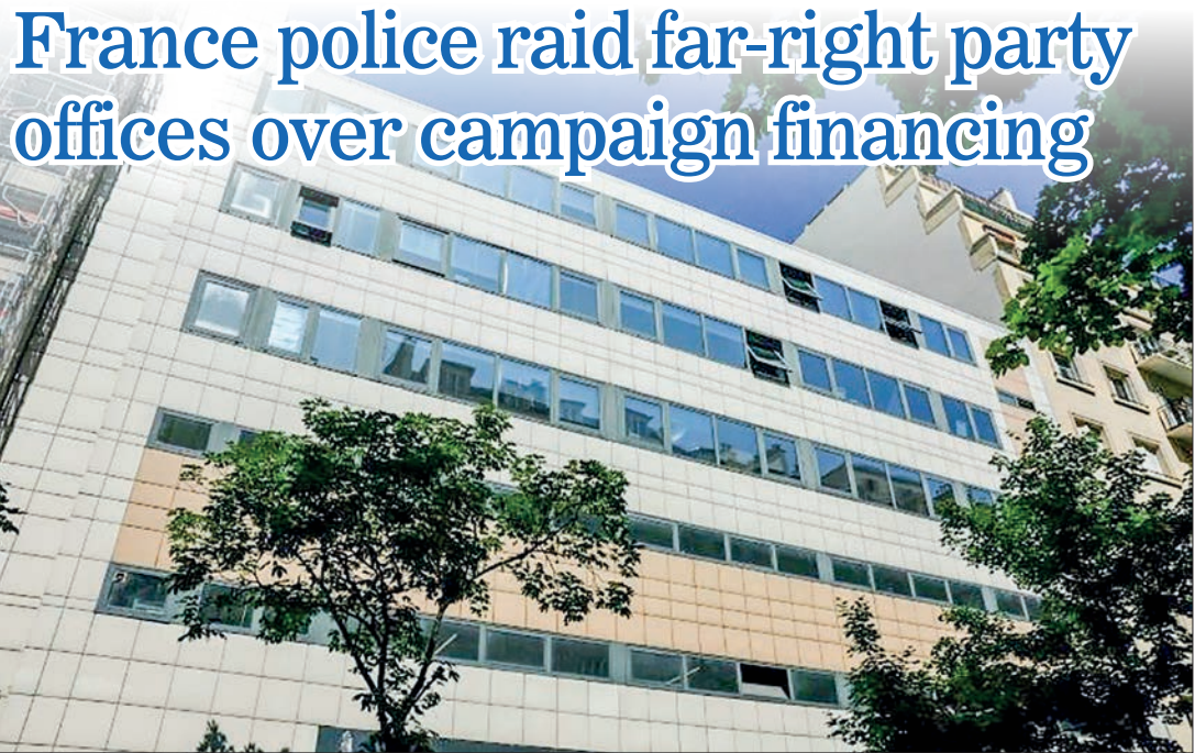
The party said police seized 'all emails, documents and accounting' records of the party.

tinue to deepen their friendly relations, saying, "The foundation of the deep friendship and cooperation between my country and Mongolia is based on the ties between people." — Kyodo