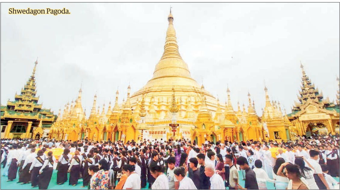
To honour the occasion, Buddhist communities across the country offered Waso robes and seasonal flowers, observed the Uposatha precepts, recited protective suttas and teach-

ON the auspicious Waso Full Moon Day (Dhammacakka Day), Buddhist devotees across various states and regions peacefully visited pagodas, stupas and monasteries to perform meritorious deeds. The day marks several sacred milestones in Buddhism: the Buddha’s first sermon – the Dhammacakkappavattana Sutta, the emergence of the Dhamma Jewel and Sangha Jewel, the beginning of monastic ordination through the words “Ehi Bhikkhu”, and the transition of individuals from the mundane path to the noble path. As such, the Waso Full Moon Day is revered for its profound spiritual significance.