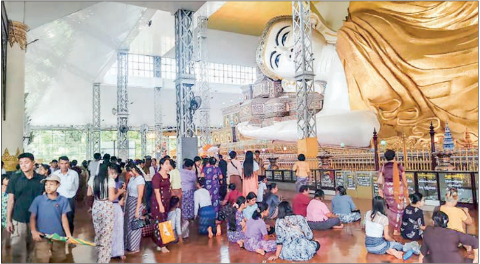
Shwethalaung Reclining Buddha Image in Bago.