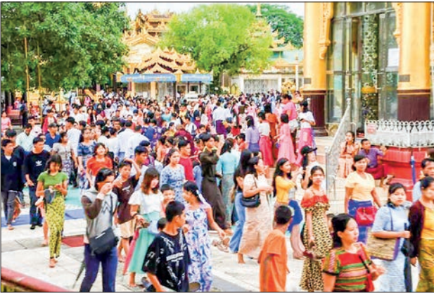
Pilgrims at Shwemawdaw Pagoda in Bago.