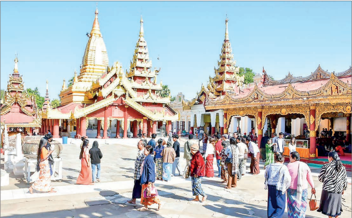
This photo depicts devotees embarking on pilgrimage to pagodas in the Bagan-NyaungU Ancient Cultural Heritage Zone on the Full Moon of Waso.

Furthermore, CBM launched Myanmar Pay (MMQR) in February 2025, connecting various banks and mobile financial service providers through a single QR code, enabling seamless and secure payments across different platforms. — NN/KK