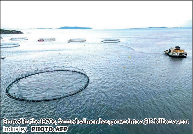
Started in the 1970s, farmed salmon has grown into a $12-billion a year industry.

anglers. Fish farming, a $12 billion industry, has contributed to the decline through issues like sea lice, which harm wild salmon, and genetic mixing from escaped farmed fish. Calls for reform in the fish farming industry are growing, with demands for sealed enclosures to prevent environmental impact. While the industry acknowledges the need for change, it cites challenges in transitioning to safer practices. The Norwegian parliament plans to introduce new regulations within two to four years, but concerns remain that without significant action, wild salmon fishing may soon become a thing of the past in Norway. — AFP