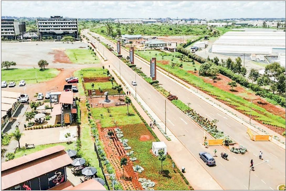
The CCI call centre is located in a brand-new town, Tatu City, on the outskirts of Nairobi.

IN Nairobi, Cloudfactory, a Kenyan firm, is leveraging artificial intelligence to transform the outsourcing market, helping clients track shoplifters, monitor lung damage from COVID-19, and identify whales. Founded in 2014, Cloudfactory initially focused on simple tasks like transcription but has expanded its services significantly since 2024, employing 130 staff and 3,000 freelancers. The firm collaborates with various clients, including US robotics companies,