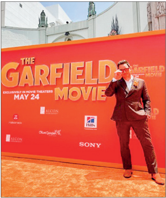
Chris Pratt will reprise his role as Garfield in the animated sequel to 2024’s successful The Garfield Movie. searching for the right people to take on those roles, according to The Hollywood Reporter.