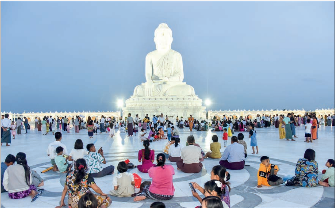
Throngs of devotees visit the Maravijaya Buddha Image on the Full Moon of Waso yesterday.

THE pagodas in Nay Pyi Taw were bustling with those who did good deeds on the full moon day of Waso (Dhammacakka Day). The Maravijaya Buddha Image was also packed with pilgrims, and the visitors observed around the compound of the Buddha Park peacefully. Similarly, other pagodas such as Latlotetaung and Shwenanthwin in Nay Pyi Taw, Dhatuzaya Dhatpaungsu pagoda in Zabuthiri Township, Yanaungmyin pagoda in Dekkhinathiri Township, Phaungdaw Chetma pagoda in Lawe Township, Thatta Thattar Maha Bodhi pagoda and “Phwa, Pwint, Haw, San” pagoda and other religious sites in Ottarathiri Township were also crowded with pilgrims who do-