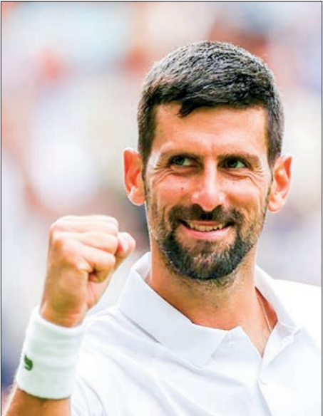
Serbia’s Novak Djokovic is eyeing more Wimbledon history.

NOVAK Djokovic can make Wimbledon history in his quarterfinal against Flavio Cobolli, while his title rival Jannik Sinner must banish fears over an elbow injury when he faces Ben Shelton on Wednesday. Djokovic, the seven-time champion, and world number one Sinner will book a blockbuster semifinal showdown if they win their last eight matches. But before that heavyweight showdown is secured, both Djokovic and Sinner have pressing issues to resolve. Djokovic will pass Roger Federer to take sole ownership of the all-time record for most Wimbledon men’s semifinal appearances if he advances to the last four for the 14 th time. The Serb is bidding to become the second man in the Open era to reach the Wimbledon semifinals aged 38 or older after Ken Rosewall, who made that stage aged 39 in 1974. The 24-time Grand Slam champion is also aiming to reach a record extending 52 nd major semifinal. That would take him within two wins of breaking his tie with Margaret Court for the most Grand Slam singles titles by a man or woman. Success at Wimbledon has been child’s play for Djokovic, who has reached the final in every one of his appearances since 2018. — AFP