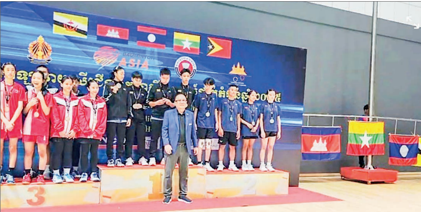
The Myanmar U17 team pictured after receiving their gold medals in the team competition.

MYANMAR youth badminton teams have claimed three gold medals in the team events of the Badminton Asia Regional Championships 2025 (Southeast Asia), held in Phnom Penh, Cambodia, from 7 to 12 July. The Myanmar contingent earned