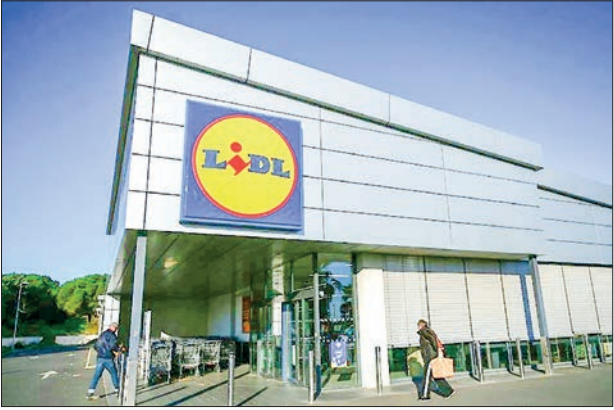
A French court found over 370 ads ran by Lidl were deceptive and amounted to unfair competition.

The appeals court judge found that in the more than 370 ads contested by Intermarche that Lidl had prominently featured the products and prices but had used small print or brief off-screen voice mentions to see its website for