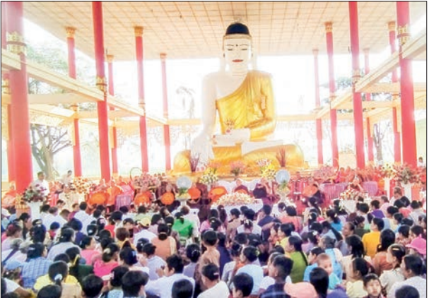
A Buddha image in Paungde, Nattalin Districe, Bago Region.