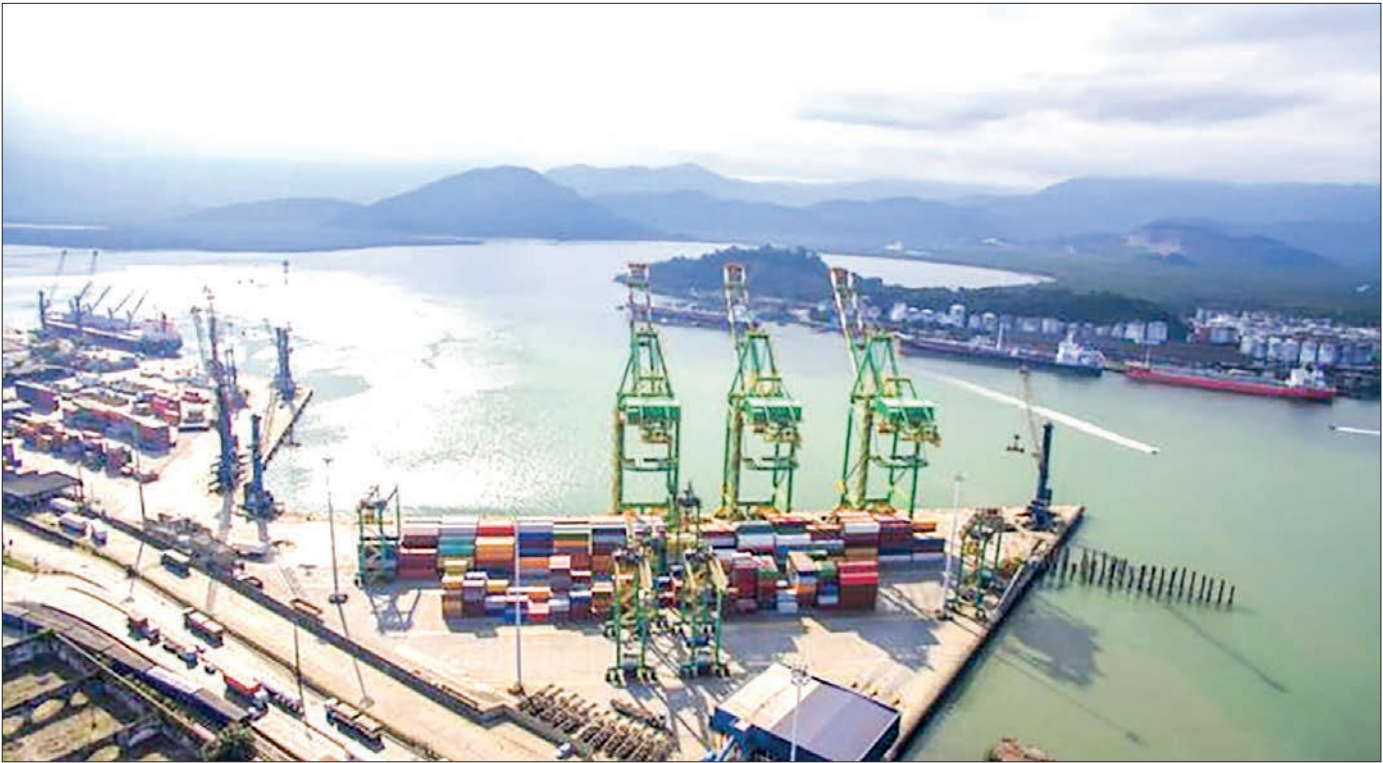
Zakharova stated that US unilateral tariffs violate free trade rules. The imposition of these tariffs poses risks to the global economy.

and trade relations,” Mao said. “Under the current volatile global situation, it is hoped that the EU will work with China in the same direction, strengthen mutually beneficial cooperation, properly handle differences and frictions, and promote the sustained, healthy and stable development of China-EU relations,” she added. — Xinhua