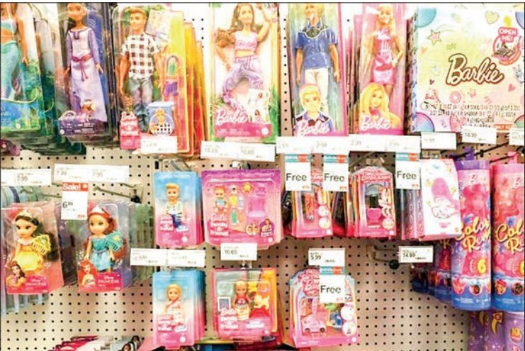
In recent years Mattel has diversified its range of dolls from the original blonde prototype.