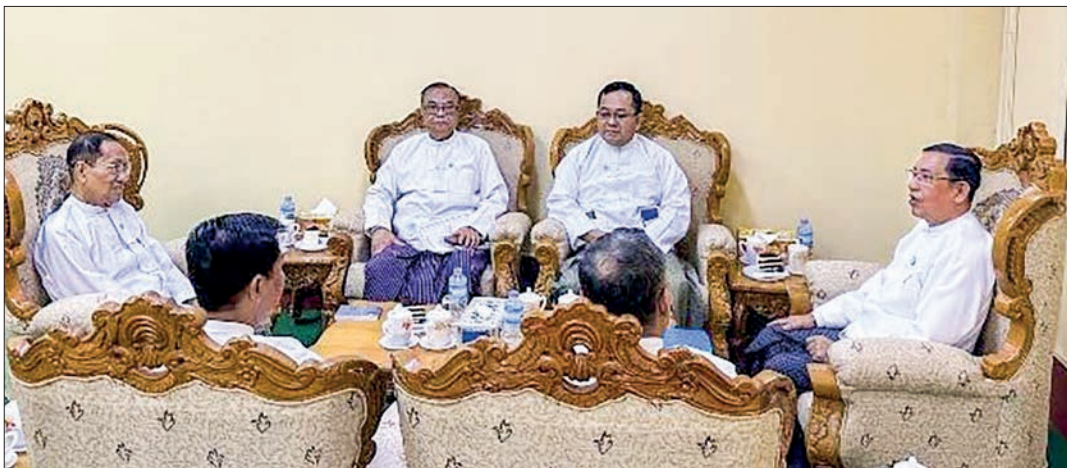
The coordination meeting between the Union Election Commission and the Myanmar National Human Rights Commission underway on 8 July 2025 at the UEC Office in Nay Pyi Taw.

THE Union Election Commission (UEC) and the Myanmar National Human Rights Commission (MNHRC) held a coordination meeting on 8 July 2025 at the UEC Office in Nay Pyi Taw.