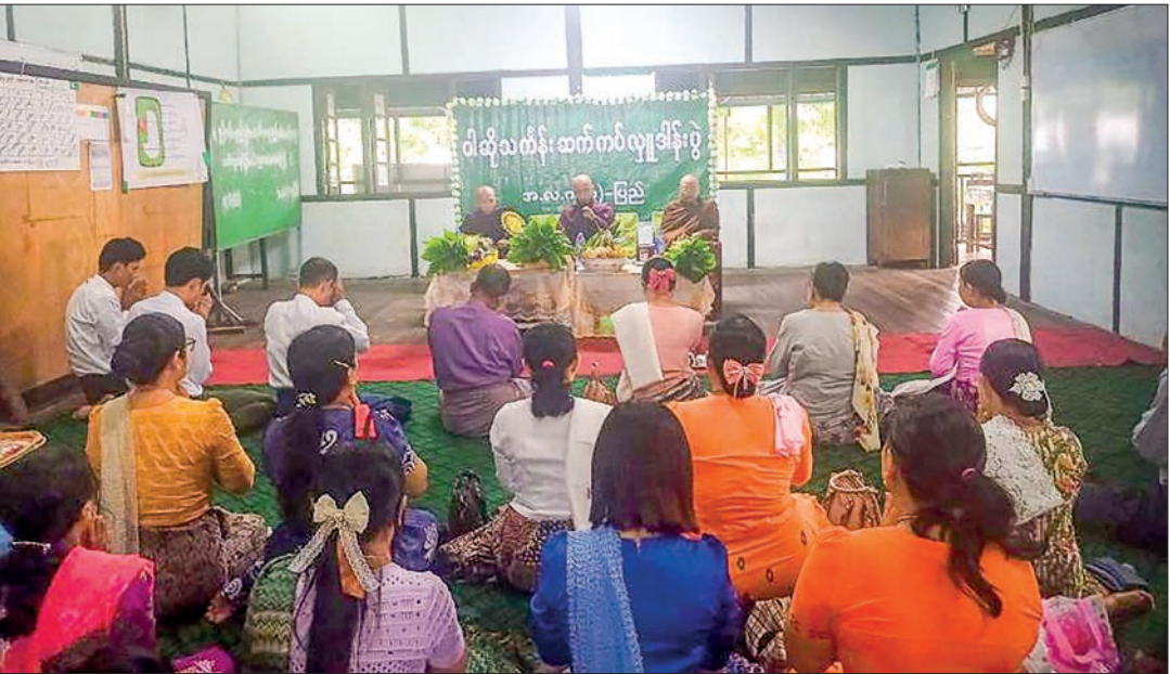
The communal Waso robe offering event in process in Pyay on 15 July 2025.

AS of today, 27 groups have submitted applications to the Union Election Commission (UEC) seeking permission to form political parties, specifying their intended party names. Among them, the UEC has already approved 19 groups to form political parties. Of these 19 approved parties, the Pa-O National Unity Party, led by Khun Than Myint, has submitted a formal application yesterday to register as a political party within the 30 days allowed from the date of party formation approval, under Section 7 of the Political Parties Registration Law. The UEC has so far granted registration to 15 of the 19 approved political parties, while it continues scrutinizing the remaining applications for potential registration, according to official sources. — MNA/KZL