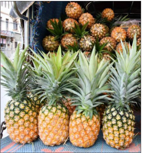
This image showcases Myanmar's export-quality Pineapples.