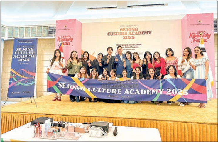
A completion ceremony of the K Beauty training course conducted by the Sejong Cultural Academy in Nepal.

APPLICATIONS are now open for the 2025 Sejong Cultural Academy Korean language course scheduled in August, said the Myanmar Embassy in the Republic of Korea. The course will be conducted at the embassy's training hall. The duration is from 11 to 13 August, and anyone who is interested in Korean culture can join, it said. Applications can be sent until 27 July to https://docs.google.com/forms/d/e/1FAIpQLSd9oU_sqdIQ98nTtdCoexIqK-xRLiLx-zqxnKShUBJa2mcFg/view-form?usp=headerLink . Candidates will be selected based on their applications due to the seating capacity and limited time, but applications are required to be filled out correctly, despite some likely inconvenience, said the embassy. — MT/ZS