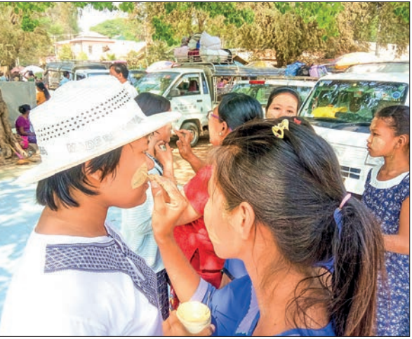
Photos capture the enchanting charm of cultural tourism in the Bagan-NyaungU Ancient Heritage Zone.