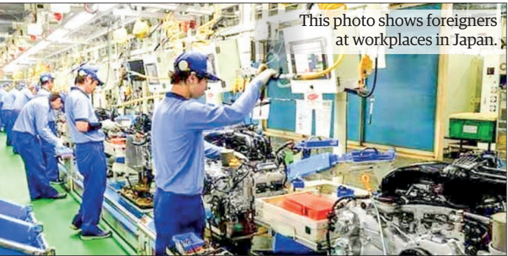
This photo shows foreigners at workplaces in Japan.

ACCORDING to a statement on demand letters issued by the Myanmar Embassy in Japan on 15 July, over 370 Japanese companies will employ more than 1,300 Myanmar workers. The embassy has carried out timely verifications of demand letters received from the Ministry of Labour via the Ministry of Foreign Affairs, it said. It verifies whether labour supervisory companies and factories or companies which offer jobs in Japan are officially established or not, and resubmits its findings and remarks to the Ministry of Labour through the Ministry of Foreign Affairs. It is about 371 demand letters that the embassy submitted to the Ministry of Foreign Affairs after verification until 9 April 2025. According to it, more than 300 Myanmar male workers and up to 1000 Myanmar female workers, totalling more than 1,300, would be employed by 371 Japanese companies. According to a statement issued on 30 June, the embassy said up to 360 Japanese companies would recruit more than 1400 Myanmar workers. — MT/ZS