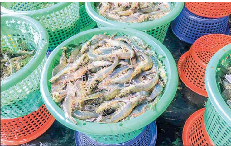
Myanmar exports fishery products to 40 international countries, including Japan, Bangladesh, China and Thailand.