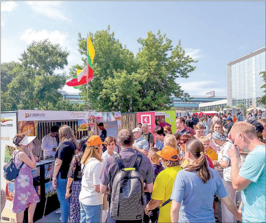
Enthusiastic Russians crowd the Myanmar tourism booth at the Gastronomic and Tourism Fair in Novosibirsk, the Russian Federation, from 11 to 13 July 2025.

The Myanmar participants also took part in the amateur