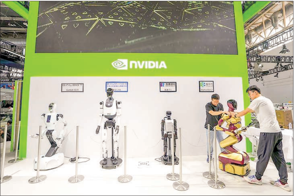
Staff members work at the booth of Nvidia at the digital technology section of the upcoming third China International Supply Chain Expo (CISCE) in Beijing, capital of China, 14 July 2025.

CHINA will open the third China International Supply Chain Expo (CISCE) in Beijing on Wednesday, rallying multinational giants including Nvidia, Apple, and Airbus to showcase industrial resilience and cross-border collaboration. With 651 enterprises and institutions from 75 countries, regions and international organizations participating — including a notable 15 per cent year-on-year increase in US exhibitors — the event signals robust international commitment to stabilizing supply chains. Global giants are actively engaging. US tech giant Nvidia is expected to make its debut at the expo, presenting cutting-edge robots featuring Nvidia chips. Airbus will also make its