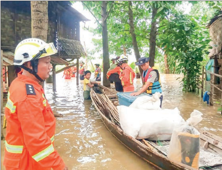
Members of the fire brigade from Kanma Township and responsible personnel help evacuate the flood victims to safety.

ABOUT 60 households in Kanma Township of Magway Region have been evacuated due to the rising tide of the Ayeyawady River, according to the Department of Myanmar Fire Services. With the rising river starting on 13 July, Wards 1 and 2, and houses in Kanna Street were flooded. “Due to rising Ayeyawady, water entered into houses in Kanma Ward 2 and Kanna Street,” said a local. 244 people from 58 households