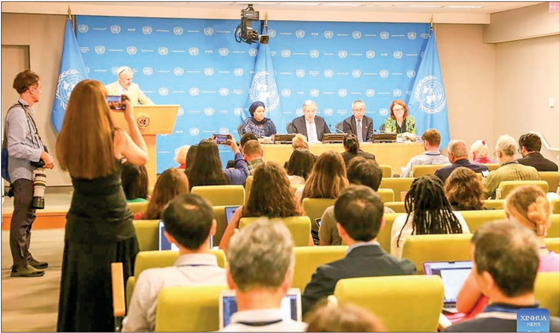
UN Secretary-General Antonio Guterres (3rd R, Rear) speaks at the launch of the Sustainable Development Goals Report 2025 at the UN headquarters in New York, on 14 July 2025.

New HIV infections have declined by nearly 40 per cent since 2010. Malaria prevention has averted 2.2 billion cases and saved 12.7 million lives since 2000. Social protection now reaches over half the world’s population, up significantly from a decade ago. Since 2015, 110 million more children and youth have entered school.