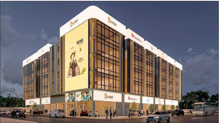
This photo features a miniature replica of the Northern City Project to be developed near Panglong Road, Dagon Myothit (North) Township, Yangon Region.

"The Northern City Project will be implemented in Dagon Myothit (North) Township. Shophouses will be constructed first, followed by the opening of offices and shops, which are expected to create between 2,000 and 3,000 job opportunities for residents. Additionally, once the project begins, it will also provide employment opportunities for people at the