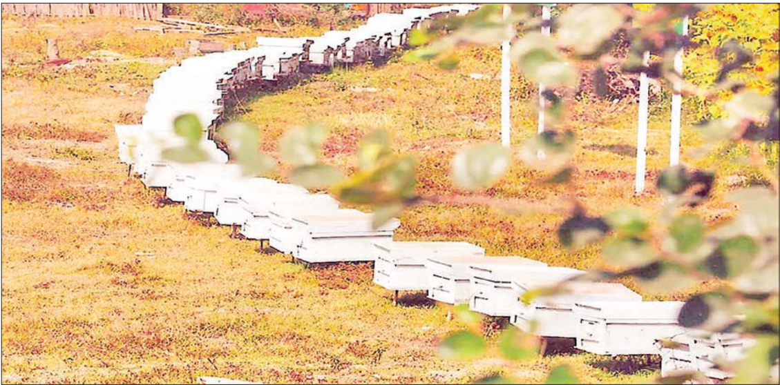
One of the beekeeping and crop-integrated farming businesses in Myanmar.

Myanmar's Apiculture business started in 1979, and honey export began in 1985. Myanmar's honey mostly went to China, Japan, South Korea, Singapore and Thailand. Myanmar produces sesame honey, jujube