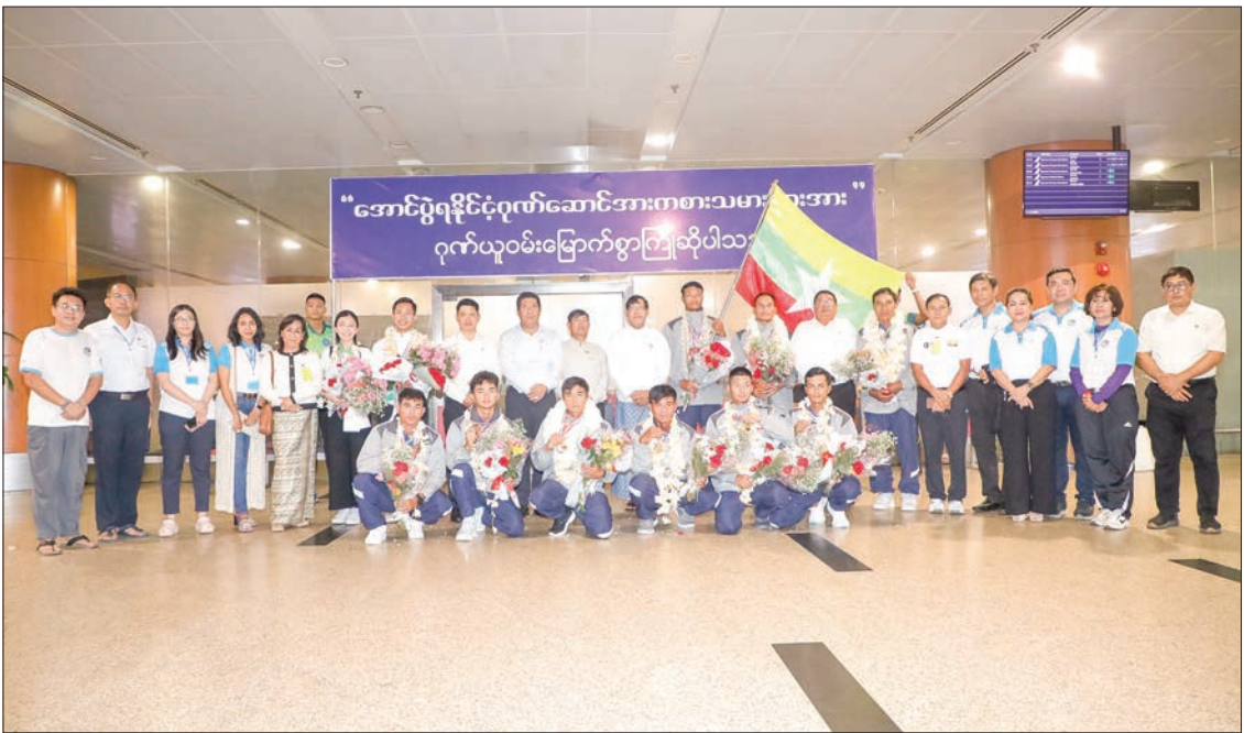
The triumphant Myanmar canoe and kayak team are seen being warmly welcomed at Yangon International Airport on 14 July 2025.

and U18 men's canoeing single 500-metre events. The team also claimed one silver and one bronze in the U18 men's kayak single 500-metre race. Their success continued on the second day with gold medals in the men's canoeing double 200-metre, men's canoeing four 200-metre, men's canoeing single 200-metre, U18 men's canoeing single 200-metre, men's canoeing single 500-metre, and men's canoeing double 500-metre events. The team also earned bronze in the men's canoeing four 500-metre and men's kayak four 500-metre races. With this overall performance, Myanmar ranked first among the partici-