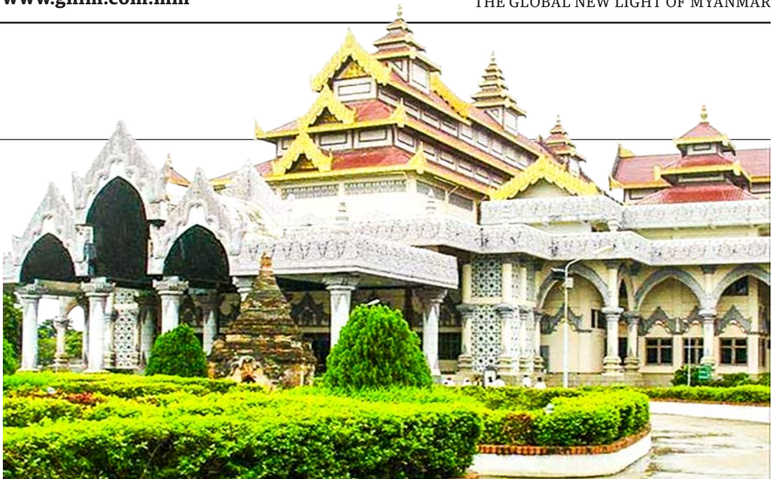
This photo depicts the facade view of the Bagan Archaeological Museum.