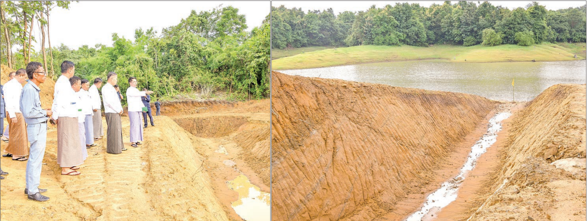
State Administration Council Vice-Chairman Deputy Prime Minister Vice-Senior General Soe Win alongside officials concerned is pictured during his inspection tour of the repair work in Nay Pyi Taw yesterday.

SAC Vice-Chairman DPM Vice-Senior General Soe Win coordinated with officials to fulfil the need for the repair of the Ottarathiri Dam, buildings of the Ministry of Labour, and a retaining wall in Ottarathiri Township.