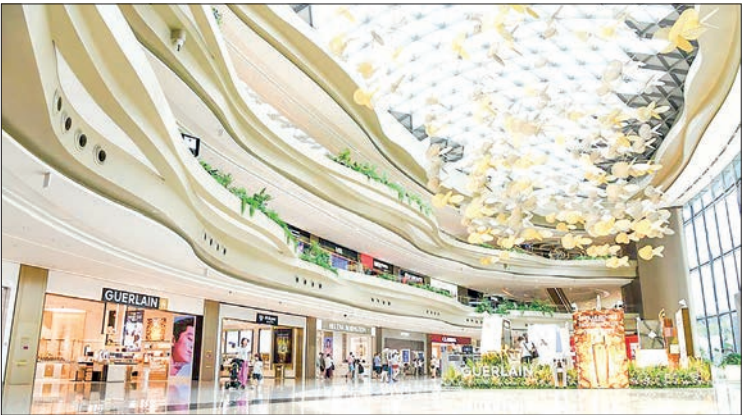
People shop at a duty-free shopping mall in Sanya, south China’s Hainan Province, 29 May 2025.

retail sales went up 8.5 per cent year on year. Backed by the government’s consumer goods trade-in programme, retail sales of home appliances and audiovisual equipment surged 30.7 per cent year on year in the January-June period, and sales of cultural and office goods jumped by 25.4 per cent. In June alone, China’s retail sales of consumer goods increased by 4.8 per cent year on year. Tuesday’s data also showed that China’s gross domestic product (GDP) grew 5.3 per cent year on year in the first half of 2025. Domestic demand contributed 68.8 per cent to GDP growth, with final consumption expenditure contributing 52 per cent, serving as the main driver of economic growth, Sheng said. He noted that policies to promote consumption will be further strengthened in the second half of the year. — Xinhua