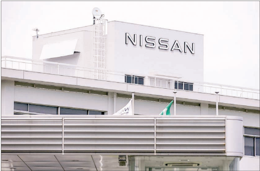
File photo taken in May 2025 shows Nissan Motor Co's Oppama plant in Yokosuka, Kanagawa Prefecture.

NISSAN Motor Co said Tuesday that it will end vehicle production at its flagship Oppama plant in Kanagawa Prefecture near Tokyo by the end of fiscal 2027, transferring the operation to a factory in southwestern Japan, as part of restructuring efforts. The struggling automaker will consolidate the production of current models and those set for production at the Oppama plant at its subsidiary, Nissan