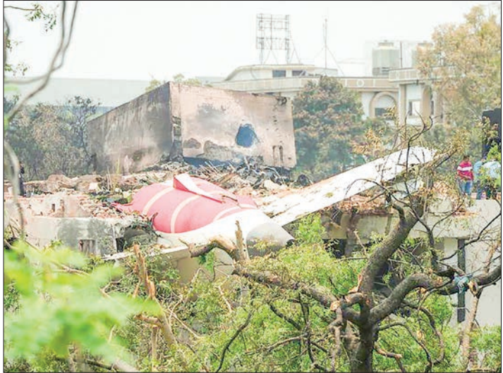
People stand beside the debris of an Air India plane crashed in Ahmedabad of India’s Gujarat state, 13 June 2025. PHOTO: XINHUA

Reports say Air India, Air India Express, Akasa Air and SpiceJet are among domestic carriers operating Boeing 787 and 737 aircraft. — Xinhua