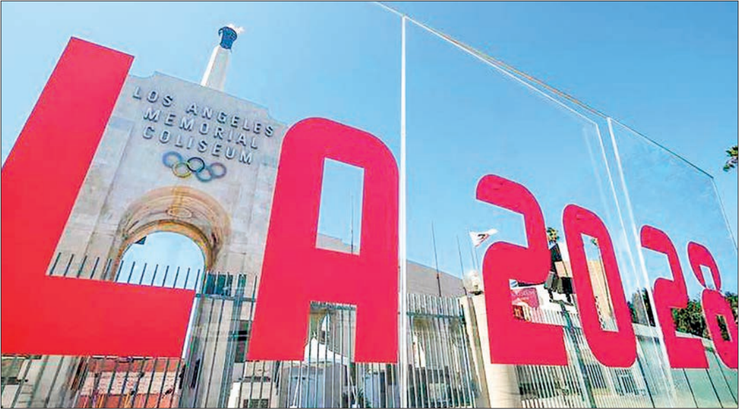
The Los Angeles Memorial Coliseum will co-host the opening ceremony of the 2028 Los Angeles Olympic Games on 14 July 2028.

pating nations. A delegation of 11, including team leaders, coaches and athletes, returned to Yangon International Airport at 10:30 pm on 14 July. Yangon Region Chief Minister U Soe Thein, regional ministers, the Director-General of the Department of Sports and Physical Education, officials from related departments, the chairman and members of supporting sports associations, representatives from the Myanmar Rowing Federation, fellow athletes, trainees from the Sports and Physical Education Institute (Yangon), and families of the athletes gathered in large numbers to offer a warm and proud welcome. — MNA/KZL