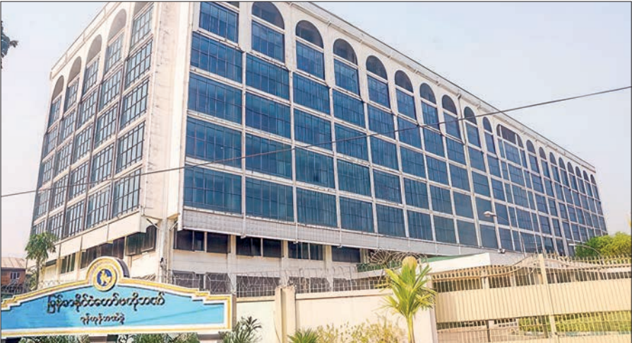
The facade view of the Central Bank of Myanmar (CBM) in Yangon.