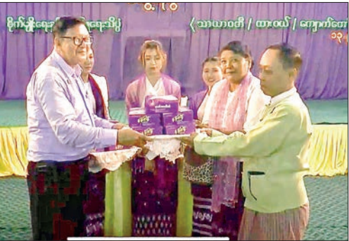
Deputy Minister Dr Aung Gyi is pictured during his inspection tours at the Agriculture and Livestock Institute (Thayawady) on 13 September.

ongoing studies on raising layers, breeding Myanmar pigs with commercial feed to compare growth rates, rearing goats with roughage and concentrate feed to compare growth, producing quality Thai rice seeds, and studying the growth of various vegetables. The deputy minister stressed the importance of training students to have skilled human resources, to promote agricultural and livestock development and to increase production of quality goods. — MNA/KZL