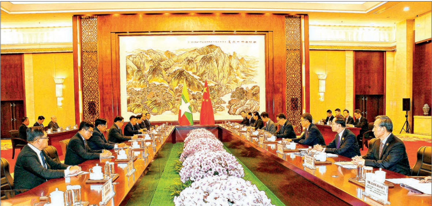
Prime Minister U Nyo Saw holds talks with Vice-President Mr Han Zheng of the People's Republic of China in Nanning yesterday.