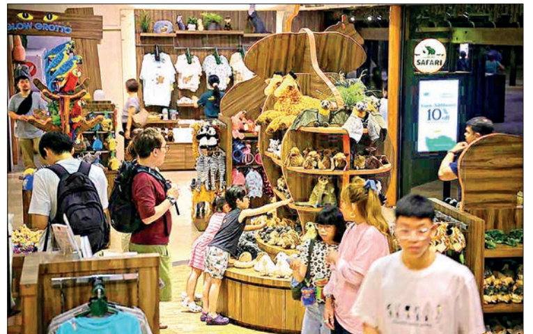
Tourists shop at the souvenir shop of Singapore's Night Safari in Singapore, 23 June 2025.

Overall, international arrivals from January to August reached 11.6 million, a 2.7 per cent increase from the same period last year. — Xinhua