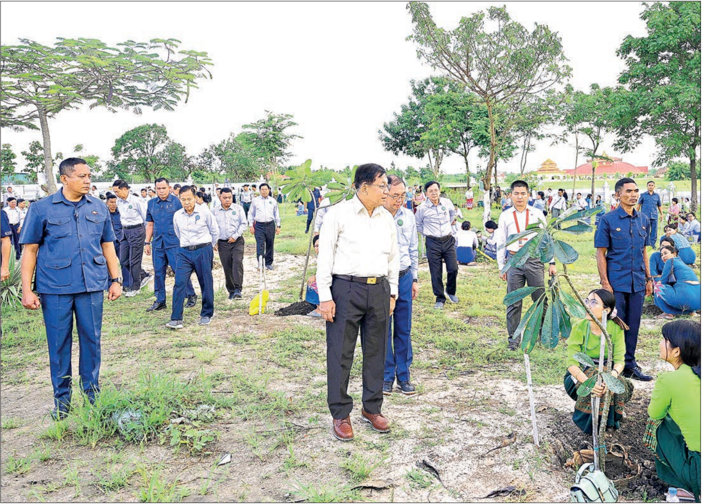
Acting President and State Security and Peace Commission Chairman Senior General Min Aung Hlaing views around the tree-planting measures during the third tree-growing ceremony in Nay Pyi Taw yesterday.