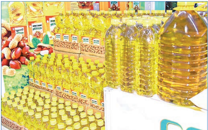
Cooking oil bottles are neatly organized for sale at the supermarket.

THE Central Bank of Myanmar (CBM) sold US$1.25 million to edible oil importing companies on 15 September after sales of $1,488 to CMP companies. CBM sold over $2.76 million to the edible oil-importing companies on 12 September, in addition to selling $30,000 to fuel oil-importing