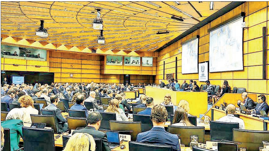
Photo taken on 10 September 2025 shows a view of the Board of Governors meeting of the International Atomic Energy Agency (IAEA) in Vienna, Austria.

THE 69 th General Conference of the International Atomic Energy Agency (IAEA) opened Monday in Vienna, focusing on the peaceful use of nuclear energy and technology and the urgent need to protect the global nuclear non-proliferation regime.