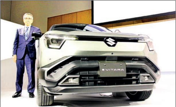
Suzuki Motor Corp President Toshihiro Suzuki stands next to the company's first EV, the e Vitara, in Tokyo on 16 September 2025.

SUZUKI Motor Corp said on Monday its first battery-electric vehicle will be released in Japan on 16 January, as it strives to gain ground in the EV market led by its competitors. The "e Vitara" SUV, which will be exported from India to over 100 countries, starts at 3.99 million yen ($27,000). It can travel over 430 kilometres on a single charge. The automaker did not release a sales target, either domestic or global. "We will enter the cut-throat EV market with the e Vitara and hope to keep releasing EVs best suited