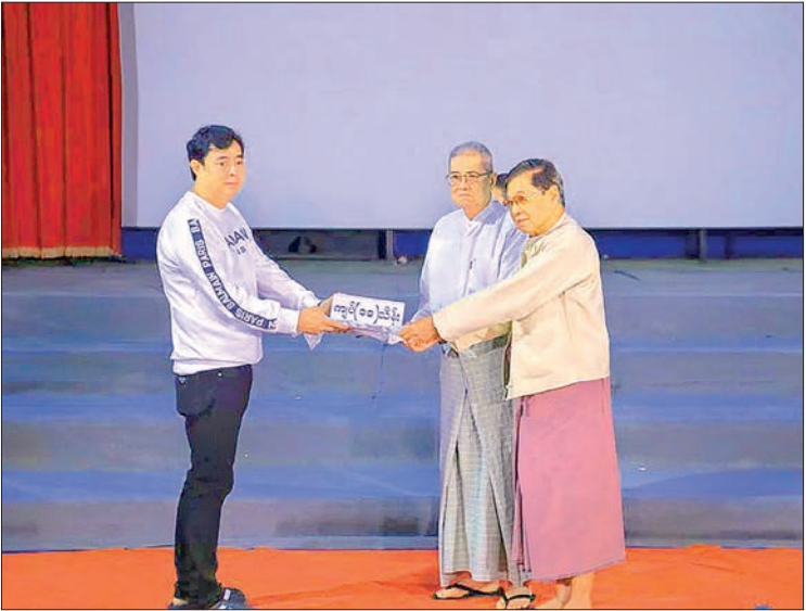
Contributors donating to the Myanmar Motion Pictures Organization for the 105 th Myanmar Motion Pictures Day and the 48 th Film Industry Elders' Honouring Ceremony.