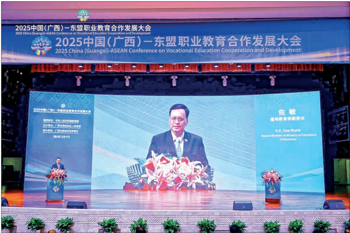
The 2025 China (Guangxi)-ASEAN Conference on Vocational Education Cooperation and Development in progress on 15-16 September in China, addressed by Deputy Minister Dr Zaw Myint.

ty Minister Dr Zaw Myint addressed the growing impact of AI technology, Myanmar's efforts