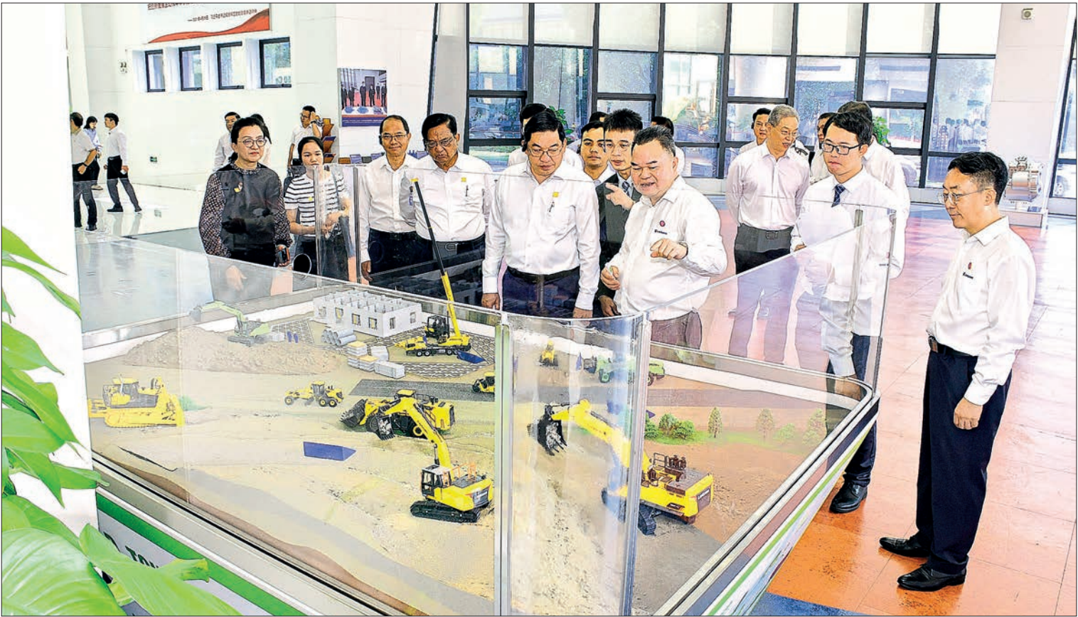
Premier U Nyo Saw looks into the display while viewing around the Global R&D Centre of Guangxi Liugong Machinery Co Ltd in Luizhou, China.

THE Myanmar-China business matching took place at the Myanmar economic representative office in Nanning of the People's Republic of China yesterday afternoon, with an address by Prime Minister U Nyo Saw. Speaking on the occasion, the Prime Minister said that as Myanmar is striving to export new items of products and value-added products to markets at home and abroad, businesspersons from China are invited to do business with technologies and investments. Moreover, since many of the eight priority areas under China's Global Development Initiative align with Myanmar's own needs, there are ample opportunities for entrepreneurs to come and invest. Myanmar is striving to foster a favourable business environment for economic enterprises that are investing with confidence. For those already engaged in business and trade in Myanmar, if any difficulties arise in carry-