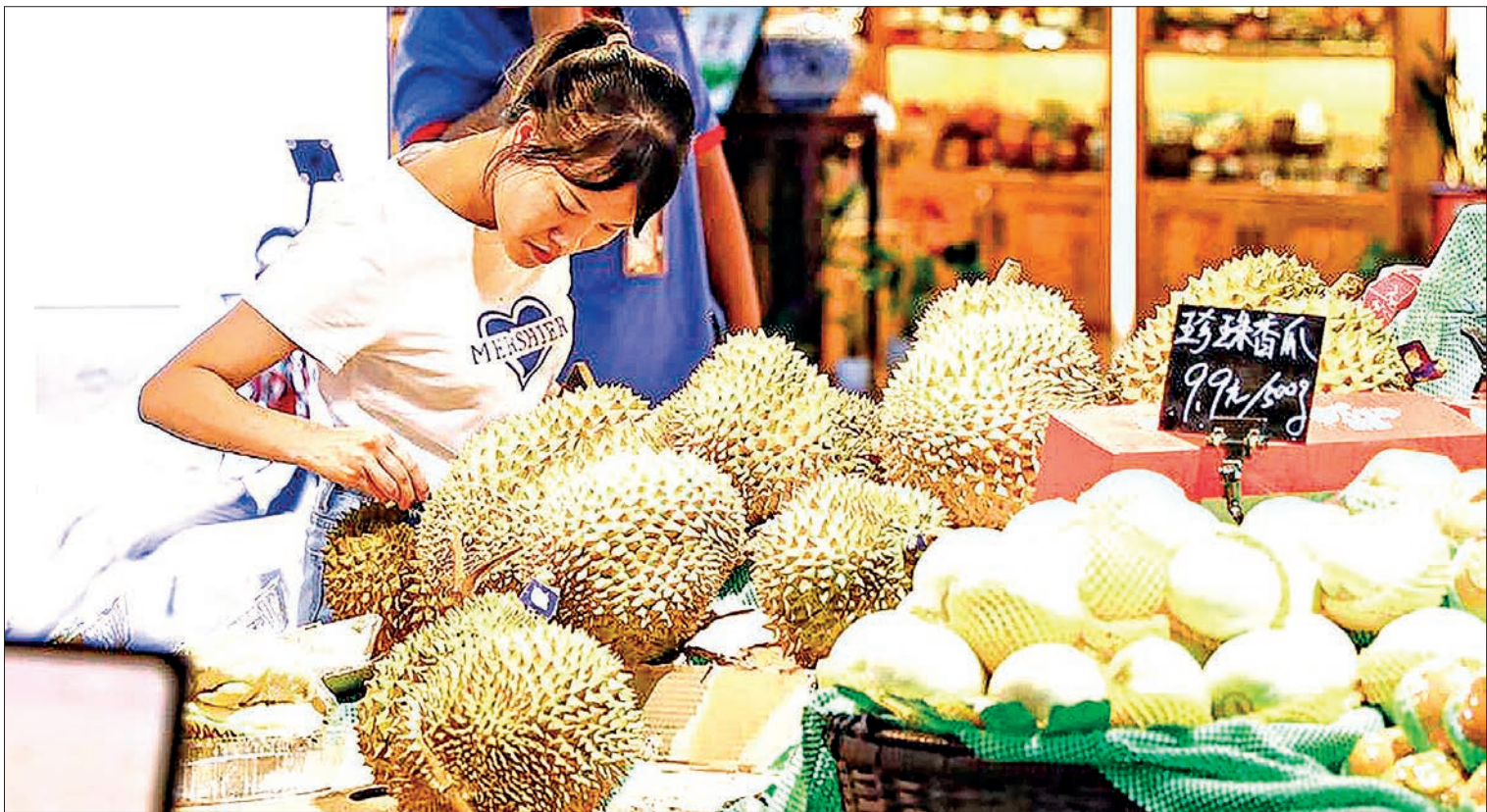
A woman chooses durians imported from Thailand at a supermarket in Nanning, south China's Guangxi Zhuang Autonomous Region, 7 September 2023.

TRADE between China and ASEAN has seen robust growth in the first eight months of the year, boosted by deepened cooperation in the agricultural and manufacturing sectors, data from the General Administration of Customs (GAC) showed on Tuesday.