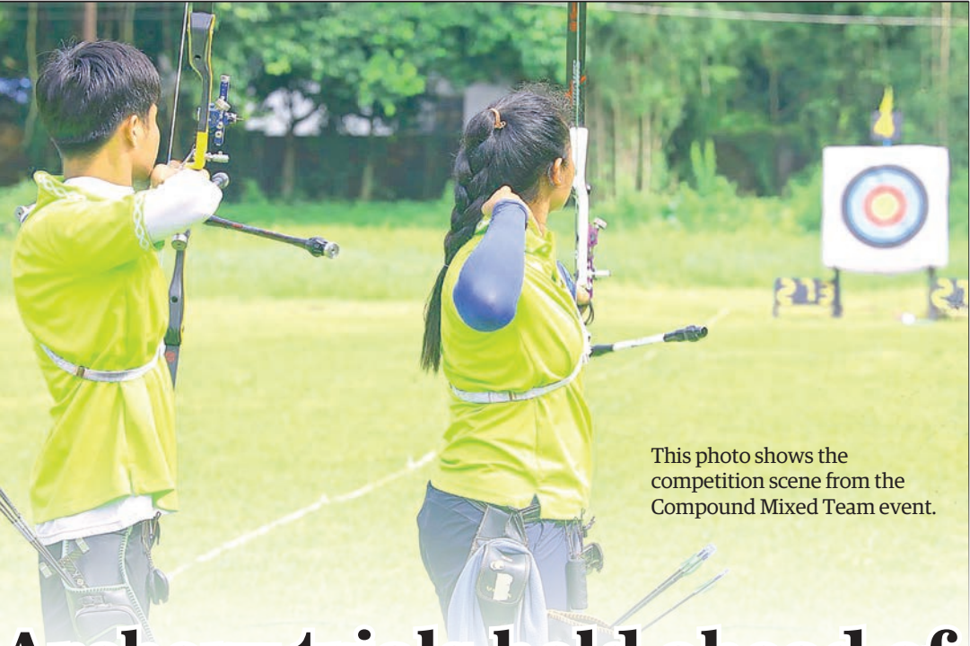
This photo shows the competition scene from the Compound Mixed Team event.

A trial archery competition for Myanmar athletes training for the XXXIII Southeast Asian Games took place yesterday morning at the Kyaikkasan Archery Ground in Tamway Township, Yangon. The trial event featured practice shooting and knockout matches. On behalf of the director-general of the Department of Sports and Physical Education, the deputy director-general, along with officials from the Myanmar Archery