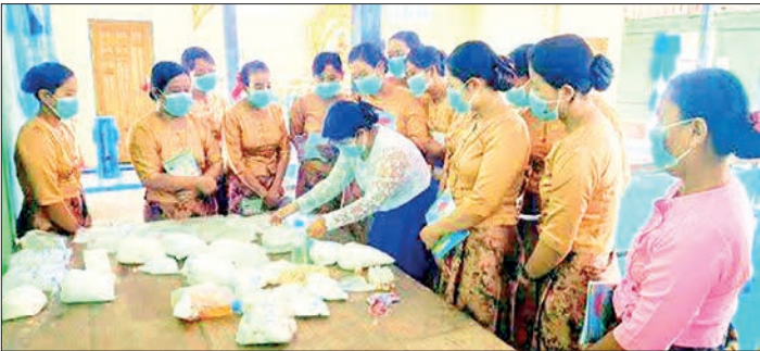
This photo captures the MSME product-making training course.

THE training course for making consumer products has been opened at the No 2 Police Training Centre in Wethteekan, Pyay District, on 15 September morning. It was jointly organized by the Ministry of Cooperatives and Rural Development and the district MSME department, aiming to help local job opportunity growth.