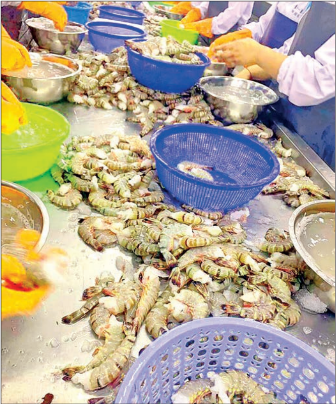
The image discloses shrimp being processed meticulously at a cold storage facility.

to neighbouring countries at the border, totalling 3,740.553 tonnes worth $10.485 million. Myanmar exported over 9,000 tonnes of shrimp in the last FY 2024-2025, bagging $30 million, the department stated. Myanmar steadily exports seafood to 40 countries, including China, Thailand, Bangladesh and Japan through maritime and border trade channels. — NN/KK