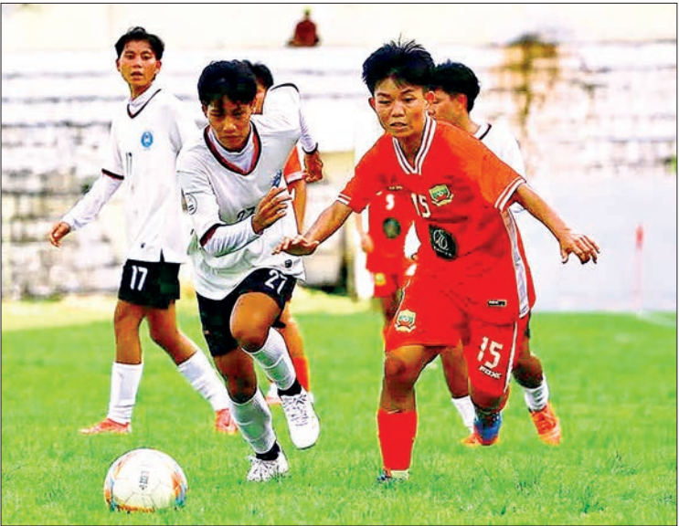
ISPE FC and Shan United in action during the match.

responded well but ultimately conceded a single decisive goal in the second half. Both teams fielded full squads, engaging in competitive and evenly matched play. The only goal came in 51 minutes, scored by Shwe Yi Htun for ISPE FC. Matchday 7 continues this evening at 3:30 pm at Padonma Stadium, featuring YREO FC versus Yangon United. — Shine Htet Zaw/KZL