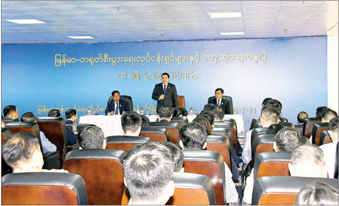
Premier U Nyo Saw addresses the Myanmar China business matching event in Nanning, China, yesterday.

Commerce and Industry (UM-FCCI) and members, Chinese businesspersons wishing to invest in Myanmar and officials. In the morning, the Prime Minister and party visited the Global R&D Centre of Guangxi Liugong Machinery Co Ltd in Luizhou where officials of the company explained heavy machinery, EV machinery and parts manufactured by the factory with the modern technology, the booth of using EV loader under the remote-sensing system at the dangerous workplaces, and the booth on service given to major projects across the world with the use of heavy machinery produced by the factory. The Prime Minister discussed some topics he wanted to know. — MNA/TTA