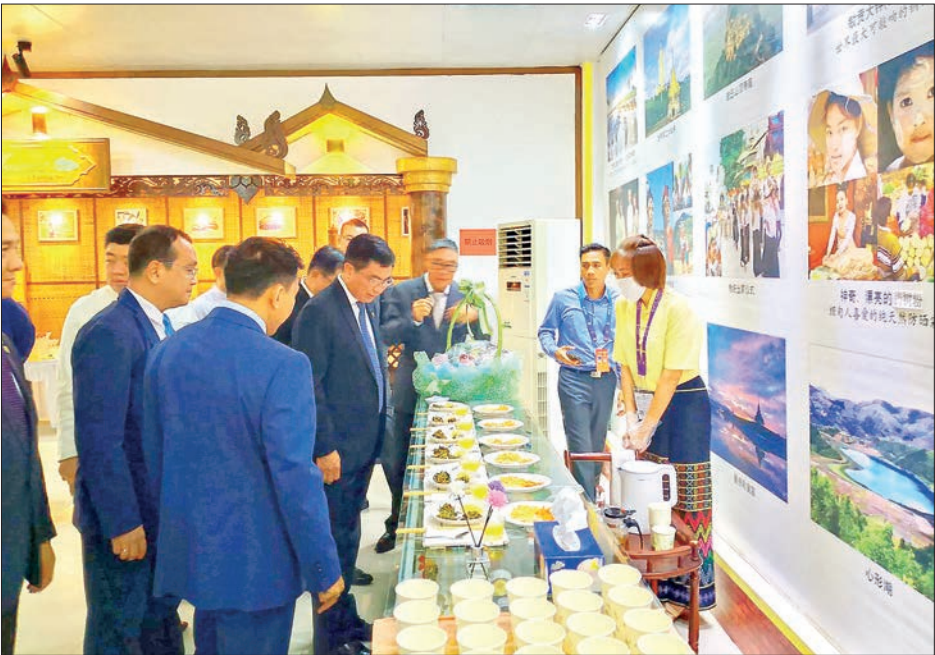
The Myanmar-China Economic Cooperation-Soul Treasure of Myanmar underway yesterday in China, attended by Union Minister U Chit Swe.

THE Myanmar-China Economic Cooperation-Soul Treasure of Myanmar, jointly organized by the Myanmar Trade Promotion Organization of the Ministry of Commerce and the Yangon Region Gems and Jewellery Entrepreneurs Association, took place in Nanning, China, yesterday. Speaking at the event, Union Minister for Commerce U Chit Swe highlighted Myanmar jade that possesses certain market demand and is famous in China, and added that the ceremony was held to penetrate the Chinese market with ruby and sapphire. He mentioned Myanmar ruby, and the countries such as Sri Lanka, Australia, Kashmir, Myanmar, Thailand, Cambodia and the US that produce ruby, whereas Myanmar ruby is considered second best. The Union minister continued that