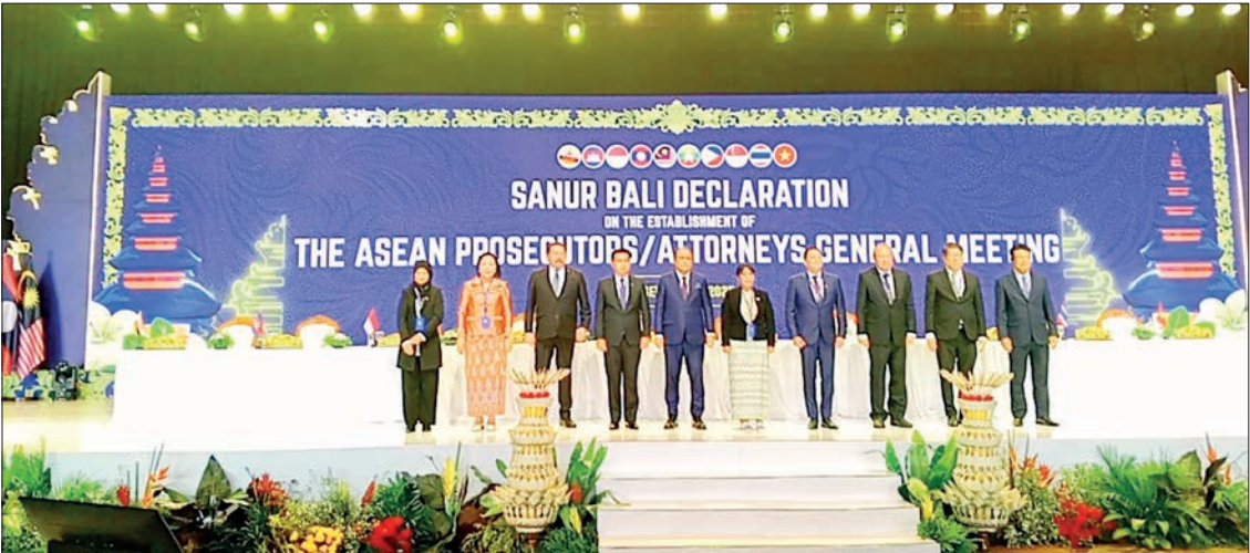
The group photo session of the ASEAN Prosecutors/Attorneys-General Meeting in place on 15-16 September in Bali, Indonesia.

THE Myanmar delegation, led by Union Minister and Attorney-General Dr Thida Oo, attended the signing ceremony of the Sanur Bali Declaration on the establishment of the ASEAN Prosecutors/Attorneys-General Meeting (APAGM) held on 15-16 September in Bali, Indonesia. The prosecutors-general from ten ASEAN member states, the deputy ASEAN secretary-general, and relevant officials attended the event. Speaking at the event, the Union minister highlighted the intentions of the establishment of APAGM to enhance prosecutorial cooperation in accordance with the law of the