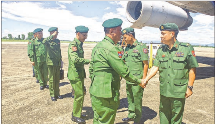
The Myanmar Tatmadaw delegation begins friendship visit to India.

The Myanmar Tatmadaw delegation, comprising a total of 120 personnel from the Myanmar Tatmadaw (Army, Navy and Air), will visit landmarks, training schools, pagodas, and monasteries in Gaya, India, until 19 September. — MNA/MKKS