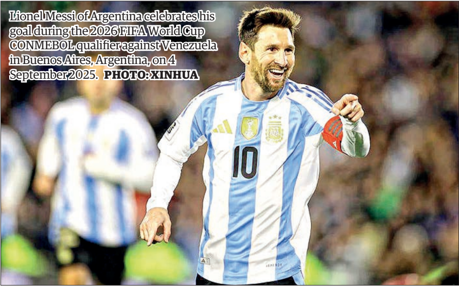
Lionel Messi of Argentina celebrates his goal during the 2026 FIFA World Cup CONMEBOL qualifier against Venezuela in Buenos Aires, Argentina, on 4 September 2025.

ARGENTINA manager Lionel Scaloni said Monday that he did not know if Lionel Messi would be a part of the Albiceleste squad that will seek to defend its FIFA World Cup crown next year. The 38-year-old Argentina captain has not yet committed to the tournament in the United States, Mexico and Canada, having hinted in recent interviews that he could retire beforehand. "I haven't spoken with Messi about