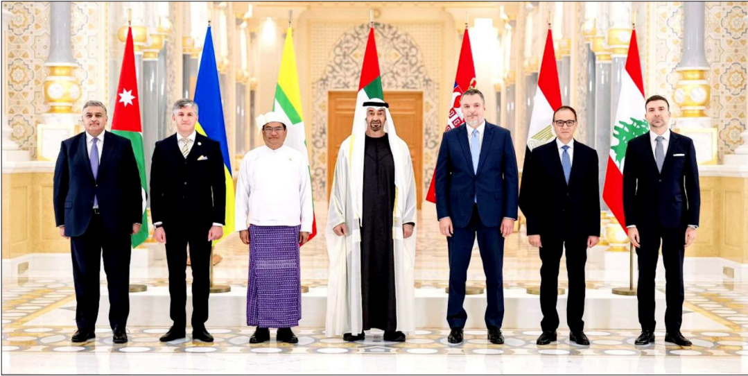
The documentary group photo session followed the credentials presentation in the UAE on 8 September 2025.

U Kyaw Kyaw Min, Ambassador Extraordinary and Plenipotentiary of the Republic of the Union of Myanmar to the United Arab Emirates, presented his Credentials to His Highness Sheikh Mohamed Bin Zayed Al Nahyan, President of the United Arab Emirates, on 8 September 2025, at Qasr Al Watan (Presidential Palace) in Abu Dhabi. — MNA