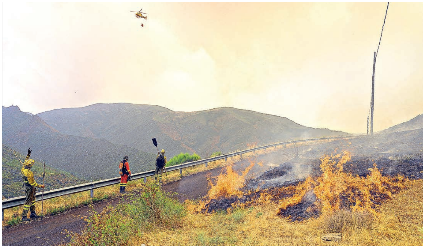
Forest firefighters fight a wildfire in Castrillo de Cabrera, northwestern Spain, on 16 August 2025.

The average temperature globally for August was 1.29 degrees Celsius above pre-industrial times, marginally cooler than the monthly record set in 2023 and tied with 2024. Such incremental rises may appear small, but scientists warn that is already destabilizing the climate and making storms, floods and other disasters fiercer and more frequent. — AFP