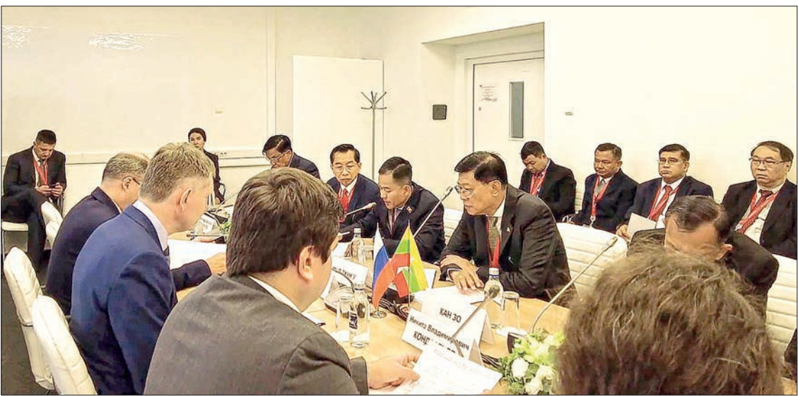
Union Transport & Communications Minister U Mya Tun Oo attends the 10 th Eastern Economic Forum held on 3-6 September in the Russian Federation.

The two sides discussed close cooperation between Myanmar and Russia, preparations for the upcoming elections in Myanmar, matters related to