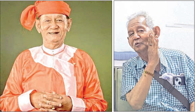
Humourist U Htin Paw.

timely operations in affected areas. Up to now, 653 survivors have been rescued from collapsed buildings, and the bodies of 880 deceased individuals have been recovered. The Government is continuing to carry out rehabilitation work with the support and donations of well-wishers and donors from both home and abroad. — MNA/MKKS