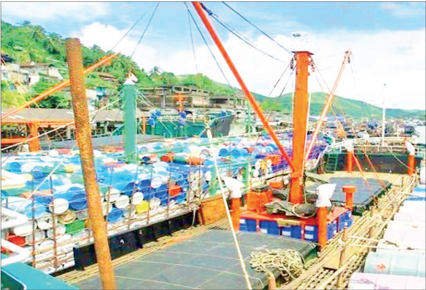
This photo shows vessels loaded with export cargo docking at Kawthoung Port.

Trade between Thailand and Myanmar was led by the Mae Sot border, which posted a record THB45.5 billion, far ahead of Kanchanaburi (THB32.4 billion) and Ranong (THB18.2 billion), with smaller volumes recorded at Mae Sai, Mae Hong Son, Prachuap Khiri Khan, and Mae Sariang.