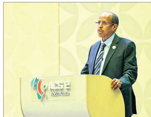
African Union (AU) Commission Chairperson Mahmoud Ali Youssef addresses the Second Africa Climate Summit in Addis Ababa, Ethiopia, on 8 September 2025.

The Second Africa Climate Summit, among other