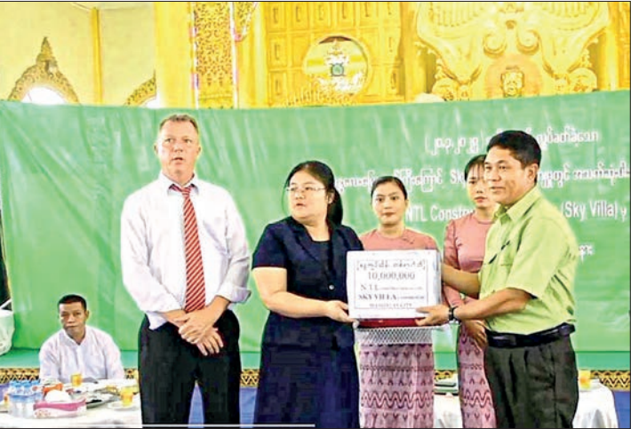
This photo captures an official from NTL Construction Company presenting compensation to the families of those who died in the Sky Villa building collapse caused by the earthquake.