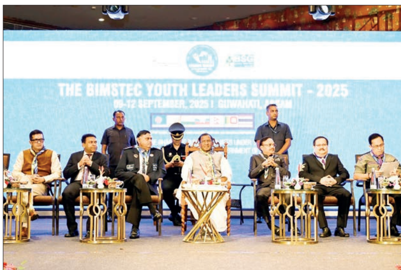
The BIMSTEC Youth Leaders Summit 2025 underway in Guwahati, India, yesterday (L), attended by 10 Myanmar youth delegates (R).

The delegates from BIMSTEC nations – India, Bangladesh, Bhutan, Nepal, Sri Lanka, Myanmar and Thailand – sang