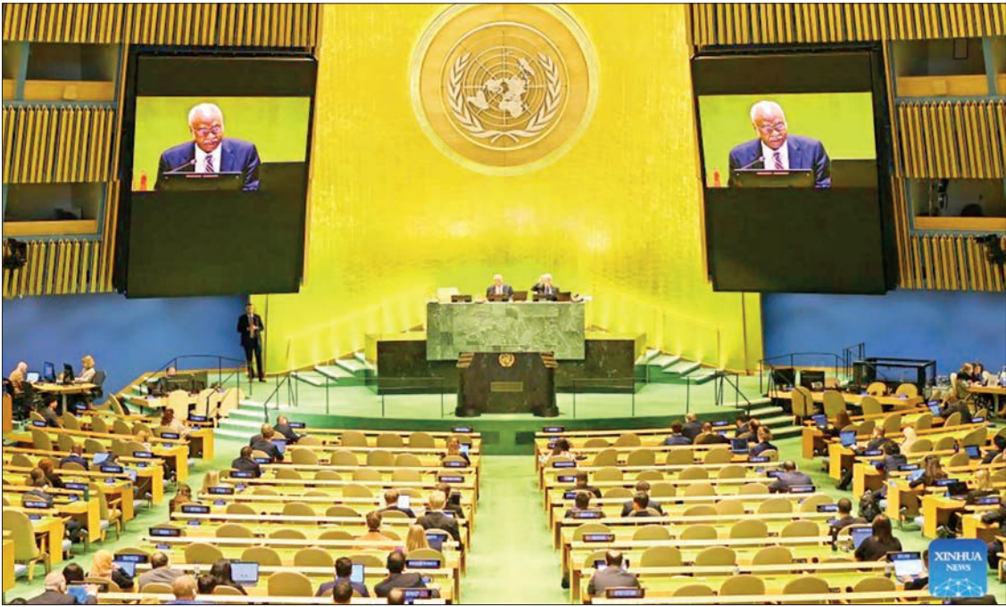
UNGA President Philemon Yang (C and on the screens) delivers concluding remarks during the General Debate of the 79 th session of the United Nations General Assembly (UNGA) at the UN headquarters in New York, on 30 September 2024.

THE purpose and principles of the UN Charter have been central to shaping the international order established after World War II and remain vital to maintaining global peace and security, said Philemon Yang, president of the 79 th session of the UN General Assembly (UNGA). Adopted in the aftermath of unprecedented devastation, the UN Charter embodied a collective commitment to “save succeeding generations from the scourge of war” through international cooperation, the sovereign equality of states and respect for universal human dignity, the UNGA president told Xinhua in a recent written interview. Signed in San Francisco, US state of California, in 1945 by representatives of 50 nations, the UN Charter emerged from