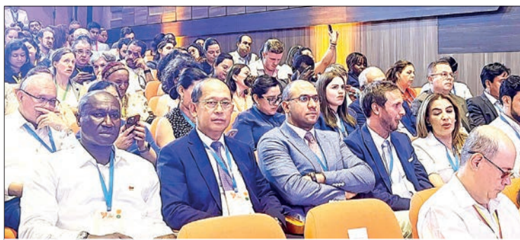
The 15 th Summit of the Global Forum on Migration and Development in progress on 2-4 September, attended by Deputy Minister U Naing Min Kyaw (2 nd L).

ing Priorities for Countries of Destination and Origin” and “Durable Solutions to Internal Displacement.” On the second day of the forum (3 September), the delegation attended expert-level panel discussions under the themes “Care Work in Migration: Recognition, Advocacy, and Progress on Global and Regional Migration” and “Restoration of Rights as the Cornerstone for a Dignified Return.” On the third day of the forum (4 September), the delegation attended the “Future of the Forum” session as well as the closing ceremony.