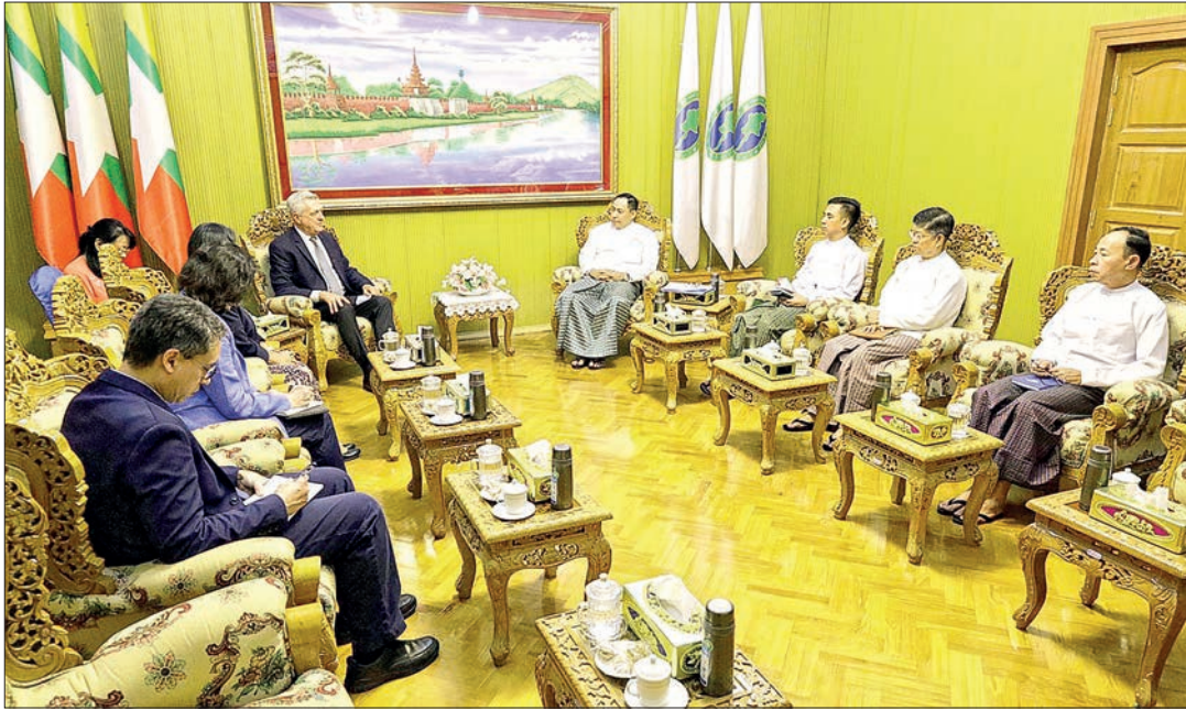
UN High Commissioner for Refugees Mr Filippo Grandi calls on Union Minister Lt-Gen Yar Pyae yesterday.

UNION Minister for Border Affairs Lt-Gen Yar Pyae received United Nations High Commissioner for Refugees Mr Filippo Grandi yesterday morning at the guest hall of the Ministry of Border Affairs.