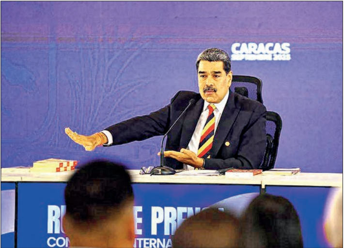
Venezuelan President Nicolas Maduro addresses a press conference in Caracas, Venezuela, on 1 September 2025.

Trump, with Minister of Communication and Information Freddy Nanez suggesting on social media that it might have been generated with artificial intelligence. Three days after the US strike, Venezuelan President Nicolas Maduro vowed to defend Venezuela’s sovereignty and urged Trump to engage in dialogue to avoid conflict. — Xinhua