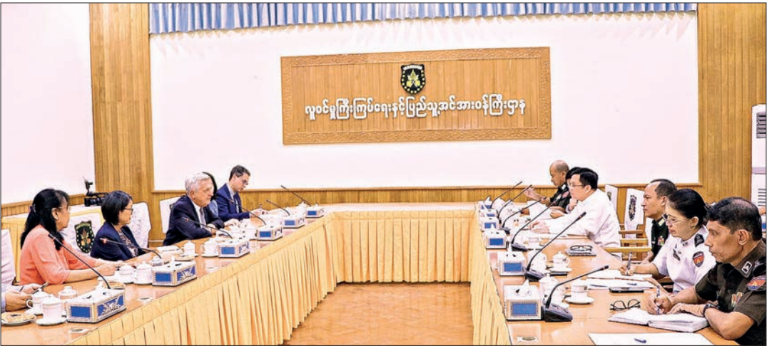
Union Minister U Myint Kyaing and UNHCR Chief Mr Filippo Grandi meet to discuss the repatriation of displaced persons in Rakhine State, yesterday.

U Myint Kyaing, Union Minister for Immigration and Population, received Mr Filippo Grandi, United Nations High Commissioner for Refugees and his delegation in the ministry’s meeting hall in Nay Pyi Taw at 3.30 pm yesterday. They openly exchanged views on matters related to the repatriation of displaced persons from Rakhine State. Discussions covered the signing of a tripartite Memorandum of Understanding (MoU) between the ministry and UN-