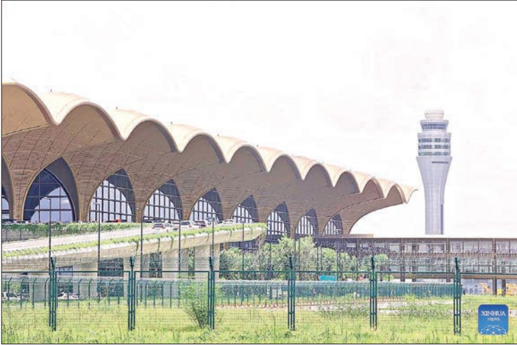
This photo taken on 9 September 2025 shows an exterior view of Techo International Airport (TIA) in Kandal province, Cambodia.

the official launch of Techo International Airport would further broaden Cambodia’s connection to the world. “The aviation sector is one of many ways to connect tourists, businesses, political networks, and multi-purpose missions,” he said. “As a major source of national revenue, it is driven by targeted policies to attract investment, strengthen diplomatic relations, and promote other destinations. Therefore, Cambodia has actively expanded and upgraded its international airports to meet growing travel demand, enhancing connectivity for travellers, especially those visiting Cambodia,” he added. — Xinhua