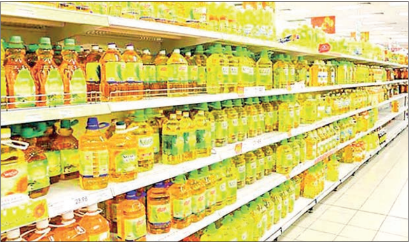
Cooking oil bottles are organized for sale at the supermarket.

CBM announced on 3 September that it would inject $30 million into the fuel oil sector.