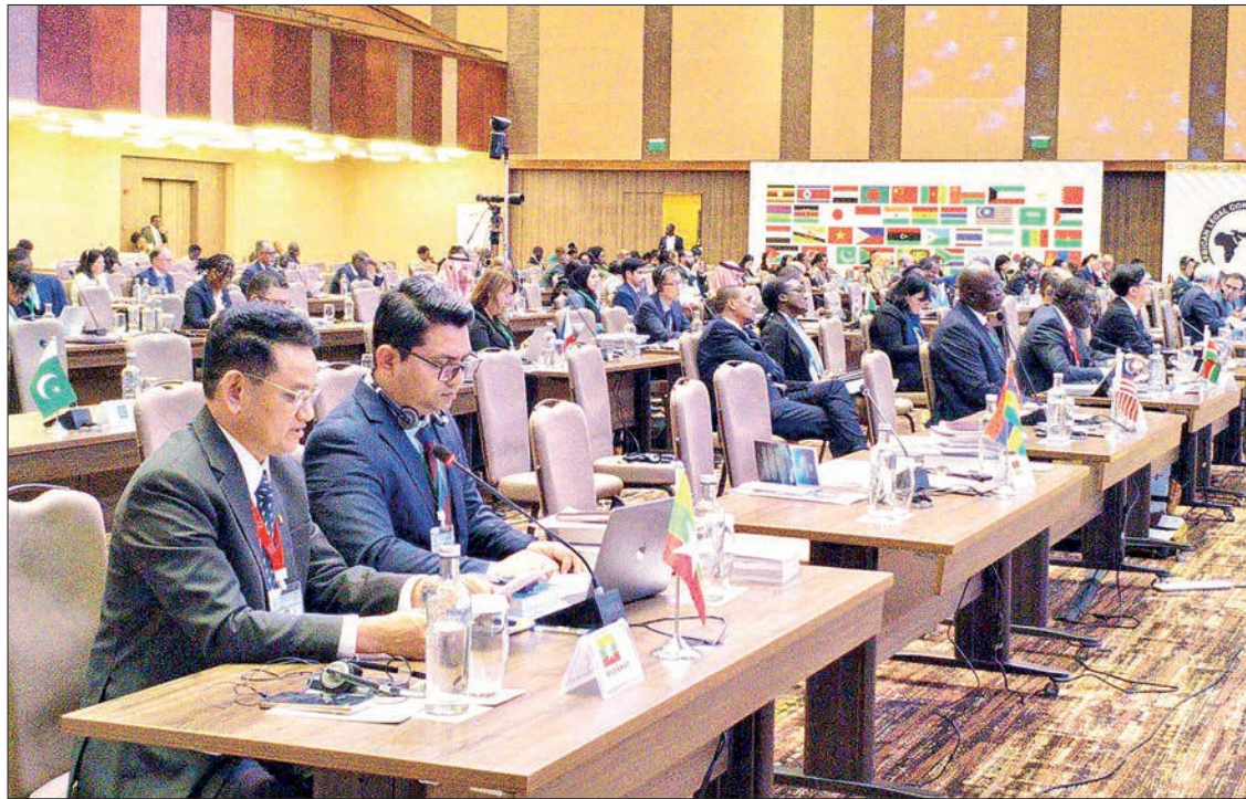
This photo captures Myanmar delegates attending the 63 rd Annual Session of the Asian-African Legal Consultative Organization (AALCO) in Kampala, Uganda.

During the session, member states approved the 2026 budget submitted by the AALCO Secretariat, elected the Chair and Vice-Chair of the meeting, reappointed the Secretary-General, and endorsed the Organization's annual report and the publication