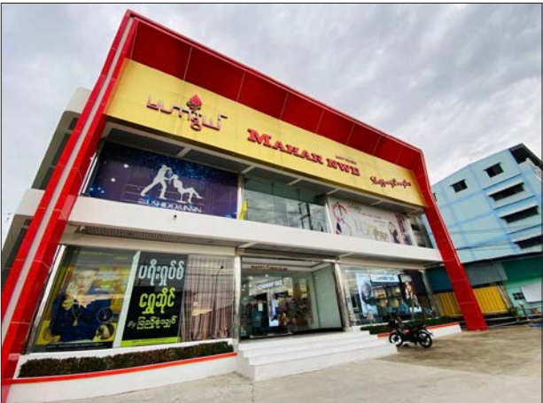
This photo showcases the Mahar Nwe Shopping Centre in Mahachai, Thailand.

The Mahar Nwe Shopping Centre is one of the main shopping centres for Myanmar migrant workers. This is a Myanmar shopping complex featuring shops that sell mobile phones, computers, watches, clothes, personal goods, and recruitment agencies' offices, as well as schools and restaurants. — ASH/KK