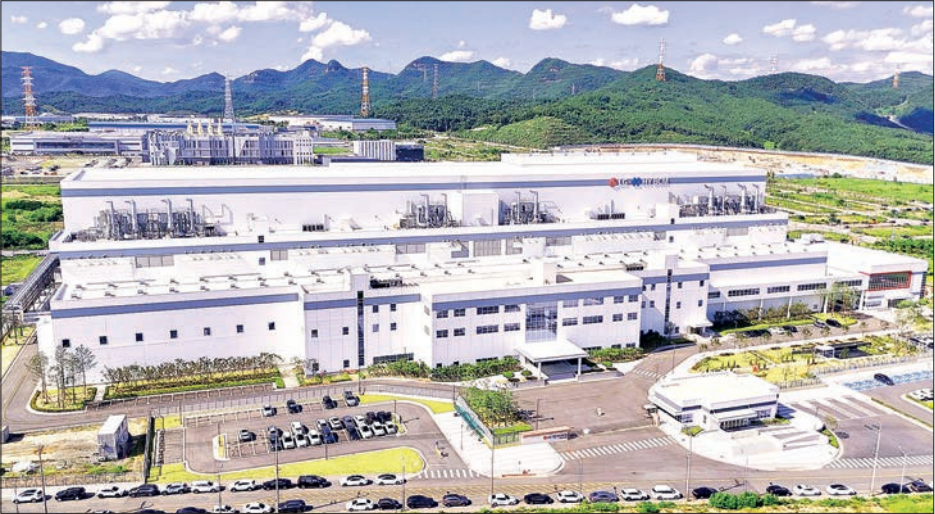
Supplied photo shows a plant of LG-HY BCM Co a joint venture between South Korea’s LG Chem Ltd and China’s Zhejiang Huayou Cobalt Co in Gumi, a city in South Korea’s North Gyeongsang Province.

per cent, a Toyota Tsusho spokesperson said. LG-HY BCM makes cathode active materials for use in lithium-ion batteries and operates a plant in South Korea with an annual production capacity of 66,000 tonnes, according to Toyota Tsusho. — Kyodo