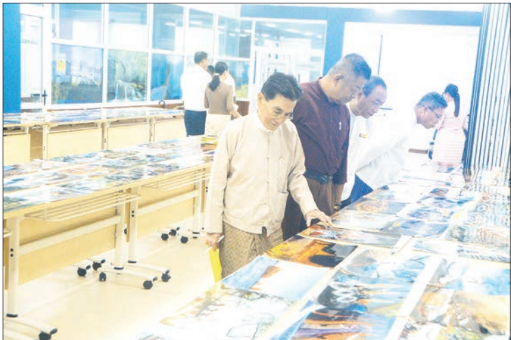
Officials looking into the photo exhibits at yesterday’s event.

The contest attracted 52 participants who submitted a total of 343 photos. The prizes are as follows: first prize K900,000; second prize K700,000; third prize K500,000; fourth prize K300,000; fifth prize K200,000; and 20 consolation prizes of K150,000 each. — Arka Lin/MKKS