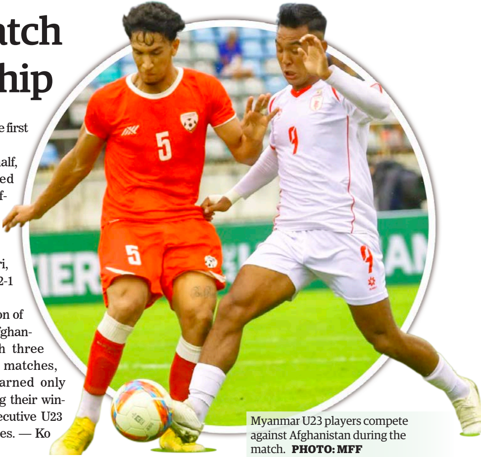
Myanmar U23 players compete against Afghanistan during the match.

equalize, bringing the first half to a 1-1 draw. In the second half, both teams played offensively, but Afghanistan secured the winning goal in the 90th minute through Yasa Safari, sealing Myanmar's 2-1 defeat. At the conclusion of the group stage, Afghanistan finished with three points from three matches, while Myanmar earned only one point, extending their winless streak in consecutive U23 matches to six games. — Ko Nyi Lay/KZL