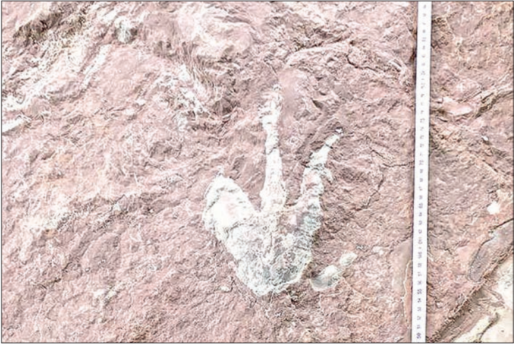
This file photo shows dinosaur footprints uncovered at Namushan Village in Dongxing City, south China's Guangxi Zhuang Autonomous Region.

extend the known range of dinosaur footprints in China to the shores of the Beibu Gulf — about 21 degrees north latitude and located in what is now south China's Guangxi Zhuang Autonomous Region. The tracks, uncovered in 2021 during high-speed railway construction at a village in the city of Dongxing, consist of seven theropod footprints on a four-square-meter rock slab — indicating that some bipedal carnivorous dinosaurs had left these traces in this southern China coastal area. — Xinhua