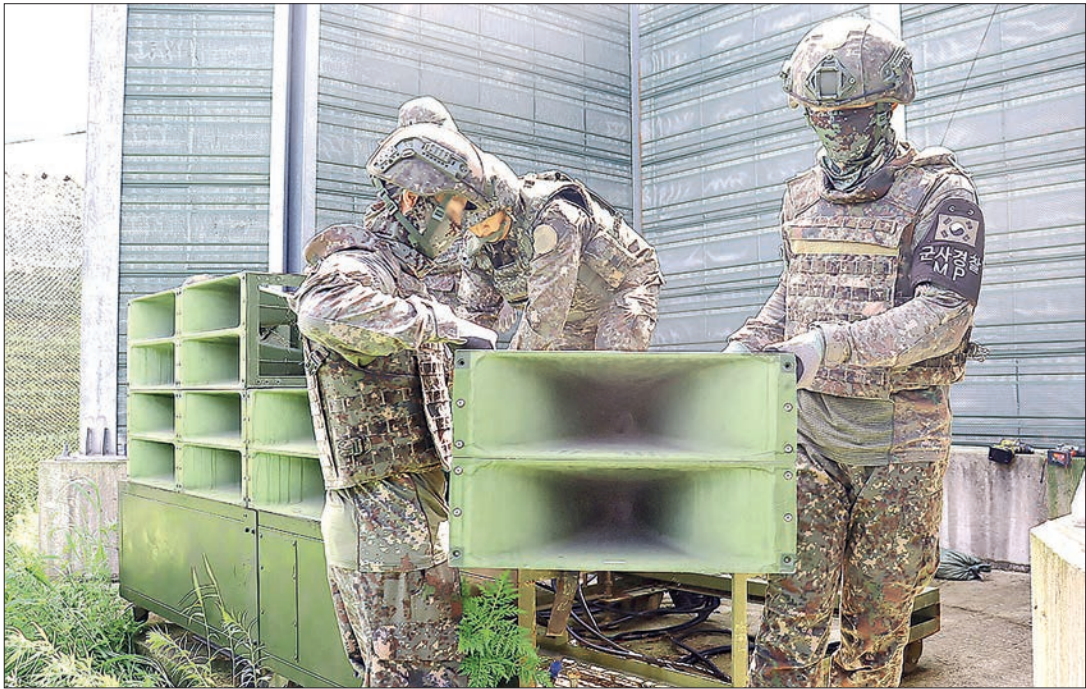
This handout photo taken on 4 August 2025 and provided by the South Korean Defence Ministry shows South Korean soldiers removing loudspeakers that were set up for propaganda broadcasts near the Demilitarized Zone separating the two Koreas in an undisclosed location in South Korea.