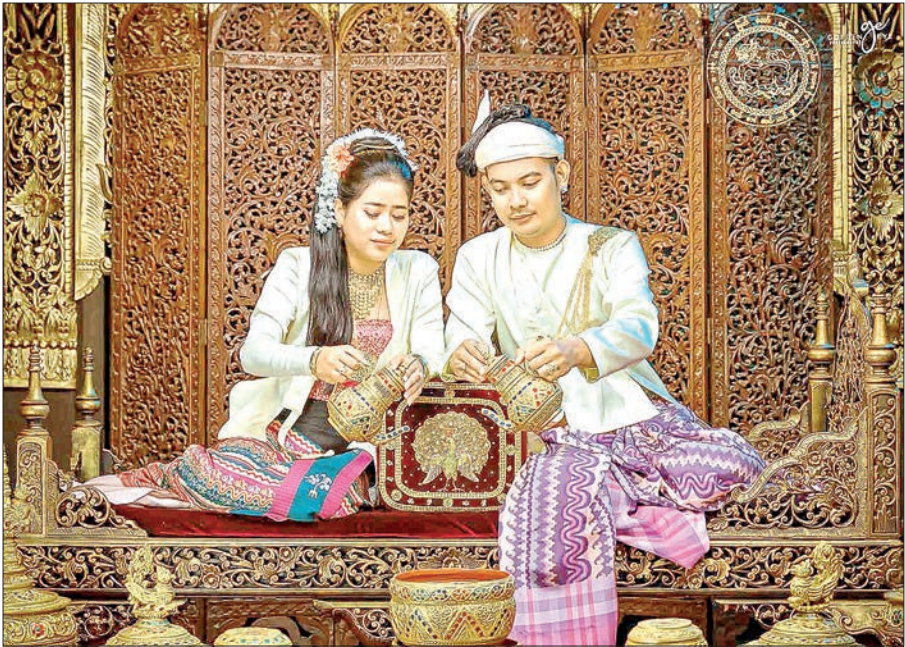
This image depicts young people in traditional Myanmar dresses.

Aung Bar Lay application, and the price per ticket is K1,000, or dial *117# with a Mytel SIM. — MT/ZS