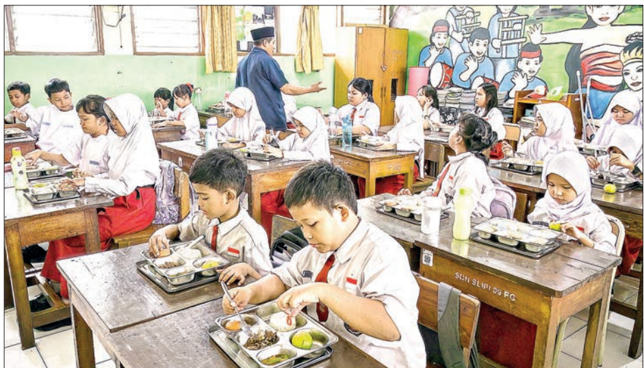
This picture taken on 23 June 2025 shows elementary schoolchildren eating food prepared by the government’s free meal programme at a classroom in Jakarta.