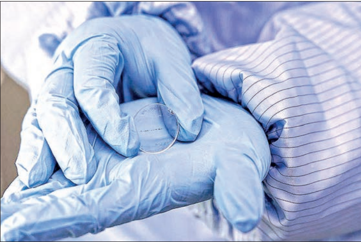
A researcher displays the lunar sample to be tested at the Nano Secondary Ion Mass Spectrometer Laboratory of the Institute of Geology and Geophysics of the Chinese Academy of Sciences in Beijing, capital of China, 8 April 2025.

CHINA'S space agency has released the approved list for the ninth batch of lunar sample research applications, allowing successful applicants to borrow samples returned by the Chang'e-5 and Chang'e-6 missions. A total of 30,881.8 milligrammes of lunar samples will be lent to 32 research groups from 25 research institutions, according to the Lunar Exploration and Space Engineering Centre under the China National Space Administration. The list includes universities such as Macao University of Science and Technology in south China, Chengdu University of Technology in southwest China, east China's Donghua University, Harbin Institute of Technology in northeast China, south China's University of Hong Kong and the Hong Kong Polytechnic University, among others. This list also features institutions affiliated with the Chinese Academy of Sciences and the Chinese Academy of