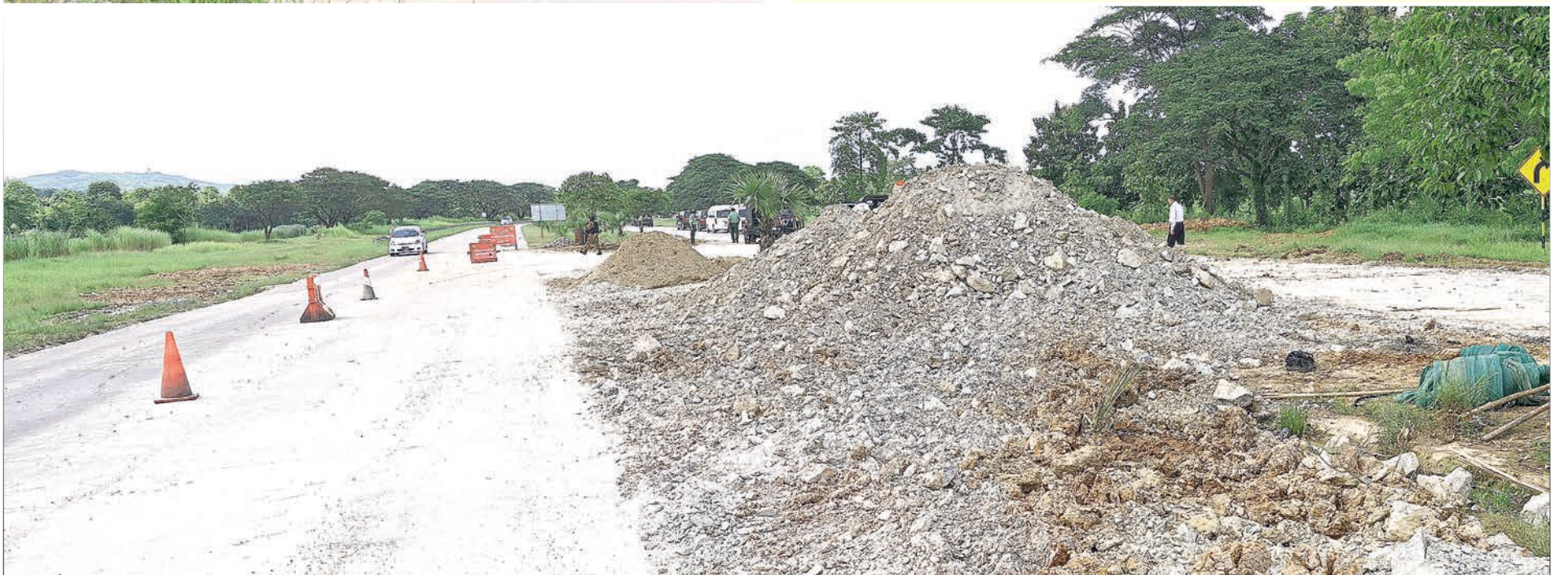
Senior General Min Aung Hlaing, Chairman of the State Security and Peace Commission of the Republic of the Union of Myanmar, is pictured during his inspection tours along the Yangon-Mandalay Expressway.