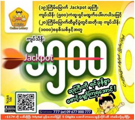
This image showcases an advert for the Aung Bar Lay lottery.

Aung Bar Lay application, and the price per ticket is K1,000, or dial *117# with a Mytel SIM. — MT/ZS