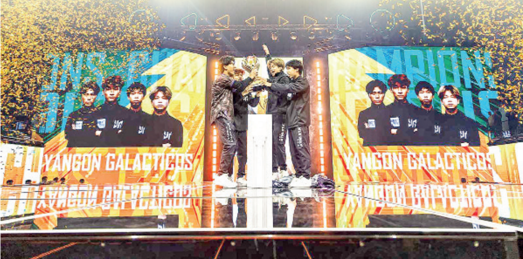
Esports players from Yangon Galactico celebrate their victory after receiving the championship prize at the Exports World Cup in Riyadh, Saudi Arabia.

YANGON Galactico, representing Myanmar, has been crowned the PMWC (PUBG Mobile World Cup) Champion at the 2025 Esports World Cup held from 25 July to 3 August in Riyadh, Saudi Arabia.