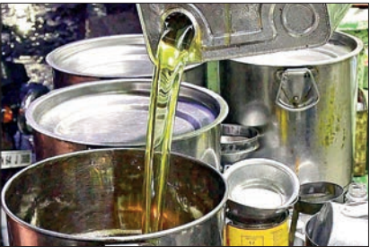
Yangon palm oil reference price set higher this week