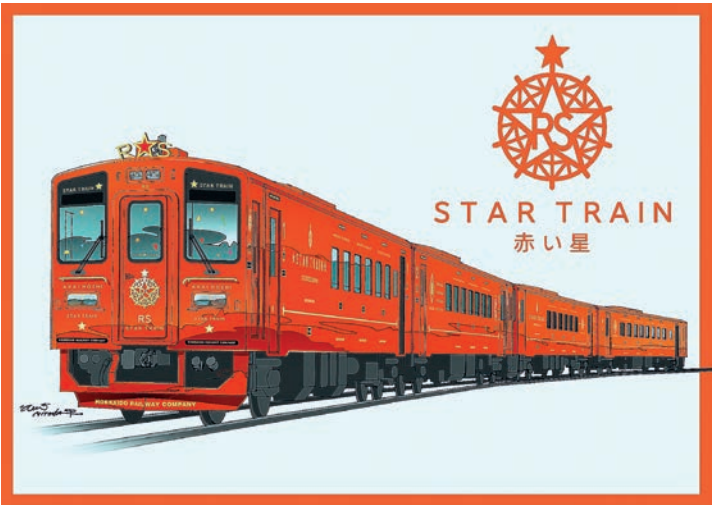
An artist's rendition of Hokkaido Railway Co's "Red Star" sightseeing train.

The Blue Star will be in service from June to September, mainly during the lavender blooming season, between JR