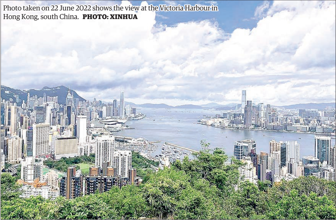
Photo taken on 22 June 2022 shows the view at the Victoria Harbour in Hong Kong, south China.

year on year. Solid economic growth will help boost local incomes and consumption, said Chan.