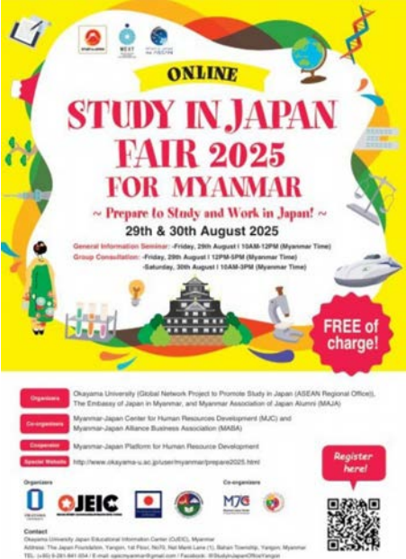
This image displays an advert for the Online Study in Japan Fair 2025 for Myanmar.

Free registration is open at https://docs.google.com/forms/d/e/1FAIpQLSd-Bflv10-QLVbbK7svsB6kt2EQAg-6J6E-b60X1crS3fPh7LGg/viewform , and detailed information is available at its special website https://www.okayama-u.ac.jp/user/myanmar/prepare2025.html . — MT/ZS