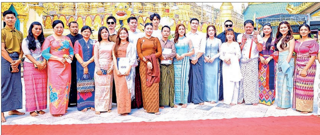
Actors and production team members are seen at the opening ceremony for the drama series 'Tears of Hatred'.