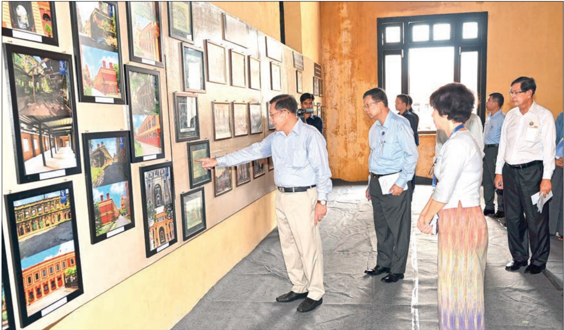
Senior General Min Aung Hlaing provides guidance while reviewing the display at the Minister's Office (formerly the Secretariat) in Yangon yesterday.

The Senior General emphasized that excerpts from General Aung San's speeches should be presented in a way that is clear