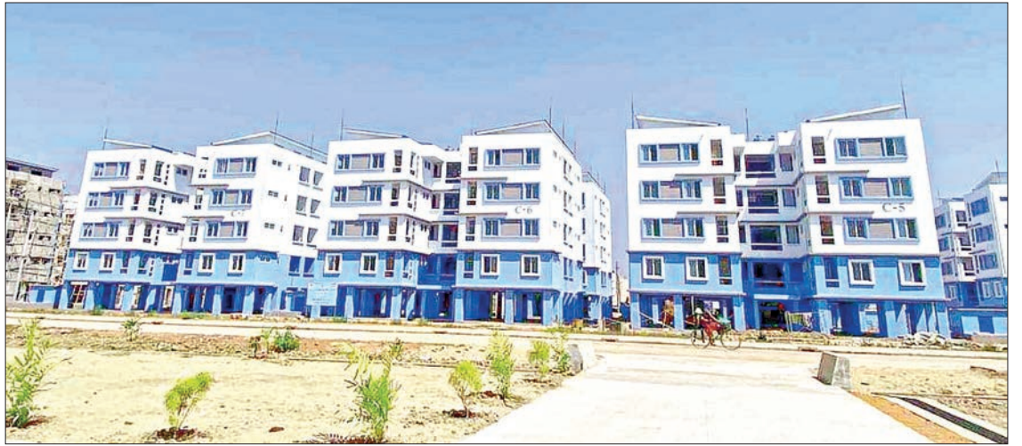
Flats under development at Yoma Yadana Housing in Yangon Region.

Recipients must present their original and a copy of their citizenship scrutiny card along with a household registration copy. Representatives must bring an authorization letter from the flat winner, copies of the winner's CSC and household list, and their own CSC and