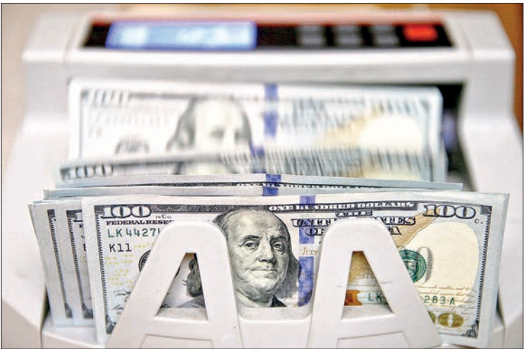
CBM aims to curb the instability in the foreign exchange market and currency devaluation.

THE Central Bank of Myanmar (CBM) sold US$36.5 million purchased from companies working on a Cut, Make and Pack basis, in addition to the injection of $8.8 million, 13.3 million baht, 10.5 million yuan and 500,000 rupees in July. Furthermore, CBM sold over $2.3 million to other companies out of $10 million that CBM announced to sell. CBM sold over $1.247 million to edible oil-importing companies and $230,000 to fuel oil-importing companies on 31 July, in addition to an injection of 771,953 baht.