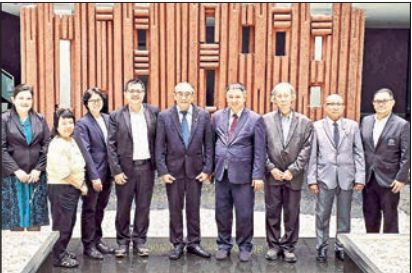
Myanmar, Thailand sign MOU to strengthen media cooperation