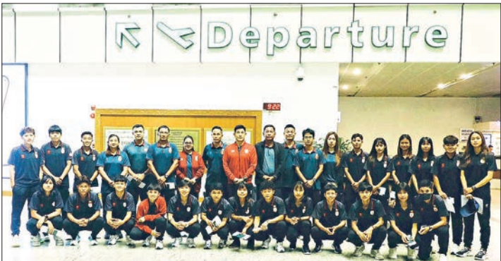
The Myanmar Women's national football team is seen before departing for Vietnam.