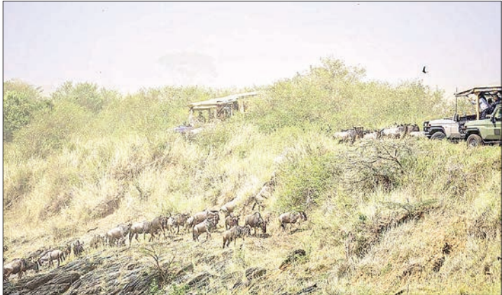
Wildebeests reach the opposite bank of the Mara River in the Masai Mara National Reserve in Kenya on 30 July 2025.

The HKSAR government will work with the industries to land more mega events and spur consumption, said the financial secretary. — Xinhua