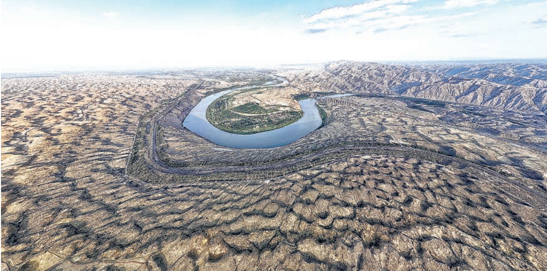
This aerial photo taken on 6 September 2023 shows the Yellow River flowing through Shapotou District in Zhongwei City, northwest China's Ningxia Hui Autonomous Region.

ious heterotrophic microorganisms. They constitute the main soil surface cover in drylands and play an important role in ecological, hydrological and soil processes and biogeochemical