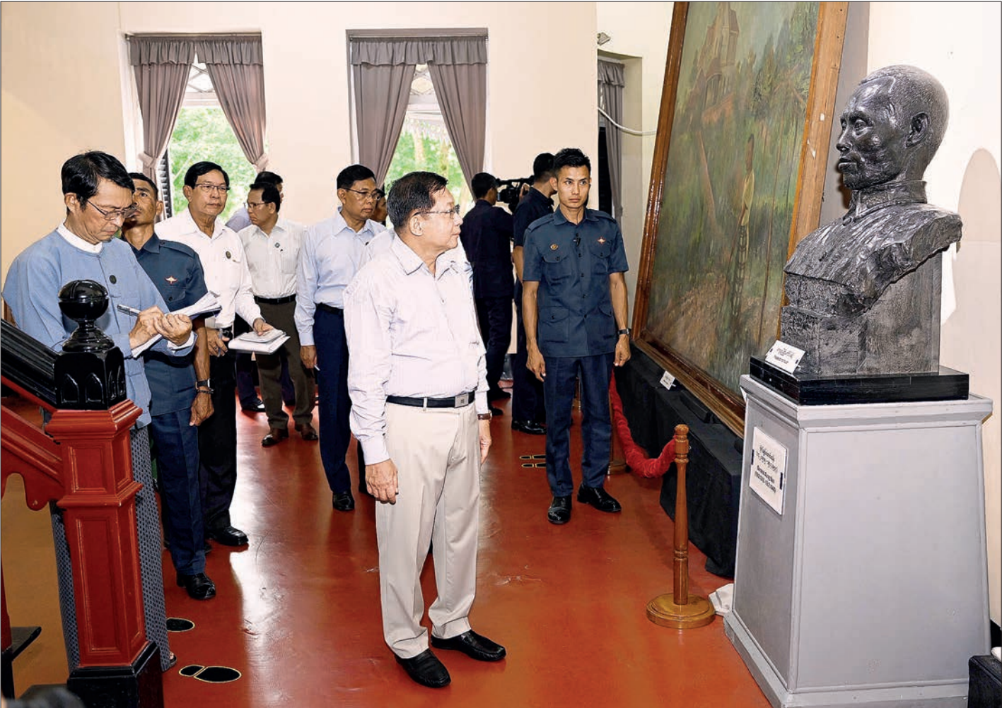
Senior General Min Aung Hlaing, Chairman of the State Security and Peace Commission of the Republic of the Union of Myanmar, views around the exhibits at the Bogyoke Aung San Museum (Yangon) yesterday.

Historical photographs and documents illustrating the timeline should be digitally enhanced and displayed using modern technology for improved clarity and sharpness.