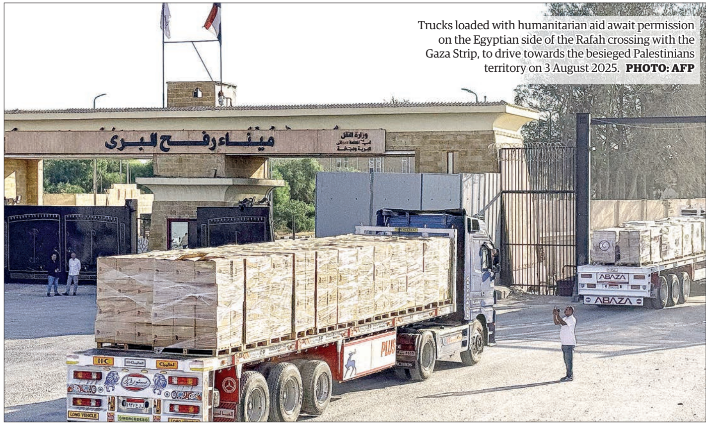
Trucks loaded with humanitarian aid await permission on the Egyptian side of the Rafah crossing with the Gaza Strip, to drive towards the besieged Palestinians territory on 3 August 2025.

ISRAELI Prime Minister Benjamin Netanyahu appealed to the International Committee of the Red Cross on Sunday for help aiding hostages in Gaza, as outrage built at videos showing two of them emaciated.