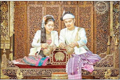
Myanmar youth show growing interest in traditional attire