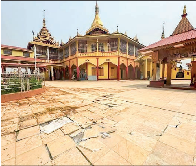
This photo reveals the damage to the Inlay PhaungdawOo Pagoda in the Mandalay earthquake.

THE square and main temple of the Inlay PhaungdawOo Pagoda, which was affected by the recent Mandalay earthquake, will be repaired before the upcoming Pagoda Festival, according to the Inlay Pagoda Board of Trustees. The earthquake damaged several key structures, including the main temple, the pagoda square, the Kara-weik-shaped barge, and the buildings where it is docked.