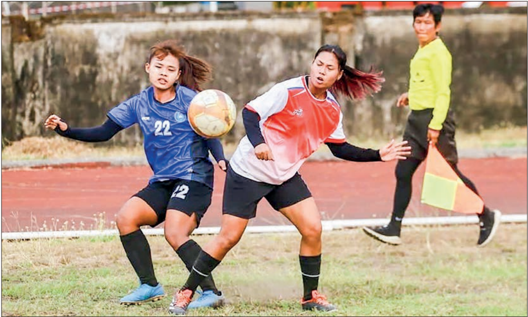
Players of the ISPE and Thitsa Arman women's football clubs are seen in a tune-up match.

Serie A also postponed matches in its youth league. The Italian football federation (FIGC) announced that all games across professional and amateur football on Monday would be rescheduled to a later date. The FIGC hailed the Pope as "an example of Christian charity and dignity in suffering, always close to the world of football". The Vatican said Pope Francis, a keen football fan, died aged 88 on Monday. — AFP