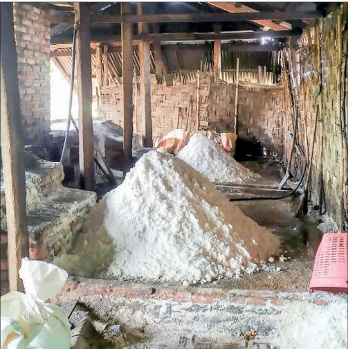
Salt stored due to heavy rain is seen in a warehouse.

duction and higher demand, the price of raw salt went up to K 500 per viss.