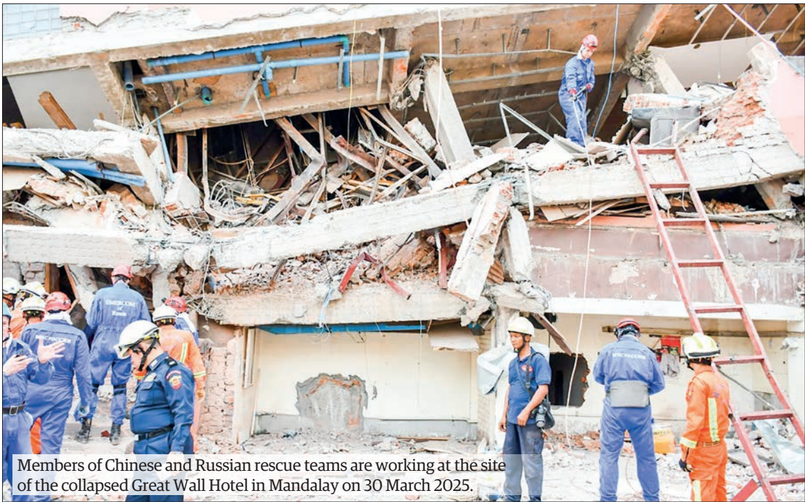
Members of Chinese and Russian rescue teams are working at the site of the collapsed Great Wall Hotel in Mandalay on 30 March 2025.

Restoring and protecting ecosystems is now more crucial than ever. Healthy ecosystems are vital—they provide clean air, freshwater, and food, and help regulate the climate. They also support biodiversity and act as natural buffers against environmental shocks. By restoring damaged ecosystems, we can help combat climate change, alleviate poverty, and prevent species extinction.