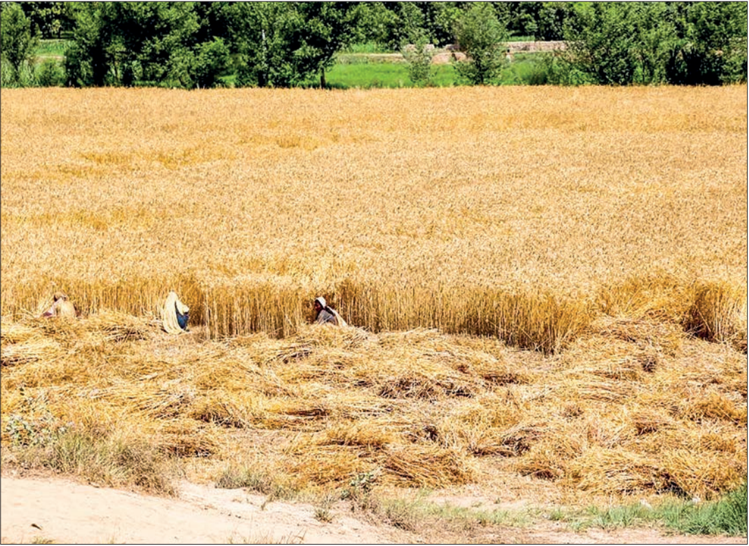
Farmers harvest wheat at a field in Multan, Pakistan on 20 April 2025.

Despite the overall surplus, the oil and gas sector posted a deficit of $1.67 billion, largely due to crude oil and oil product imports. — Xinhua