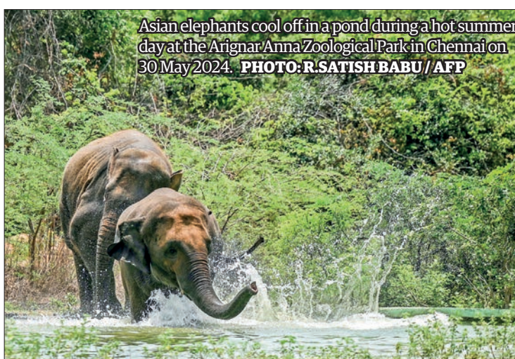
Asian elephants cool off in a pond during a hot summer day at the Arignar Anna Zoological Park in Chennai on 30 May 2024.

There are fewer than 50,000 Asian elephants in the wild, according to the World Wildlife Fund. The majority are in India,