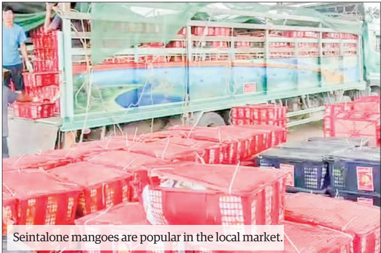
Seintalone mangoes are popular in the local market.

“A mango basket price is between K50,000 and K60,000 in the local market, equivalent to 130-140 yuan in China (Tarlots), but it is not easy to get this price there. So, the domestic market has the advantage,” said the fruit wholesale centre. Farmers have now hoped for the Wanton market if the production increases. Due to the long journey, two nights and three days, mangos are not durable, and the production has declined this year; and the local and foreign demand has also fallen. – MT/ZS