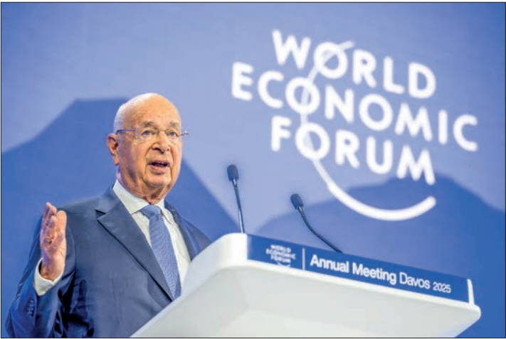
(FILES) World Economic Forum founder and chairman Klaus Schwab attends a session during the World Economic Forum (WEF) annual meeting in Davos on 21 January 2025.

THE World Economic Forum said on Monday that its founder Klaus Schwab has stepped down from the board, turning a page in the history of the organization that hosts the annual meeting of wealthy, famous and influential global elites at the luxury Swiss ski resort of Davos. Schwab informed the WEF's board that "as I enter my 88 th year, I have decided to step down from the position of Chair and as a member of