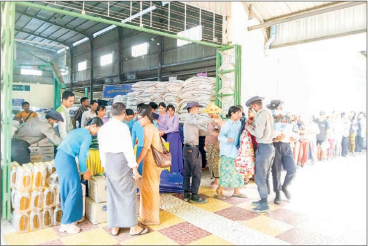
Quake survivors receive international aid and medicines.

Fifty-two vehicles transported aid to Mandalay Region via Yangon and Nay Pyi Taw, with additional items arriving directly at Mandalay (TadaU) International Airport and distributed under the Mandalay Region Government's plan.