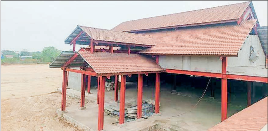
A general view of the KBZ Centre Mandalay, which is under construction.