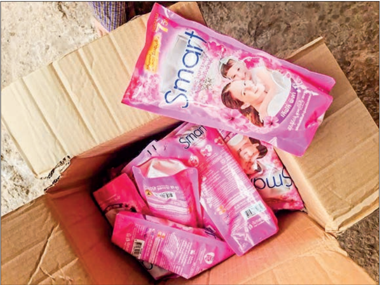
Confiscated illegal commodities.

ly worth K7.344 million without any documents from a Higer Bus worth K60 million at the Mayanchaung permanent checkpoint on 21 April. Action was taken against offenders for their illegal and smuggled goods under the Forest Law and Customs procedures. On 18 and 21 April, combined teams seized illegal goods approximately valued at K71.46 million in 11 cases. — MNA/TTA