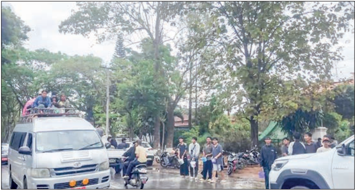
This photo reveals people visiting PyinOoLwin during Thingyan.

IN PyinOoLwin, Taunggyi and Kalaw, visitor arrival was large during the Thingyan holidays and hasn't stopped until now, according to tour operators. Those who want to take a break avoided travelling in the Thingyan period, but they have just started their vacation after Thingyan, said a travel planner. "These destinations were packed with many visitors during the Thingyan period. But some don't like travelling among