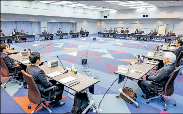
A subcommittee of the Justice Ministry’s Legislative Council meets for the first time in Tokyo on 21 April 2025 to review Japan’s criminal retrial system.

The kingdom is renowned for four UNESCO-listed world heritage sites, namely the Angkor Archaeological Park in northwestern Siem Reap province, the Temple Zone of Sambor Prei Kuk in central Kampong Thom province, and the Temple of Preah Vihear and the Koh Ker archaeological site in northwestern Preah Vihear province. — Xinhua