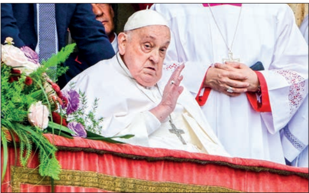
Pope Francis waves to the crowd from the main balcony of St Peter's basilica during the Urbi et Orbi message and blessing to the city and the world as part of Easter celebrations, at St Peter's square in the Vatican on 20 April 2025.

Former US president Joe Biden said Francis was "unlike any who came before him", hailing his record of fighting for peace and equity.