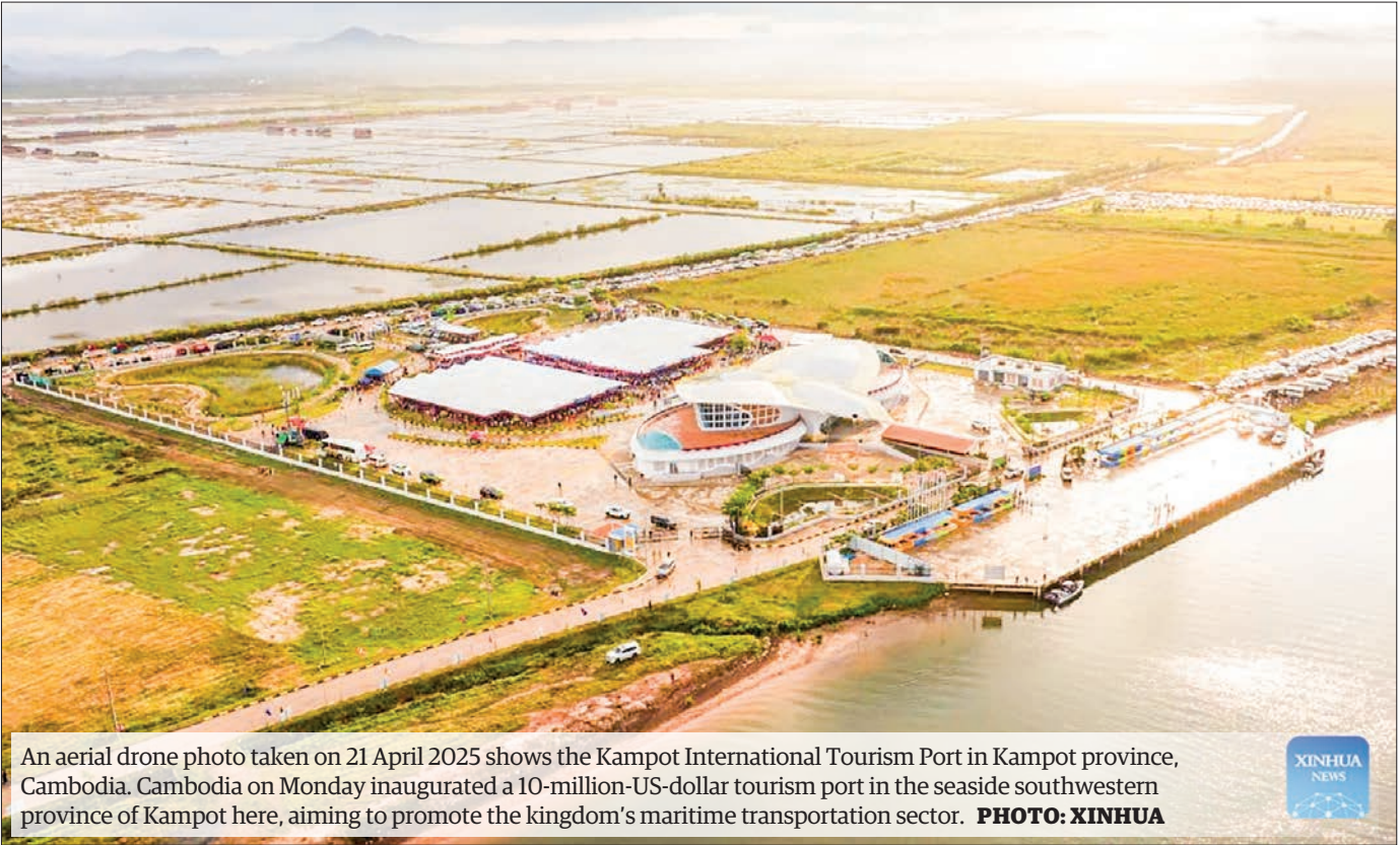
An aerial drone photo taken on 21 April 2025 shows the Kampot International Tourism Port in Kampot province, Cambodia. Cambodia on Monday inaugurated a 10-million-US-dollar tourism port in the seaside southwestern province of Kampot here, aiming to promote the kingdom’s maritime transportation sector.

As part of Hamamatsu’s new campaign, the two local railway operators began sales of one-day unlimited ride passes featuring images of the main character Shinji Ikari and fellow pilot Kaworu Nagisa.