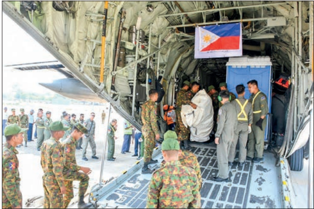
From the AHA Centre.