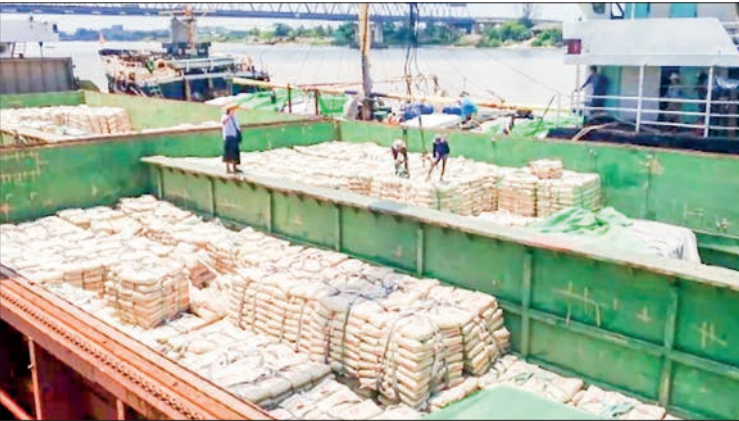
Cement bags are seen being unloaded at the Shweme Port, Shwepyitha Township.

For resettlement activities in the Mandalay Earthquake-affected regions and construction business operations across the country in summer, ships loaded