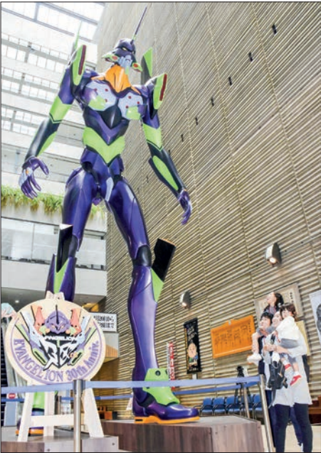
Visitors take a look at the roughly six-metre-tall Evangelion Unit 01 statue at the Hamamatsu city hall in Shizuoka Prefecture on 20 April 2025.

About 170 people lined up in front of the municipal headquarters to see the stat-