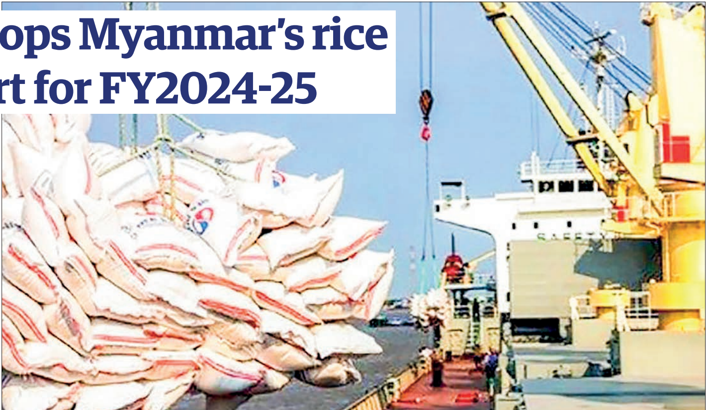
Export rice bags being loaded onto an international merchant vessel at Yangon Port.

Indonesia dominates Myanmar's rice exports with over 605,000 tonnes, outpacing China and other major importers in the financial year 2024-2025.