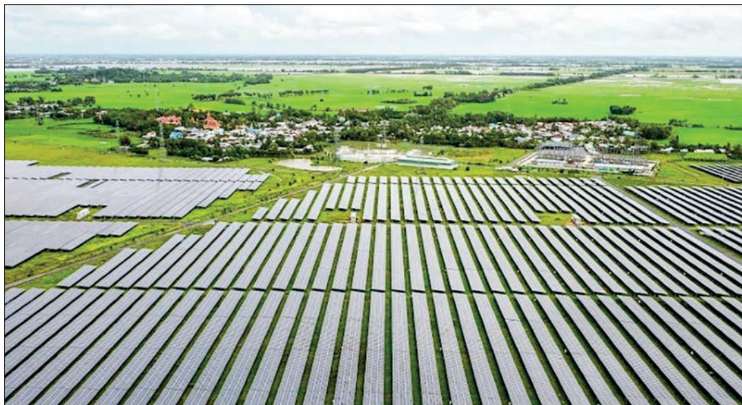
Vietnam has revised its national power plan to significantly increase wind and solar energy targets by 2030 to meet rising energy demand.

The country aims for net-zero carbon emissions by 2050, as outlined in its Power Development Plan 8 (PDP8).