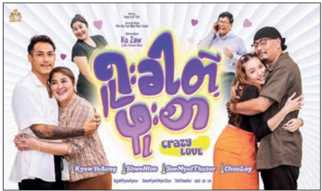
This photo showcases the poster for the film 'Crazy Love'.