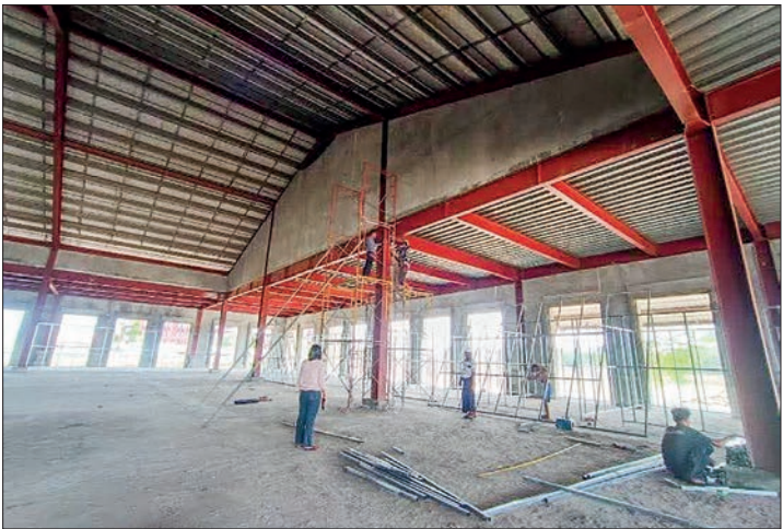
The Centre is under construction.

KBZ Centre Mandalay will be equipped with a 24-hour call centre, an information and administration centre, medical and first aid points, doctor consultation rooms, meeting rooms, rest areas for doctors and nurses, ECG and ultrasound facilities, a blood collection room, a medication distribution room, and health education rooms. The centre aims to ensure uninterrupted access to clean water, electricity, food, and essential medicines for the public. Additionally, the centre will include a minor surgery room, a