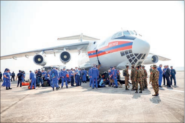
From the Russian Federation.