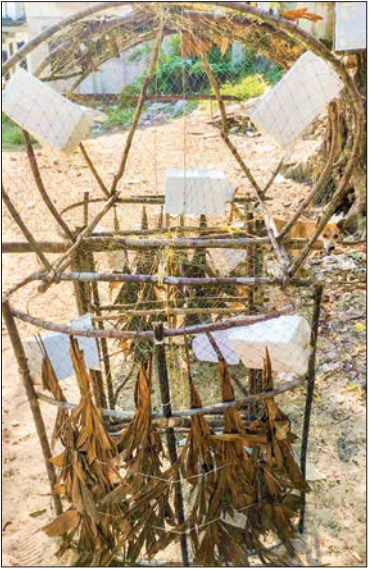
Photos depict Salon people venturing to sea for squid fishing – they rely on it for their living.