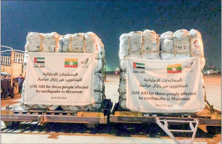
From the UAE.