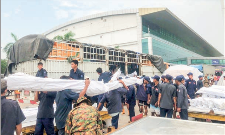
Relief items from Vietnam.

The attached tables detail the distribution of foreign-donated aid to victims in Shan State (South), Mandalay Region, Sagaing Region, and Nay Pyi Taw. Weekly updates will continue to report on the arrival of further international relief and its distribution to those affected by the earthquake. — MNA/MKKS