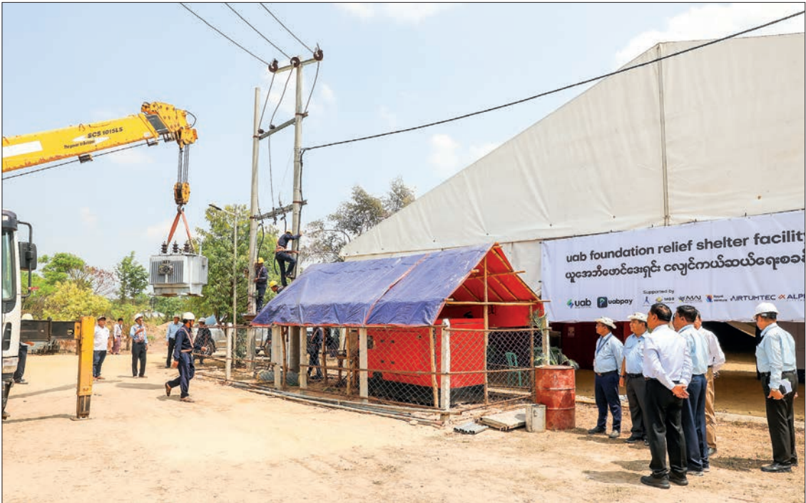
SAC Member, Deputy Prime Minister, Union Minister Admiral Tin Aung San inspects repair work in Nay Pyi Taw yesterday.

The Ministry of Electric Power has arranged electrification for nine temporary camps for staff families in the Nay Pyi Taw Council Area.