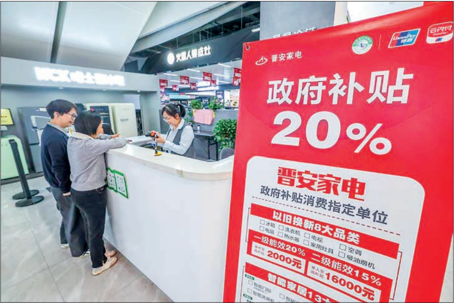
Customers apply for subsidies under the trade-in programme for consumer goods in Hangzhou City, east China’s Zhejiang Province, 31 October 2024.

CHINA’S wholesale and retail sectors have logged strong momentum in the first three months of 2025, providing solid support for expanding domestic demand in the country, the commerce ministry said on Monday. From January to March, the added value of China’s wholesale and retail trade grew by 5.8 per cent from a year earlier to reach 3.3 trillion yuan (about US$457.98 billion), or 10.4 per cent of the country’s gross domestic