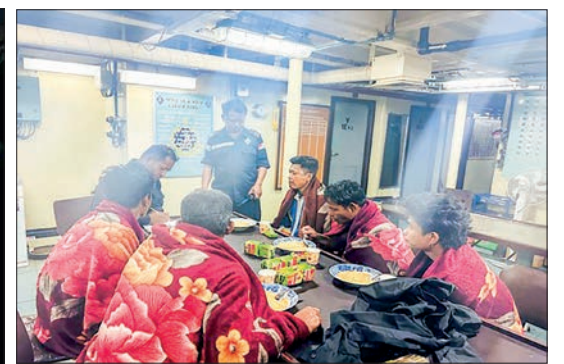
Photos capture security forces aiding rescued crew members from a submerged cargo ship near Gwa, Rakhine State.

NAVAL personnel conducting security operations in Myanmar's territorial waters near Gwa Township, Rakhine State, responded to an emergency involving a sinking cargo vessel.