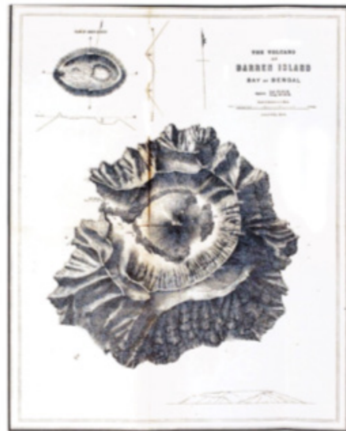
Topography of Barren Island.

My Lord *** After examining Diligent Strait and the archipelago, I proceeded to Barren Island and found the volcano in a violent state of eruption, throwing out showers of red-hot stones and immense volumes of smoke. There were two or three eruptions while I was close to the foot of the cone; several of the stones rolled down and bounded a good way past the foot of it. After a diligent search, I could find nothing of Sulphur or anything that answered the description of lava. *** I have, &c. "Archibald Blair".