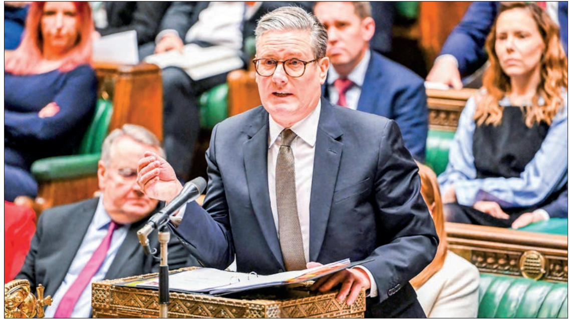
A handout photograph released by the UK Parliament shows Britain's Prime Minister Keir Starmer speaking during the weekly session of Prime Minister's Questions (PMQs) at the House of Commons in London on 5 February 2025.

to deliver change," said Starmer, whose party came to power in July following 14 years of Conservative rule.