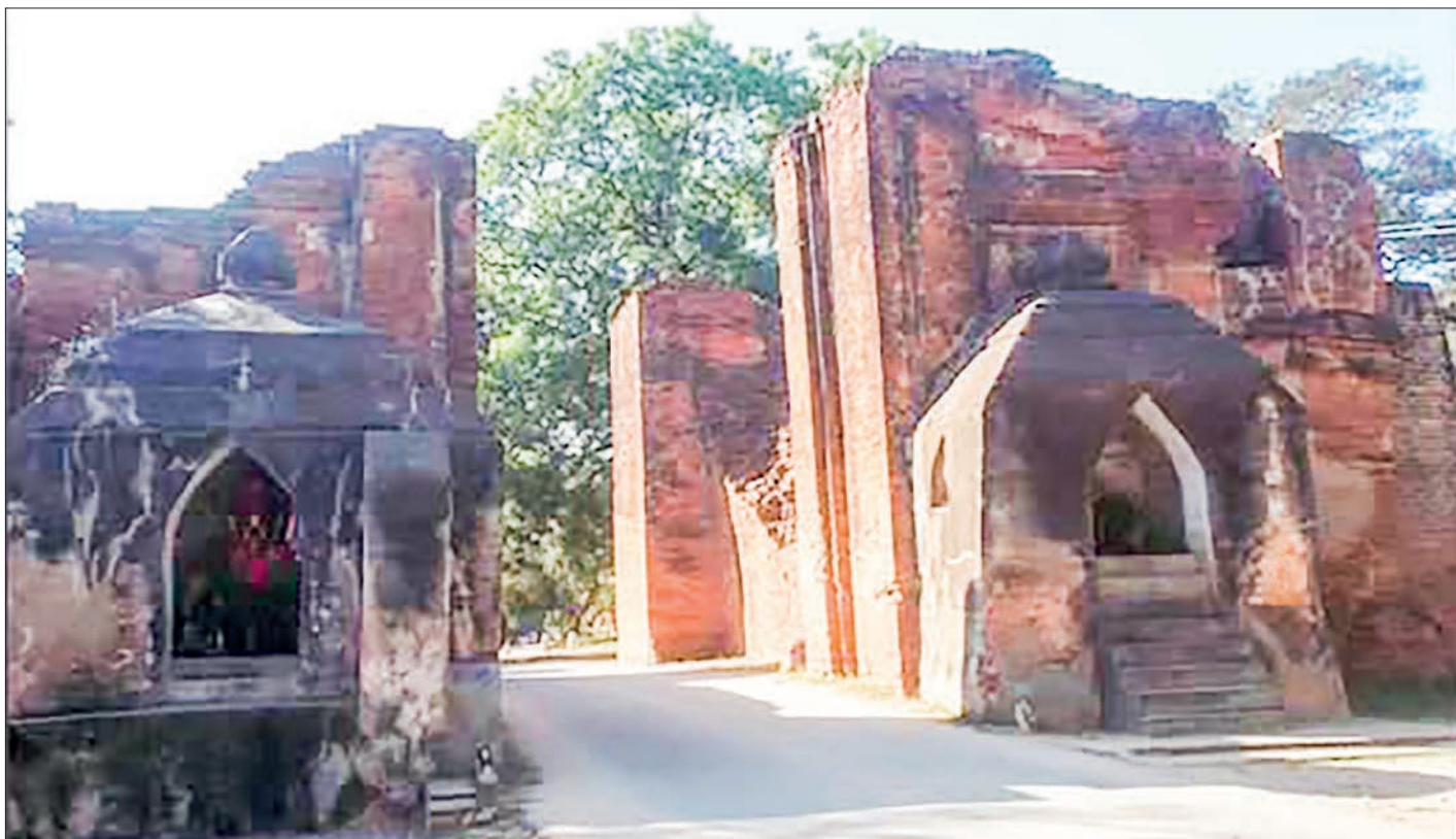
This photo reveals the Tharapa Gate in the Bagan Ancient Cultural Heritage Zone.