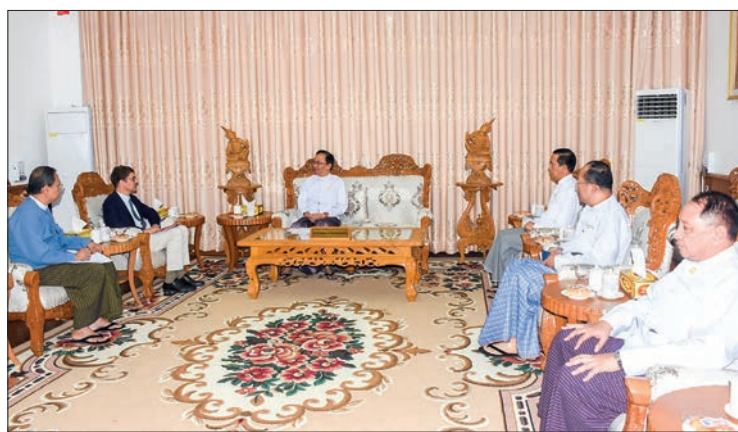
The ICRC Resident Representative calls on Union Minister Dr Thet Khaing Win yesterday.