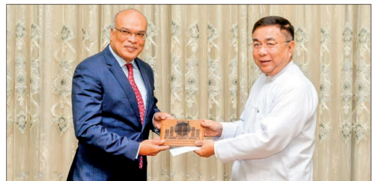
Union Minister Dr Nyunt Pe exchanges gifts with the Bangladeshi ambassador.