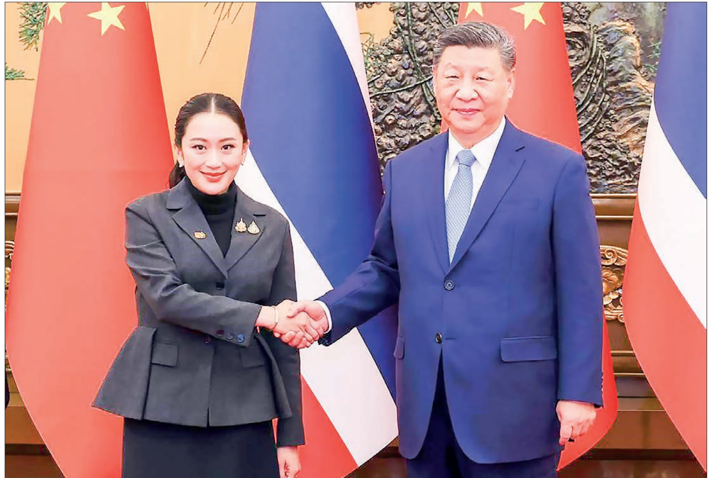
Chinese President Xi Jinping meets Prime Minister of Thailand Paetongtarn Shinawatra, who is on an official visit to China, at the Great Hall of the People in Beijing, capital of China, 6 February 2025.

Chinese President Xi Jinping welcomed Thai Prime Minister Paetongtarn Shinawatra in Beijing, celebrating 50 years of diplomatic relations.