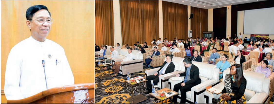
Union Minister Dr Soe Win delivers the opening speech at the OAOR Roadshow workshop yesterday.

THE One ASEAN One Response (OAOR) Roadshow workshop jointly organized by the Ministry of Social Welfare, Relief and Resettlement and the AHA Centre was held yesterday