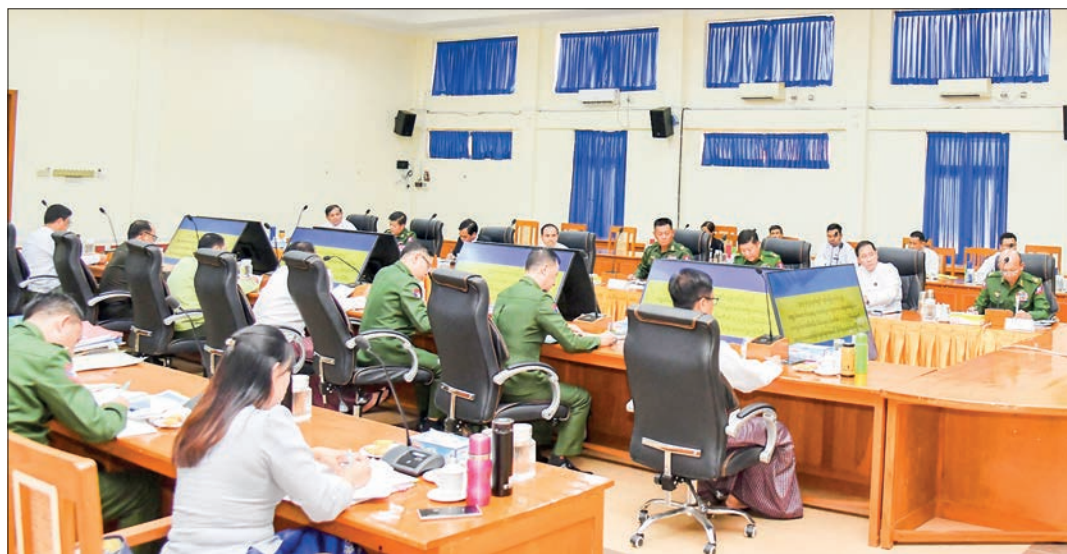
The first meeting of the Committee on the Prevention of Recruitment of Child Soldiers in progress yesterday, chaired by SAC Member Deputy PM MoD Union Minister General Maung Maung Aye.

Speaking at the meeting, the Union Minister, who is also chairman of the committee, emphasized that 597 underage soldiers who were mistakenly recruited before reaching the age of majority between 2004 and 2012 have been allowed to be withdrawn from Tatmadaw before the cooperation with the Country Task Force on Monitoring and Reporting-CTFMR. Then, the government signed a Plan of Action with CTFMR in 2012. After that collaboration, 1,057 underage soldiers who were mistakenly recruited have been allowed to be with-