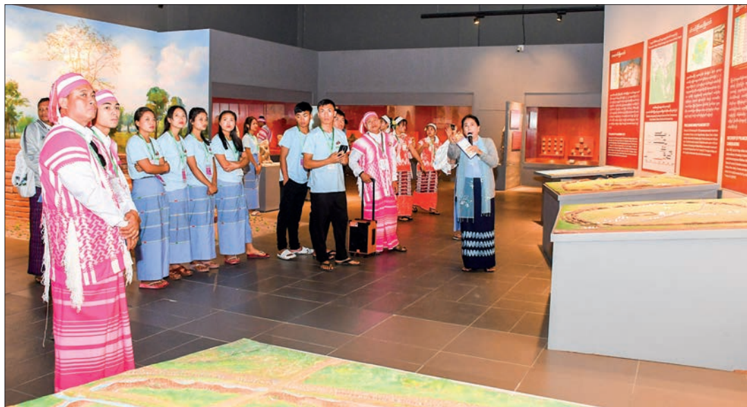
Regional and state ethnic cultural troupes are pictured during their observation tours in Nay Pyi Taw.

MEMBERS of ethnic traditional culture troupes from different regions and states currently in Nay Pyi Taw to attend the 78 th Anniversary of the Union Day celebration 2025 visited the well-known sites in Nay Pyi Taw yesterday.