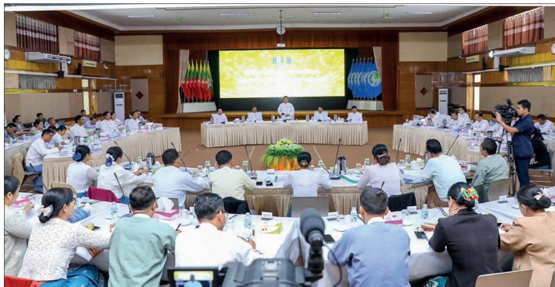
The meeting between Union Minister U Maung Maung Ohn and regional and state IPRD departmental heads in progress yesterday in Nay Pyi Taw.

He also highlighted the guidance of the Head of the State to hold raising reading habit and