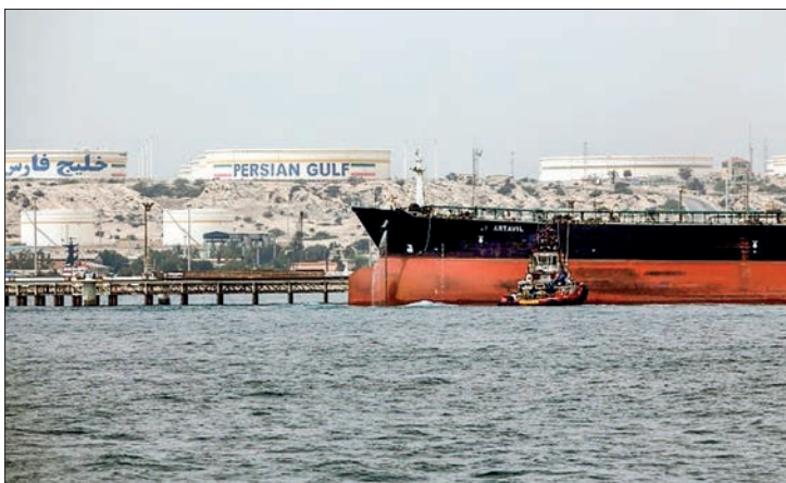
Iranian President Masoud Pezeshkian urged OPEC members to unite against US pressure during a meeting with Secretary-General Haitham Al Ghais.

For his part, Al Ghais praised Iran for its “constructive” role in the organization, noting that as a founding member, the country has always played a “positive” role in OPEC.