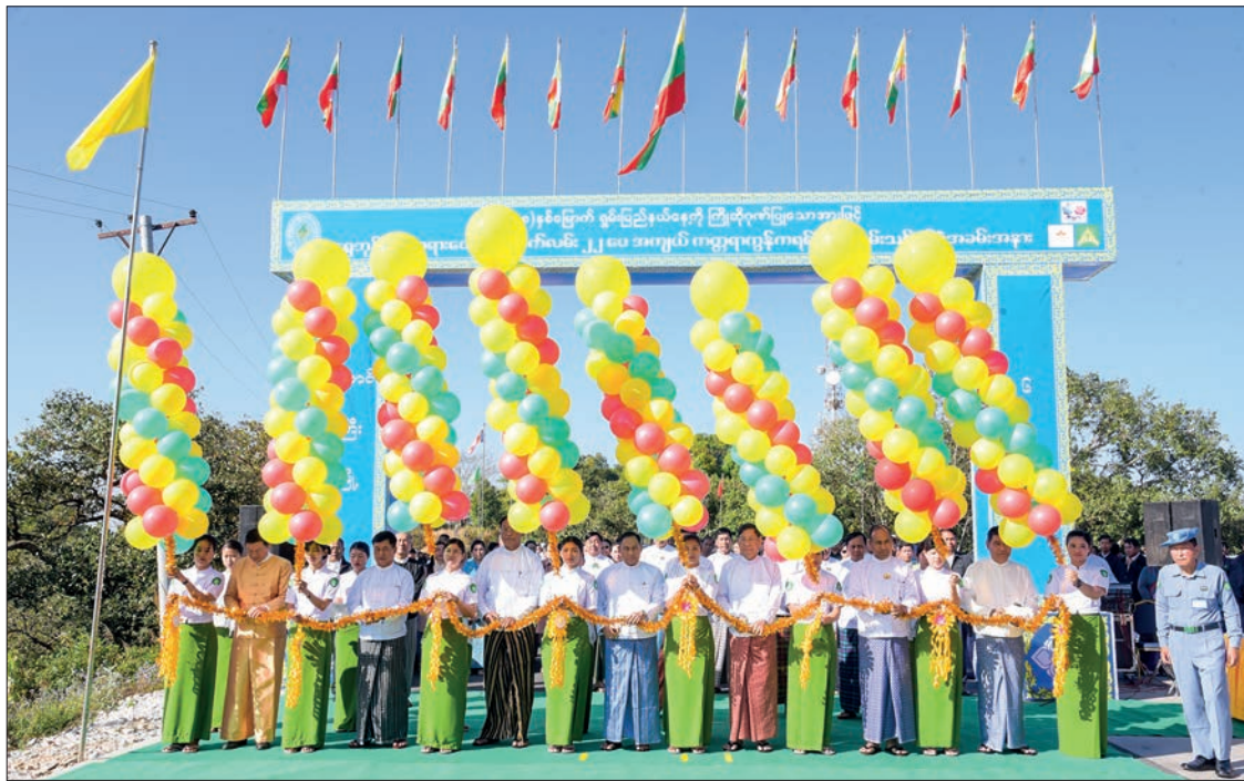
The inauguration event of the access road to the Shwephonepwint Pagoda underway yesterday in Taunggyi, attended by Union Minister Lt-Gen Yar Pyae.

The attendees then made floral and oil lamp offerings at