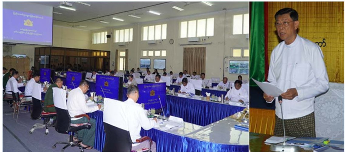
The second coordination meeting of the Industrial Development Commission in progress yesterday, chaired by SAC Member Deputy PM MoTC Union Minister General Mya Tun Oo.

He also emphasized the matters related to proper support to local industrial entrepreneurs to produce profitable products, quick access to raw materials, energy, finance, human resources and technologies for import substitute industrial businesses, and the duties of the commission — to promote local manufacturing industry, to ensure domestic consumption, to export, to produce