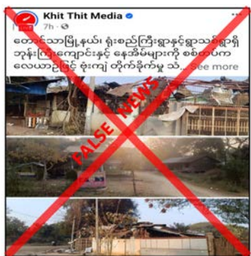
This screenshot discloses misinformation.

A subversive media outlet fabricated a false report, alleging that security forces carried out airstrikes on Yonesigy and Ywathit villages in Taungtha Township, Mandalay Region, injuring a monk and another