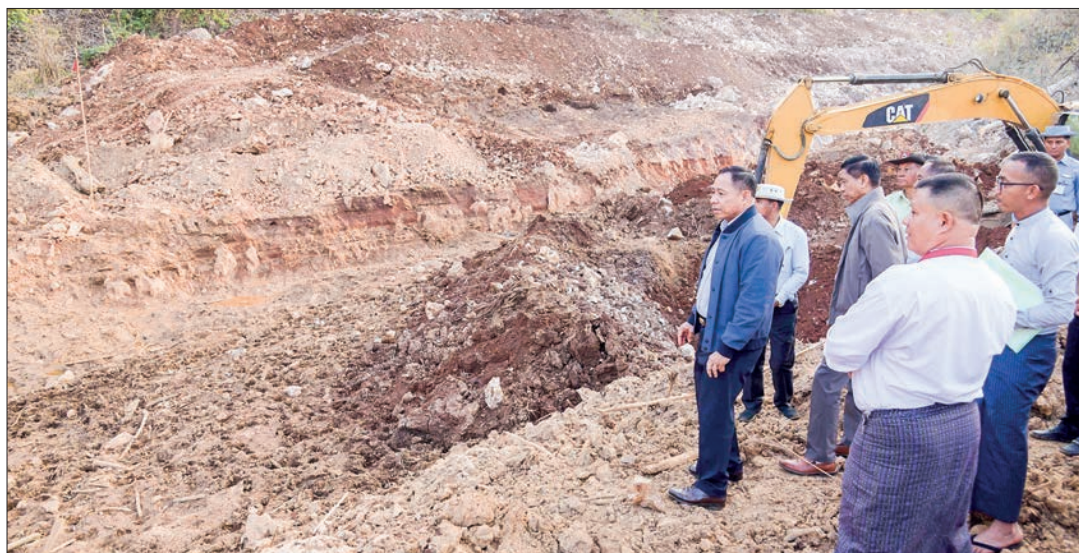
SAC Member MoBA Union Minister Lt-Gen Yar Pyae views natural disaster-affected Kalaw Creek land area.

STATE Administration Council Member Union Minister for Border Affairs Lt-Gen Yar Pyae, accompanied by officials, inspected the completed measurement of the original Kalaw Creek land area, affected by a natural disaster, near Kalaw railway station, in Kalaw Township on 5 February.