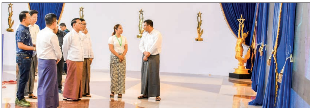
Union Minister U Maung Maung Ohn views the preparatory work for the 2024 Myanmar Film Academy Awards Ceremony.

THE 2024 Myanmar Motion Pictures Academy Awards ceremony is set to take place grandly on 9 February at the Myanmar International Convention Centre I in Nay Pyi Taw. In preparation for the event, Union Minister for Information U Maung Maung Ohn, who also chair the organizing committee, inspected the ongoing preparations yesterday evening alongside relevant officials.