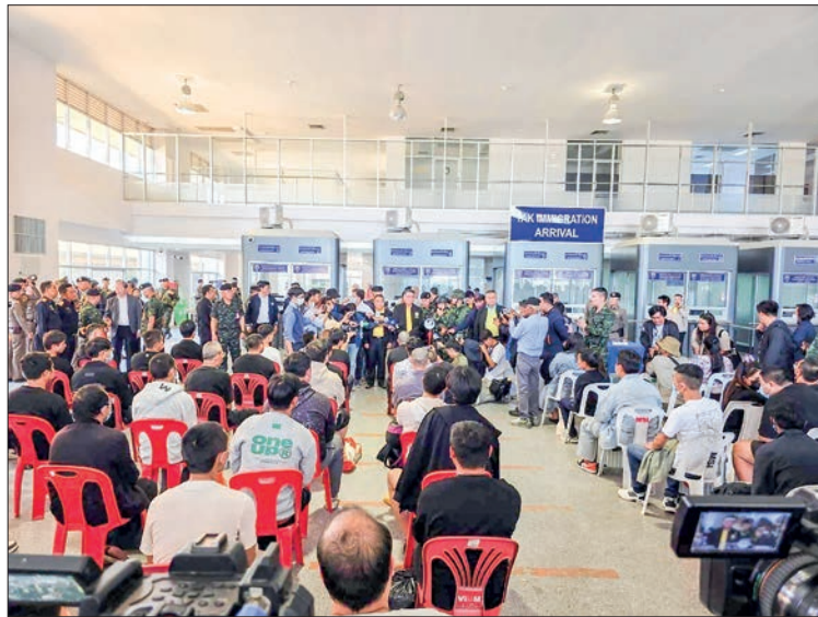
Photos depict systematic procedures in progress to hand over undocumented immigrants who entered Myanmar illegally.

THE government of Myanmar continues its decisive actions against online fraud and illegal activities, particularly those involving individuals who enter the country without proper documentation. Efforts are underway to identify and deport such individuals to their respective countries.