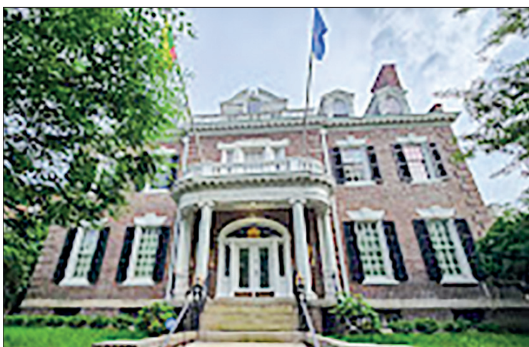
This photo shows the Myanmar Embassy in Washington, DC.

The host country has also advised them to leave before deportation if they are undocumented or illegal immigrants. Myanmar citizens who do not have any travel documents to return to Myanmar or whose passports have expired can apply for a certificate of identity. The embassy said the application form and requirements can be found on the embassy's website and can be contacted via email or phone. — MT/ZN