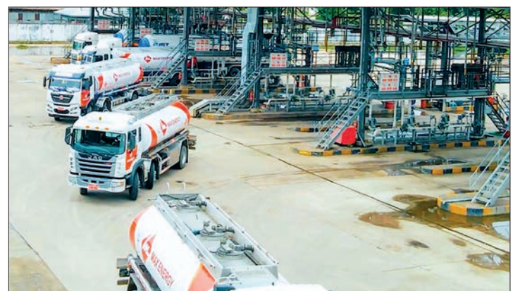
A line of bowsers departs the oil tanker terminal, heading for distribution across states and regions.

Similarly, the price of palm oil has been continuously decreasing from the previous reference price of K7,280 per viss to K7,165 this week and will be sold at a reasonable price domestically in line with international price changes, with the committee adjusting the prices weekly. — MNA/TH