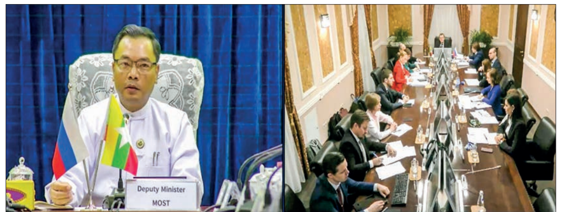
The second meeting of the Myanmar-Russia Joint Coordination Committee on Cooperation in the Utilization of Nuclear Energy for Peaceful Purposes in progress online on 5 February 2025.