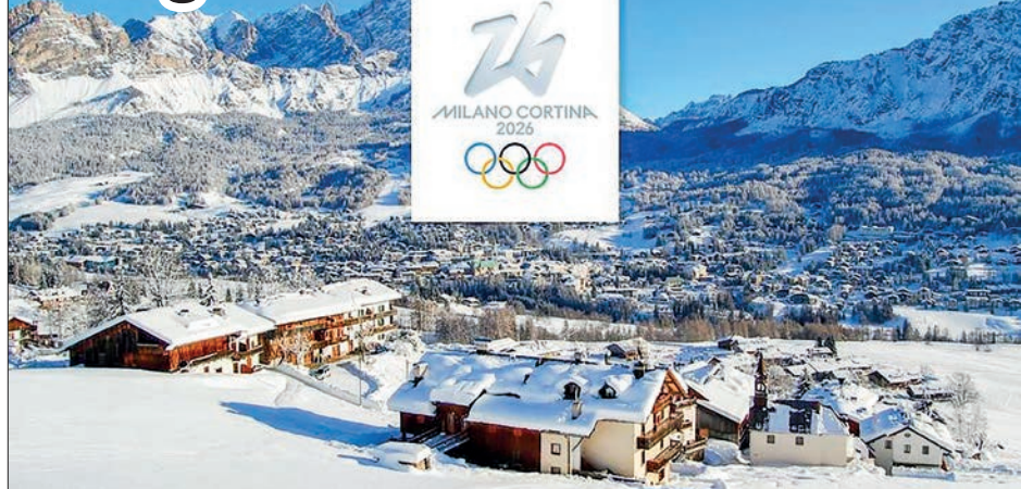
The 2026 Winter Olympic Games will be jointly held in Milan and Cortina d'Ampezzo.

THE International Olympic Committee (IOC) released Wednesday an article titled "One Year to Go: Milano Cortina 2026 - Rooted in history, looking boldly to the future", stressing on the role of the Games in showcasing Italy's sporting heritage and culture as its one-year countdown falls on Thursday.