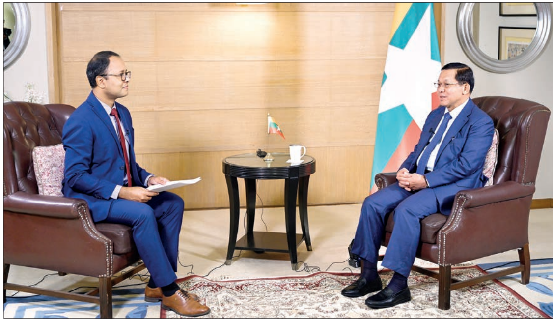
DD India News correspondent interviews Myanmar President U Min Aung Hlaing.

A: Yes, I think so. Buddhism in our country was introduced through India. Bodh Gaya is the place where the Buddha attained enlightenment. Myanmar is also one of the countries with the largest Buddhist populations, so Buddhism is held in very high regard. The people of Myanmar also deeply revere Buddhism, and Bodh Gaya in particular is a place that Myanmar people greatly respect and hold in high esteem. Personally, I have visited Bodh Gaya four times. Whenever