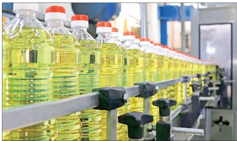
Cooking oil bottles are neatly arranged for sale.

CBM injected over $35 million, 34 million baht and over three million yuan in the foreign exchange market in February and over $43 million, 65 million baht and over