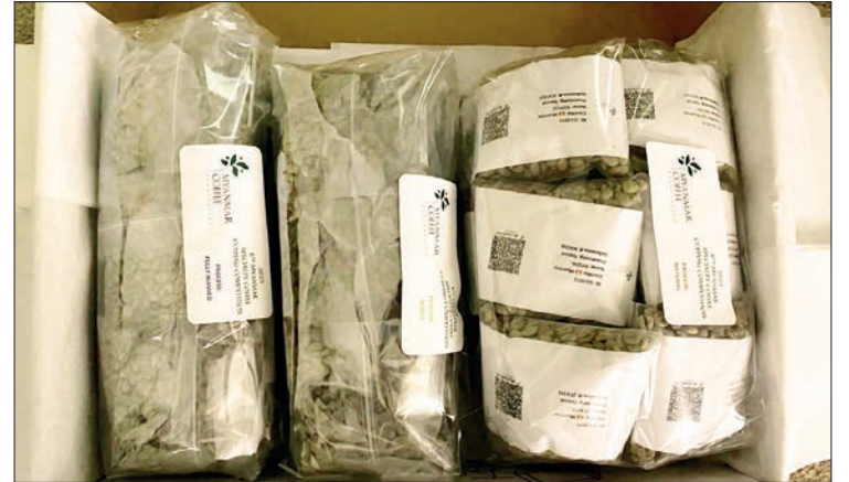
Coffee samples are seen during the 8 th Myanmar Coffee Cupping Competition.

THE 9 th Myanmar Coffee Cupping Competition will be held in June in PyinOoLwin (Local Round) and the United States (International Round).