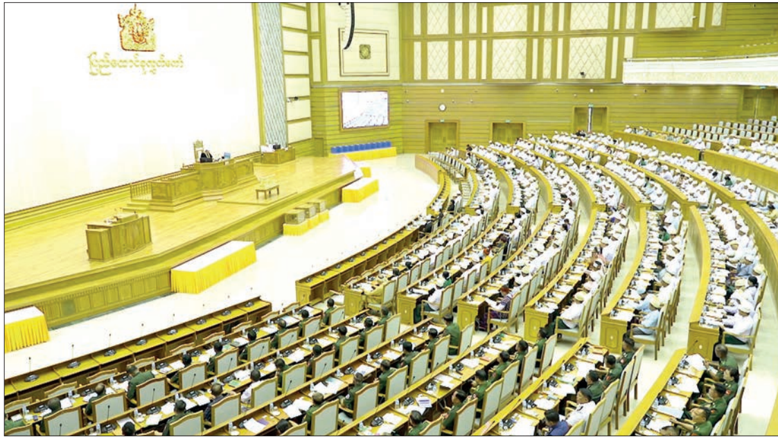
The second regular session of the Third Pyidaungsu Hluttaw is underway yesterday, presided over by Pyidaungsu Hluttaw Speaker U Aung Lin Dwe.

He said that, for the policies, strategies, and programmes adopted by the executive branch of the State Government to be implemented successfully, the mutual checks and balances, guidance, and cooperation of the legislatures, which constitute the legislative pillar of the State, play a vital role. He urged Hluttaw representatives to continuously monitor and assess whether planned projects and programmes in their respective constituencies are being imple-