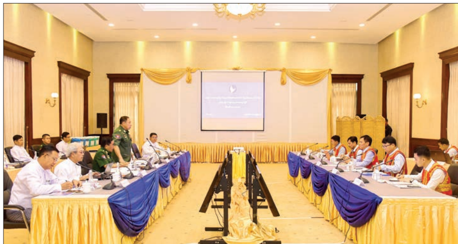
The National Solidarity and Peacemaking Negotiation Committee (NSPNC) and the Shanni Nationalities Solidarity Organization (SNSO) meet yesterday.