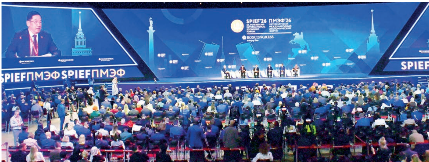
The 29 th Saint Petersburg International Economic Forum (SPIEF) is underway yesterday, attended by Vice-President U Nyo Saw.

V ICE-PRESIDENT U Nyo Saw attended the opening ceremony of the 29 th Saint Petersburg International Economic Forum (SPIEF) at the EXPOFORUM Convention and Exhibition Centre in Russia yesterday afternoon, Myanmar Standard Time.