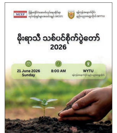
This image captures the monsoon tree planting festival 2026 to be held by MCEF and WYTU.

Businesses that wish to collaborate with MCEF in the tree-planting festival can contact the MCEF head office at the corner of Thanthuma Road and Waizayanta Road in