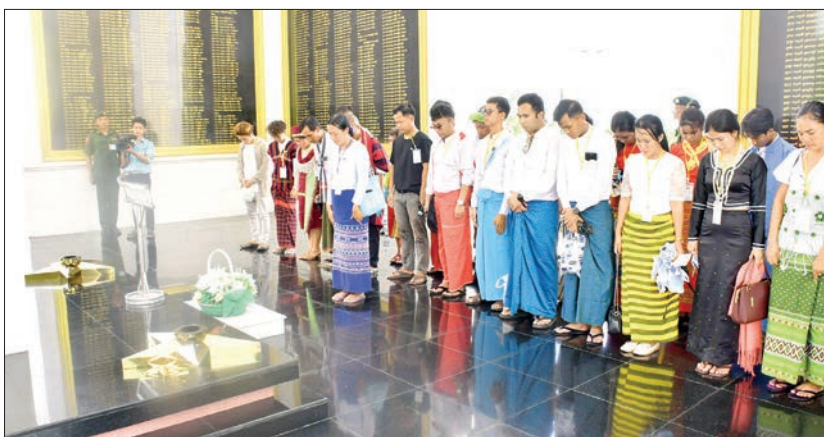
Members of Ethnic Literature and Cultural Associations are pictured during their observation tours in Nay Pyi Taw.

MEMBERS of Ethnic Literature and Cultural Associations, alongside administrators and officials from various Regions and States, visited landmarks in Nay Pyi Taw yesterday morning.