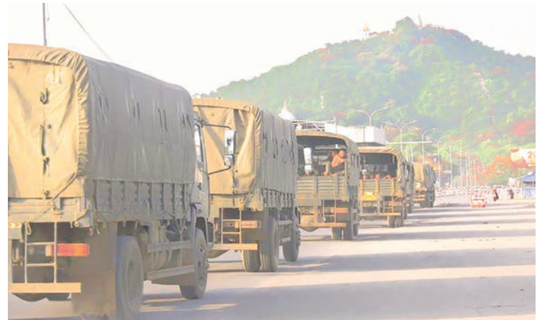
Return convoy heads to Mandalay from Myitkyina.

VEHICLES that transported essential development supplies along the Mandalay-Myitkyina route have returned to Mandalay after completing their second delivery mission, according to reports.