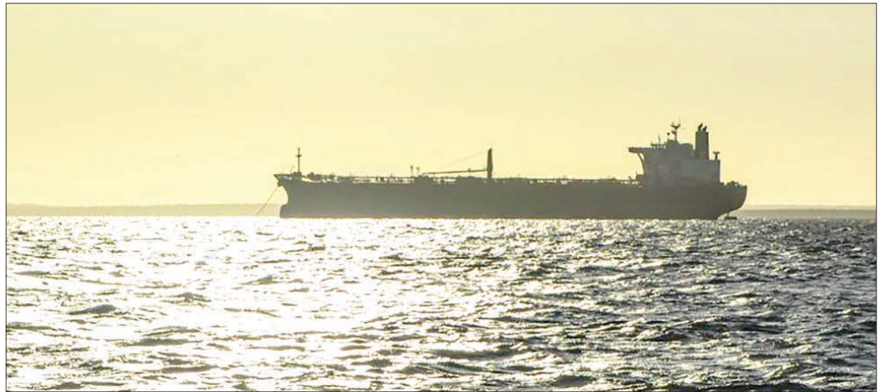
Photo taken on 23 December 2025 shows an oil tanker anchored in Lake Maracaibo, in the state of Zulia, Venezuela.

INDIA and Venezuela on Thursday held high-level discussions aimed at strengthening bilateral cooperation, with a strong focus on energy security and expanding economic