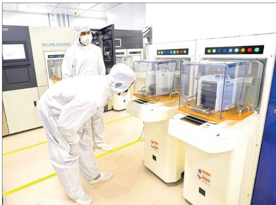
India's progress in areas such as artificial intelligence, semiconductors and global trade partnerships reflects its growing role in the international economy.

He noted that “India's progress in areas such as artificial intelligence, semiconductors and global trade partnerships reflects its growing role in the international economy.” — ANI