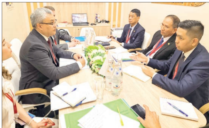
The Co-Chairs' Meeting of Myanmar-Eurasian Economic Commission Joint Working Group is in progress, attended by Union Minister U Aung Kyaw Hoe.

THE co-chairs' meeting of the Joint Working Group on Cooperation between Myanmar and the Eurasian Economic Commission was held yesterday. Led by the co-chairs – U Aung Kyaw Hoe, Union Minister for National Planning,