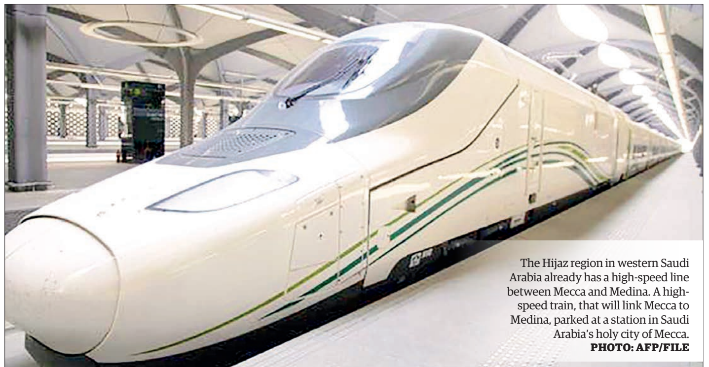
The Hijaz region in western Saudi Arabia already has a high-speed line between Mecca and Medina. A high-speed train, that will link Mecca to Medina, parked at a station in Saudi Arabia's holy city of Mecca.

In March 2026, Turkish Transport Minister Abdulkadir Uraloglu confirmed that Ankara was negotiating with Damascus to restore the historic Hejaz Railway section.