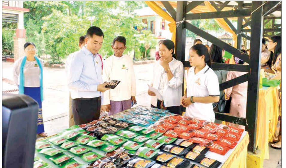
Officials view value-added products on display at yesterday's event.

MSME entrepreneurs attending the event then introduced themselves individually and presented the challenges they are facing in their businesses. The state minister coordinated and facilitated the necessary support measures and viewed the locally produced value-added products