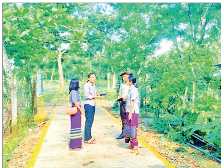
Officials inspect the completion of the concrete road construction project in Dala Township, Yangon Region.

The concrete road construction project was implemented with K15 million from the Village Development Project (VDP) fund and K3 million contributed by residents, bringing the total project cost to K18 million. With technical assistance and close supervision provided by the staff of the Dala Township Department of Rural Development, villagers themselves carried out the work starting from the second week of May this year. The project has now been completed in full and is expected to provide year-round transportation access for residents while also supporting the education sector in the village. — Maung Khaing (Rural)