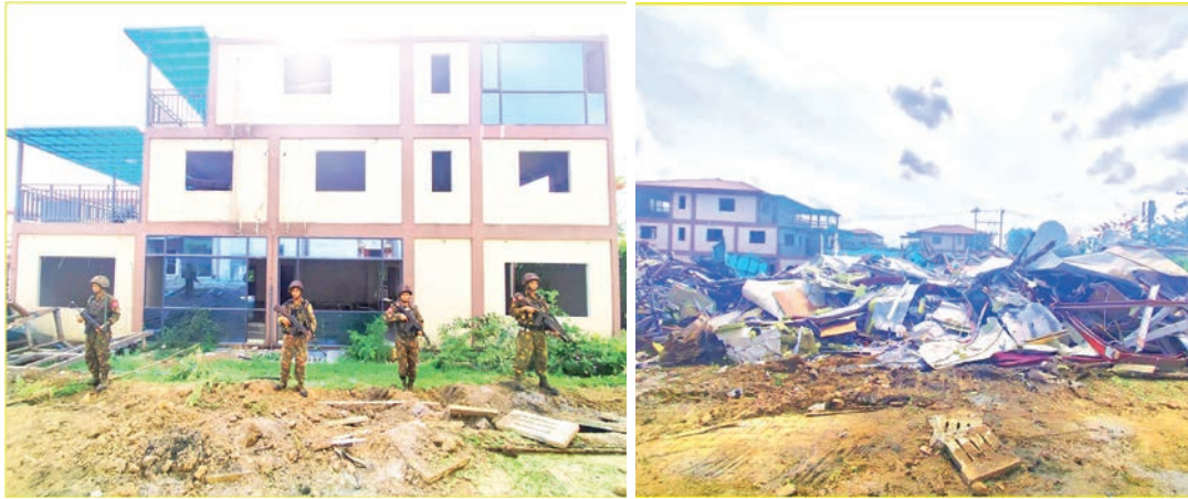
Images reveal the update before and after the demolition.

AUTHORITIES have continued dismantling illegal buildings used for online fraud and illegal gambling activities in Shwe Kokko.