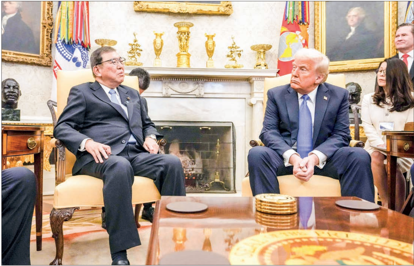
Japanese Prime Minister Shigeru Ishiba (L) holds talks with US President Donald Trump at the White House in Washington on 7 February 2025.

JAPANESE Prime Minister Shigeru Ishiba's first in-person meeting with US President Donald Trump ended without friction or conflicting remarks, potentially offering valuable insights for other world leaders navigating his vision for a new America.