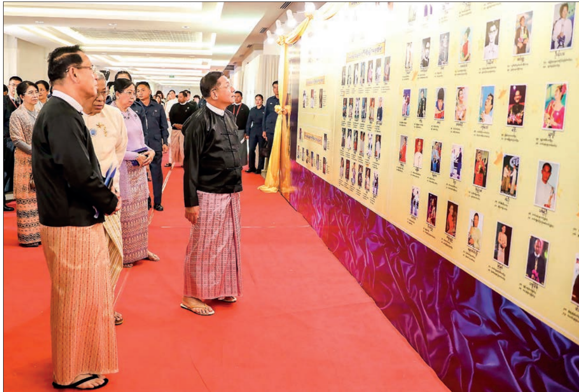
SAC Chairman Prime Minister Senior General Min Aung Hlaing and his wife Daw Kyu Kyu Hla view documentary photos bearing motion pictures outstanding award winners, films and outstanding artistes and technicians from 1952 to 2023 at Jade Hall of MICC I yesterday.

A special request is made to ensure that Myanmar's traditions and customs do not fade or disappear, to prevent the in-