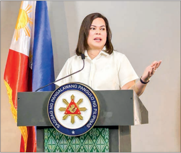
Philippine Vice President Sara Duterte speaks during a press conference in Manila on 7 February 2025.

She also told the press that she is considering running in the 2028 presidential election.