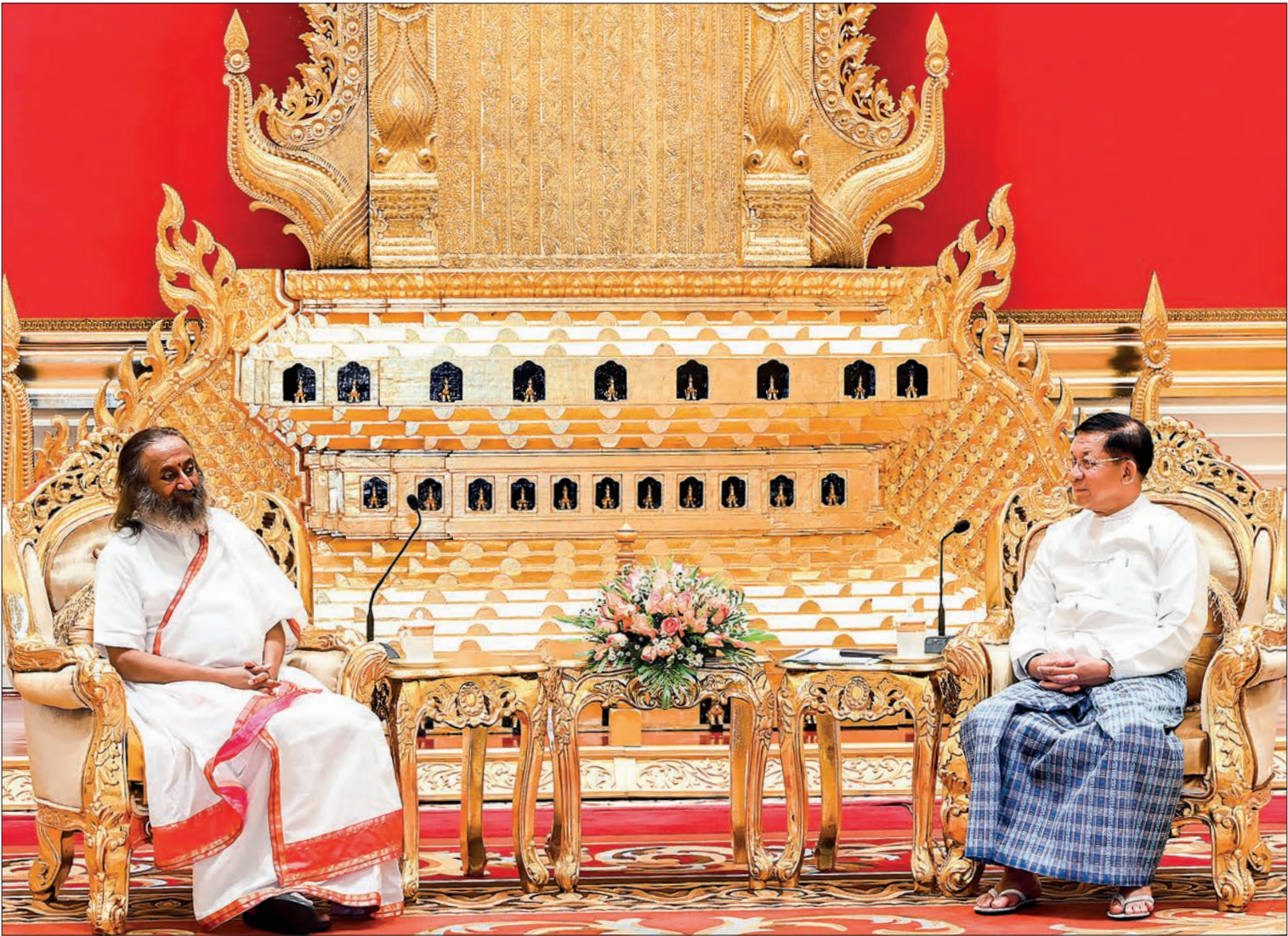
State Administration Council Chairman Prime Minister Senior General Min Aung Hlaing receives Indian Gurudev Sri Sri Ravi Shankar, the humanitarian leader and peace envoy, at the Office of the SAC Chairman in Nay Pyi Taw yesterday.