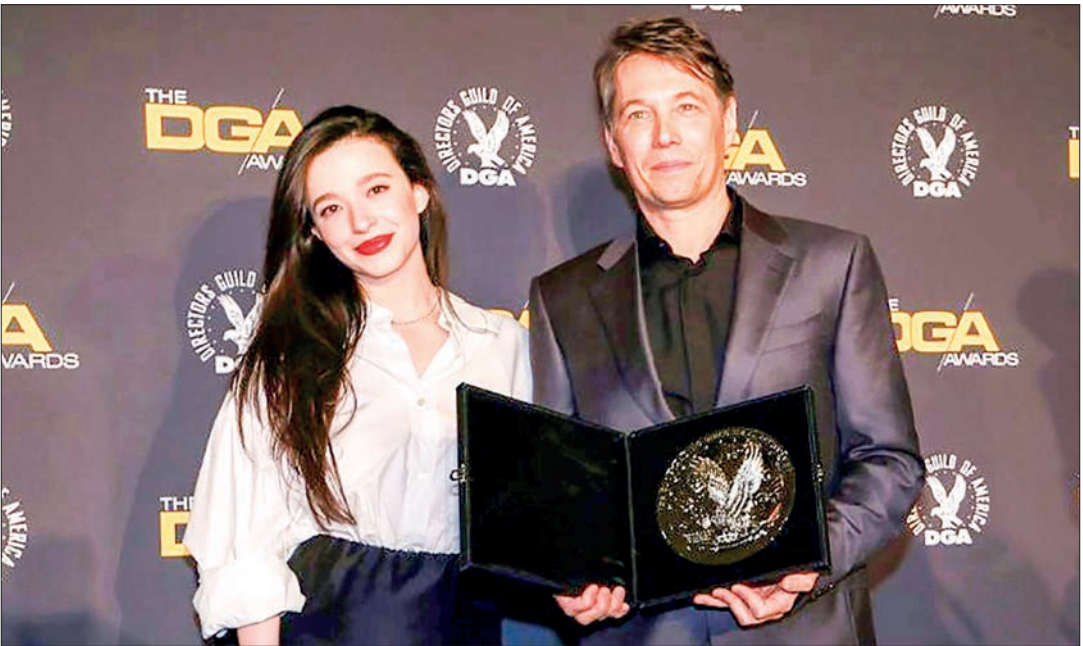
'Anora,' a black comedy about an erotic dancer's whirlwind-romance-gone-wrong, won multiple prizes.

Director Sean Baker, known for his indie work, expressed surprise at the recognition, thanking his producers for managing to make the $6 million film in New York City.