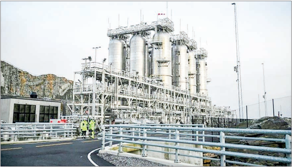
The Northern Lights Carbon Capture and Storage base in Norway that has been visited by British Prime Minister Keir Starmer.

A government spokesperson said the technology is “vital to boost our energy independence.”