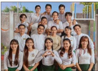
“Pyoe Ooyin” television series to premiere as a Mahar original