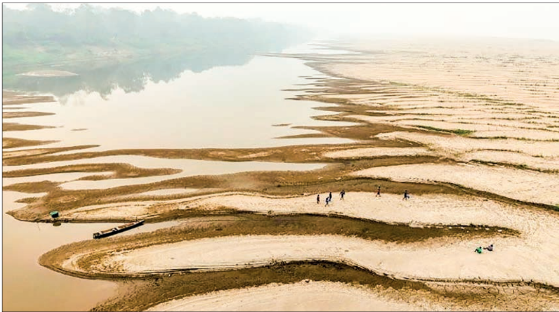
People carry drinking water along a sandbank of Madeira River in the village of Paraizinho, in Amazonas state, northern Brazil, on 7 September 2024.

“There is no route to protecting jobs in our industrial heartlands and securing the future of heavy industry in the UK without it,” the spokesperson added. — AFP