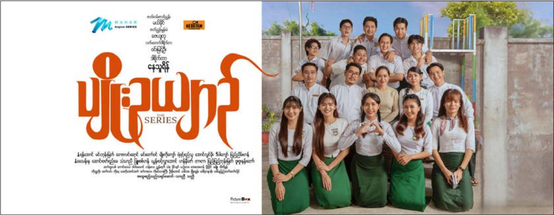
“Pyoe Ooyin” television series promotional poster.

Buddha Image, offering flowers, sacred water and oil lamps. They also explored the Agga Dhipa-ti Sasana Beikman, as well as stone plaque chamber pagodas which keep the stone-inscribed Buddhist scriptures that feature Pali script and Romanized text on marble slabs. They visited the Uppatasanti Pagoda in Nay Pyi Taw, where they paid homage to the Buddha image inside the pagoda’s chamber; made floral and water offerings and donated funds. They also toured the White Elephant shed in the precinct of the pagoda, where they fed the white elephants. In the evening, Union Minister U Tin Oo Lwin hosted a dinner in honour of Gurudev Sri Sri Ravi Shankar and his delegation at the M Gallery Hotel. Also present at the dinner were Nay Pyi Taw Council Chairman U Than Tun Oo, deputy ministers, Nay Pyi Taw Council members and other officials. — MNA/KZL