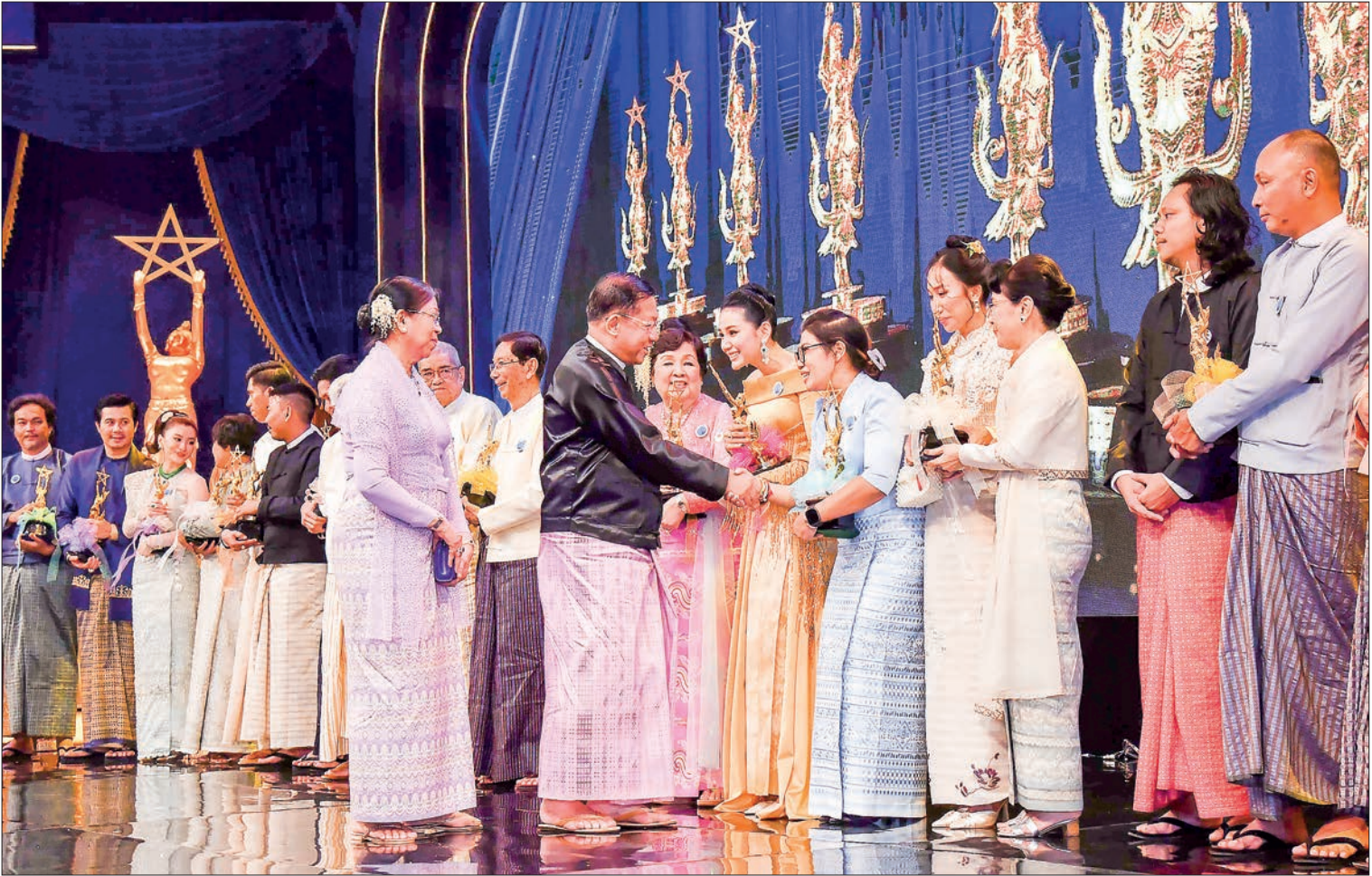
SAC Chairman Prime Minister Senior General Min Aung Hlaing cordially greets Academy award winners for 2024.