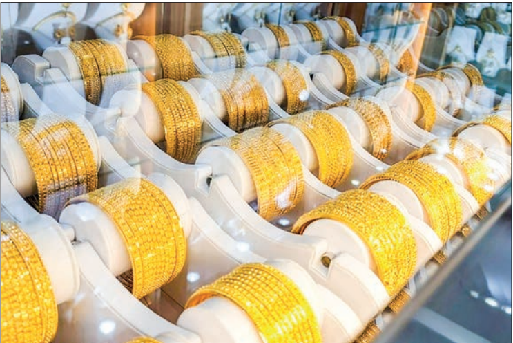
Gold bracelets displayed in a London shop as rising gold prices attract both buyers and sellers.

Central banks are purchasing gold in big quantities amid geopolitical and economic uncertainty, with the precious metal regarded as a safe haven investment. — AFP