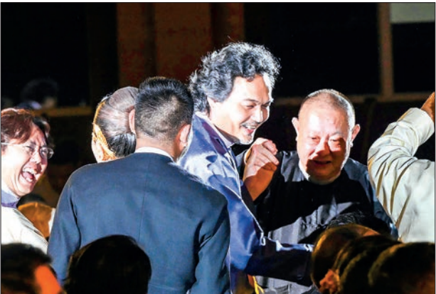
Best film music award winner Di Ra Mo.