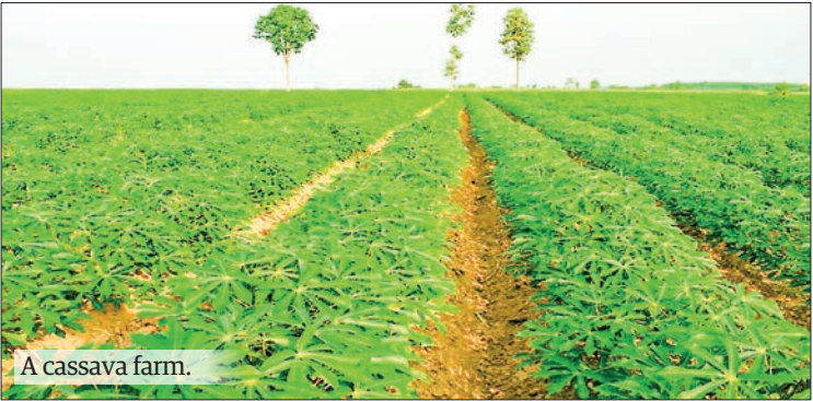
A cassava farm.

Township. The cassava price is likely to continue falling further over next months. Cassava flour is mainly purchased by China for using it in making ceramics strengthen. "Over next couples of months, digging of cassava roots will end and the supply will be larger, so the price will fall further. Cassava flour can be substituted