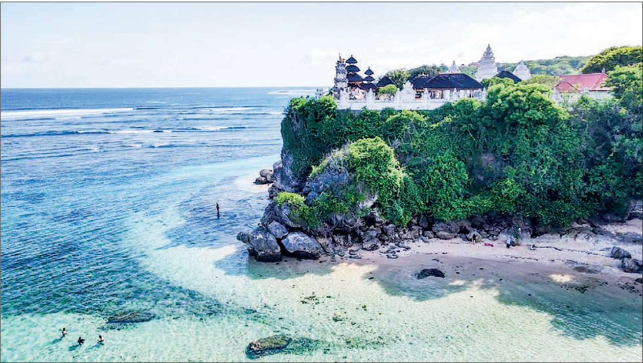
This aerial photo taken on 24 December 2023 shows the scenery near the Nusa Dua Beach in Bali, a famous tourist destination of Indonesia.