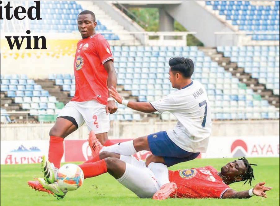
Rakhine United and Thitsar Arman compete during the Myanmar National League match.