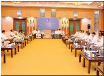
Chairman of NSPNC receives Gurudev Sri Sri Ravi Shankar and party

Artistes must craft films with lasting impact and meaningful value