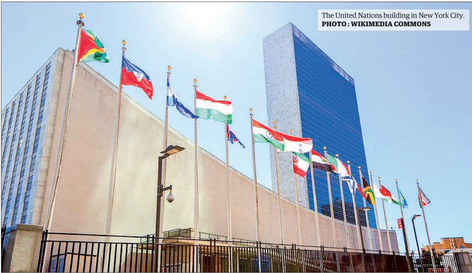
The United Nations building in New York City.

tial employers. They don't go to Davos with the singular objective of making the lives of Myanmar people better. The global elite that roam Davis one week a year are as far away from the affairs of Myanmar as possible. Let's be real!