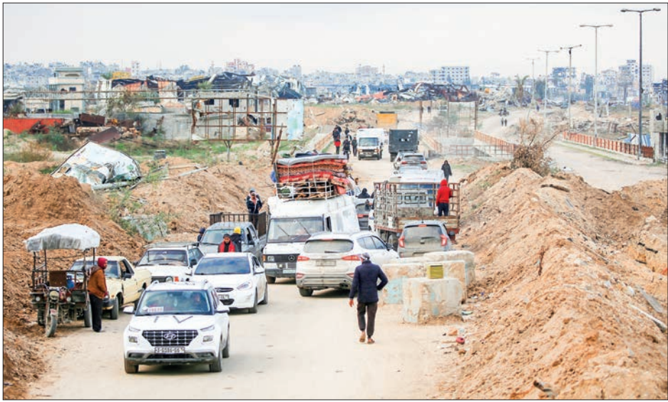
Displaced Palestinians cross the Netzarim corridor as they make their way to the northern parts of the Gaza Strip on 9 February 2025. The Israeli military completed its withdrawal from the Netzarim Corridor on a key highway in Gaza on 9 February 2025, as part of an ongoing ceasefire deal, a Hamas official told AFP.

The Hindustan Aeronautics Limited (HAL) is set to take centre stage at Aero India 2025, showcasing its indigenous products and technologies at the India Pavilion, said the state-owned aerospace and defence company. — ANI