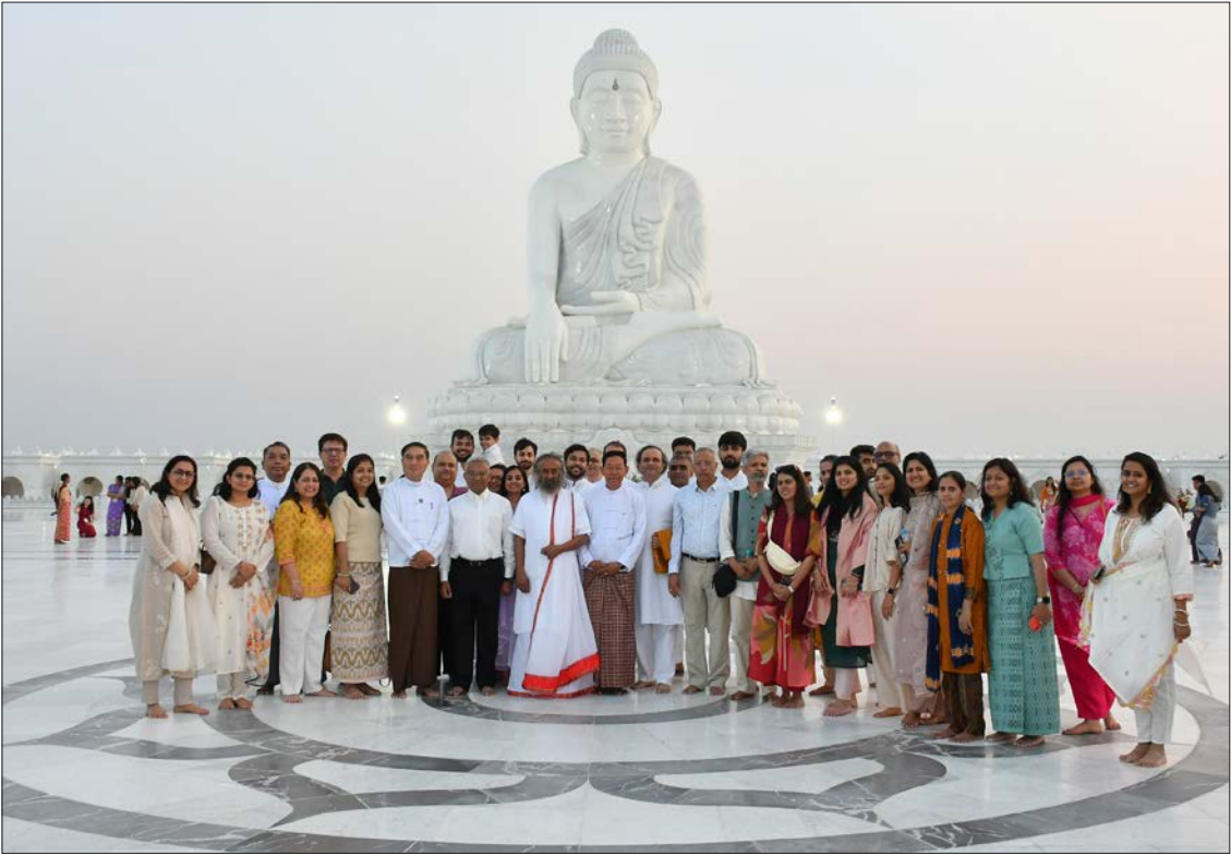
A delegation led by humanitarian leader and peace envoy Indian Gurudev Sri Sri Ravi Shankar poses for the commemorative group photo with Maravijaya Buddha Image at the background yesterday.

A delegation led by Indian Gurudev Sri Sri Ravi Shankar, the humanitarian leader and peace envoy, who is currently in Yangon travelled to Nay Pyi Taw by air yesterday morning. Upon their arrival, they were welcomed at Nay Pyi Taw International Airport by Deputy Minister for Religious Affairs and Culture U Aye Tun, members of the Nay Pyi Taw Council and officials of the Ministry of Foreign Affairs. In the afternoon, the Indian Gurudev visited the Myanmar Gems Museum in Nay Pyi Taw, where museum officials showcased various exhibits, including a jade replica of Uppatasanti Pagoda, the Myanmar’s largest pearl, high-quality raw jade stones and rare gemstones such as rubies and sapphires. During the visit, the Indian Gurudev signed the guestbook. He also visited the Mara-vijaya Buddha Image located in the Buddha Park in Dekkhi-nathiri Township of Nay Pyi Taw