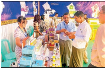
Union-level MSME Expo to promote high-quality domestic and export-ready products