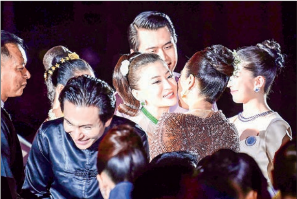
Best Actress Award winner Wut Hmon Shwe Yi.