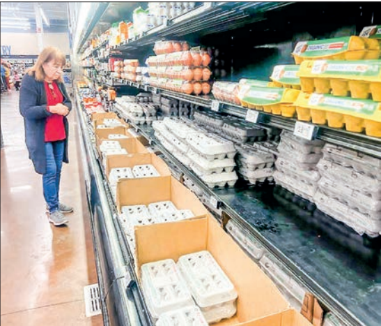
This photo taken with a mobile phone on 7 February 2025 shows a customer shopping for eggs at a Walmart in El Monte, Los Angeles County, California, the United States.

A severe egg shortage is gripping California and the western United States as a deadly avian flu