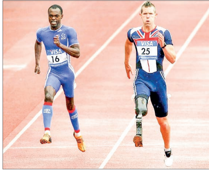
John McFall, right, running in the 2007 Paralympics. He has now been cleared to fly to the ISS.