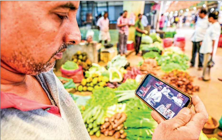
A man watches a live broadcast of Sri Lanka's President, Anura Kumara Dis-sanayake, presenting the 2025 budget to parliament on a mobile phone at a market in Colombo on 17 February 2025.

Dissanayake said the ban's end would bolster state revenue to meet the tax target of 15 per cent