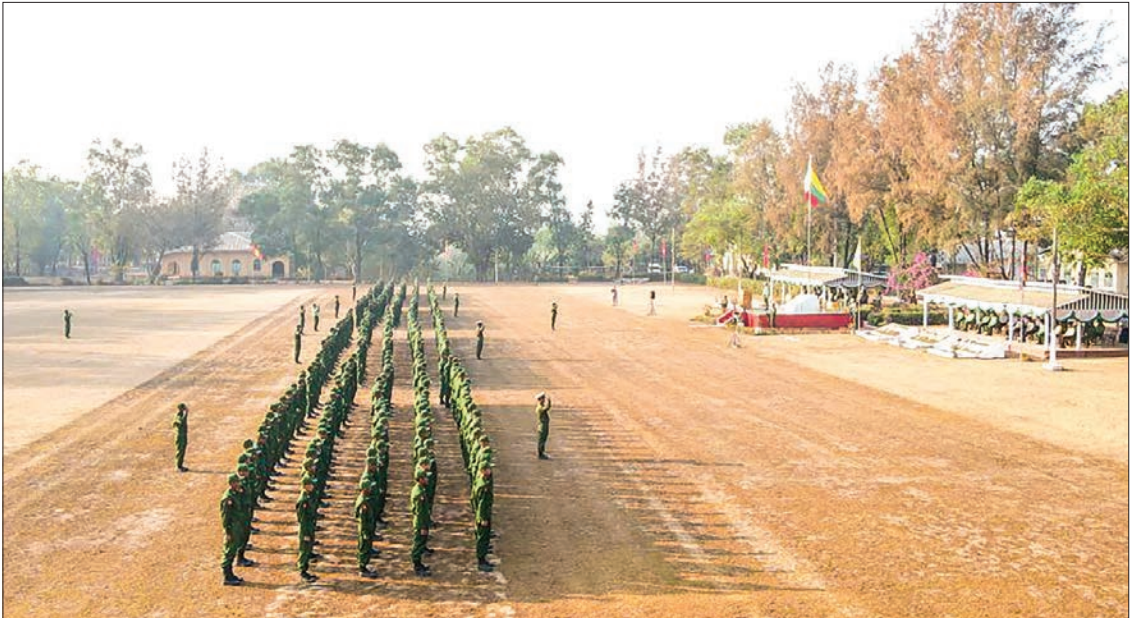
The opening event of the People's Military Service Training 10 in progress yesterday.

chief ministers, commanders, and relevant officials attended the events, greeted trainees and presented cash prizes and materials to them. The People’s Military Service Law was enacted as every citizen is under a duty to safeguard Our Three Main National Causes: Non-disintegration of the Union, Non-disintegration of national solidarity and Perpetuation of sovereignty. The People’s