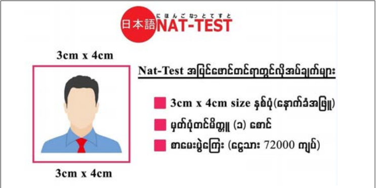
This image discloses the requirements for Nat-Test.

ACCEPTING of application forms for the Nat-Test scheduled on 6 April has been open now, the Nat-Test Centre in Yangon announced. This is the test for N2, N3, N4 and N5 and the deadline is 14 March, it said. Application forms can be downloaded at http://yangon.nattest.jp/Yangon%20Nat-Test%20Forms%202022.pdf Print and filled handwriting in printed form as the same as a simple template. A copy of the citizenship scrutiny card (CSC) and two 30-40 millimetres colour photos on a white background (size must be accurate and must be clear image) are required. The examination fee is K72000. Enquiries about more information can be made at the office located at Anawrahta Housing, Hledan in Kamayut Township and the phone number is 09 789885510. — MT/ZS