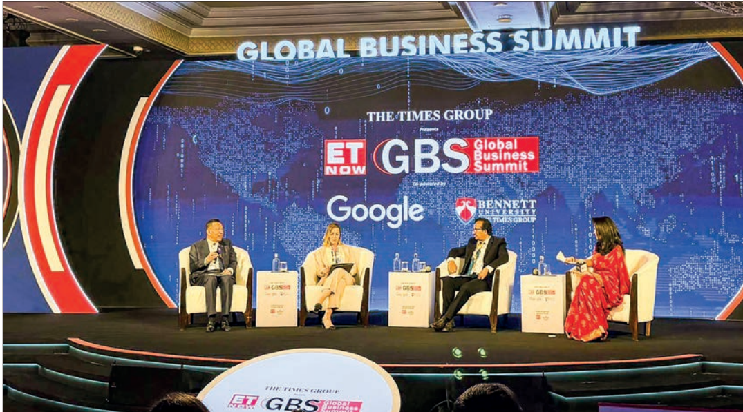
Union Minister Dr Kan Zaw attends the ninth Global Business Summit on 15-16 February in India.

THE Myanmar delegation led by Union Minister for Investment and Foreign Economic Relations Dr Kan Zaw attended the ninth Global Business Summit (GBS) on 15-16 February in New Delhi, India, at the invitation of the Times Group of India.