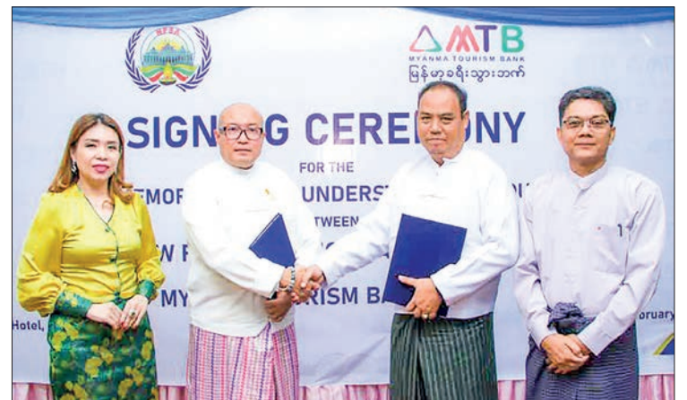
This image depicts the MTB and NPSA signing the MoU.