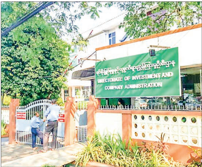
The facade view of the Directorate of Investment and Company Administration (DICA).

financial statements (G-5) simultaneously. All overseas corporations must submit ARs in the prescribed format on MyCO within 28 days of the financial year ending, under Section 53 (A-1) of the Myanmar Companies Law 2017. As per DICA’s report, thousands of companies were suspended for failing to submit AR forms before the due date. Newly established companies are required to submit ARs within two months of incorporation or face a fine of K100,000 for filing late returns. DICA has notified that any company which fails to submit its AR within 13 months will be notified of its suspension (I-9A). If it fails to submit the AR within 28 days of receiving the notice, the system will show the company’s status as suspended. Companies can restore their status only after shelling out a fine of K50,000 for the AR fee, K100,000 for restoration of the company on the Register, and K100,000 for late filing of documents, totalling K250,000. According to the DICA notice, if a company fails to restore its status within six months of suspension, the registrar will strike its name from the register. — NN/KK