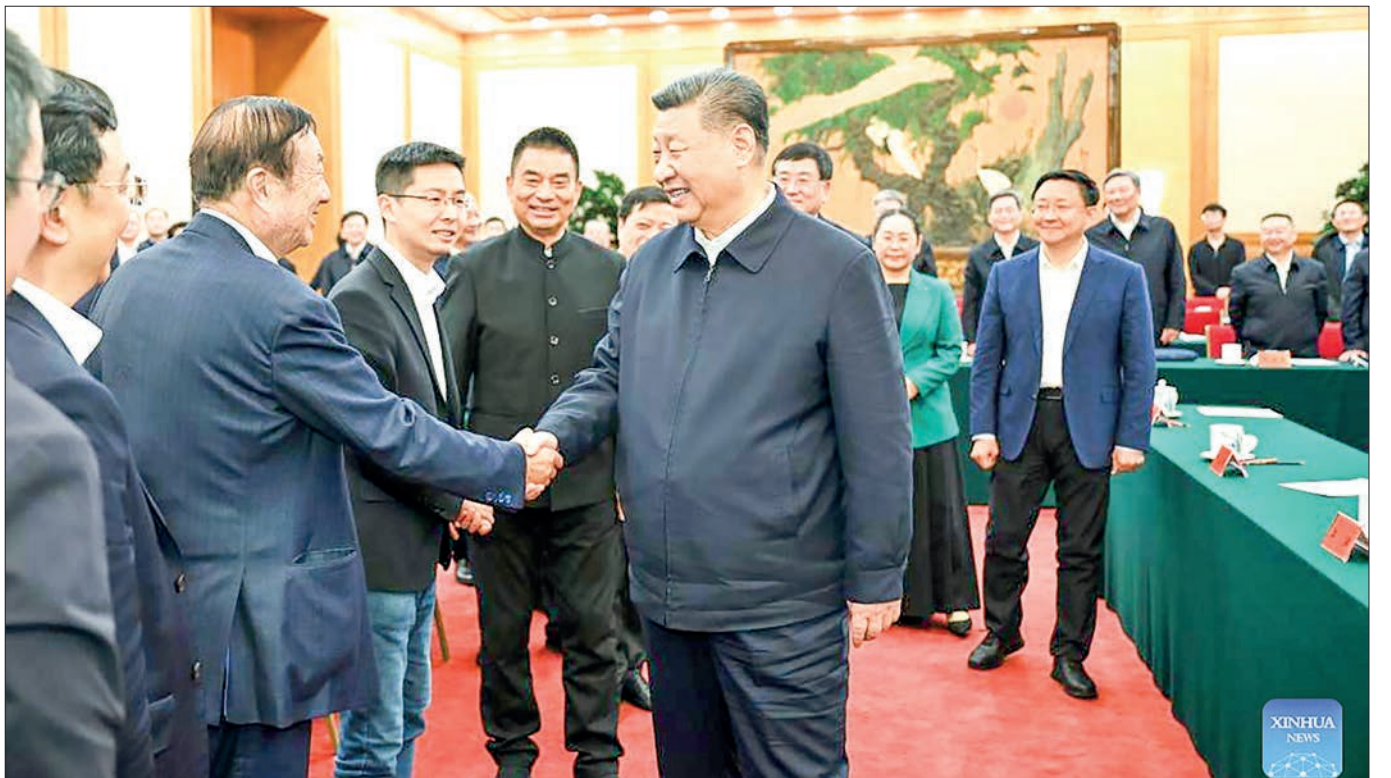
Xi Jinping, general secretary of the Communist Party of China Central Committee, also Chinese president and chairman of the Central Military Commission, talks with representatives of private entrepreneurs in Beijing, capital of China, 17 February 2025.

Xi Jinping, general secretary of the Communist Party of China (CPC) Central Committee, on Monday urged efforts to promote the healthy and high-quality development of the country’s private sector.