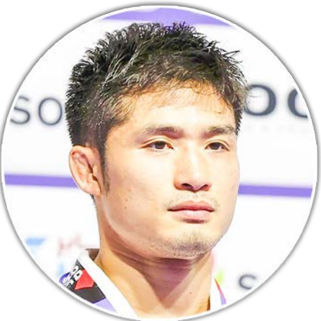
Joshiro Maruyama. old Maruyama said in a statement through his corporate sponsor: "That goal didn't come true, but I was able to fight through even the toughest times thanks to everyone's support." The Miyazaki Prefecture native was 4-7 in his 11 head-to-head meetings with Abe.

TWO-TIME judo world champion Joshiro Maruyama, a longtime rival of back-to-back Olympic gold medalist Hifumi Abe, announced his retirement Monday. The pair fought an epic one-off elimination bout in December 2020 to decide who would represent Japan in the men's 66-kilogramme division at the Tokyo Games, with Abe prevailing after 24 gruelling minutes to take his place on the Olympic team alongside sister Uta. Maruyama was crowned world champion in 2019 and 2021 and finished runner up at the worlds in 2022 and 2023. He missed out on selection for the 2024 Paris Olympics after Abe sealed Japan's 66-kg berth on the way to his second straight gold. "I started judo at the age of 3 and trained every day with the goal of winning at an Olympic Games," the 31-year-