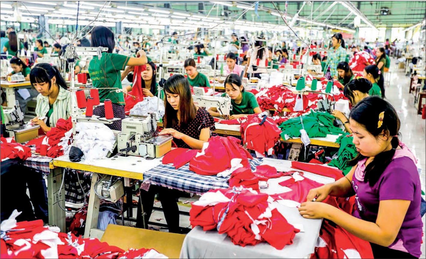
Female workers skilfully process garments at a CMP (cut, make, and pack) facility.

There are a total of 1,702 existing projects invested by Myanmar citizens, pumping in K25,081 billion into 12 sectors, DICA's statistics indicated.