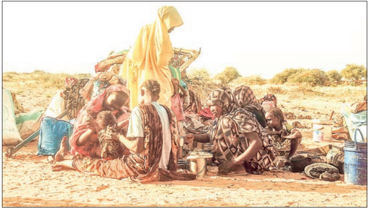
Displaced Sudanese, who fled the Zamzam camp, gather near the town of Tawila in North Darfur on 14 February 2025.

Almaz-Antey Aerospace Defence Concern will showcase the export anti-aircraft missile systems S-300V4 “Antey-4000” and S-350E “Vityaz”, as well as the Viking system, the Komar turret mount for the automated launch of Igla missiles to protect ships and Ataka missiles against ground and surface targets. The concern’s stand will also feature an autonomous combat module of the Tor-M2KM anti-aircraft missile system and various radar systems. — SPUTNIK