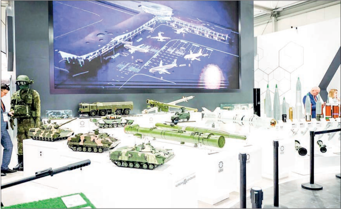
Also, the joint Russian stand will showcase the Kornet anti-tank system with a remote control, the Krona-E air defence system, new loitering munitions Kub-2-1E and Kub-2-2E, the Berezhek combat module, and the RPL-7 light machine gun with a belt drive.

Rosoboronexport will traditionally act as the organizer of the unified Russian exposition.