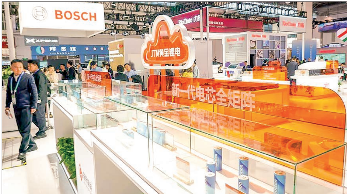
This photo taken on 26 November 2024 shows lithium battery products at the booth of Gotion at the second China International Supply Chain Expo (CISCE) in Beijing, capital of China.

By 2027, the sector is expected to demonstrate international competitive advantages across the entire manufacturing chain, with a greater number of leading enterprises, marked improvements in industrial innovation capabilities, and overall competitiveness while also achieving advancements in high-end, intel-