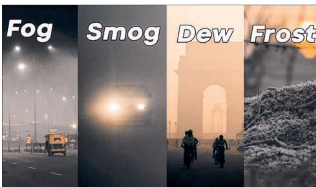
Types of smog.