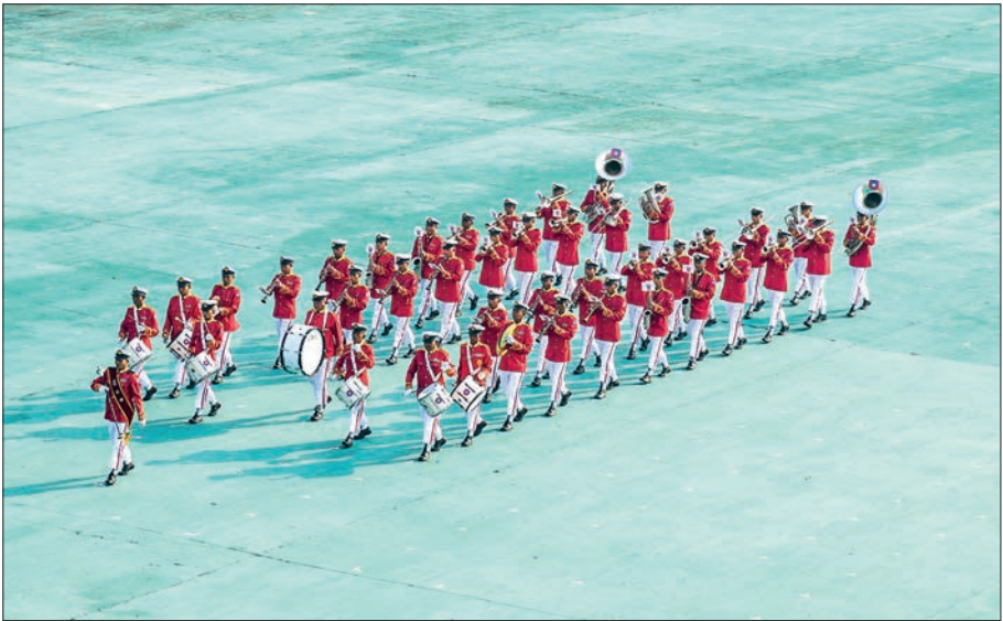
The third-day event of the 31 st Tatmadaw (Army, Navy, and Air) Military Band Competition to hail the 80 th Anniversary of Armed Forces Day underway yesterday in Nay Pyi Taw.

THE third day of the 31 st Tatmadaw (Army, Navy, and Air) Military Band Competition, marking the 80 th Anniversary of Armed Forces Day, took