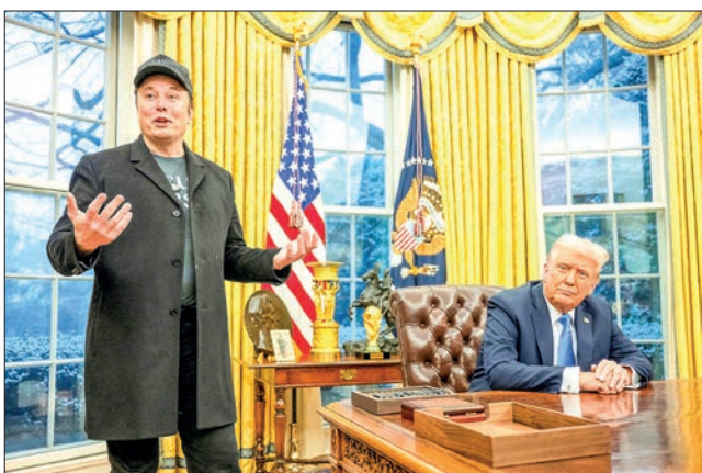
Elon Musk speaks as US President Donald Trump looks on in the Oval Office of the White House in Washington, DC, on 11 February 2025.

The Party and the country ensure that economic entities under all forms of ownership have equal access to factors of production in accordance with the law, compete in the market on an equal footing, and are protected by the law as equals, he said. — Xinhua