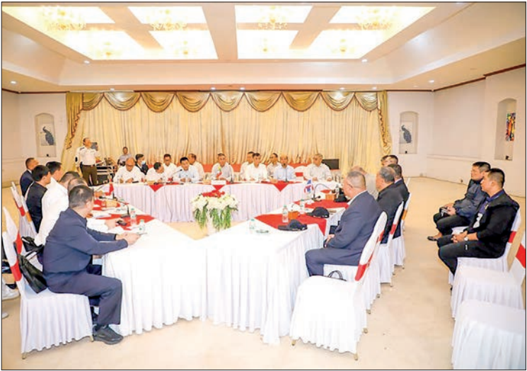
The discussion between Myanmar, China and Thailand underway for expedite transfer of foreign entrants.

The government is actively exposing telecom fraud and cracking down on online gambling by cooperating with international organizations including the neighbouring countries. — MNA/KTZH