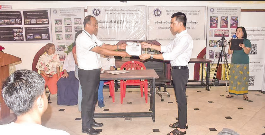
This photo shows deck cadets receiving completion certificates for a basic training course on 3 February.

rently serving in various military units, fulfilling their responsibilities for national defence and security.