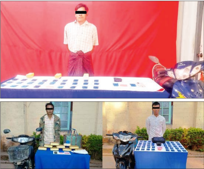
Photos capture offenders alongside seized stimulant tablets.