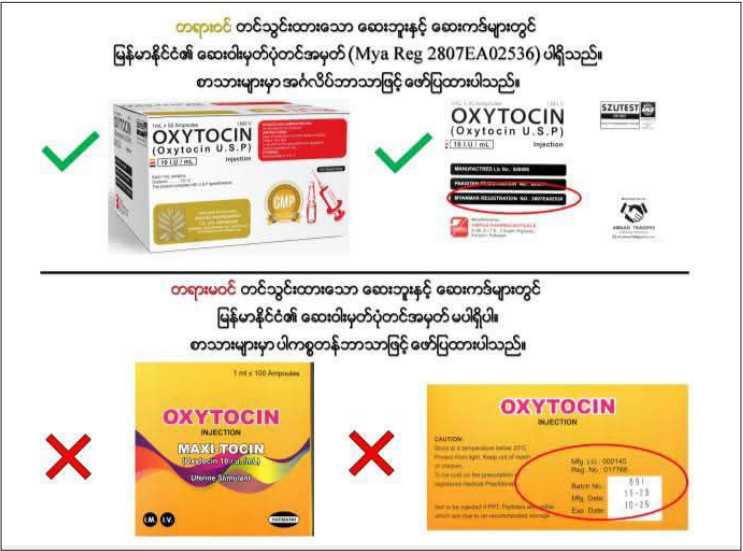
This image showcases FDA-registered drugs and unregistered drugs.

FOOD and Drug Administration has warned of unregistered oxytocin tablets which have no guarantee of quality and how much it effects or harmful substances. It has carried out regular checks on the pharmaceutical market and low-quality unregistered drugs are found selling in the market, so the public should be cautious and do not use them, FDA said in a statement on 17 February. FDA has made public drug photos to help people to distinguish what is registered and what are unregistered and the statement stipulated four oxytocin brands which are unofficially imported and written in Pakistan, said the statement. It said oxytocin USP is an officially registered drug featuring a Myanmar registration number and written in English. — MT/ZS