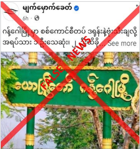
This screenshot reveals fabricated stories.

UNVERIFIED reports from subversive media claim that security forces conducted an unprovoked drone attack on West Gangaw Village, west of Gangaw in Magway Region, resulting in civilian casualties and injuries. According to a statement from a relevant security official, security forces do not target or attack villages where civilians reside without military justification. The official stated that only terrorist groups carry out attacks using heavy weapons and drones in areas where they lack local support, aiming to instil fear among the population. Furthermore, pro-terrorist media outlets have been spreading misinformation on social media, using unrelated images to conceal terrorist activities and mislead the public about the actions of security forces. — MNA/MKKS