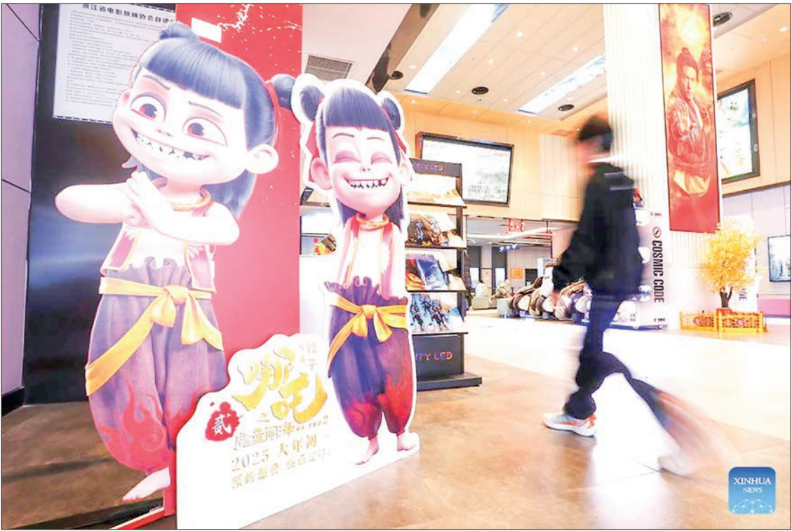
A moviegoer walks past film posters at a cinema in Jiaxing City, east China’s Zhejiang Province, 3 February 2025.

CHINESE animated blockbuster “Ne Zha 2” rounded out the top five at the North American box office on its opening weekend, making it the biggest opening weekend for any Chinese production in recent years. Data from measurement firm Comscore showed on Sunday that the highly-anticipated film has generated an estimated three-day cume of US$7.2 million in North America through Sunday. The animated epic fantasy film’s North American pre-sale box office alone has exceeded the opening weekend box office record in North America for any Chinese-language film in the past 20 years. Marvel’s “Captain America: Brave New World” debuted atop the North American box office this weekend with an estimated $88.5 million in 4,105 theaters. “Ne Zha 2” is being released by CMC Pictures in Mandarin with English subtitles in about 750 selected theatres in North