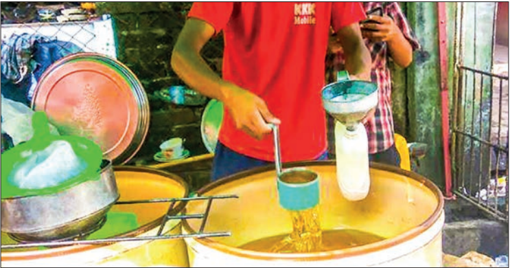
A vendor arranges edible oil for sale in the market.