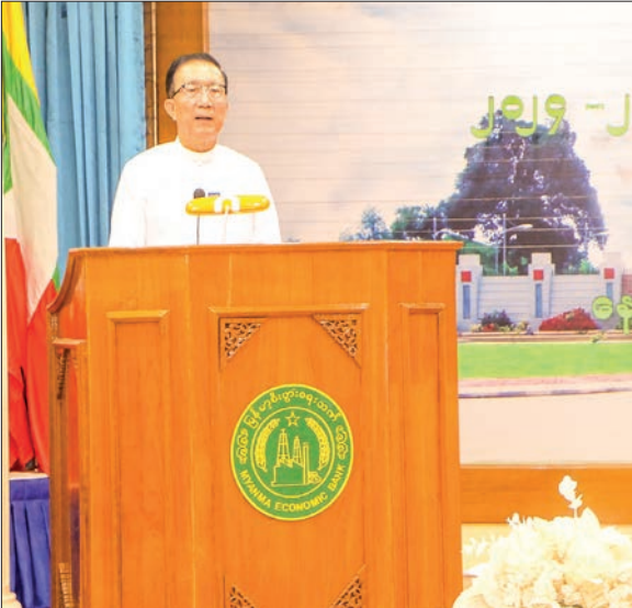
The 2024-2025 financial year annual statement closing coordination meeting of the Myanmar Economic Bank in progress yesterday, addressed by Deputy PM MoPF Union Minister U Win Shein.

(Excerpt from guidance given by Chairman of the State Administration Council Prime Minister Senior General Min Aung Hlaing to Shan State cabinet members and state-level departmental officials on 3 September 2024)