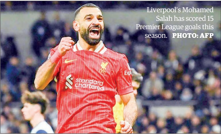
Liverpool's Mohamed Salah has scored 15 Premier League goals this season.

Nottingham Forest are experiencing a resurgence, with the team chasing a return to the Champions League for the first time in over four decades. Forest's solid defense has been key to their rise to fourth in the Premier League. They face a tough challenge against Tottenham, who are reeling after a heavy loss to Liverpool. — AFP