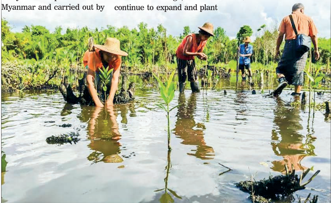
This image shows locals planting mangrove plants.

Mangrove forests help develop fish resources, support livelihoods, and mitigate natural disasters. Despite challenges posed by local people, such as expanding farms, cutting firewood, and burning charcoal, authorities are continuously providing locals with training and technology, and are working together with the community to solve problems related to long-term conservation and mixed forest management. — ASH/TH