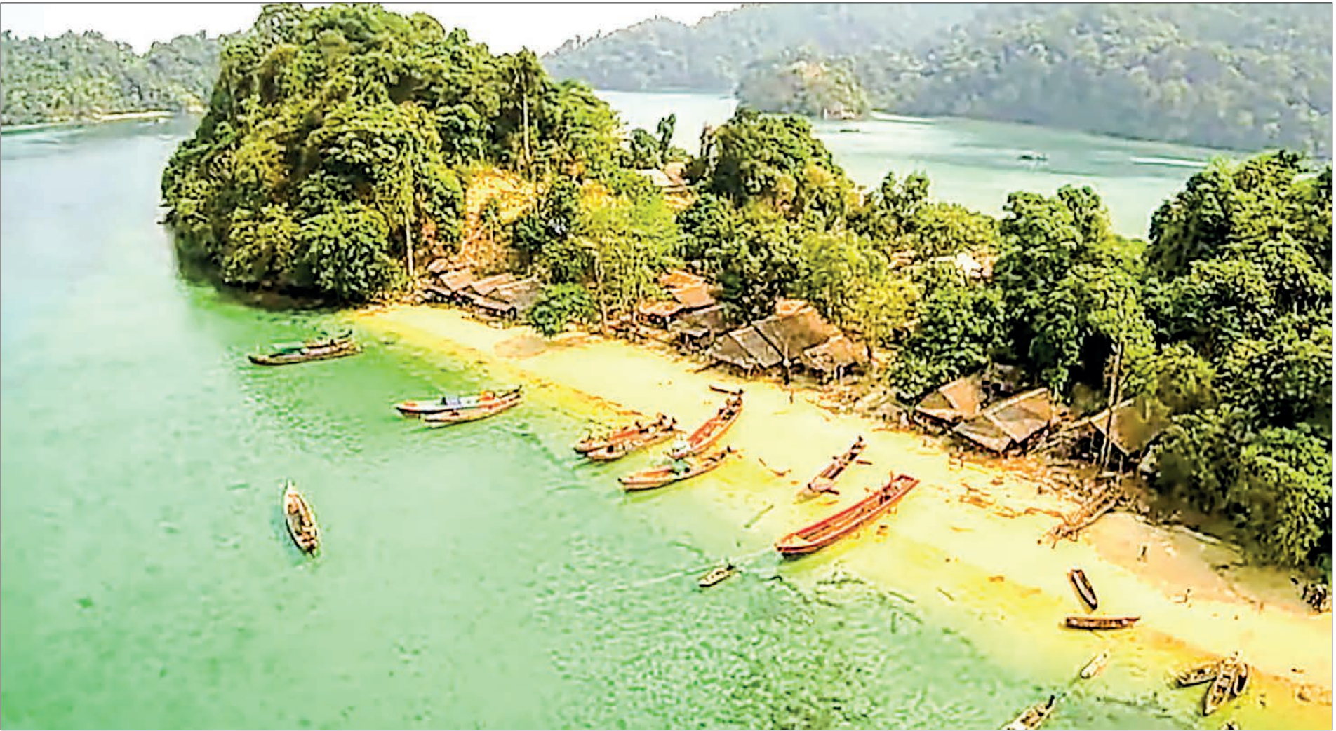
A drone aerial view of Lampi Island, home to the Salon people, in the Myeik Archipelago.

According to the park official, tourists from Russia, Italy, the UK and other European countries flock to Wah Ale Resort in Lampi Marine National Park this year.