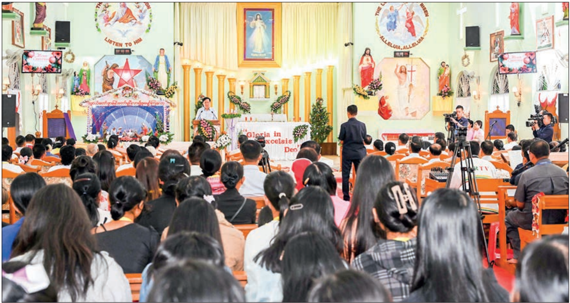
State Administration Council Secretary General Aung Lin Dwe speaks on the Thanksgiving Day occasion in Pyinmana Township, Nay Pyi Taw, yesterday.