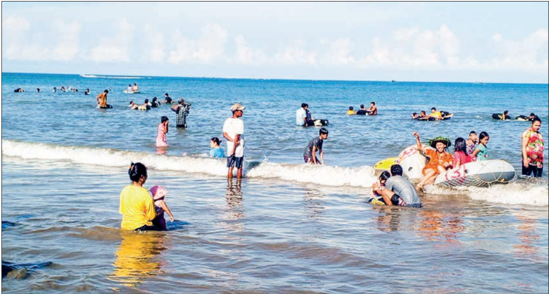
Visitors enjoy Christmas holiday at Chaungtha Beach in Patheingyi District, Ayeyawady Region.

CHAUNGTHA Beach, located in Chaungtha Town of Patheingyi District, saw an influx of visitors from various regions on 25 December for the Christmas holiday.