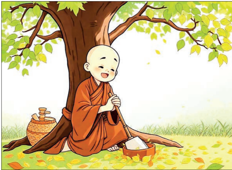
ငယ်ဖြူ / ngal hpyau/

MYANMAR idioms are beautiful expressions embedded in everyday language, rich in cultural meaning and offering insightful perspectives on life, relationships, and human behaviour.