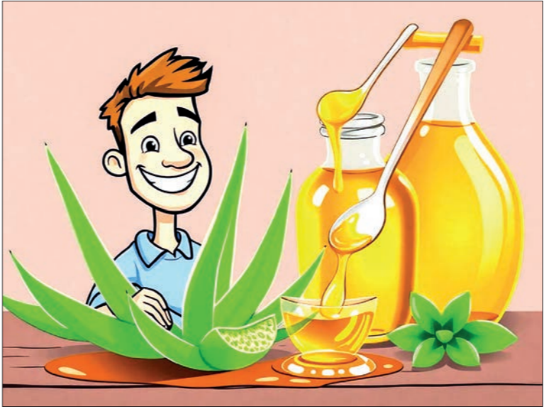
ပျားရည်နှင့် ဝမ်းချ / pyanai nhang wam hkya/

Example: The house was clean as a new pin after the maid finished tidying up.