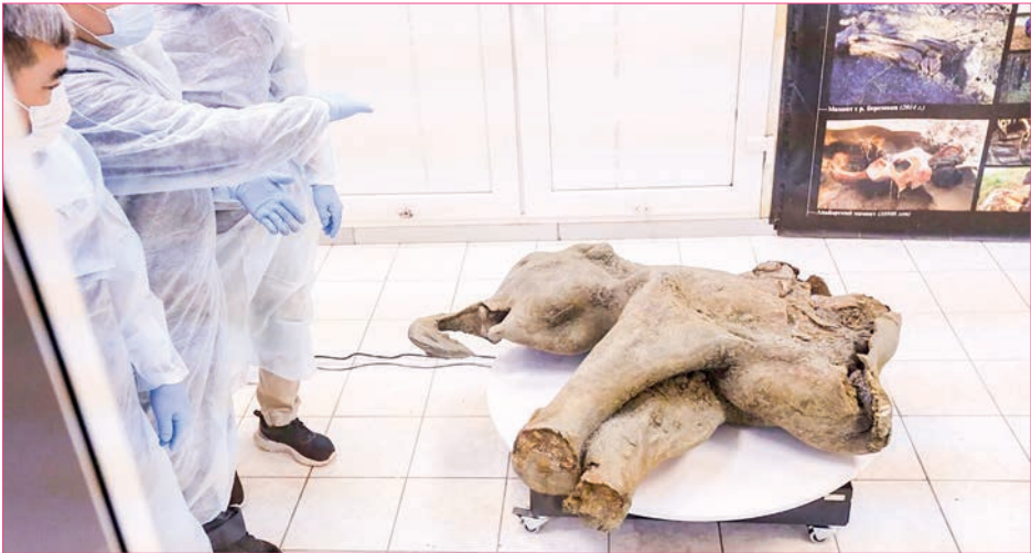
The 50,000-year-old female mammoth has been nicknamed "Yana" after the river in whose basin it was discovered this summer.