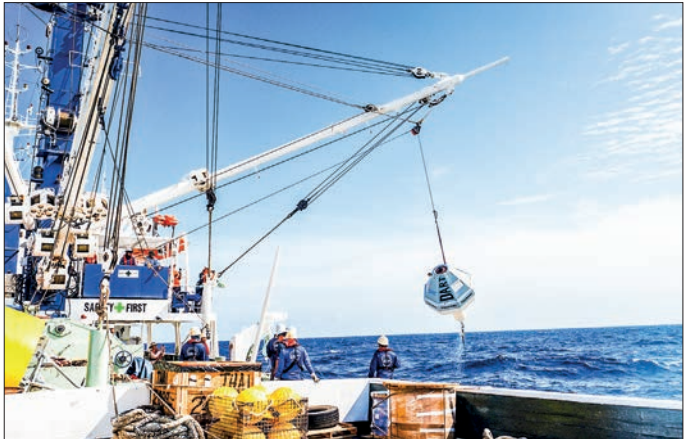
This photo taken on 28 November 2024 shows SEAFDEC ship crew using a crane to lift tsunami buoy Thai 23461 onto the Southeast Asian Fisheries Development Centre (SEAFDEC) ship in the Andaman Sea.

In response to the 2004 tsunami disaster, engineers have deployed a detection buoy 1,000 kilometres off Thailand's coast as part of a global tsunami warning system.