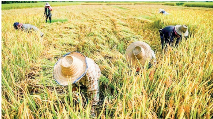
Exports of agricultural products expanded 4.1 per cent, despite a significant decline in rice shipments Farmers harvesting rice in the village of Mae Rim in the northern Thai province of Chiang Mai.

Industrial product shipments increased 9.5 per cent, marking its eighth straight month of expansion, owing to major increases in computer, air conditioning and rubber products. — Xinhua