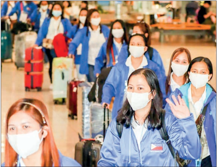
Foreign female workers to work in South Korea.