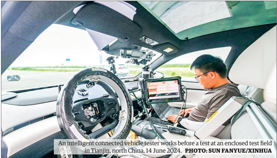
An intelligent connected vehicle tester works before a test at an enclosed test field in Tianjin, north China, 14 June 2024.

CiDi Inc, an autonomous driving unicorn, emphasizes innovation, holding 530 patents and contributing to 50 industry standards since 2017.