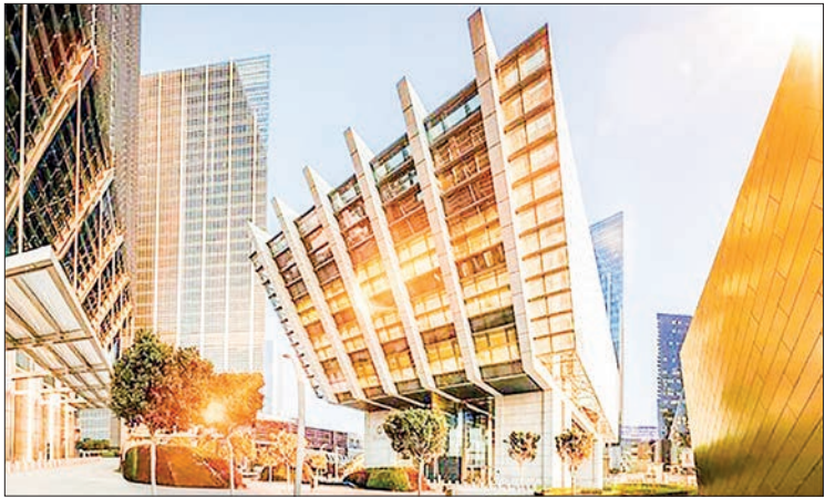
The 2025 summit theme, "Bridging Sectors, Building Economic Growth," emphasizes collaboration to tackle challenges and drive sustainable economic progress.

The summit will bring together the region's leading decision-makers, including ministers, business leaders and entrepreneurs, as well as top executives of significant international organizations. — ANI