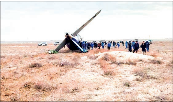
The plane was carrying 62 passengers and five crew members, according to the Kazakh Ministry of Transport. PHOTO: SPUTNIK

Preliminary reports indicate that there are survivors. The preliminary cause of the plane crash in Kazakhstan’s Aktau was a collision with a flock of birds, according to Azerbaijan Airlines. The APA news agency, in turn, reported that there were 67 passengers and five crew members on board the plane. 52 rescuers and 11 pieces of equipment from the Ministry for Emergency Situations of Kazakhstan arrived at the crash site. — SPUTNIK