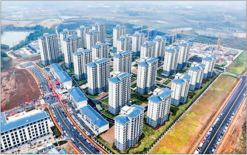
An aerial drone photo taken on 9 November 2023 shows a newly-built residential complex in Feixi County of Hefei City, east China's Anhui Province.

including reductions in mortgage rates, lower down payment requirements, relaxed purchase restrictions, and improvements to land use, fiscal and tax policies. The official highlighted signs of recovery in the housing market, citing year-on-year and month-on-month increases in