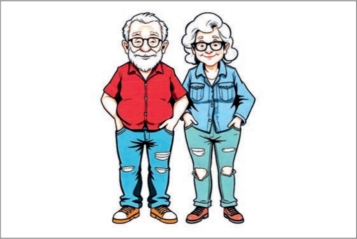
ငယ်မူပြန် / ngaimu-pran/

Example: “He tried to take the edge off the bad news by telling her how well she had performed at work.”