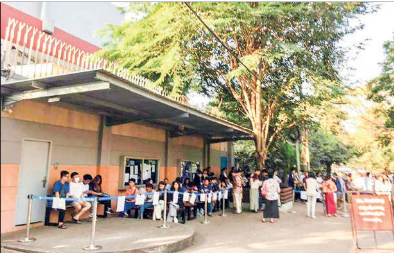
Visa applicants at the Royal Thai Embassy in Yangon in 2023.

For all visa types, e-visa applications will be accepted only at https://www.thaievisa.go.th/ on January 2025 for Myanmar nationals and other nationals living in Myanmar. Stages of an e-visa application are provided at https://thaievisa.go.th/video-user-manu-