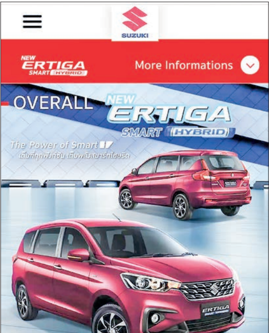
This photo showcases some Ertiga Hybrid cars manufactured by Suzuki.

SUZUKI'S newly introduced Ertiga Hybrid may affect the car market depending on the price