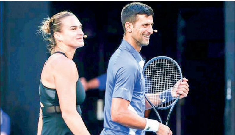
Aryna Sabalenka and Novak Djokovic both begin their 2025 seasons at the Brisbane International.

In his time at West Brom, the coach led the club to ninth place in his first season in charge, taking it to fifth last season, while it currently sits in seventh place in the Championship table. — Xinhua