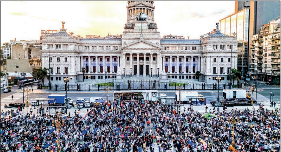
Aerial view showing volunteers and homeless people taking part in a Christmas solidarity dinner called 'No Families Without Christmas' in front of the National Congress in Buenos Aires on 24 December 2024.

Poverty in Argentina surged to 52.9 per cent, with 18.1 per cent homeless and 66 per cent child poverty, affecting seven million children under 14.