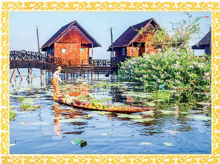
Inlay Lake.

[An excerpt from the radio speech delivered by Bogyoke Aung San on 1 January 1947.]