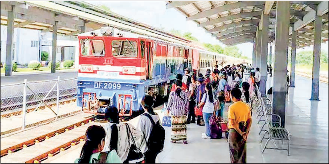
Passengers await to board an express train at the platform of the rail station.

MYANMA Railways (MR) will add the special up and down trains for Nay Pyi Taw-Mandalay, Yangon-Mawlamyine and Yangon-Pyay routes in the upcoming public holidays to facilitate public transportation and civil servants, MR stated. Beyond the regular schedule, MR will extend its services with special up-and down-trains for the Yangon-Mawlamyine-Yangon route on 27 and 28 December 2024 and 1 January 2025. The Yangon-Mawlamyine special train will depart at 7:45 am at Yangon Railway Station and the down train will leave for Yangon at 9:15 am from Mawlamyine station. The up-train for the Yangon-Pyay route will run on 28