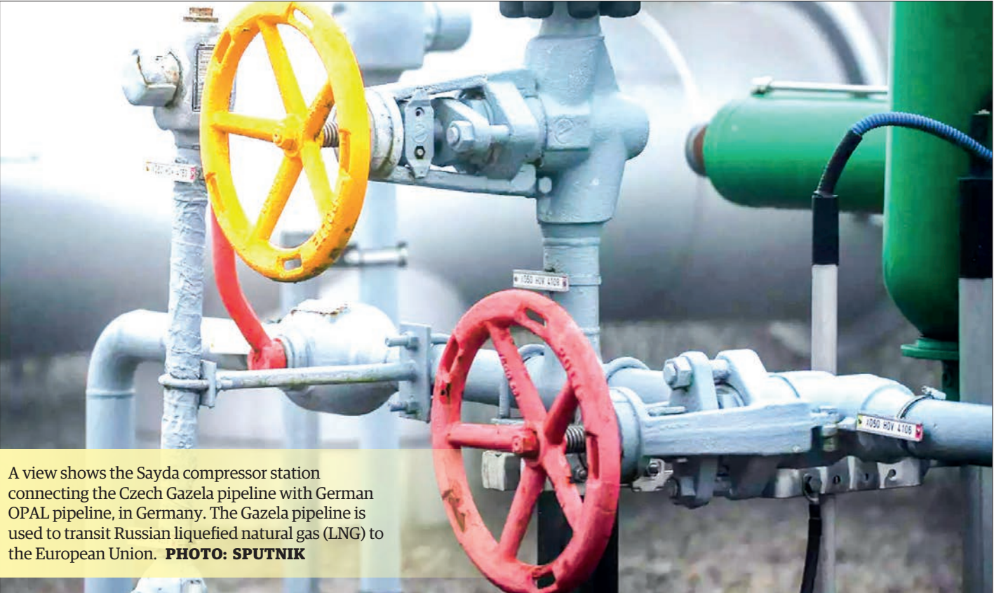
A view shows the Sayda compressor station connecting the Czech Gazela pipeline with German OPAL pipeline, in Germany. The Gazela pipeline is used to transit Russian liquefied natural gas (LNG) to the European Union.

Russia remains open to supplying gas to Europe through multiple routes, emphasizing the need for agreements between the EU and Ukraine.