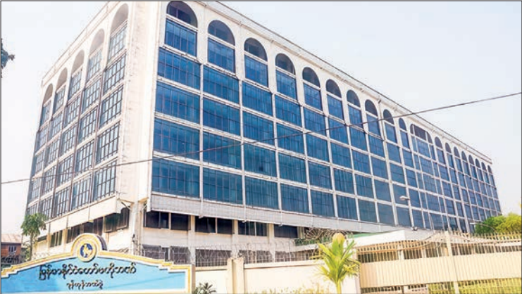
File photo shows the facade of the Central Bank of Myanmar (CBM) Yangon Branch.