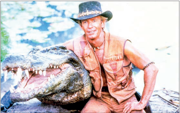
In Crocodile Dundee, Mick Dundee heroically saves Sue Charlton from a crocodile attack while she refills her water bottle.