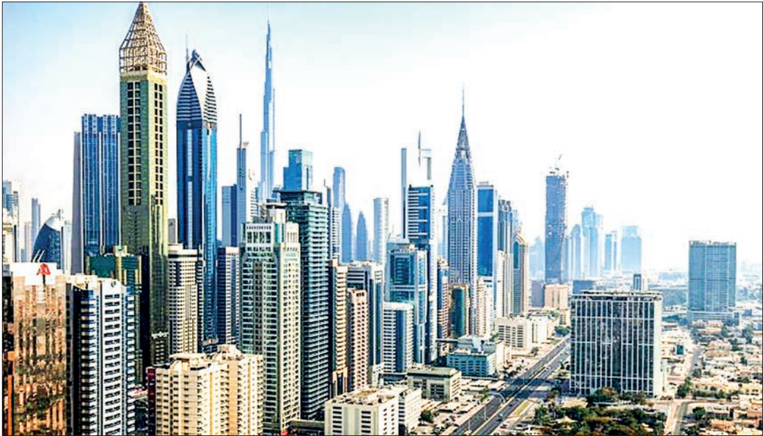
WFNS awarding the event to Dubai highlights its rapid growth as a top host for international conferences and congresses.

The congress, awarded to Dubai following a successful bid by the Emirates Society of Neurological Surgeons and Dubai Business Events, will take place from 1-4 December 2025.