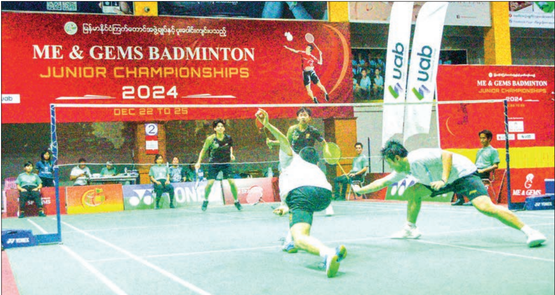
Players compete in the men's double final for U-19 category in Lanmadaw Township, Yangon, yesterday.

THE ME&GEMS Junior Badminton Championship 2024, organized by the Department of Sports and Physical Education in collaboration with the Myanmar Badminton Federation, concluded with the finals and prize-giving ceremony at the National Badminton Indoor Stadium in Lanmadaw Township, Yangon, yesterday evening.