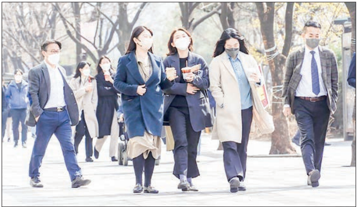
People walk on a street in Seoul, South Korea, 16 March 2022. 51.2 million registered population, numbering 10 million", the interior ministry said in a news release on Tuesday, placing South Korea alongside Japan, Germany and France as a "super-aged society".

SOUTH Korea has become a "super-aged society", with 20 per cent of its population aged 65 or older, official data showed on Tuesday, a gloomy trend driven by an alarmingly low birth rate. Asia's fourth-largest economy recorded just 0.7 births per woman late last year — one of the lowest birth rates in the world and far below the replacement rate of 2.1 needed to sustain the current population. That means South Korea's population is ageing and shrinking rapidly. Those aged 65 and older "account for 20 per cent of the