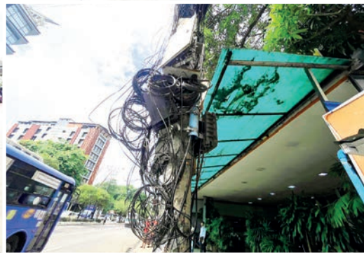
Images capture communication cables installed across Yangon Region.

Some of the current telecom cables installed across Yangon are reportedly of substandard quality, vulnerable to weather damage and at risk of causing fires due to overcrowded installations. — ASH/KZL