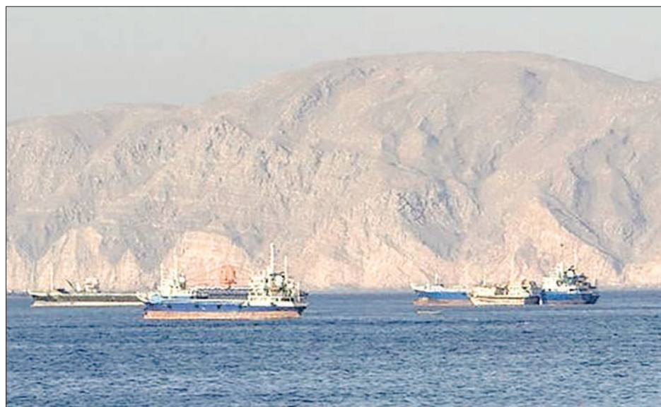
Vessels are seen anchored in the Strait of Hormuz, off the port city of Khasab on Oman’s northern Musandam Peninsula on 17 May 2026.