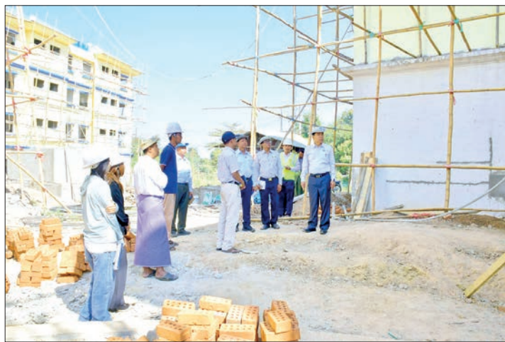
Officials inspect staff housing in Nay Pyi Taw, where major renovation works are underway.