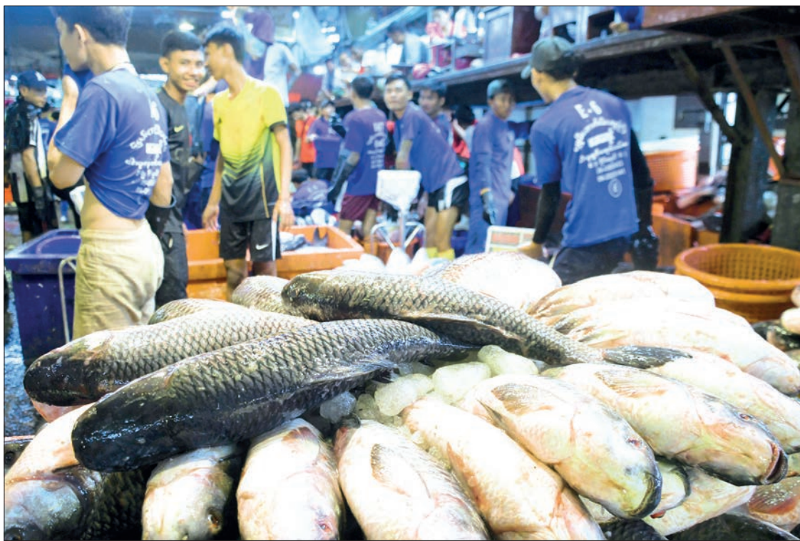
Images feature a bustling fish market with vendors actively trading and selling fish.

“The freshwater inflow became normal only recently. At the end of April, fish entered the market in large quantities, causing prices to fall from K7,000 to K5,000. This month, fish inflow has returned to normal, though trading still needs time to recover to previous levels. In the fish market, sales are usually good during public holidays in the first half of the month. Saltwater