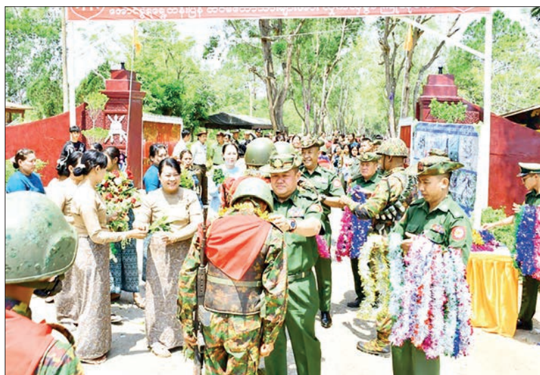
Triumphant Tatmadaw members are seen being warmly welcomed back home.