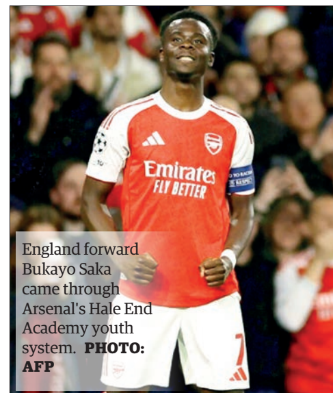
England forward Bukayo Saka came through Arsenal's Hale End Academy youth system.

As the Arsenal squad relished the club's first Premier League title since 2004, there were also joyous scenes at the north London side's Emirates Stadium, where thousands of supporters gathered to mark the occasion by lighting fireworks and flares. — AFP