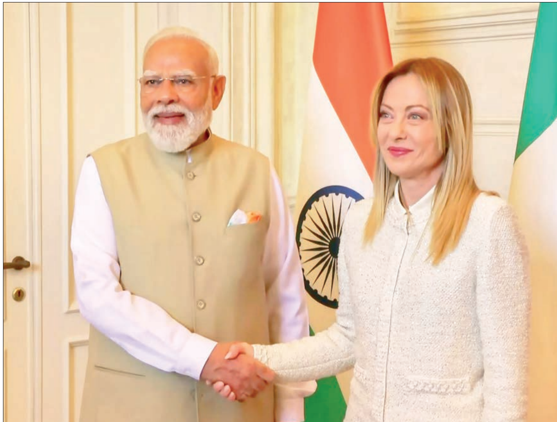
PM Modi holds delegation-level talks with Italian counterpart Meloni.

“The relationship between India and Italy has now reached a decisive phase. In recent years, our ties have expanded with unprecedented momentum, evolving from a cordial friendship to a special strategic partnership founded on the values of free-