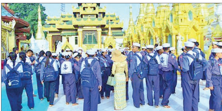
Trainees from the Maritime Youth Basic and Advanced Courses visit the Shwedagon Pagoda in Yangon yesterday.

Officials also presented science and space-related discoveries through animated visual presentations in the Planetarium Room, where trainees watched the exhibits with great interest.