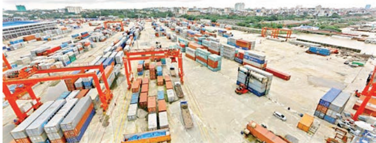
Export-import cargo containers line the bustling terminals of the Myanmar Industrial Port along the Yangon River.

The submission deadline is at 1 pm on 4 June, and late submissions will not be considered in any way, according to the Tender Accepting and Evaluation Committee. — NN/KK