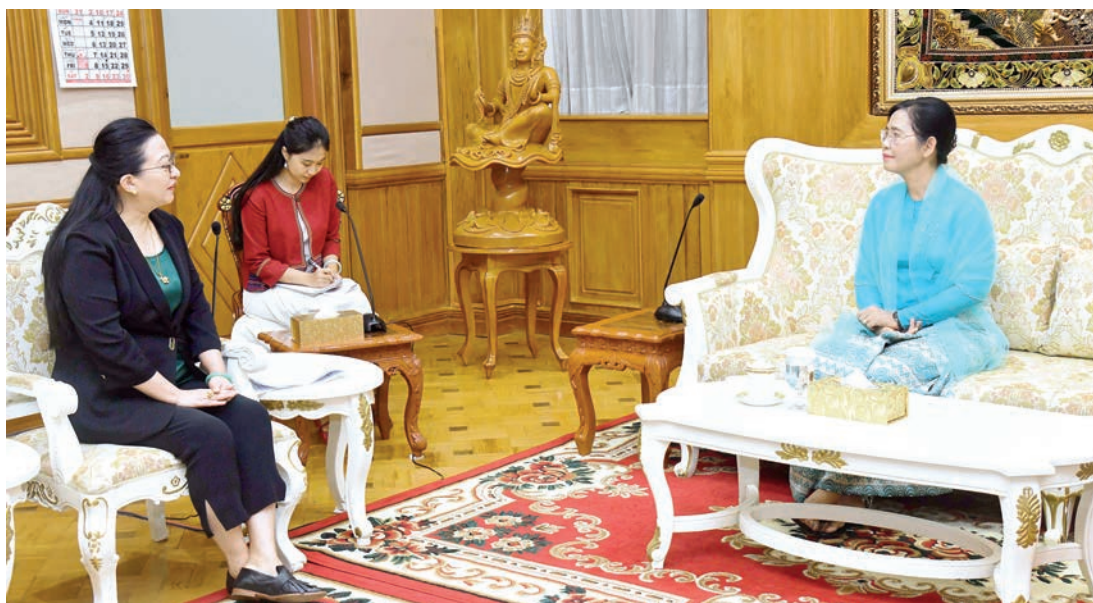
Chinese Ambassador Ms Ma Jia pays a courtesy call on Vice-President Nan Ni Ni Aye at the Presidential Palace Reception Hall in Nay Pyi Taw yesterday.

VICE-PRESIDENT of the Republic of the Union of Myanmar Nan Ni Ni Aye received Ms Ma Jia, Ambassador of the People's Republic of China to Myanmar, at the Presidential Palace Reception Hall in Nay Pyi Taw yesterday morning.