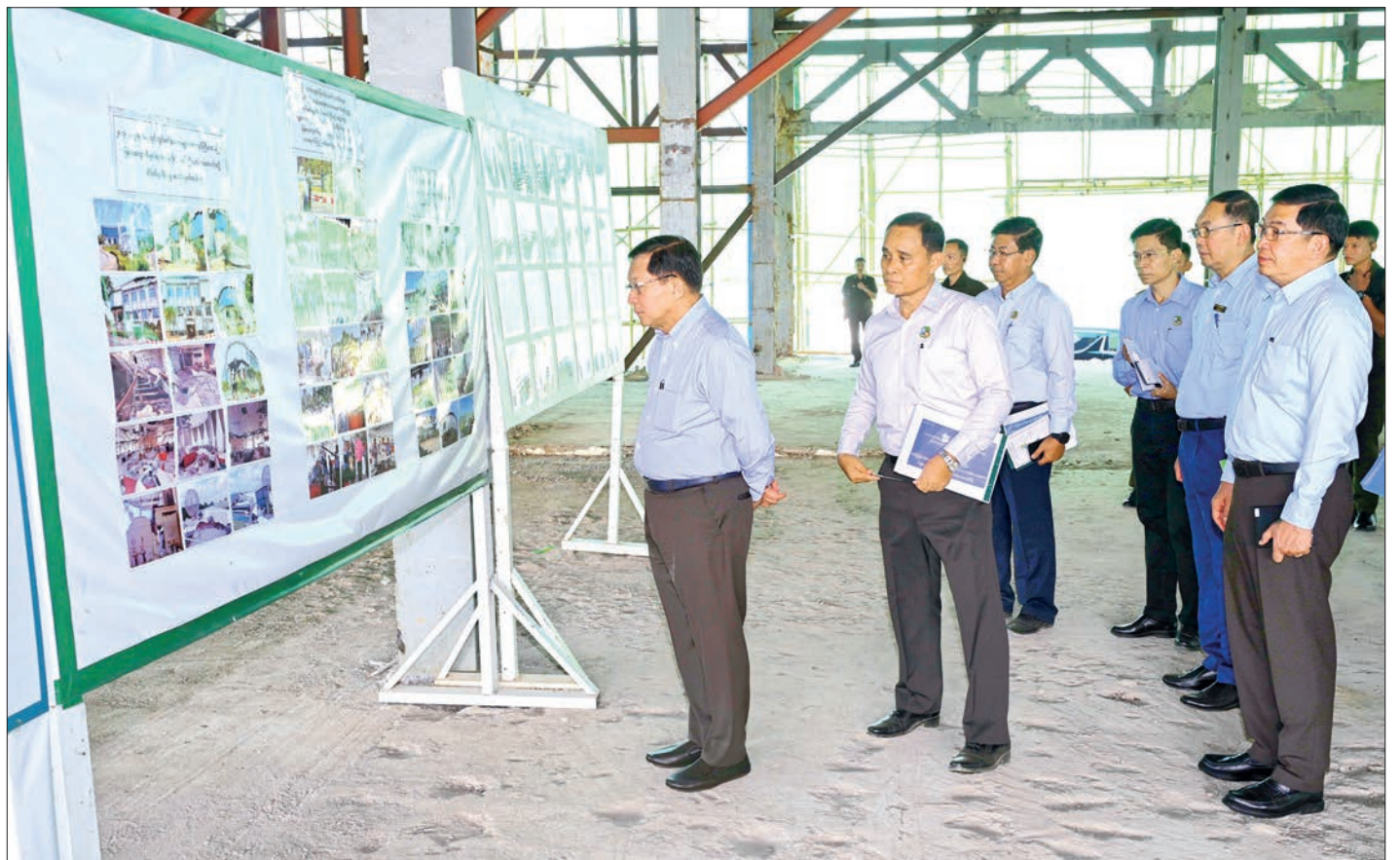
President of the Republic of the Union of Myanmar U Min Aung Hlaing inspects the progress of reconstruction and renovation works of the Myanma Gems Museum (Nay Pyi Taw) in Nay Pyi Taw yesterday.

At the construction site of the Naypyitaw Gate and the park, the Union Minister