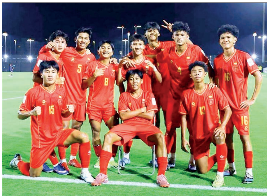
Myanmar youth team players are seen in the picture.