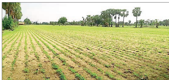
A GAP-system cultivation farm in Magway Region is seen in the photo.

THE Magway Region Department of Agriculture has announced that it is targeting the cultivation of 88,000 acres under the Good Agricultural Practices (GAP) system during the cultivation season of the 2026-2027 financial year.