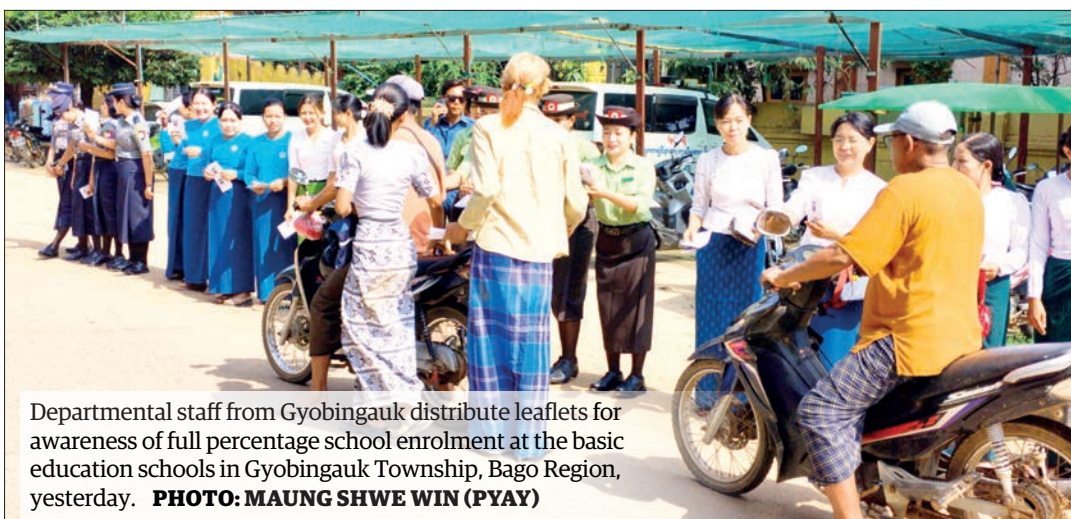
Departmental staff from Gyobingauk distribute leaflets for awareness of full percentage school enrolment at the basic education schools in Gyobingauk Township, Bago Region, yesterday.

The township administrative department staff, teachers from the education department, staff from the Information and Public Relations Department, members of the township Maternal and Child Welfare Association, and members of the township Women's Affairs Organization distributed leaflets to locals and conducted awareness-raising activities for the school enrolment week.