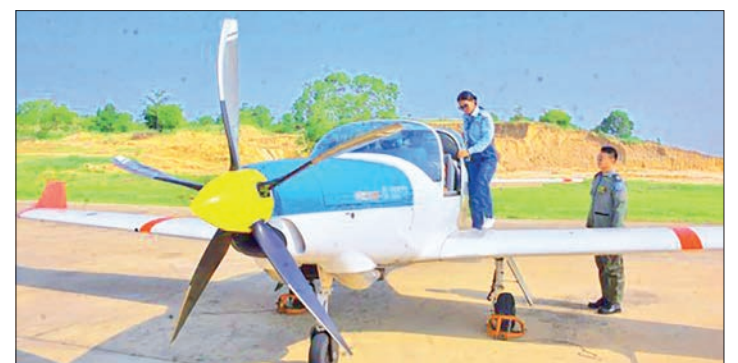
A trainee from Aviation Youth Training Course takes part in practical flight exercises.

Following this, a total of 24 trainees took part in practical flight exercises. These included six trainees who achieved first, second and third places from the two Advanced Aviation Youth Training Camps