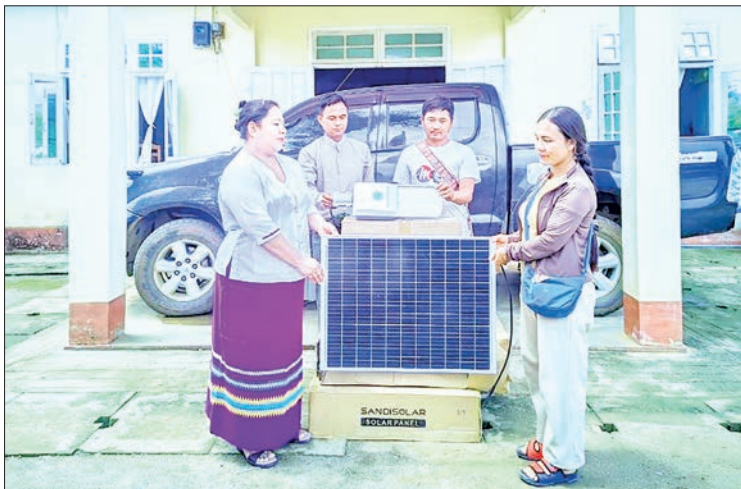
Officials from the Mongton District Rural Development Department hand over solar streetlights for residents in Mongton, Shan State (East), yesterday.

In addition to implementing rural productive roads, water supply projects, and expanding systematic agriculture and livestock breeding sectors through Mya Sein Yaung project loans, the Mongton District Rural Development Department's provision of these solar streetlights will benefit 2,256 households and 10,423 residents. This assistance will contribute significantly to the development of local education, healthcare, social, and economic sectors. — Karyan Cho (Rural)