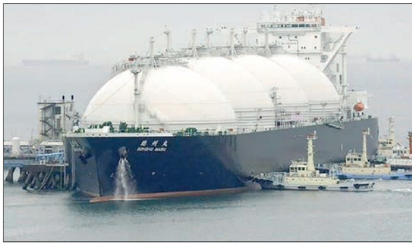
LNG has become Japan's primary source of thermal power generation.

Electricity supply capacity nationwide is expected to exceed demand by more than the minimum reserve requirement of three per cent for the July-September period. Despite concerns over crude oil supplies, Japan's reliance on oil-fired thermal power generation is relatively low, and the country can increase use of other energy sources such as liquefied natural gas. — Kyodo