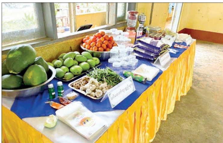
This photo shows the training materials to be used in value-added food production (making tomato jam) training course in Taunggyi, Shan State (South), on 18 May.