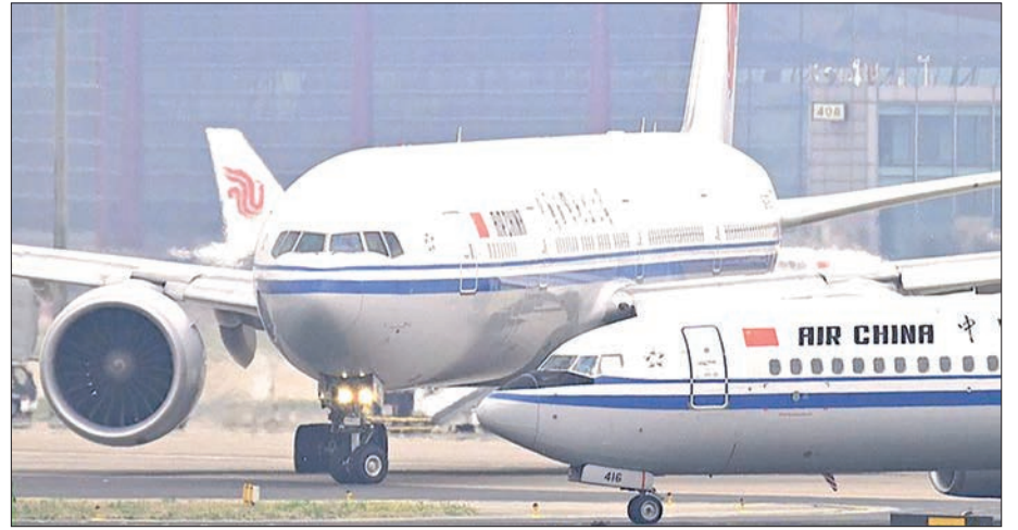
Air China Boeing 737-800 (R) and Boeing 777-300 ER taxi to a runway before takeoff at Beijing Capital Airport in Beijing, China, 9 May 2026.

Meanwhile, the United States will guarantee China a sufficient supply of engines and spare parts, a ministry official said in a statement that provides details on the preliminary outcomes of the recently held China-US economic and trade consultations. — Xinhua