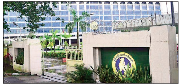
The Central Bank of Myanmar (CBM), Yangon Branch.

According to Section 158 of the Financial Institutions Law, no one is allowed to establish or operate a bank without a license. Any violation of this prohibition will result in legal action under Section 171 of this law. — NN/KK