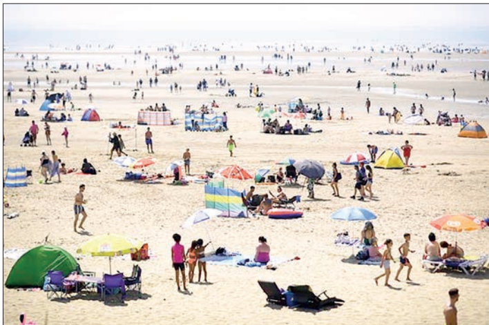
In this file photo taken on 25 July 2019 beach-goers enjoy the sunshine by the sea in Camber Sands, southern England, during a heatwave in Britain.

The country, which recorded its hottest year on record in 2025, has seen extreme weather events intensify in recent years, with unprecedented heat waves, floods that have caused significant damage, and long spells of drought. — AFP