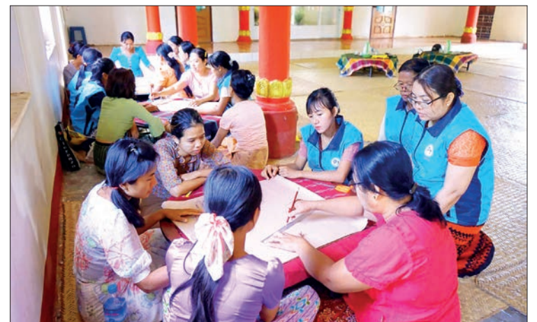
This image shows the presentation about the Rural Family Income Improvement Project.

THE Small-Scale Industries Department (SSID) will implement the Rural Family Income Improvement Project in 214 villages in the 2026-2027 financial year.