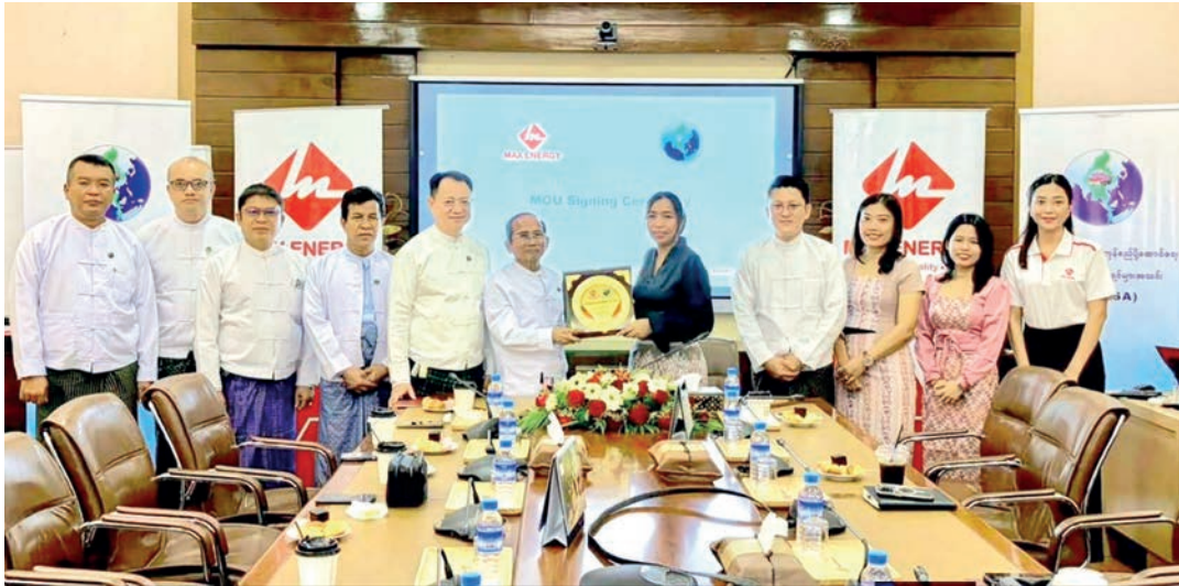
A B2B signing ceremony between the Myanmar Highway Freight Transport Service Association and Max Energy Co Ltd is in progress on 19 May 2026.

THE Myanmar Highway Freight Transport Service Association (MHFTSA) and Max Energy Co Ltd signed a business-to-business agreement on fuel purchase.