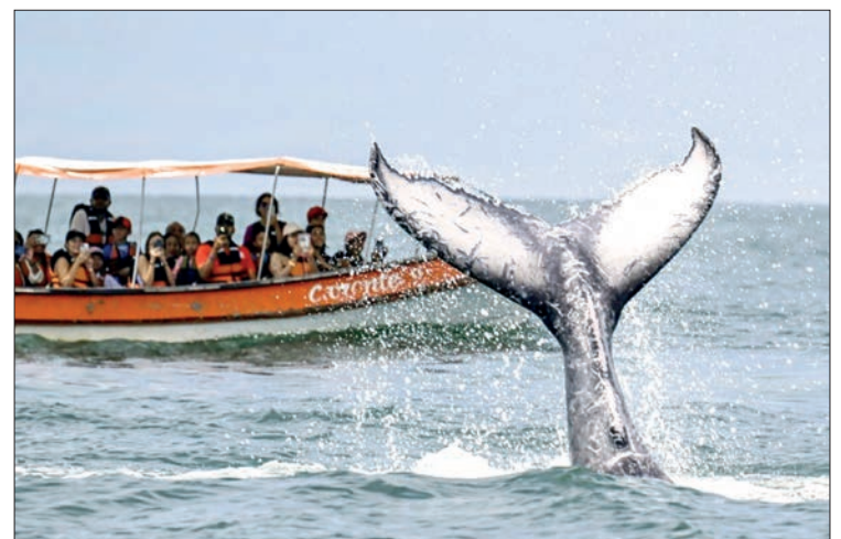
Such vast journeys by humpback whales – which can grow up to 17 metres long – are exceedingly rare.

Another was seen off the coast off Bahia in Brazil before being sighted 22 years later in Hervey Bay, Australia 15,100 kilometres away. The pictures represent the longest-distance ever seen between two pictures of the same humpback whale, researchers said. Such vast journeys by the rorquals – which can grow up to 17 metres (55 feet) long – are exceedingly rare, they added. “Despite their rarity, these exchanges matter for the long-term health of whale populations,” Griffith University PhD researcher and report co-author Stephanie Stack said. — AFP