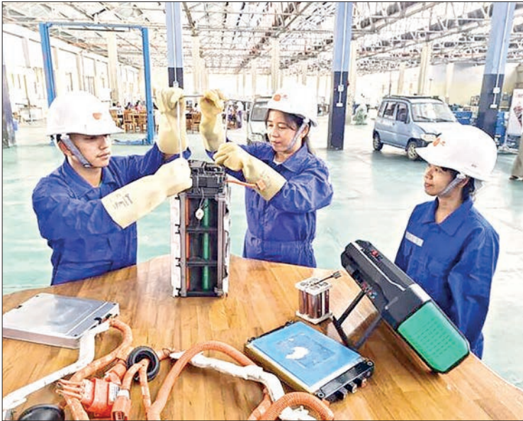
Trainees are seen at the practical session.

rol in the training by 3 September by providing a citizenship scrutiny card copy, a health certificate from the Township Public Health Department, copies of education certificates, a household registration copy, a police clearance certificate and three