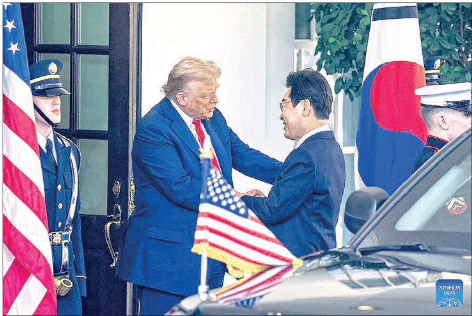
US President Donald Trump (2 nd L) welcomes visiting South Korean President Lee Jae-myung (2 nd R) at the White House in Washington, DC, the United States, on 25 August 2025.

SHARES in a South Korean penmaker surged on Tuesday, an unexpected outcome from the first summit between US President Donald Trump and his counterpart Lee Jae Myung in Washington. Lee signed a guest book before enter-