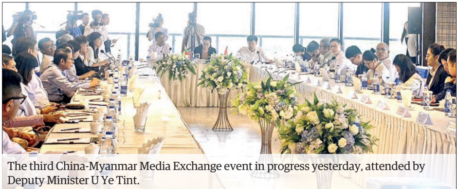
The third China-Myanmar Media Exchange event in progress yesterday, attended by Deputy Minister U Ye Tint.

The exchange concluded with discussions between officials from the Ministry of Information and media representatives from Myanmar and China, focusing on strengthening cooperation for regional peace and community building. — MNA/KZL