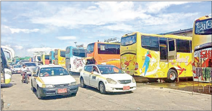
Long-distance express buses are seen at the Aungmingala highway bus terminal.