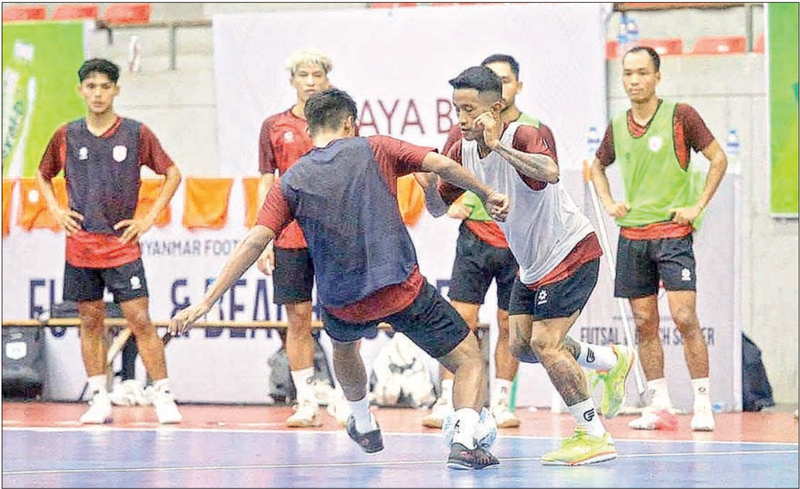
The Myanmar national futsal team is seen during a training session.