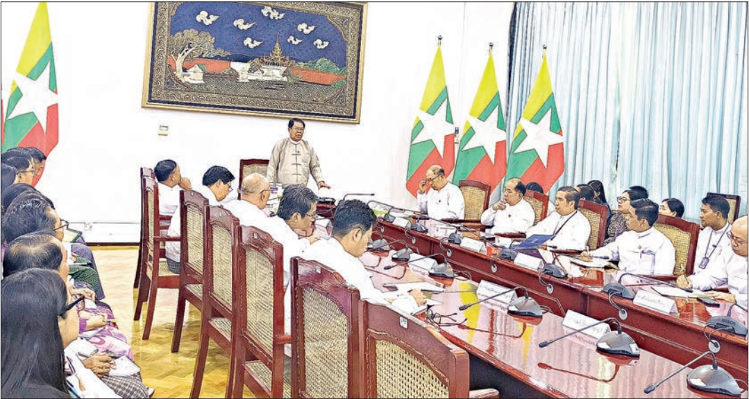
Union Foreign Affairs Minister U Than Swe delivers the speech during the meeting with the personnel who will serve duties at Myanmar's foreign missions.

of the countries where they serve duties. He added that the diplomats should have problem-solving skills, think of better ways to solve the problems, and avoid mutually harmful cases. The Union minister also urged them to be perfect diplomats through continuous learning, to keep promoting their capacities and serve duties successfully. — MNA/KTZH