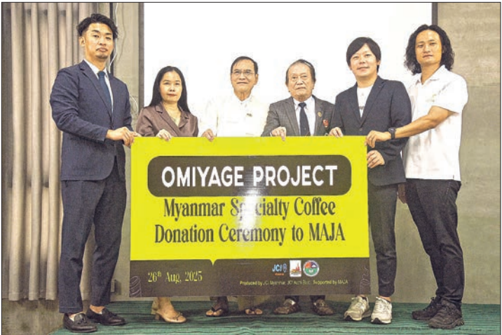
The Omiyage Project facilitates the international promotion of Myanmar coffee.

A programme introducing the collaborative efforts of JCI Myanmar, JCI Aichi Block Japan, and MAJA to promote Myanmar coffee internation-