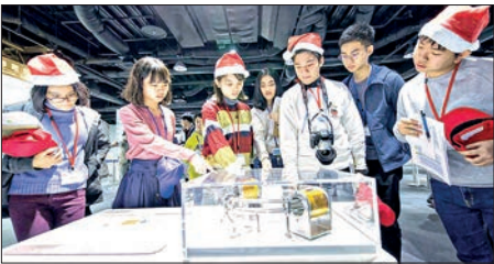
The Toshiba Youth Club Asia proudly announces the launch of TYCA Vol 10 on its page. THE Myanmar Association of Japanese Alumni has announced that applica-

Myanmar-India Friendship and Development Association