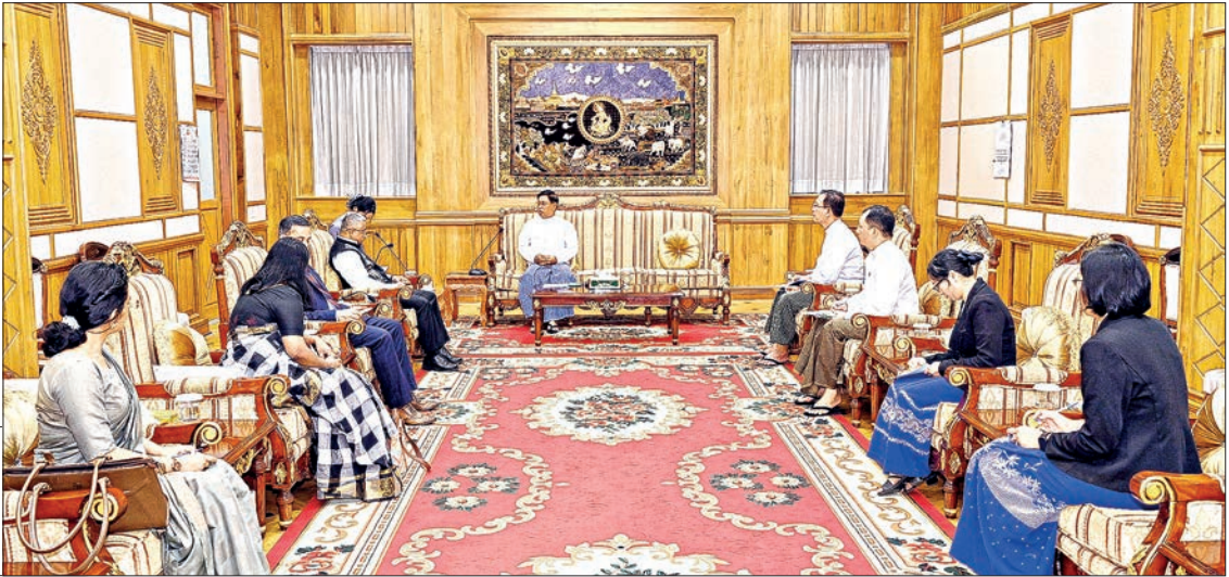
The Indian ambassador calls on Union Minister U Tin Aung San yesterday.

mar and India, matters relating to investment and cooperation, assistance for post-earthquake reconstruction, and the conservation of ancient cultural heritage monuments. Officials from Ministry 1 of the President's Office were also present at the meeting. — MNA/MKKS