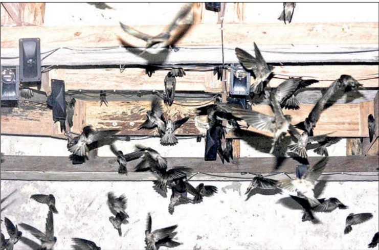
This photo showcases swiftlet birds in a farm.

kyant, Hlinethaya, Okkan and other townships. “These birds like quiet places. That’s why there are many farms in Htaukkyant, Hlaing Thaya, Okkan and Thitseikkone. Land in these locations is not very expensive”, he continued. China and Thailand are reportedly the main buyers of high-quality raw bird’s nests. “China and Thailand buy raw bird’s nest. They also purchase from our Bahan Bird’s Nest factory, as Myanmar products are better than those of Thailand. As it is organic farming, the quality is better,” he said. — Htet Oo Maung/ZN