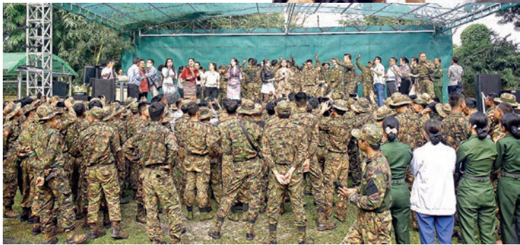
Photos above and left below showcases Tatmadaw and Police members enjoying performances by artistes.

artistes, and highlighted the sacrifices of Tatmadaw and police members to regain state stability, whereas the management and reconstruction processes of