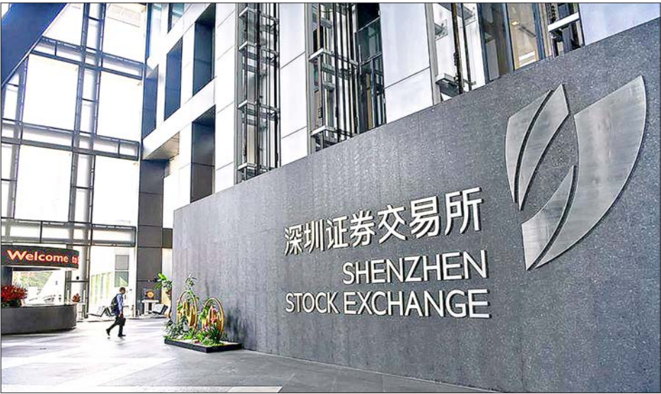
This file photo shows the Shenzhen Stock Exchange in Shenzhen, south China's Guangdong Province.

Stocks related to pork and video games led the gains, while stocks related to contract research organizations