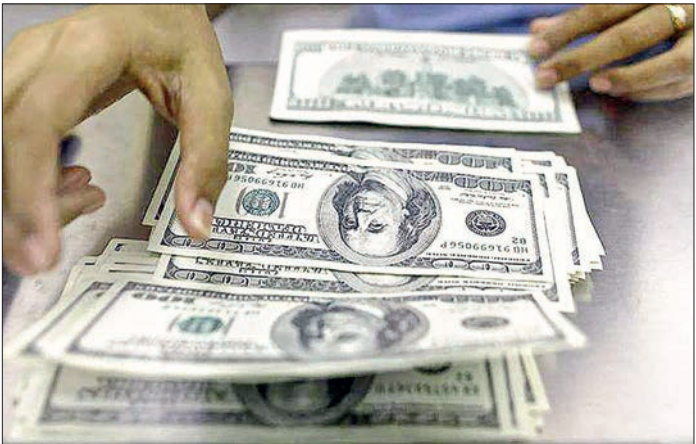
Greenbacks being counted at the currency exchange counter.

CBM sold $36.5 million purchased from companies working on a Cut, Make and Pack basis, in addition to the injection of $8.8 million, 13.3 million baht, 10.5 million yuan and 500,000 rupees in July. Furthermore, CBM sold over $2.3 million to other commodities-importing companies as per its initial announcement of selling $10 million. CBM sold $8.4 million, 13.9 million baht and 5.2 million yuan in June 2025, in addition to the injection of $14.9 million that was purchased from the CMP enterprises into the financial market. CBM aims to curb the instability in the foreign exchange market and currency devaluation. According to CBM's notification on 15 March 2024, it has been collaborating with law enforcement agencies to combat and prosecute those who attempt to manipulate the currency market under the existing laws. CBM allowed authorized dealers (private banks) to operate online foreign exchange trading freely as per the market rate, depending on supply and demand, starting from 5 December 2023. — NN/KK