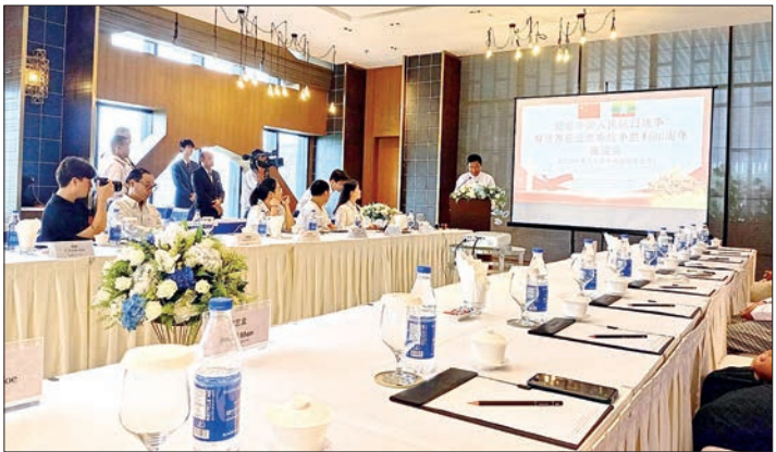
The 2025 Third Quarter Myanmar-China Media Meeting in progress yesterday in Yangon.