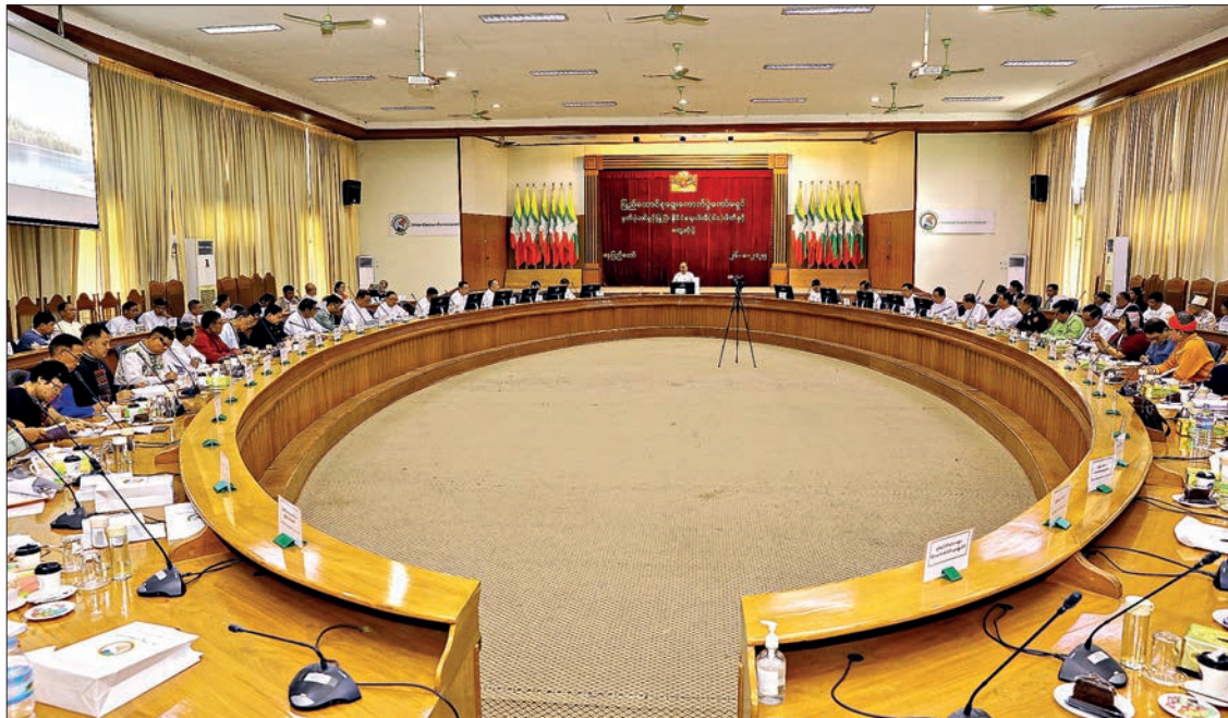
The meeting between the Union Election Commission and political parties is underway yesterday in Nay Pyi Taw.

The chairman reminded political parties that when submitting candidate lists for the legislature, they must comply with the legally stipulated number of constituencies and qualifications. Candidates must have completed at least basic education high school, and for upcoming elections, candidates should hold degrees from recognized universities or colleges. Political parties are encouraged to select