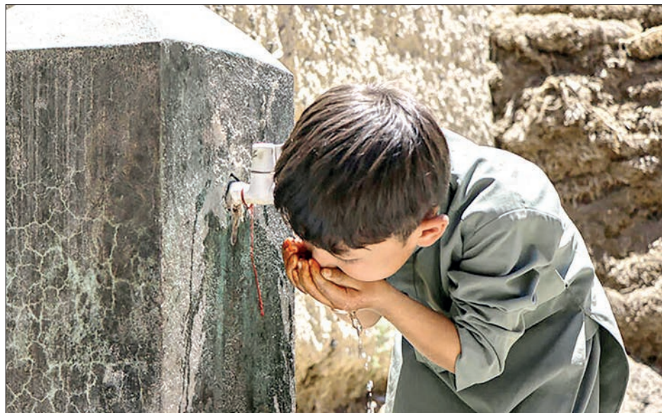
(FILES) An Afghan Hazara boy drinks water from a tap in Qavariyak village in Shibar district of Bamiyan province on 18 June 2025.

Since 2015, 961 million people have gained access to safely-managed drinking water, with coverage rising from 68 per cent to 74 per cent, the report said. — AFP