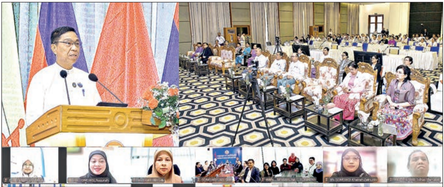
The 12 th ASEAN Ministerial Meeting on Social Welfare and Development and related meetings underway online, addressed by Union Minister Dr Soe Win.

THE 12 th ASEAN Ministerial Meeting on Social Welfare and Development (AMMSWD) and Related Meetings was being held via videoconferencing at M-Gallery in Nay Pyi Taw from 26 to 29 August.