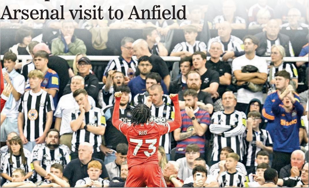
Liverpool's English striker (73) Rio Ndombi celebrates in front of the Newcastle fans after scoring their third goal during the English Premier League football match between Newcastle United and Liverpool at St James' Park in Newcastle-upon-Tyne, north east England on 25 August 2025.

will take place from 5 to 8 September, semifinals on 9 September, and finals, third-place, and classification matches on 11 September. Myanmar will face New Zealand on 5 September, Indonesia on 6 September, and Oman on 8 September. — Shine Htet Zaw/KZL