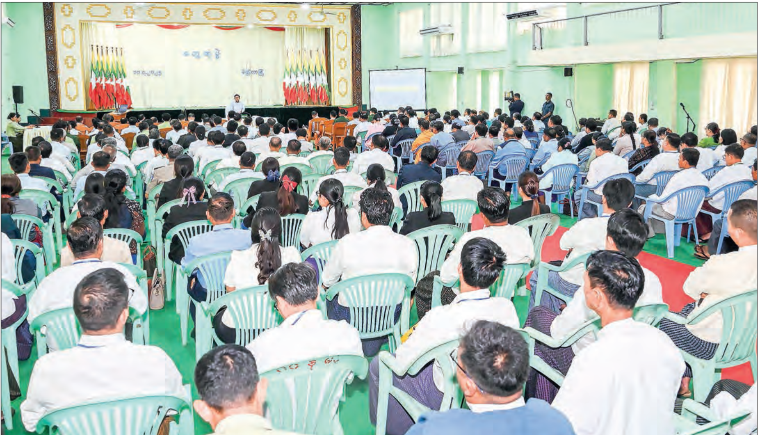
State Administration Council Chairman Prime Minister Senior General Min Aung Hlaing addresses the meeting with district and township-level departmental officials, local elders, and MSME businesspeople from Meiktila District in Mandalay Region yesterday.

S tate Administration Council Chairman Prime Minister Senior General Min Aung Hlaing met district and township-level departmental officials, local elders and MSME entrepreneurs from Meiktila District in Mandalay Region at the Kandaw Mingala Hall in Meiktila yesterday morning and discussed regional development.