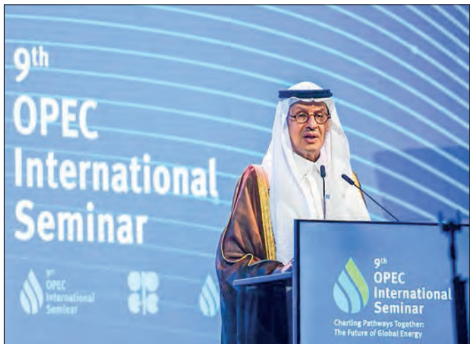
Saudi Energy Minister Abdulaziz bin Salman Al Saud delivers a speech at the opening ceremony of the 9th OPEC International Seminar in Vienna, Austria, on 9 July 2025.