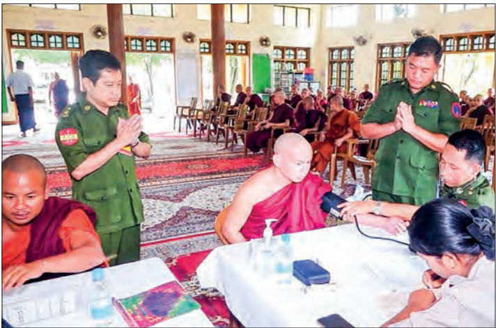
Healthcare services are underway for monks.

A mobile medical team from the Northern Command provided healthcare services to 80 members of the Sangha on the morning of 10 July in Myitkyina Township. The team visited a monastic school and conducted medical checkups for general illness, bone and joint conditions, neurological issues and surgical needs. Electrocardiogram (ECG) tests were performed, and X-ray diagnostics were conducted to identify further treatment requirements. Monks in need of advanced care were referred to military hospitals for continued treatment. Similarly, a mobile team from the Yangon Command conducted medical outreach at Dhammayon Hall in Kalawe Village in Thanlyin Town-