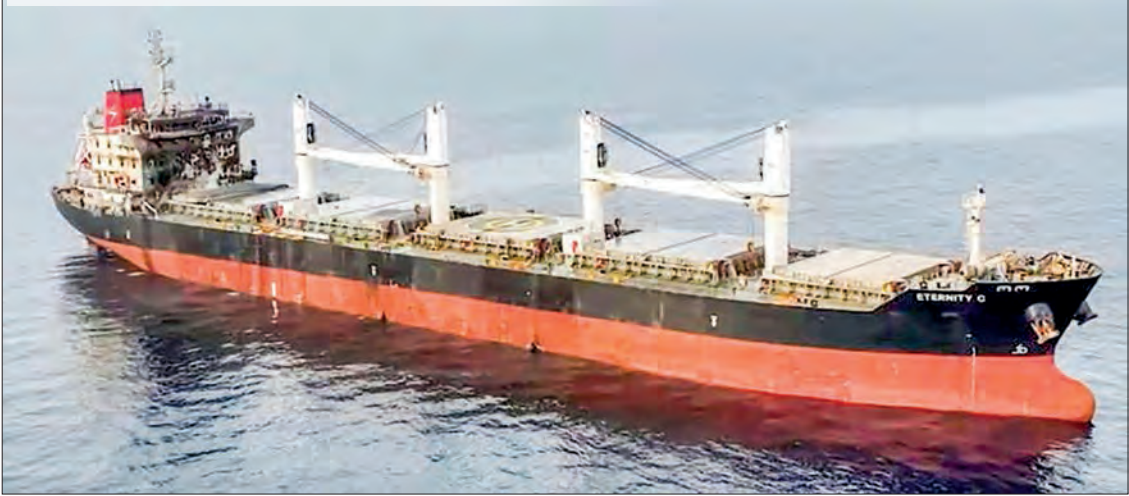
A handout picture from Huthi media showing damage from the group’s attack on the Eternity C, before the ship later sank.

and taken them to a safe location. The US embassy for Yemen accused the rebels of kidnapping the survivors. The deadly attack was the second such assault on a commercial vessel in recent days, marking a serious escalation in a key waterway and threatening a May truce with the United States meant to safeguard freedom of navigation in the Red Sea and Gulf of Aden.