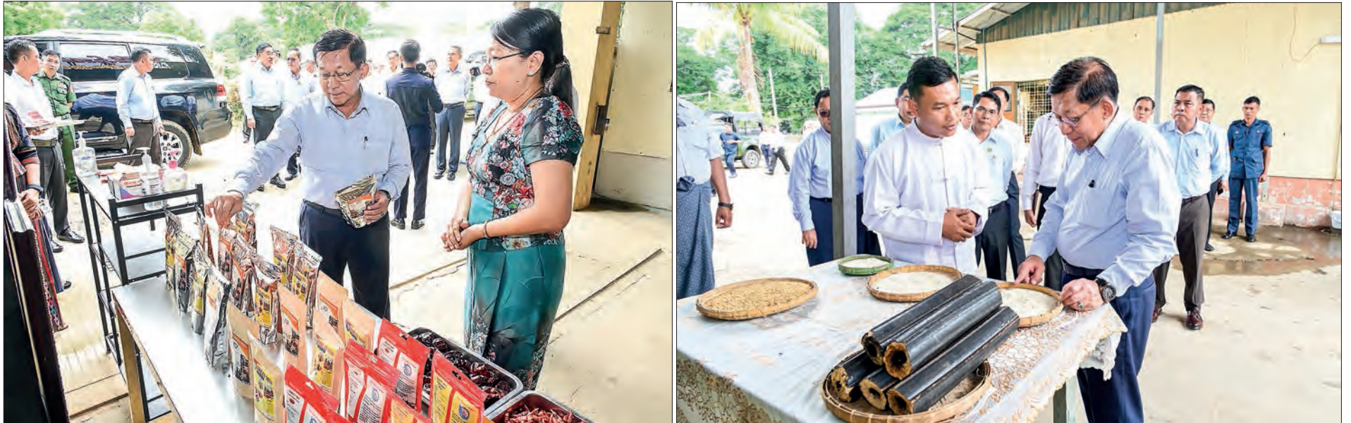
State Administration Council Chairman Prime Minister Senior General Min Aung Hlaing looks into the exhibits produced and displayed by MSMEs from Meiktila District, Mandalay Region.