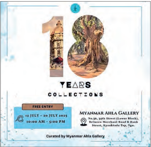
An invite poster for the exhibition.

AN art exhibition titled ‘18 Years Collections’ will be held from 12 to 20 July at the Myanmar Ahla Gallery in Kyauktada Township, Yangon Region, according to one of the event organizers. The exhibition will showcase selected paintings from a private collector who has spent the past 18 years curating artworks from both classic and contemporary periods. The pieces on display have been carefully evaluated and selected in collaboration with professional artists to ensure quality and authenticity. “The goal is to create a trustworthy space at Myanmar Ahla Gallery where art lovers