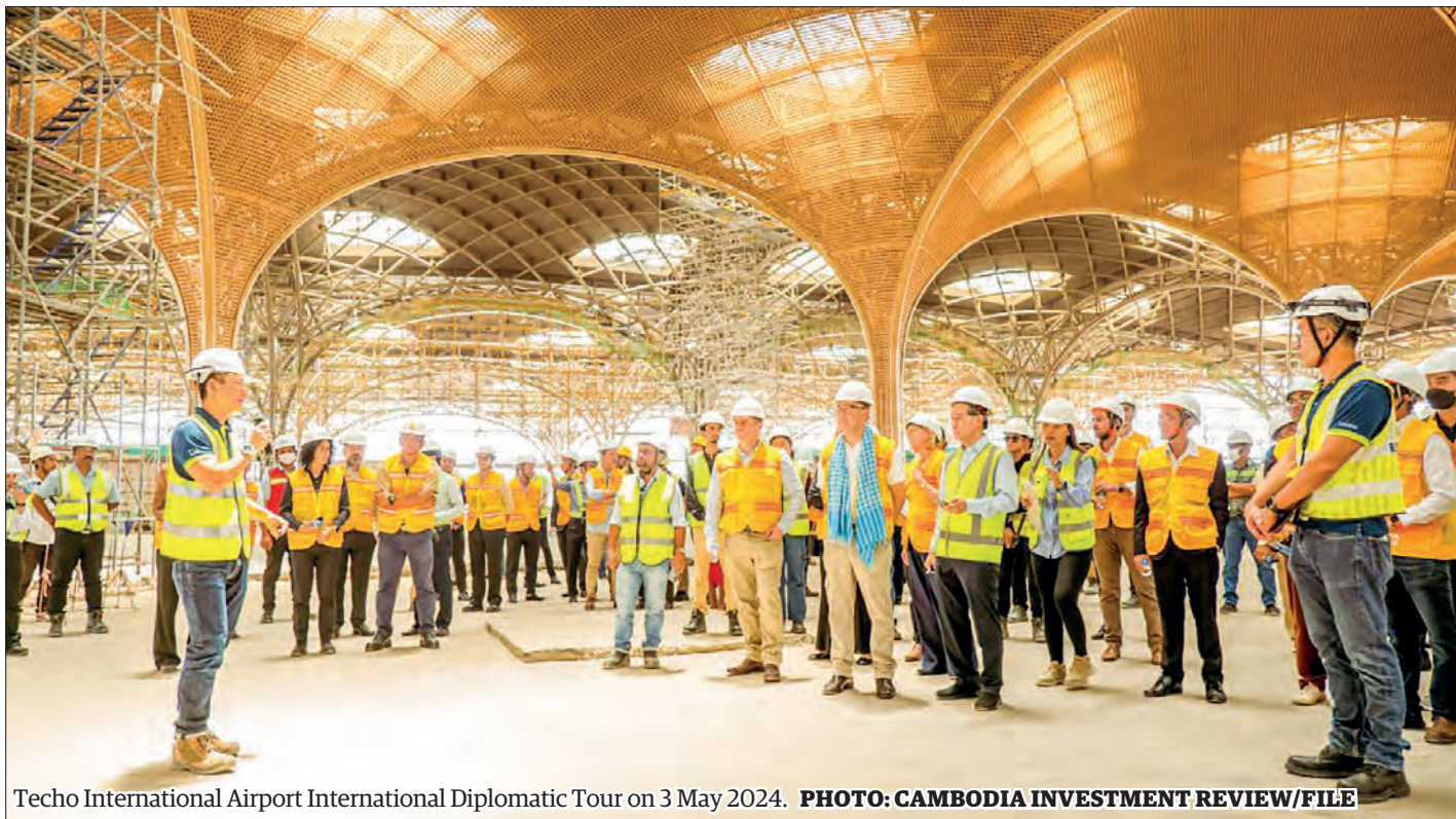
Techo International Airport International Diplomatic Tour on 3 May 2024.

The airport is situated on a 2,600-hectare site in southern Kandal and Takeo provinces, approximately 20 kilometres from Phnom Penh. Construction of the airport began in 2020.