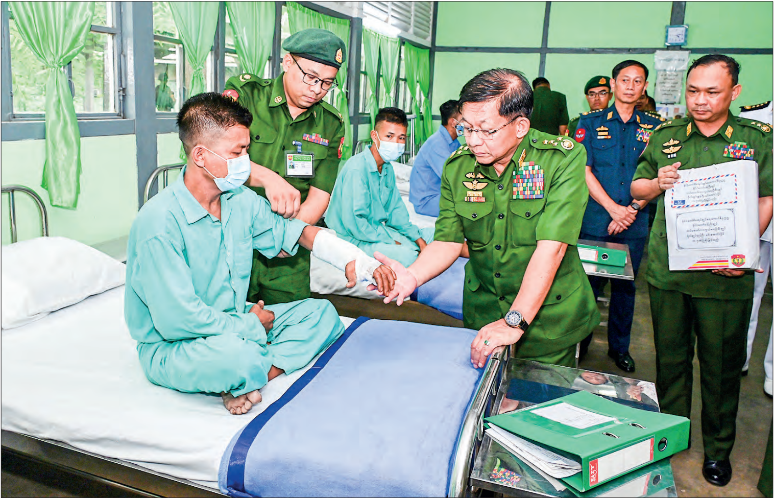
State Administration Council Chairman Defence Services Commander-in-Chief Senior General Min Aung Hlaing offers comfort to Tatmadaw patients at the Tatmadaw Hospital in Meiktila.

In his guidance, the Senior General stressed the need to provide medical protection and