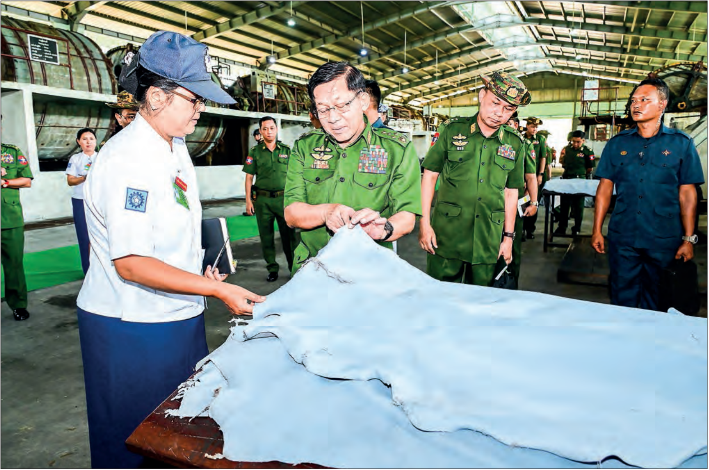
State Administration Council Chairman Defence Services Commander-in-Chief Senior General Min Aung Hlaing looks into the leather material produced by the Tatmadaw Leather Factory (Meiktila).

In his guidance, the Senior General said that Tatmadaw manages the distribution of clothes and equipment produced by Tatmadaw factories for the convenience of Tatmadaw members, similar to gov-