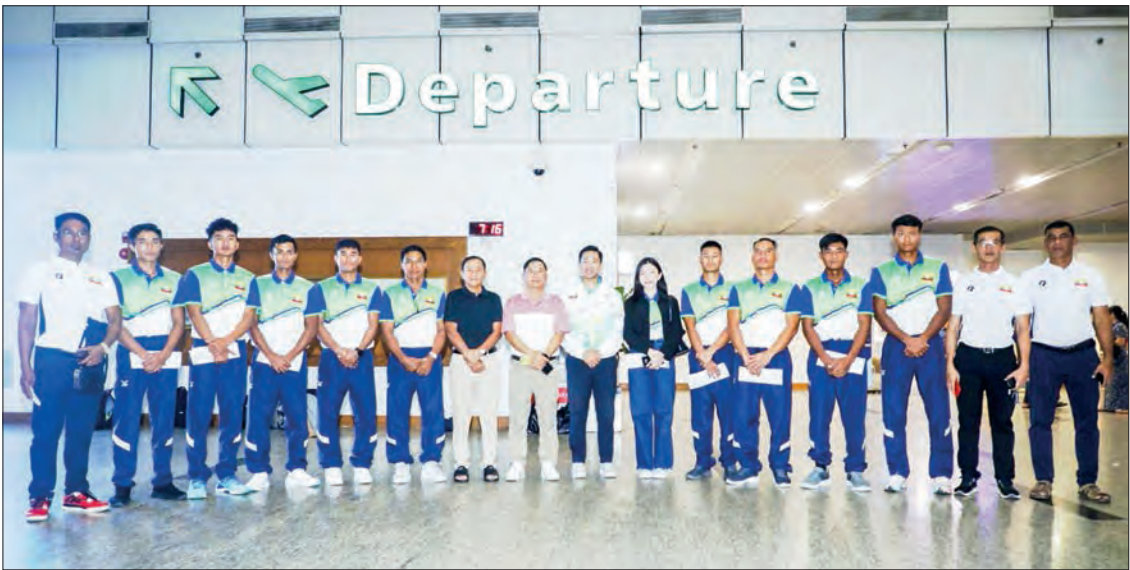
The Myanmar team is seen before the departure for Singapore.