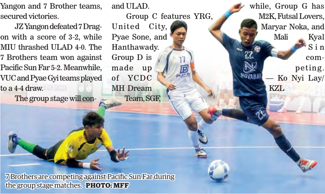
7 Brothers are competing against Pacific Sun Far during the group stage matches.

Group C features YRG, United City, Pyae Sone, and Hanthawady. Group D is made up of YCDC, MH Dream Team, SGF, KKY and Water King. Group E includes Winner Generations, Gold Dream, Ruby Volcanose and Kyaung Sayar Tharhtwe. Group F consists of G-UPT, TG United, Shwe Pyi Thar United and Taw Win Nan. Meanwhile, Group G has M2K, Futsal Lovers, Maryar Noka, and Mali Kyal Sin competing.