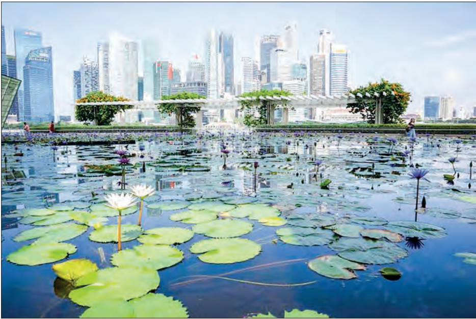
This photo taken on 13 August 2024 shows the business district at Singapore's Marina Bay.

The grant, available for a time-bound period of two years, will support enterprises that export to or operate in overseas markets and are affected by tariff measures. It will fund services such as free trade agreement and trade compliance advisory, legal and contractual guidance,