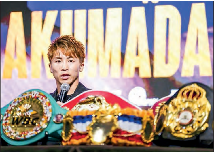
Japan's undisputed super-bantamweight world champion Naoya Inoue will defend his titles against Uzbekistan's Murodjon Akhmadaliev in September.

"I want to train with a high level of vigilance," he said. Inoue was knocked down for only the second time in his career against Cardenas, taking a left hook from the heavy underdog in the second round. He climbed off the canvas to stop Cardenas 45 seconds into the eighth round after a flurry of powerhouse punches. It was Inoue's fourth title defence since becoming undisputed super-bantamweight champion and his second of the year after knocking out South Korea's Kim Ye-joon in the fourth round in Tokyo in January. Akhmadaliev (14-1, 11 KOs) beat Mexico's Luis Castillo in his previous fight in May. — AFP