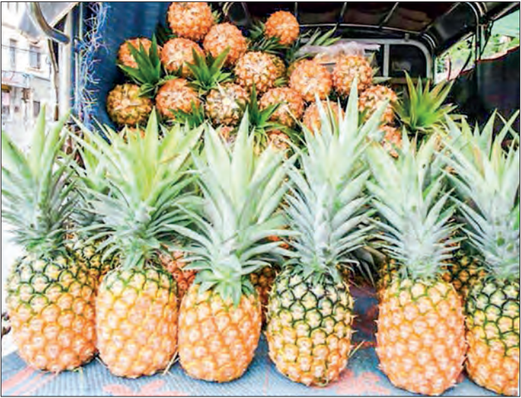
This photo shows pineapples from Shan States.

from northern Shan State, is endeavouring to export pineapples to China through border trade channels. That company has already sought registration with the Customs of the People's Republic of China (GACC) in 2024. The Agriculture Department's Plant Protection Division notified companies to submit an Expression of Interest (EOI) and seek registration with the Customs of the People's Republic of China (GACC) by 28 February 2025 for legitimate pineapple exportation. According to the Sanitary and Phytosanitary (SPS) Protocol between Myanmar and China, inspection procedures are undertaken yearly to verify compliance with the standards. The General Administration of Customs of the People's Republic of China (GACC) announced on 11 November that Myanmar's pineapple will be allowed to be imported to China, following the Phytosanitary regulation. Myanmar's pineapple is cultivated in northern and southern