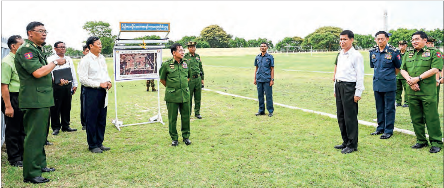
The Senior General views the Meiktila District Stadium, which will be planned to upgrade it.