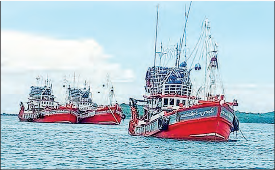
Fishing vessels are seen in Myanmar waters.

MYANMAR exported over 55,900 metric tonnes of fish with an estimated value of US$64.2 million in the first quarter of the current FY 2025-2026 beginning 1 April, according to the Department of Fisheries.