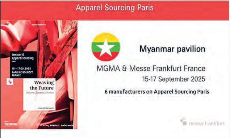
Images of Apparel Sourcing Paris.

THE Myanmar Garment Manufacturers Association (MGMA) has invited applications for product samples to be displayed at the Apparel Sourcing Paris exhibition in Paris, France. MGMA said that the Myanmar pavilion will join the event, which will take place in Paris from 15 to 17 September, organized by Messe Frankfurt. As a business entity, MGMA will boost the Myanmar garment industry and also promote products of its member companies through its booths. MGMA has urged local garment makers to join the event, and each company is eligible to exhibit at least 2 to 5 product samples. Product samples will be conveyed by DHL Express, and delivery charges need to be paid to MGMA. If there are so many applications, about 4 product samples per factory will be allowed. It is Europe’s top trade source exhibition which can bring a wide range of opportunities for making and exporting knitwear, casual wear, sportswear, outerwear and corporate wear. Including this time, MGMA has participated in the Apparel Sourcing Paris for five years. The deadline for applications is 25 July, and for product samples is 7 August. For more information, enquiries can be made in person at the MGMA office or 09 758451158. — MT/ZS