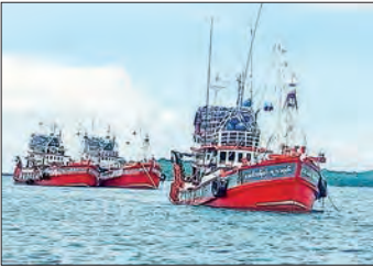
Myanmar ships over 55,000 tonnes of fish in Q1