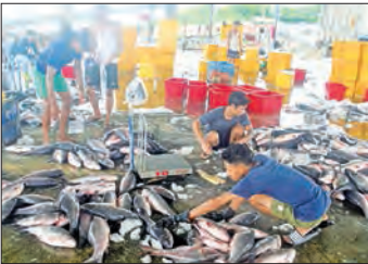
Daily seafood flow hits 500,000 tonnes at Yangon markets