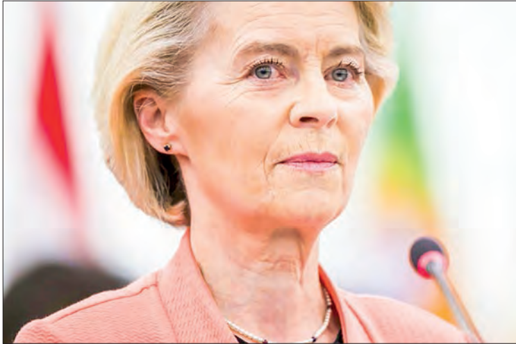
EU Commission President Ursula von der Leyen.

Ursula von der Leyen survived the vote by a significant margin, with 360 Members of the European Parliament (MEPs) rejecting the motion, 175 supporting it, and 18 abstaining.