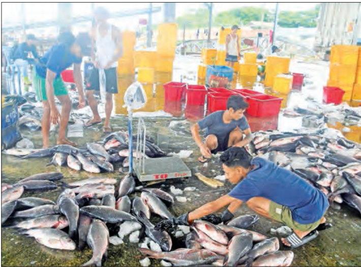
This picture shows Kyimyindine and Hlaing fish markets with bustling trade activities.

MYANMAR Fisheries Federation stated that about 500,000 tonnes of freshwater and saltwater fish and seafood steadily flow into the Yangon market daily starting from July. The fish spawning season ended, so the Myanmar sea is open to fishing. With commercial fishing resuming, fifty per cent of seafood is distributed to domestic markets and the remaining is stored in cold storage facilities designated for exports. Kyimyindine’s Sanpya Fish Market and Shwepadauk Fish Market in Hlaing Township are the seafood hub that handles a daily supply of about 500,000 tonnes of seafood, with which freshwater to saltwater fish ratio is 3:1. “Seafood businesses are thriving this year. Seafood supply meets the satisfaction of both consumers and sellers. Fish stored in cold storage were sold in the market in the previous fishing off-season,” said a trader involved in Sanpya Fish Market.