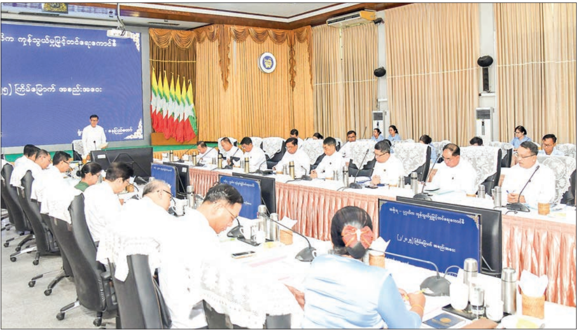
The meeting of the Government-Private Trade Promotion Council in progress yesterday, chaired by Deputy PM MoTC Union Minister General Mya Tun Oo.

DEPUTY Prime Minister, Union Minister for Transport and Communications General Mya Tun Oo, who is also the Chairman of the Government-Private Trade Promotion Council, attended the second meeting of the council yesterday. Speaking at the event, the Deputy Prime Minister said that although there were impacts after the recent earthquake, the council held the meeting as per the scheme of once every four months to facilitate the trading sector. The work processes for the National Export Strategy 2020-2025 are nearly finalized, and efforts should be made to implement the National Export Strategy 2026-2030. The government-private organizations should together draft the Plan of Action (PoA) for the National