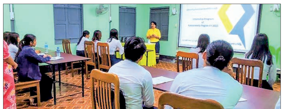
Students undergoing both theoretical and practical training under MPT's workplace learning and training programme.

MPT has also implemented a free online educational platform at https://csrelearning.mpt.com.mm/ , offering accessible training for youth nationwide. The workplace learning and training programme was first launched in 2018 and has since provided over 2,000 students from technological and computer universities with practical training and industry-related knowledge. — Thit-sa (MNA)/KZL