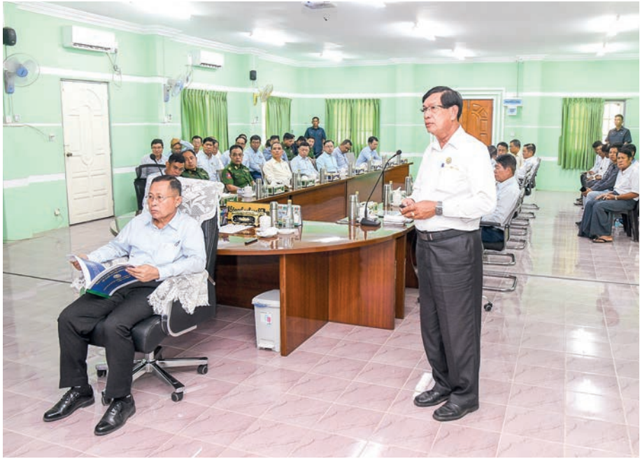
SAC Vice-Chair DPM Vice-Senior General Soe Win hears the reports on production outputs during an inspection tour of Yangon Region's Nyaungnapin Agriculture and Livestock Zone.

Speaking on the occasion, the Vice-Senior General said that it is necessary to ensure that there is an adequate supply of meat, fish, eggs, and vegetables — the daily essentials consumed by the people living in Yangon Region. Since current production levels are still insufficient, it is essential for planners, responsible officials from the regional government who oversee the implementation of these plans, and producers who are to carry them out, to calculate and ensure a balance between supply and demand based on the population, to achieve food security. Furthermore, supervisors at various levels must systematically monitor and enforce the implementation,