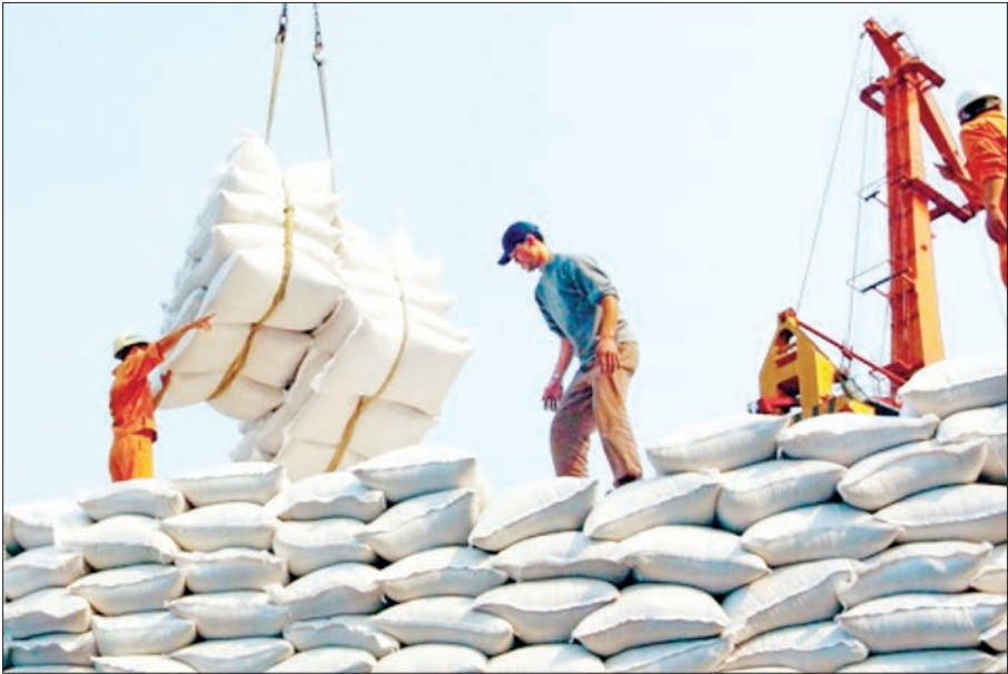
Rice sacks designated for exports are seen being loaded onto the ship.