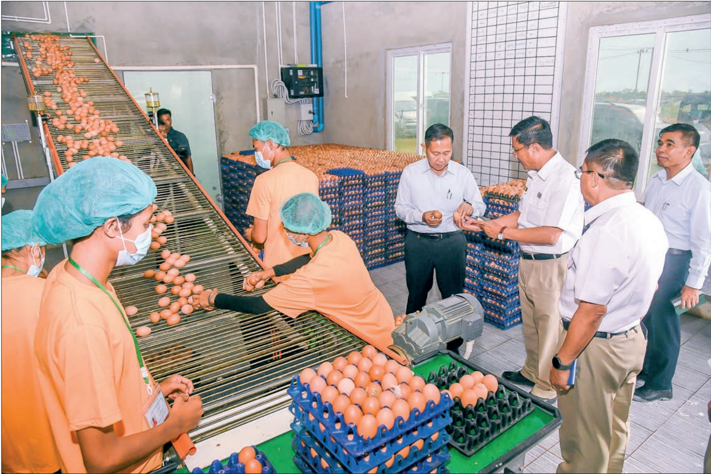
State Administration Council Vice-Chair Deputy PM Vice-Senior General Soe Win looks into the production of eggs at the Shwe Pyi agriculture and livestock zone project.

SAC Vice-Chairman DPM Vice-Senior General Soe Win visits agricultural and livestock farms at the Nyaunghnapin agriculture and livestock special zone.