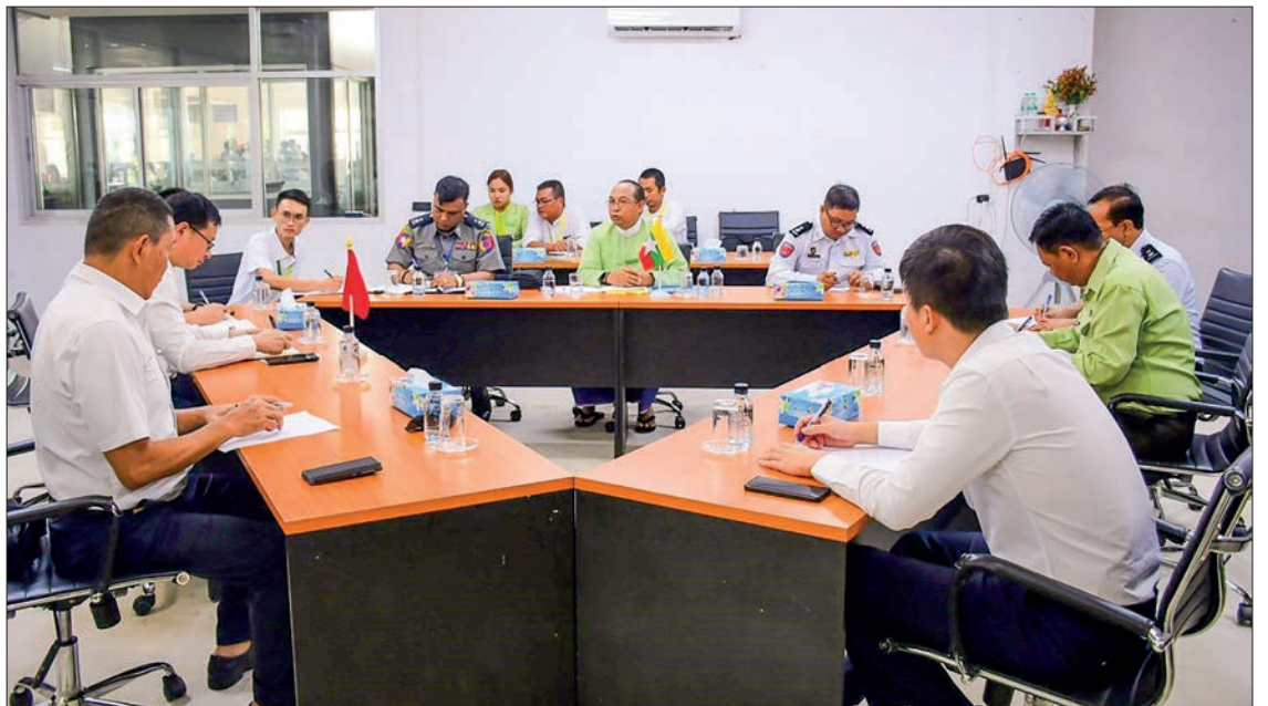
The discussion between Myanmar and China to expedite the transfer of undocumented foreign entrants underway at the meeting hall of the Myanmar-Thailand Friendship Bridge II.