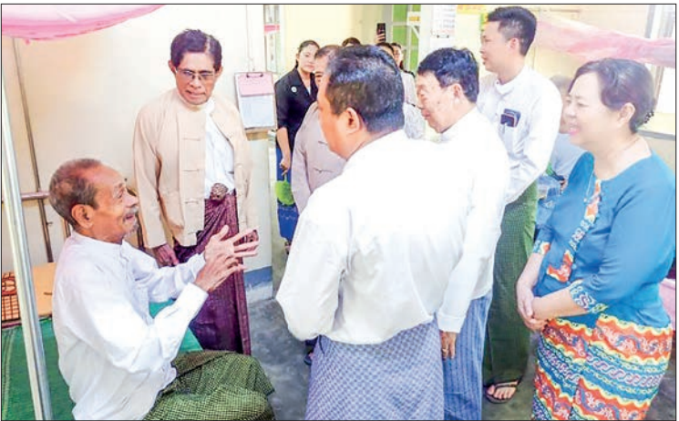
The MNHRC inspection team warmly greet the older people.

clean drinking and household water, freedom of religion and belief, and overall hygiene and sanitation standards of dormitories, bathrooms, toilets, and kitchens. They also enquired about arrangements for recreation and relaxation, accessibility of pension payments for eligible residents, and the availability of social pension support for those aged 85 and above. The team extended warm words of encouragement to 80 elderly individuals residing at the facility. The inspection team will send its findings and recommendations to the relevant department for necessary action under the Commission law. — MNHRC