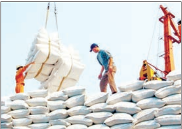
MRF targets Pawsan rice export boost with modern packing