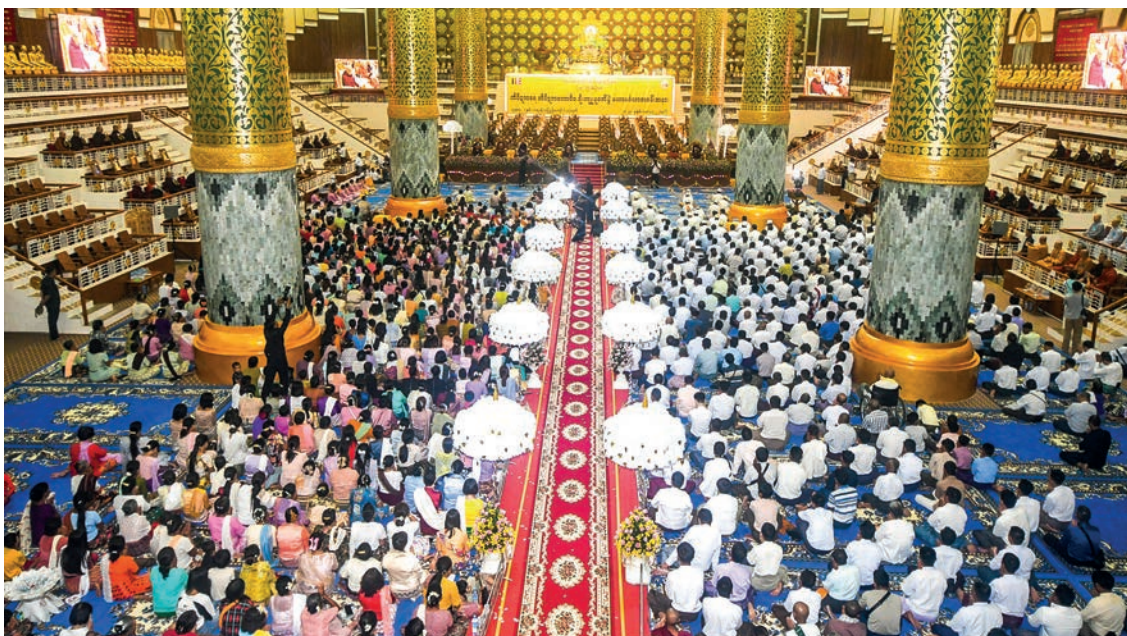
The offering of titles and certificates to recipient monks in the 77 th Tipitakadhara Tipitakakovida Selection Examination in progress yesterday in Yangon.

After the ceremony, the Vice-Senior General and party inspected the painting at the Maha Pasana Cave, repair of sound-proof walls and pipelines, installation of a 630-kilogramme elevator and fixing the lightning conductor and left necessary instructions. — MNA/TTA