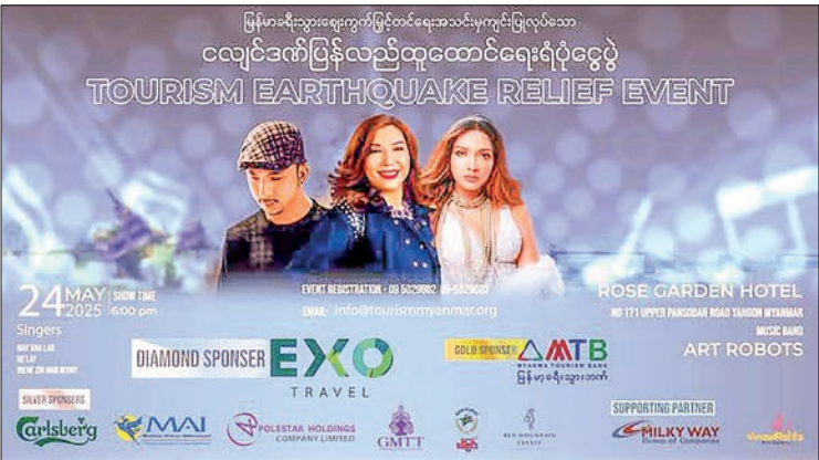
This image showcases an advert poster for the Tourism Earthquake Relief Event.