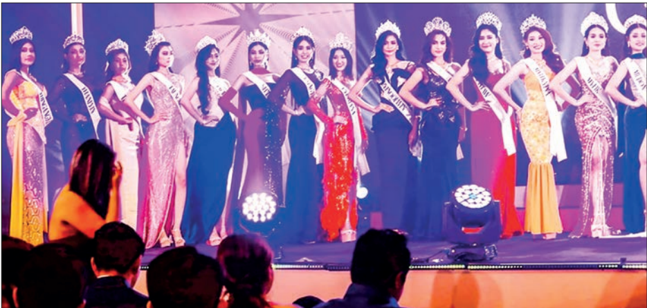
This photo showcases contestants from a Miss Universe Myanmar competition.