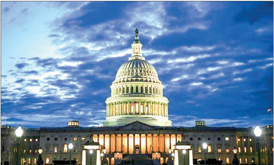
Senator Rand Paul has warned that this bill could lead to an unprecedented economic crisis in the United States.

“While tariffs make wars more likely, embargoes make wars difficult to avoid. Senator Lindsey Graham’s* Sanctioning Russia Act calls for 500 per cent tariffs on dozens of countries and essentially amounts to an embargo,” Paul said in an article for Responsible Statecraft. “If this bill were to pass, it would cause an economic calamity on a scale never before seen in our country.” Paul believes that while aimed at Russia, the bill also harms US allies and America itself, reflecting Washington’s failed attempts to impose its will on Russia. The senator noted that the bill orders the president to impose 500 per cent tariffs on imports from any country trading key energy resources with Russia with the rate doubling every 90 days and potentially reaching 1,000 per cent within months. — SPUTNIK