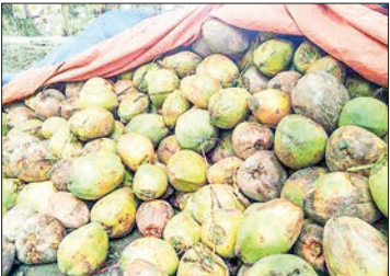
MFVP urges dry coconut shell suppliers to tap Korean market