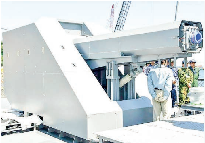
Instead of using gunpowder to shoot an artillery shell, railgun technology uses electromagnetic energy to fire off a projectile along a set of rails at ultra-high velocity.

icy and looks to sell more military equipment to other countries. In particular, Japan’s Mitsubishi Heavy Industries (MHI) and Germany’s Thyssen Krupp Marine Systems (TKMS) are competing for a major contract to supply the Australian navy with new warships. — AFP