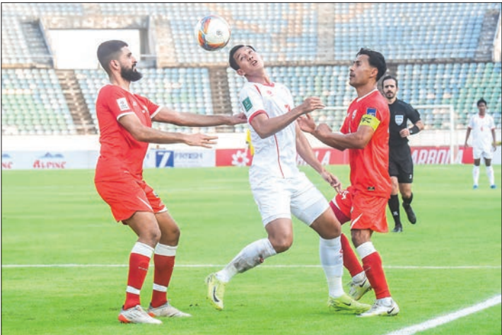
Myanmar and Afghanistani players are competing during the match.