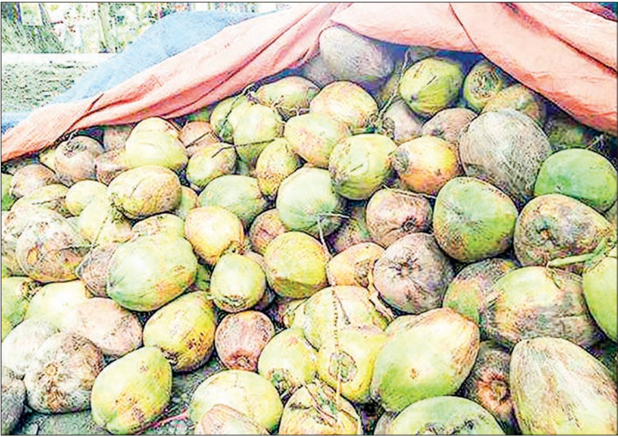
Fresh coconuts harvested in Ayeyawady Region.

Both dried and fresh coconuts offer a variety of health benefits. Coconut is used in religious events in Myanmar, and it is mostly utilized in traditional snacks and curry. Furthermore, it has been widely used in the cosmetic and Asian food industries so coconut businesses have boomed in regional countries. Therefore, they are