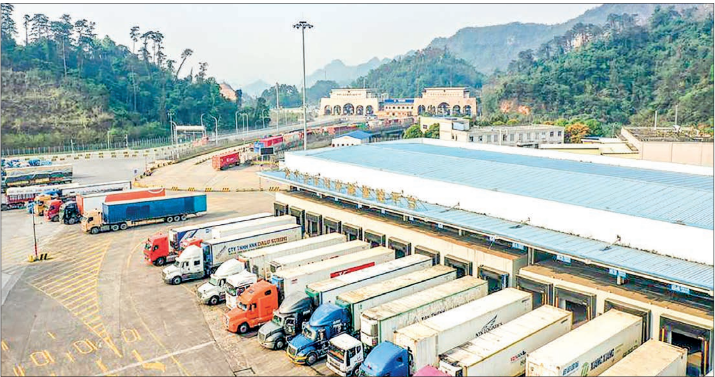
An aerial drone photo taken on 21 March 2025 shows trucks loaded with fruits from ASEAN countries waiting for customs clearance at the port of the Friendship Pass in Pingxiang, south China’s Guangxi Zhuang Autonomous Region.

Both parties aim to formally sign the CAFTA 3.0 upgrade protocol by the end of this year.