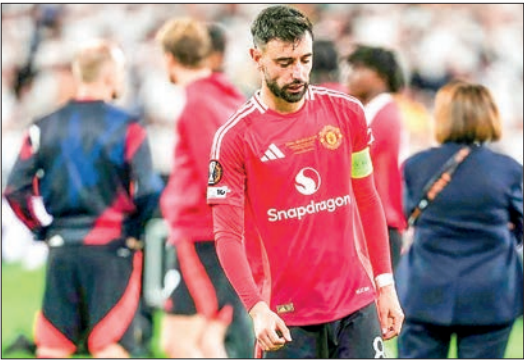
Manchester United captain Bruno Fernandes.