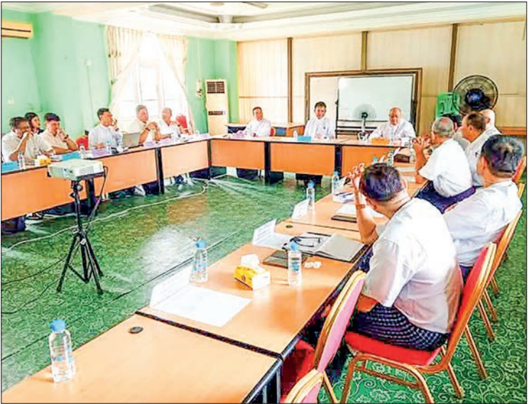
A tripartite meeting in progress at the Department of Marine Administration in Dawbon on 21 May.

lost, it said. If a seafarer goes ashore and does not return to the ship on time, it is his default and he must admit it and apologize, failing which he will be punished. In addition, MSF has informed that the punishment to be imposed will be announced after the decision is made. — MT/ZN