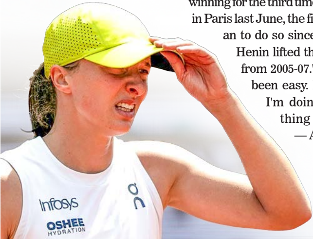
Iga Swiatek is without a title since winning Roland Garros for a fourth time last year.

IGA Swiatek has reigned supreme at Roland Garros since winning the Grand Slam for the first time as a teenager in 2020, but a difficult past year means she is far from the obvious choice this time for the title. Swiatek dropped to a ranking of fifth this week, ending a 173-week stay inside the top two which now likely means she faces a tougher path to a fifth French Open crown in six attempts. She is without a title since winning for the third time in a row in Paris last June, the first woman to do so since Justine Henin lifted the trophy from 2005-07. "It hasn't been easy. For sure I'm doing something wrong." — AFP