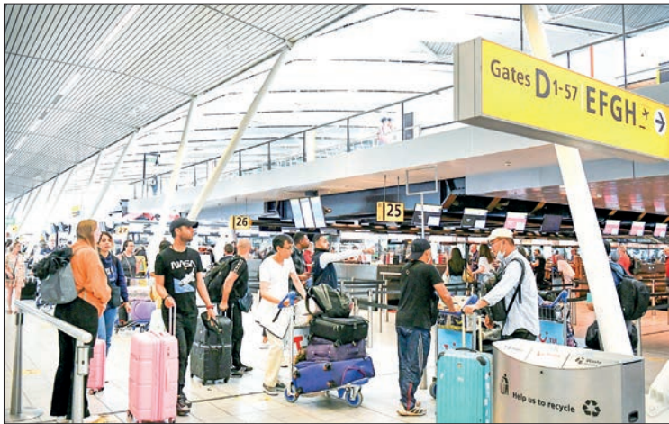
The action by the consumer groups names easyJet, Norwegian, Ryanair, Transavia, Volotea, Vueling and Wizz Air.

SIXTEEN European consumer groups have urged the EU to take action against seven budget airlines over “misleading” baggage fees, accusing carriers like Ryanair, Wizz Air, and easyJet of violating EU rules and causing confusion at check-ins with inconsistent and costly luggage policies. Sixteen European consumer groups on Wednesday called on the European Union to take action against seven low-cost airlines over their baggage fees. The European Consumer Organisation, BEUC, which has overseen the initiative, accuses airlines of “misleading” passengers and creating “confusion” and “distress” at check-ins with their different policies. The action by the consumer groups names easyJet, Norwegian, Ryanair, Transavia, Volotea, Vueling and Wizz Air. Passengers can pay up to 280 euros ($315) to take on a suitcase, depending on the airline, according to the consumer groups. They say that the fees and policies imposed by the airlines breach European Union aviation regulations and European Court of Justice rulings. The groups, which come from 12 EU nations, have sought an investigation by the European Commission and national consumer authorities in EU states. They also demanded sanctions for the “illegal” practices. — AFP