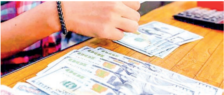
The US dollar exchange rate has steadied following the CBM’s announcement, allowing for free trading at market prices.

50 million baht to importers. CBM sold over $1.62 million on 13 May and over $820,000 and 1.5 million baht on 12 May.