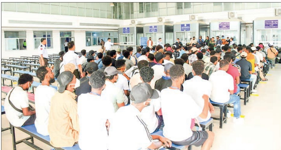
Immigration officials processing the deportation of Ethiopians.

MYANMAR authorities have deported 151 Ethiopian nationals found to be involved in telecom fraud and other criminal activities. These individuals had illegally entered Myanmar via border routes after transiting neighbouring countries, including Thailand. They were active in online gambling and scam operations in areas such as Myawady-Shwe Kokko, Mahtawthalay (KK Park), and Kyaukkhet in Kayin State.