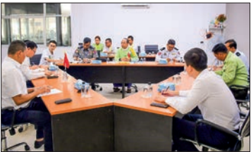
Myanmar, China discuss rapid transfer of illegal foreign entrants