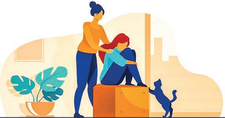
The study aims to investigate the risk and protective factors influencing depressive symptoms, encompassing biological, psychological, and social dimensions.

This marks the NHG’s first comprehensive longitudinal study on depression. Previous research efforts were cross-sectional, collecting data at a single point in time. While such studies can reveal associations between