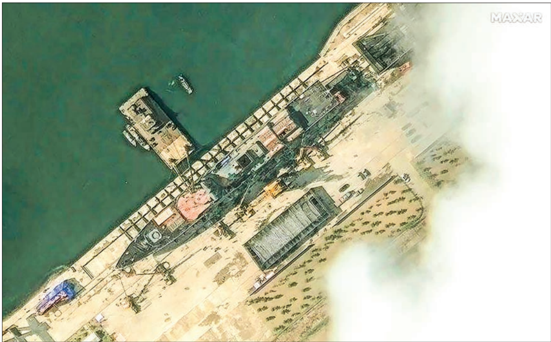
This handout satellite image from Maxar Technologies shows a general view of a new North Korean warship at a harbour ahead of its launch.

A “serious accident” occurred when the Democratic People’s Republic of Korea (DPRK) launched a newly-built 5,000-tonnage destroyer on Wednesday, the official Korean Central News Agency (KCNA) reported Thursday. During the launching ceremony at the Chongjin Shipyard, the launch slide of the stern has departed first and stranded as the flatcar failed to move in parallel, and some sections of the warship’s bottom crushed to destroy the balance of the warship and the bow could not leave the shipway, said the report, attributing the accident to “the inexperienced command and operational carelessness”. Kim Jong Un, general sec-