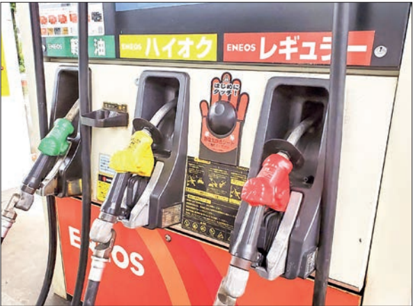
Japanese government officials announce the launch of a revamped gasoline subsidy programme to support consumers.

THE Japanese government started a new gasoline subsidy programme on Thursday to reduce fuel prices and cope with the rise in household living costs, local media reported. The revamped scheme aims to cut the prices of gasoline by 10 yen (about US$0.07) per litre by mid-June, Kyodo News reported. Under the previous fuel subsidy policy introduced in January 2022, the government had