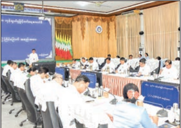
Government-Private Trade Promotion Council holds meeting