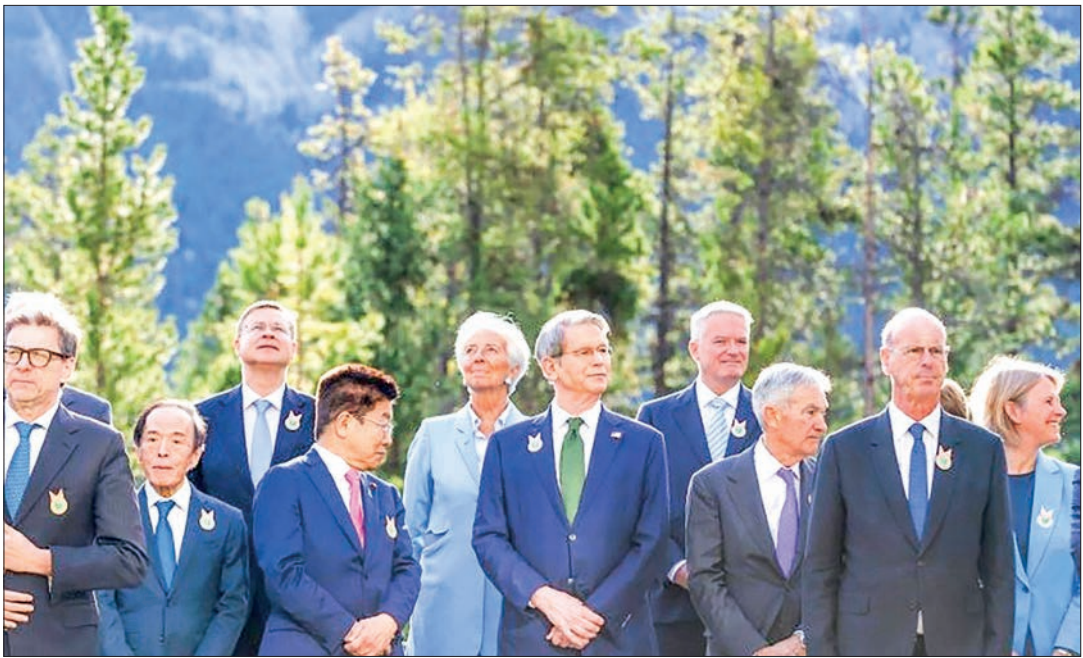
The gathering of G7 finance ministers and central bank governors in Canada could find less agreement this year amid economic worries stemming from US President Donald Trump's tariffs.