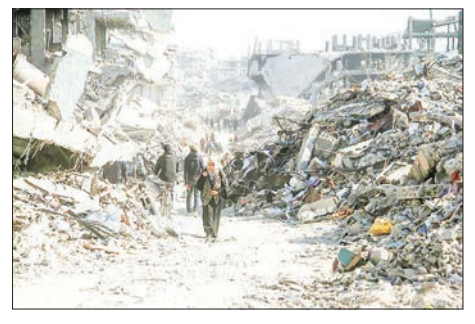
Palestinians are seen on a street with destroyed buildings in Jabalia refugee camp in the northern Gaza Strip, on 29 January

Trump has previously floated similar proposals, which both Egypt and Jordan have explicitly rejected, reaffirming their opposition to any forced displacement of Palestinians. — Xinhua