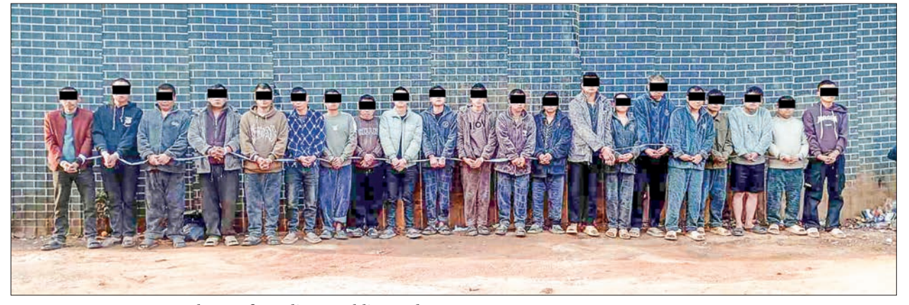
Arrestees are seen on 9 February for online gambling and scams.

IT is found that most of the foreigners illegally entering Myanmar via some neighbouring countries are the ones to work for their own self-interest in the country.