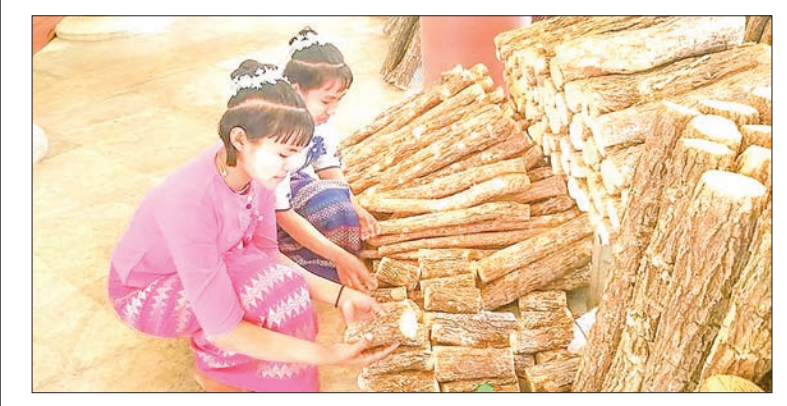
Two young Myanmar women with radiant beauty at a traditional Thanaka shop.

Although Myanmar has numerous intangible cultural heritage elements, only Thingyan (the Water Festival) has been officially recognized by UNES-CO so far. Thanaka, which has been used in Myanmar for over a thousand years as part of its cultural traditions, remains a significant national heritage. Given its longstanding cultural value and alignment with UNESCO's five criteria for intangible cultural heritage recognition, efforts to submit the nomination began in January 2020. — ASH/KNN