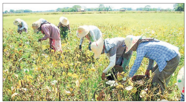
This photo shows farm workers harvesting black grams.

In previous years, black gram prices were good, but