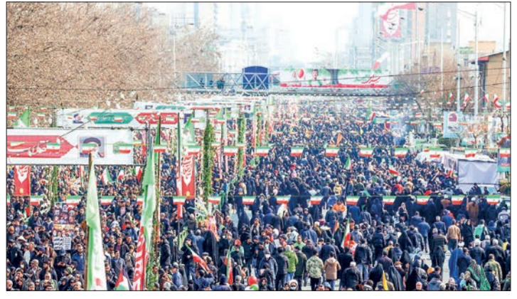
Iranians attend a celebratory gathering in Tehran to mark the 46^{\rm th} anniversary of the Islamic Revolution on 10 February 2025.

Chanting anti-American and anti-Israeli slogans, crowds formed Monday in the streets of Shiraz and Bandar Abbas in the south, Rasht in the north, Kermanshah and Sanandaj in the west, and the holy city of Mashhad in the east, according to images broadcast on television.