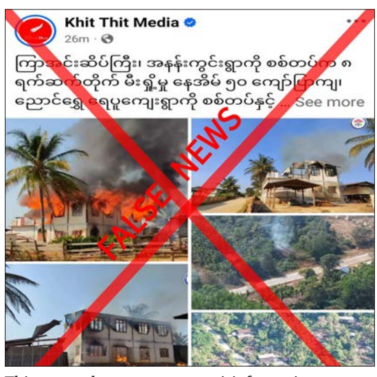
This screenshot perpetuates misinformation.

Subversive media outlets intend to circulate false claims to mislead the public about security forces carrying out security duties. — MNA/KTZH