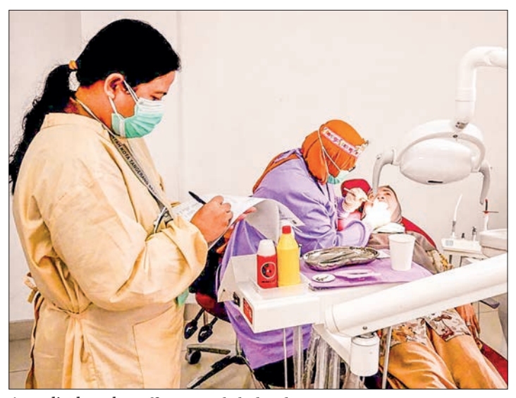
A medical worker offers an ophthalmological checkup to a woman during the Free Health Check (CKG) programme at Ciater Community Health Centre in South Tangerang, Banten Province, Indonesia, 10 February 2025.

INDONESIA launched the Free Health Check (CKG) programme on Monday as a national initiative to improve public health quality and reduce preventable diseases.