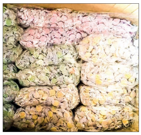
This photo depicts tamarind flakes produced in Magway.

In addition to tamarind flake, other fruit flavours such as strawberry flake, orange flake, lemon flake, pineapple flake and colourful medicinal tamarind toffee are also made in Magway. — Thit Taw/7S