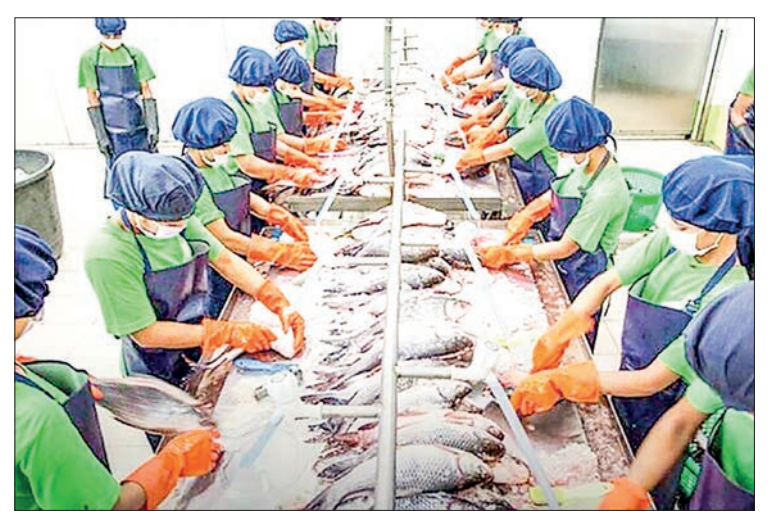
Female workers diligently process the export fishery products.

Individuals can contact the helpdesk section of the Customs Department via 01 379429 if they encounter any difficulties. — NN/KK