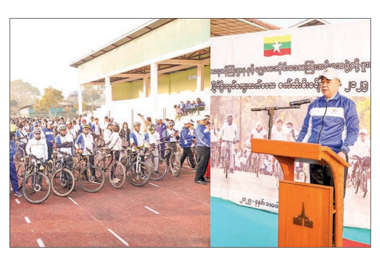
The PyinOoLwin Rural Cycling Tour 2025 in action yesterday, attended by Deputy Minister U Phyo Zaw Soe.

The deputy minister also visited the Mandalay branch office of the Department of Hotels and Tourism, where he met with staff, listened to their concerns, and addressed their needs. — ASH/MKKS