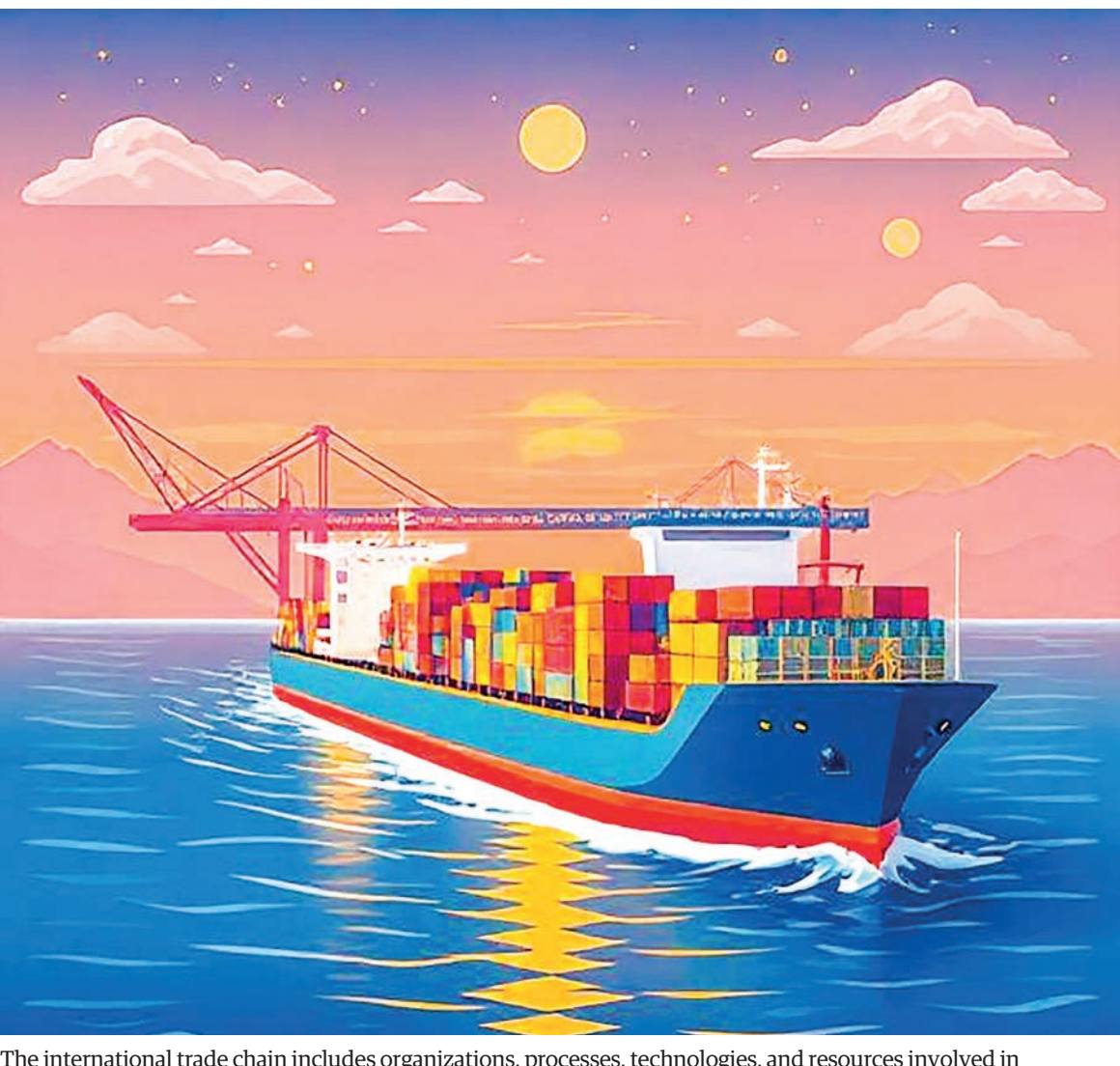
The international trade chain includes organizations, processes, technologies, and resources involved in transferring goods or services from sellers to consumers. ILLUSTRATION: CONCEPT ART

Therefore, it is essential for all Myanmar citizens to protect and maintain educational institutions. By investing in education, the nation will produce educated citizens who can contribute to the nation's growth and prosperity.