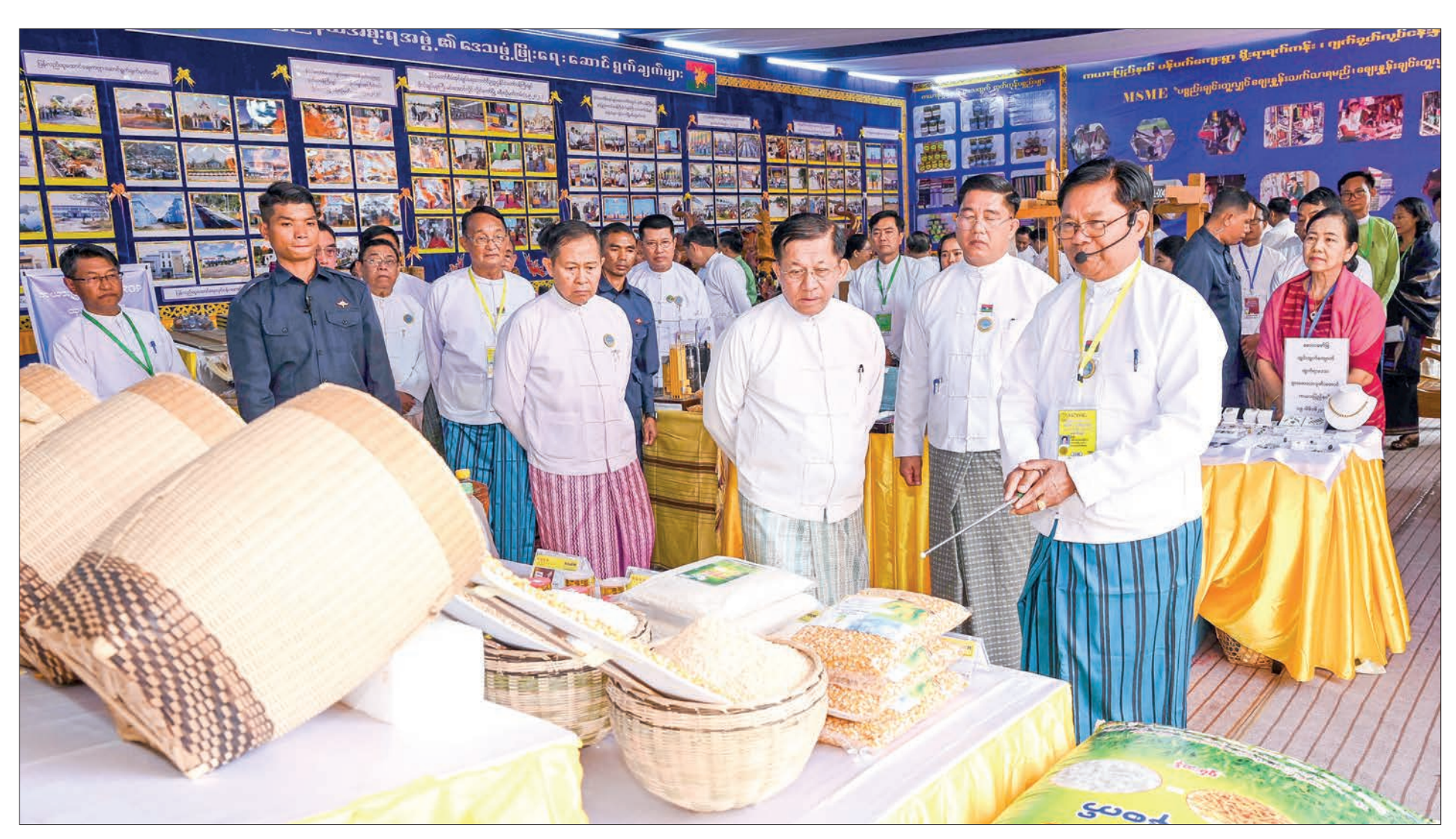
State Administration Council Chairman Prime Minister Senior General Min Aung Hlaing views the MSME products displayed at the booths yesterday.

Union-level MSME Product Exhibition and Competition aim to produce value-added products at home as import-substitute goods and penetrate foreign markets.