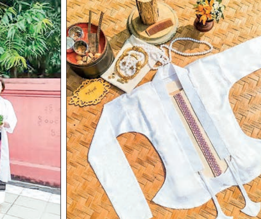
Photos showcase\ traditional\ Myanmar\ costumes, once\ lost\ in\ obscurity, and\ the\ revival\ of\ these\ timeless\ at tires.

ers don't wear them much, so they are lost in obscurity. That's why we're rediscovering them from old photos. It will be expen-