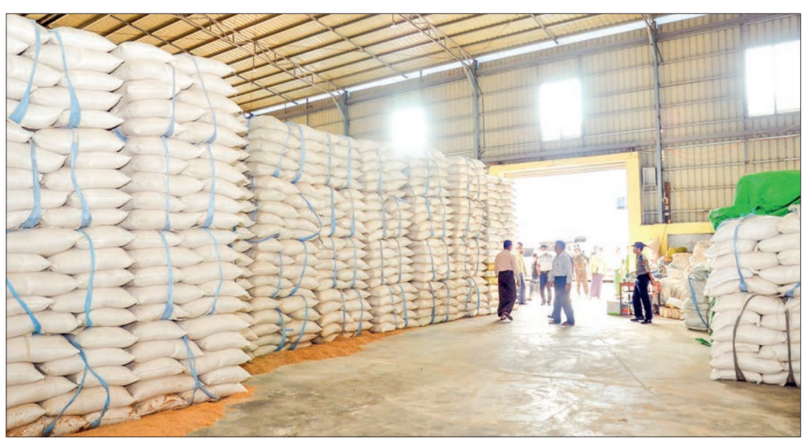
Export rice bags are organized at the warehouse.

working together with the Union of Myanmar Federation of Chambers of Commerce and Industry, Myanmar Rice Federation, Myanmar Pulses, Beans, Maize and Sesame Seeds Merchants Association, Myanmar Garment Manufacturers Association, Myanmar Industries Association, Myanmar Rubber Planters and Producers Association, Myanmar Fisheries Products Proces-