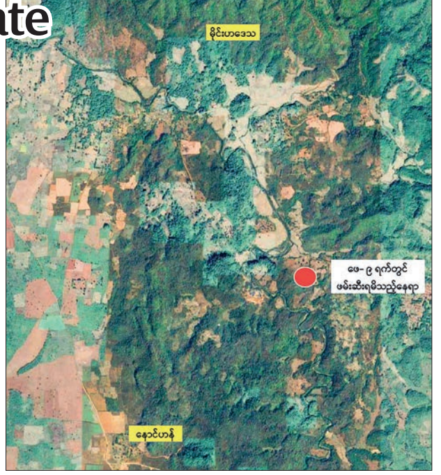
Map of the arrest location: Online gamblers and scammers captured in Mongha region, Mongyai Township.

Systematic prosecution will be made against the offenders, and foreigners will be transferred to their