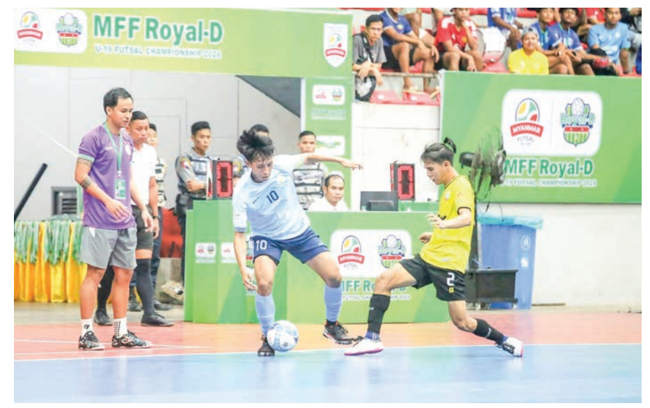
A match of MFF U-19 Futsal League in 2024.

of 12 clubs, according to the Myanmar Football Federation.