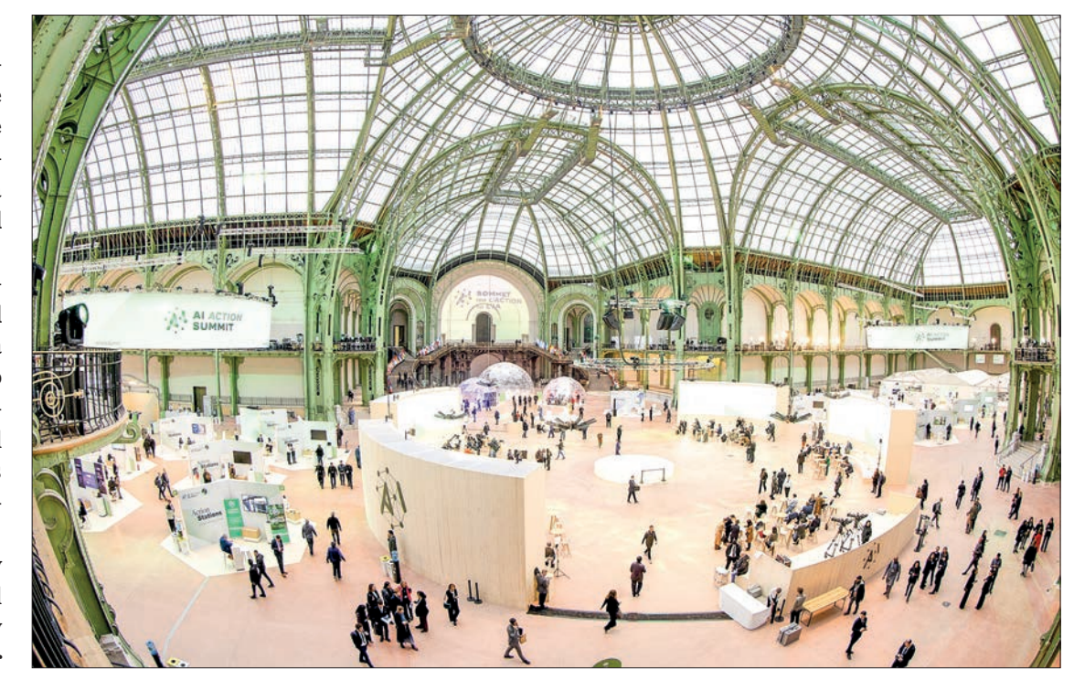
People take part in the Artificial Intelligence (AI) Action Summit, at the Grand Palais, in Paris, on 10 February 2025.

ture, "we're not too much worried (about) a massive job loss" despite widespread fears Houngbo added