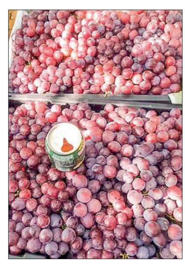
This image showcases grapes from Yamethin.

Last year, the rain-fed grapes from Yamethin harvested during the rainy season were sold in Yangon, Mawlamyine and Mandalay, with Yangon making the most orders, however, its price was not as good as the summer