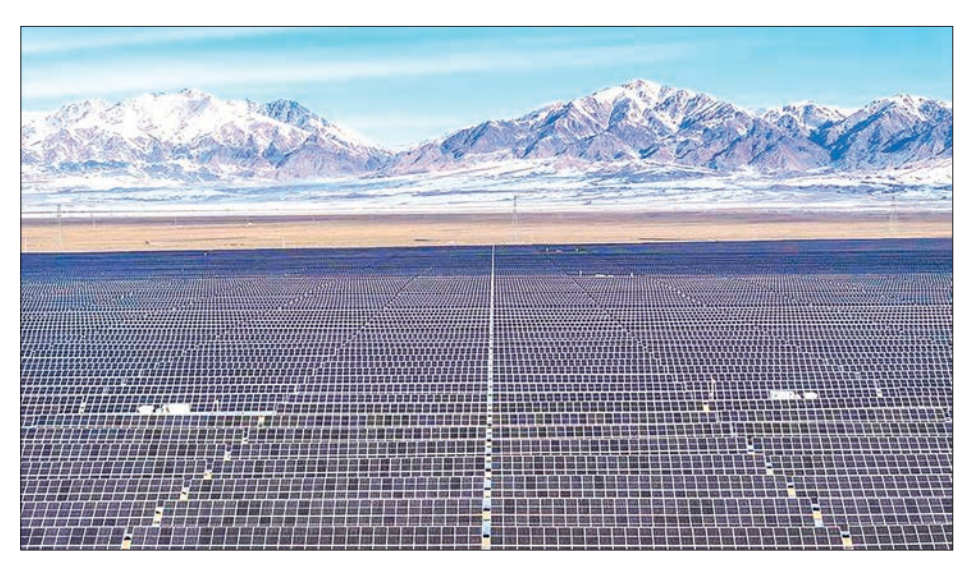
An aerial drone photo taken on 6 January 2025 shows a partial view of the Shichengzi photovoltaic power station in Hami City, northwest China's Xinjiang Uygur Autonomous Region.

Despite this rapid expansion, the existing fixed-pricing mechanism