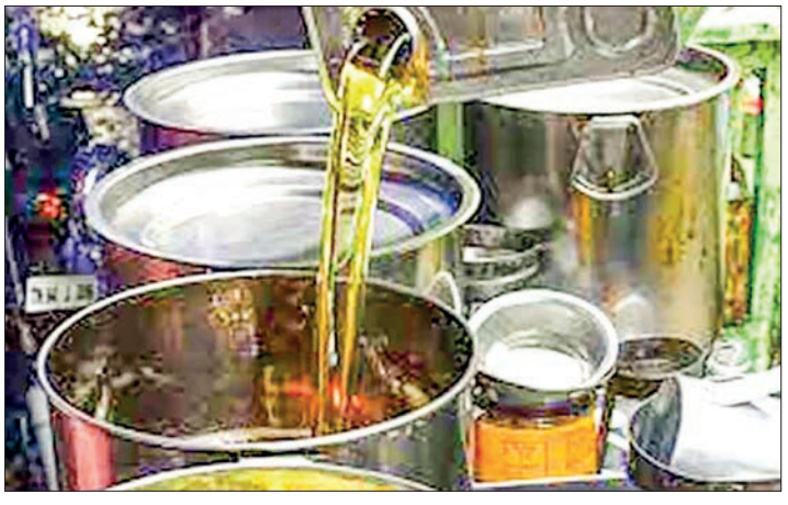
A vendor is arranging edible oil for sale at the market.

Despite the reference price, the market price is way too high. The committee notified that any person who is involved in price gouging and